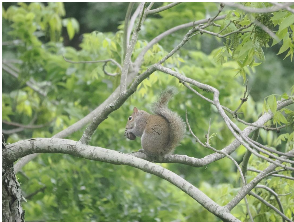
Eastern Gray Squirrel