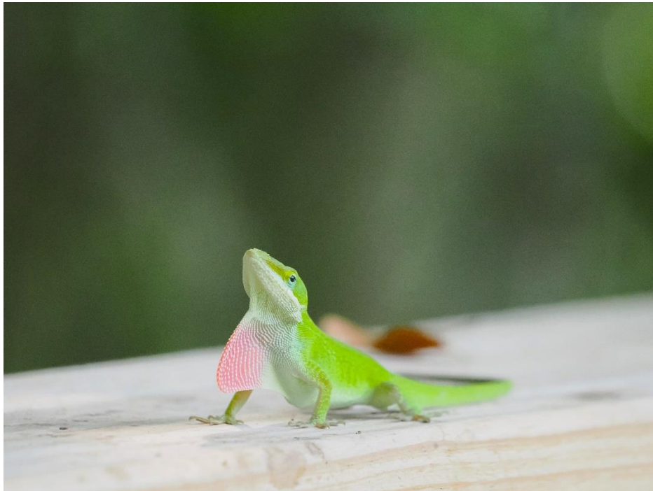
Green Anole

We visited Anahuac a few times during our time at High Island. I was hoping there would be more mammal activity here but alas no. While we saw many alligators, which were the biggest alligators I've ever seen, and some cute turtles, there was next to nothing mammalian. We did notice some sort of small animal, possibly a rodent, rustling around in thick vegetation but it was impossible to see. We did see this very cool lizard though, apparently called a Green Anole.