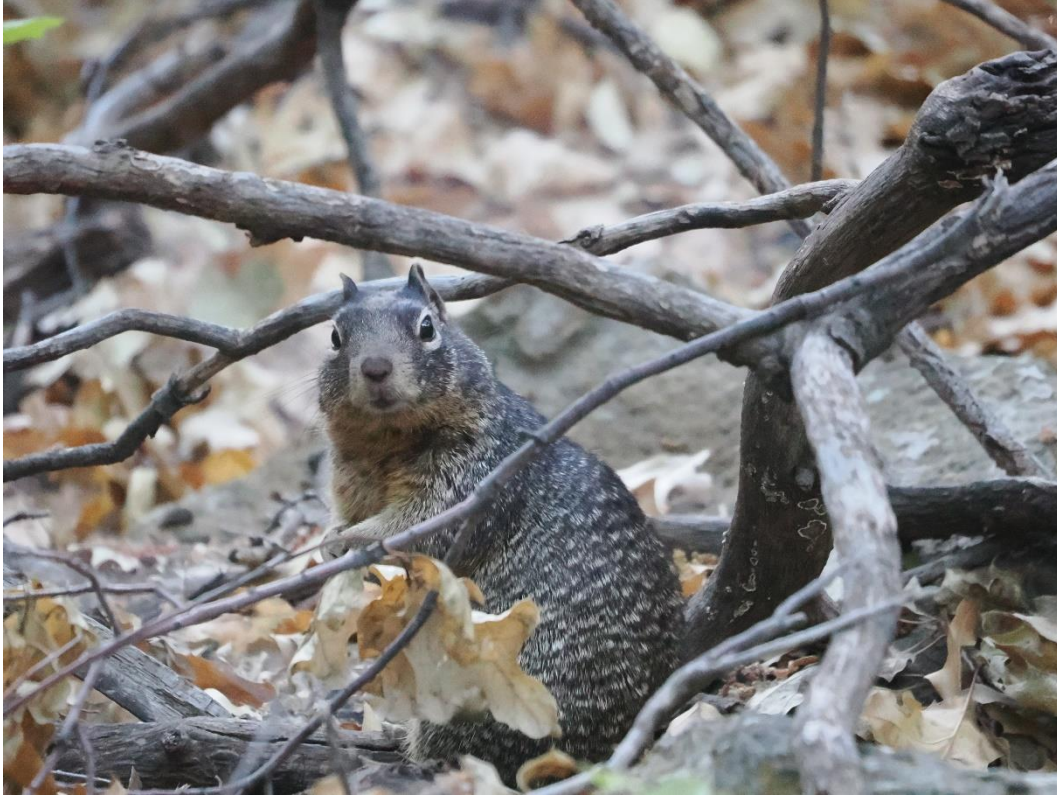
Rock Squirrel

Once we were done with that hike, I needed plenty of rest and relaxation, and so they headed out to bird some more while I enjoyed our air-conditioned cabin. While they were out, they made a sneaky crossing into Mexico (aka stepping over a stream on the border) and saw some Collared Peccaries . We also saw hundreds of bats flying around throughout our time in the park, but we couldn't ID them. My dad saw a Spotted Ground Squirrel dash across the road on one of our drives which I managed to miss. Luckily, as we drove along the highway north of the park on our journey to the San Antonio Airport, we saw a Spotted Ground Squirrel sprint across the road, and I was happy to add it to my life list. We also saw several Lesser Nighthawks while in the park along with a Common-Poor-Will, which I mention because they are both cool nightbirds.