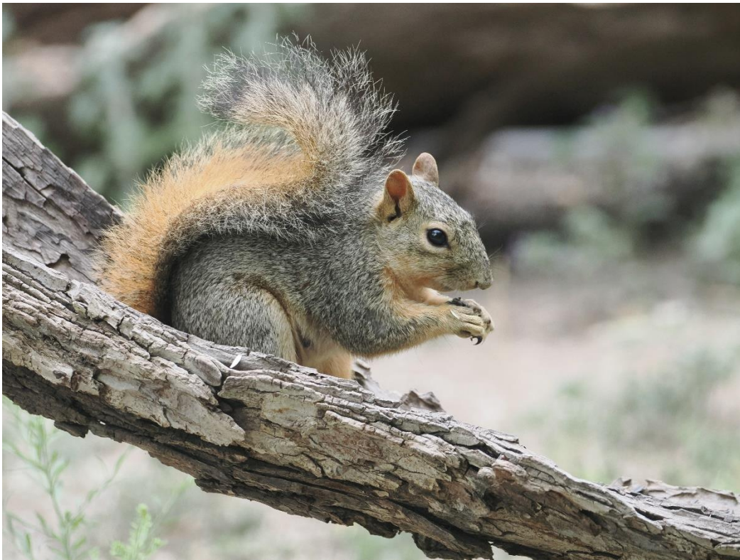
Eastern Fox Squirrel

Once again, another primarily birdy location. We were told by the rangers that armadillos are fairly common in the park which got me rather excited. The weather was overcast on this day, so I was hoping that the armadillos might be out and about later than normal. We didn't see any armadillos, but I got a rather entertaining look at a few Eastern Fox Squirrels at some bird feeders. They were very active, and one was entertaining himself by chasing the other squirrels in a one-sided game of tag. So even though we saw no armadillos, the squirrels were so much fun I was still pleased.