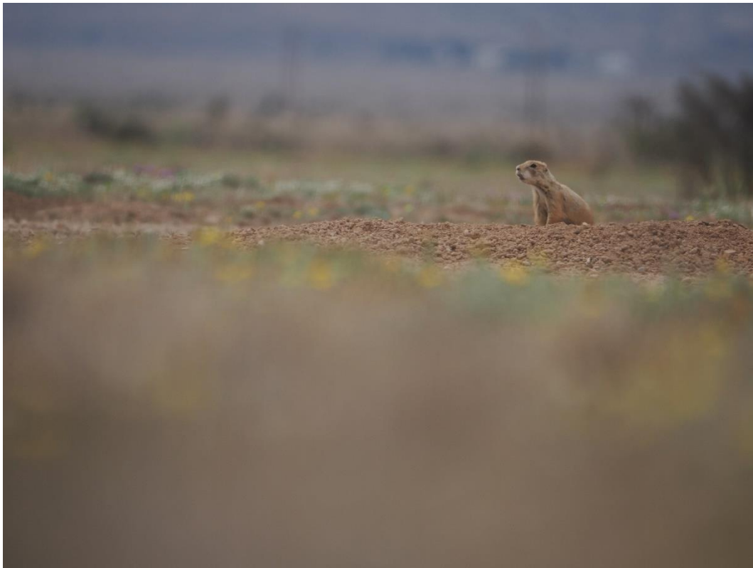
Black-tailed Prairie Dog

While researching birding hotspots, my dad discovered a Black-tailed Prairie Dog town near the town of Marathon. This was on the way to Big Bend and was also a good location for Burrowing Owl, one of the funniest owl species in existence. Seriously, look up a picture of a Burrowing Owl and you'll just laugh and laugh at how ridiculous they are. Anyway, we stopped and started scanning for the Prairie Dogs . We saw some Pronghorn in the distance, which were a lifer for me. We ended up seeing a ton of Black-tailed Prairie Dogs and with how many burrows there were, we figured this town must be humungous. I absolutely loved these little critters, and they were a highlight of the trip.