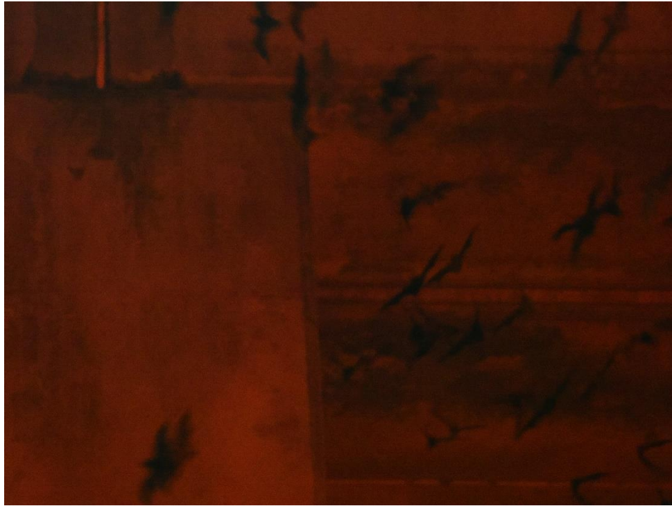
Mexican Free-tailed Bats

trip. We went out on a boat to watch the bats which included a little tour of the river and some education about the history of Austin, which was actually quite interesting. The bats were the highlight, and we attempted to get photos, although this was an extremely difficult task.