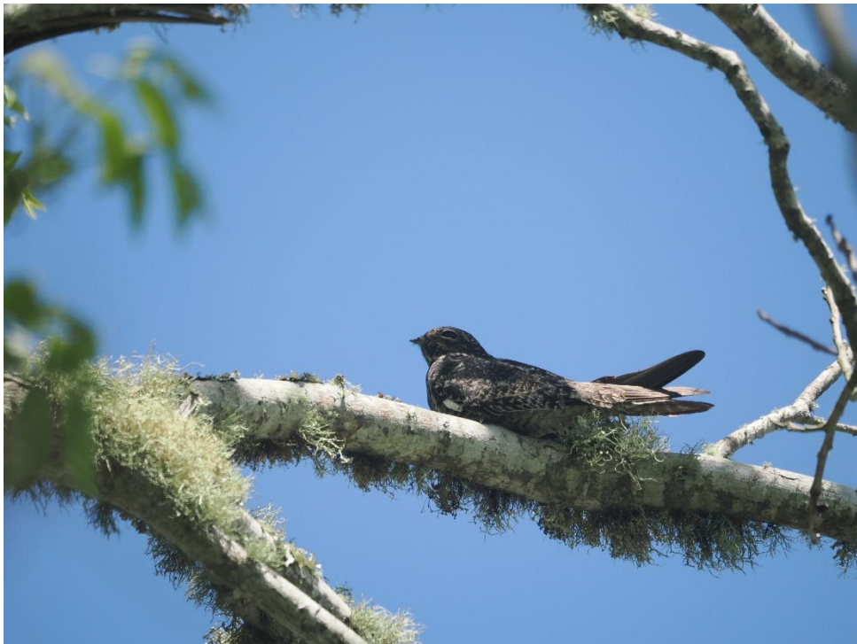
Common Nighthawk