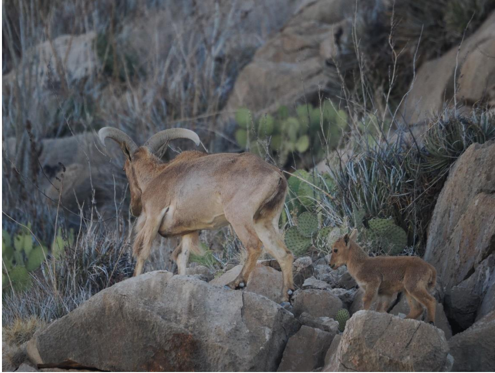
Barbary Sheep