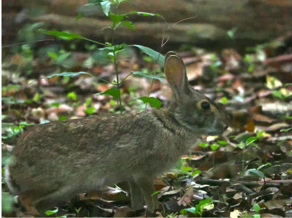
Swamp Rabbit