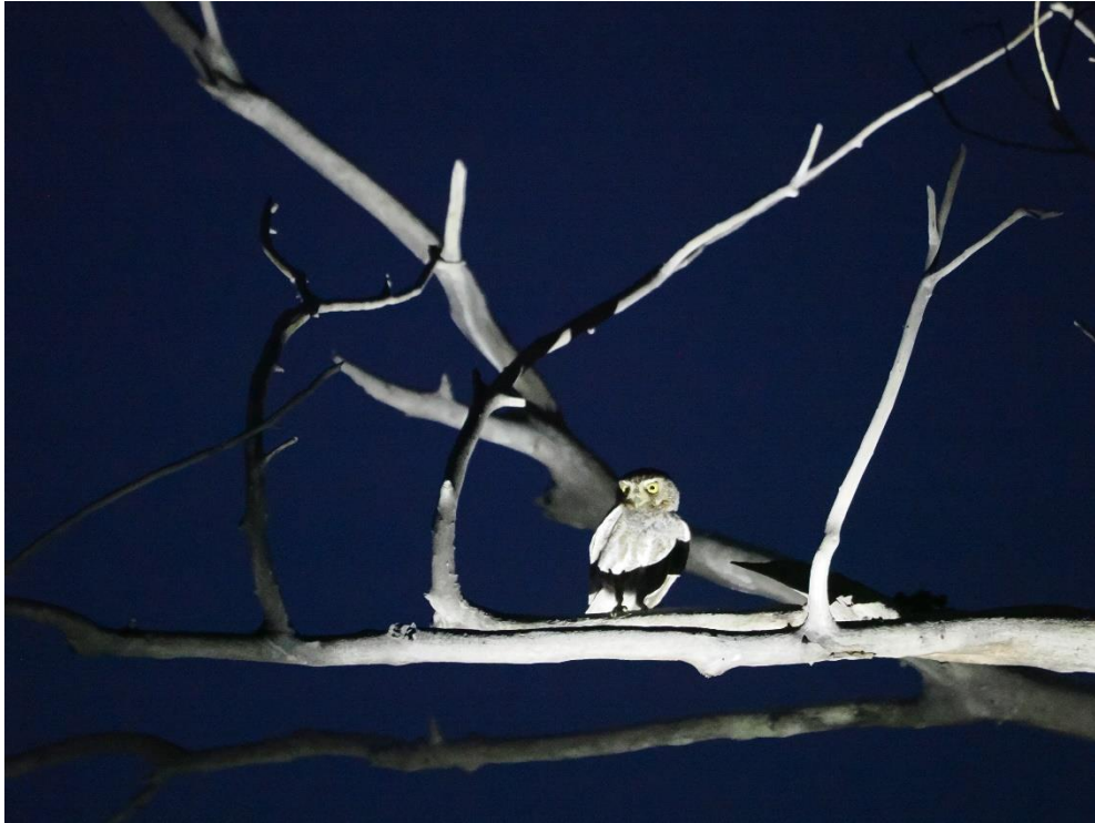
Elf Owl, courtesy of Paul Linton