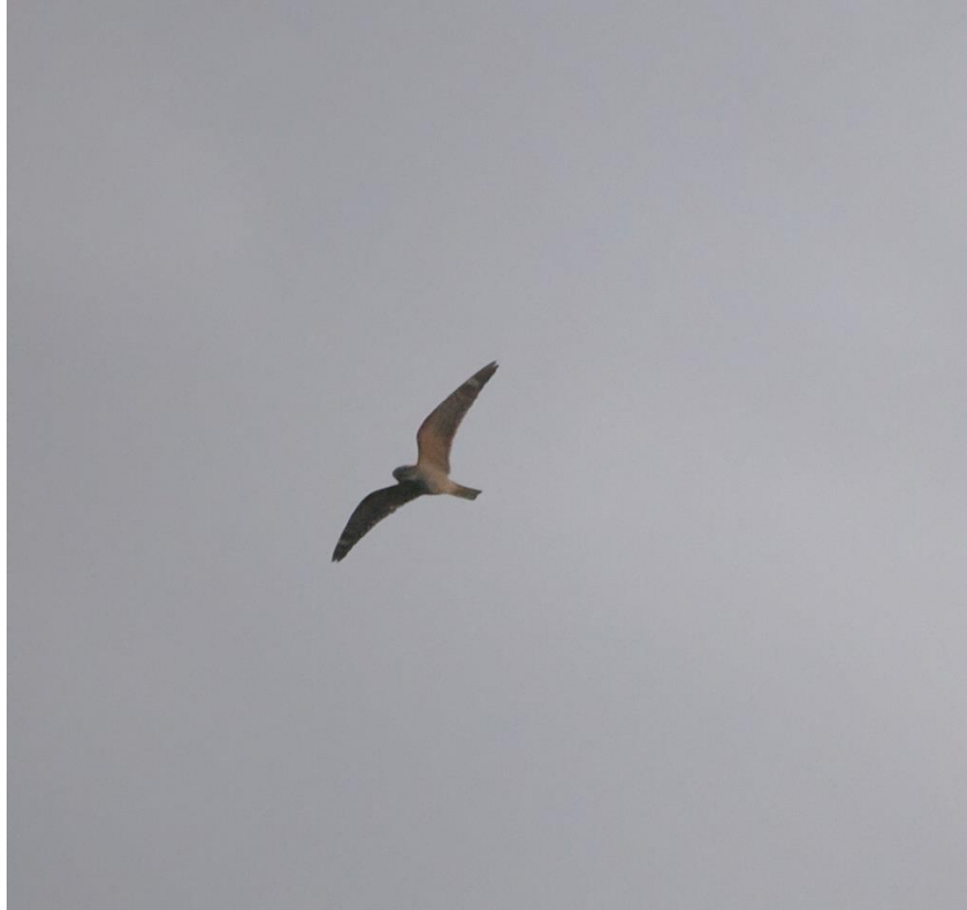
Lesser Nighthawk, courtesy of Paul Linton