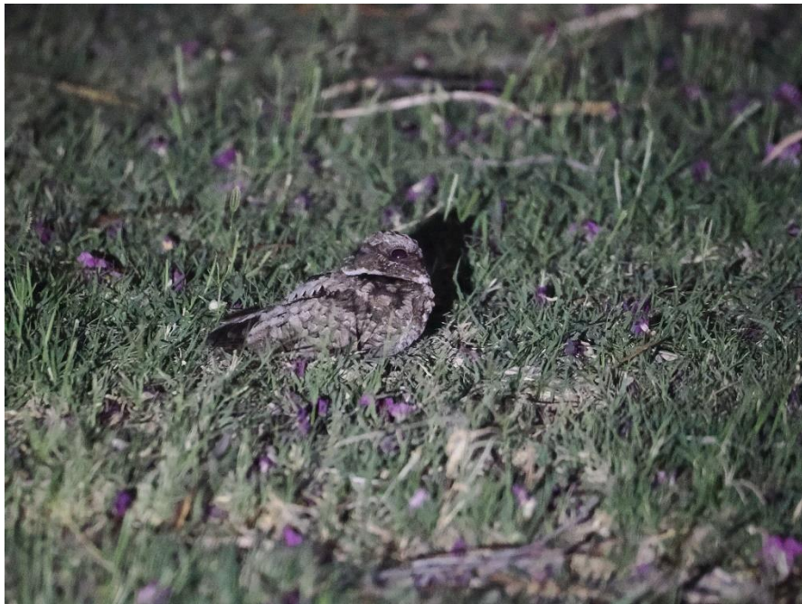
Common-Poor-Will, courtesy of Paul Linton