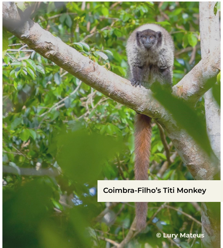
Coimbra-Filho's Titi Monkey

Travel overland to João Pessoa and spend the afternoon at the Engenho Gargaú Reserve, a critical habitat for one of the most endangered neotropical primates, the Blond Capuchin Monkey . Search the fragmented forests here for this illusive species and learn about the challenges of preserving this critical habitat. Dinner and overnight at Hotel Manaira.