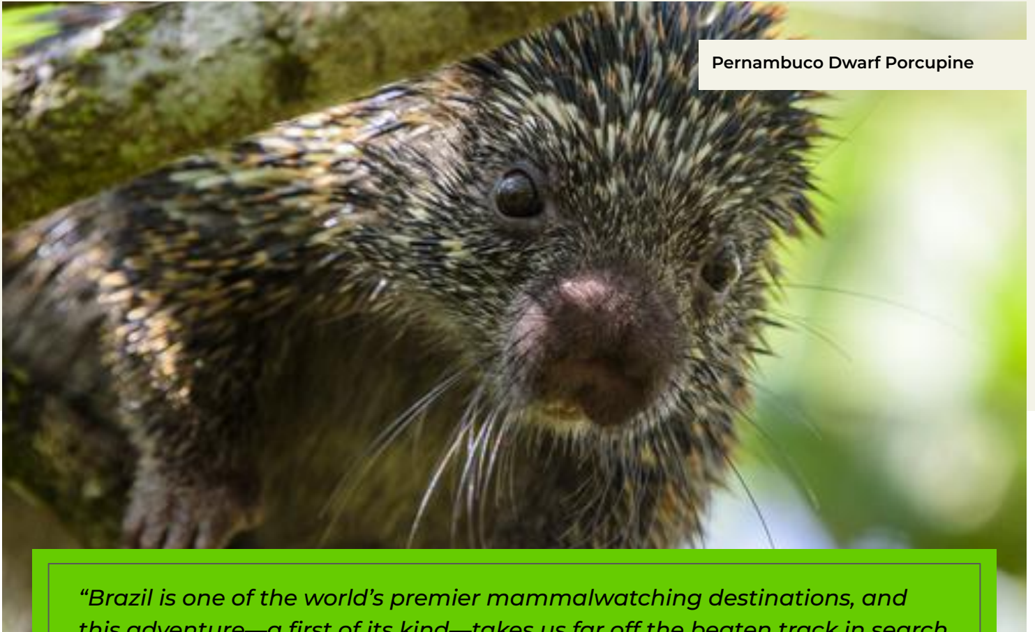
Pernambuco Dwarf Porcupine

"Brazil is one of the world's premier mammalwatching destinations, and this adventure—a first of its kind—takes us far off the beaten track in search of fascinating and little-known species."