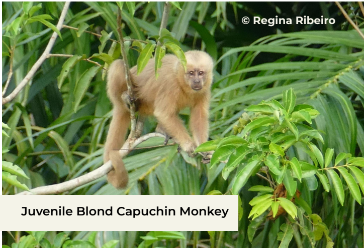
Juvenile Blond Capuchin Monkey

After breakfast, drive 13 miles to search for the critically endangered Caatinga Titi Monkey , the only primate endemic to the Caatinga biome, found only in Bahia and Sergipe. After lunch, continue to the dry savannah to join the Brazilian Three-banded Armadillo project team and learn about the species, known for its unique defence of curling into a ball. Other potential sightings include the Rocky Cavy. Return to Chapada Diamantina in the late afternoon for dinner and overnight.