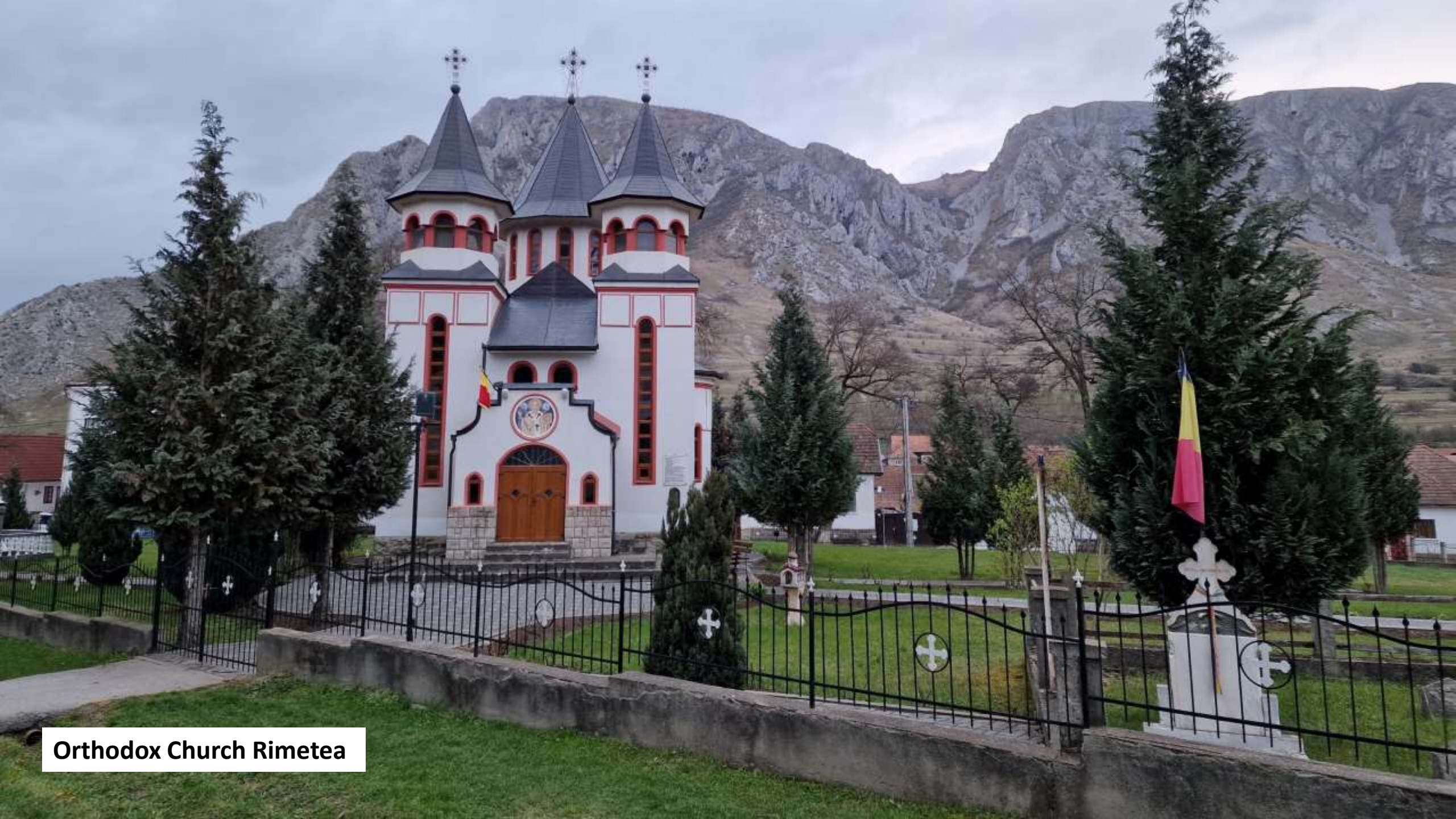
Orthodox Church Rimetea