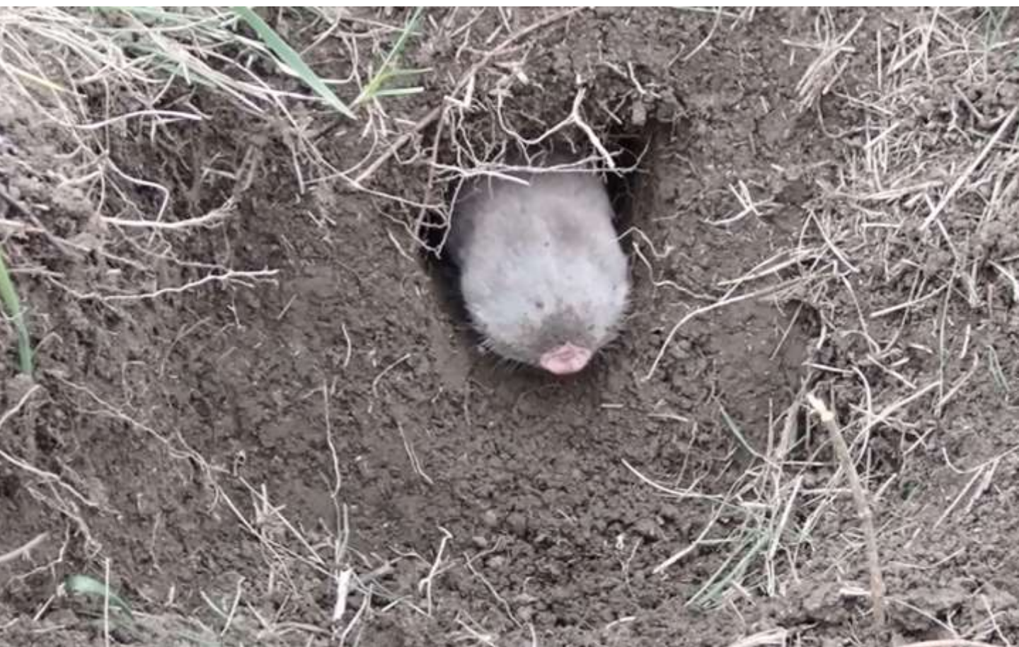
Mehely's blind mole-rat

A very nice sighting and I was very happy with the video as it showed a nice bit of activity before I arrived. The weather was a little better than previous days and I took this to wander round and photograph some of the early flowering plants. Pasque flowers were just starting to flower and yellow Pheasant eye was growing everywhere on the hill. After dinner we did a night drive a badger, plenty of roe deer and a few foxes of note. It was the first night that it was feasible to run the moth trap but it attracted nothing..