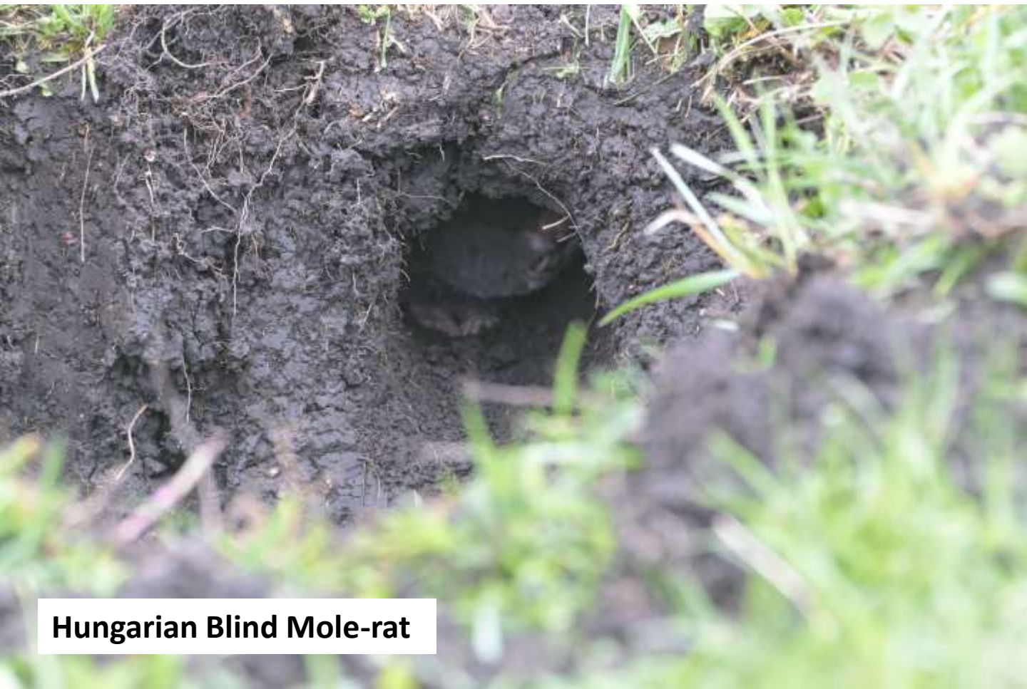
Hungarian Blind Mole-rat

We changed location and headed north of Cluj for the day, arriving at the site a few burrows were opened before the heavens opened and heavy sleet and gale force winds had us retreat to a petrol station for a hot drink. By lunch time it stopped sleeting, but the gale force winds remained, and it remained bitterly cold. We did not get a view of any mole rats. For the last hour or so we moved slightly and opened two new burrows, and a Hungarian blind mole rat was spotted briefly in one of the burrows. Brown hare and stonechat the only sightings of note, we got back late and stayed in..