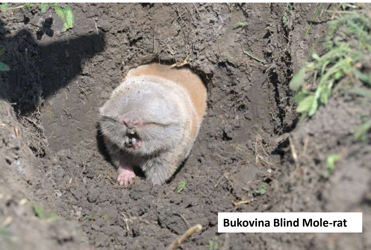
Bukovina Blind Mole-rat

This was an excellent trip to see some very difficult mammals, the Saker tours team did a brilliant job.