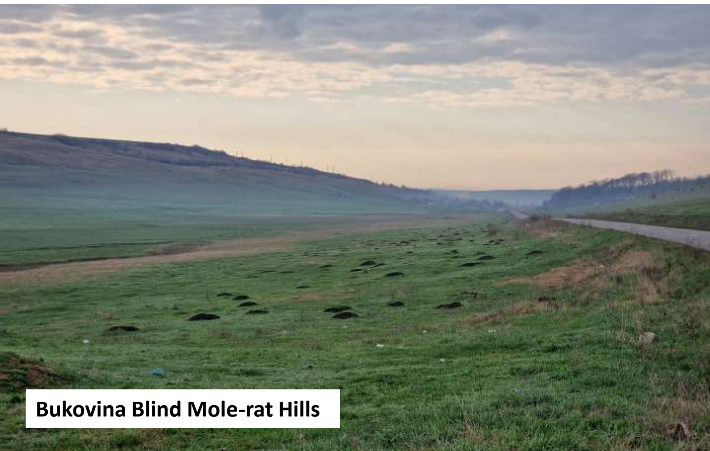
Bukovina Blind Mole-rat Hills

Already securing good views of our first mole rat we headed on the long journey north to our second destination for another species. There were plenty of stork nests already occupied along the route. We got to the hotel in Letcani by mid-afternoon, checked in and then headed off to look for mole rat mounds, but we picked up a puncture by the hotel, after the complex process of removing the spare wheel from under the vehicle we changed the wheel then headed off straight into a massive traffic jam caused by an accident. We gave up and headed back to the hotel for dinner. After dinner we headed out for a short night drive, seeing mostly roe deer and brown hares..