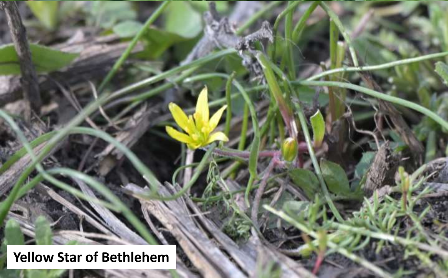
Yellow Star of Bethlehem