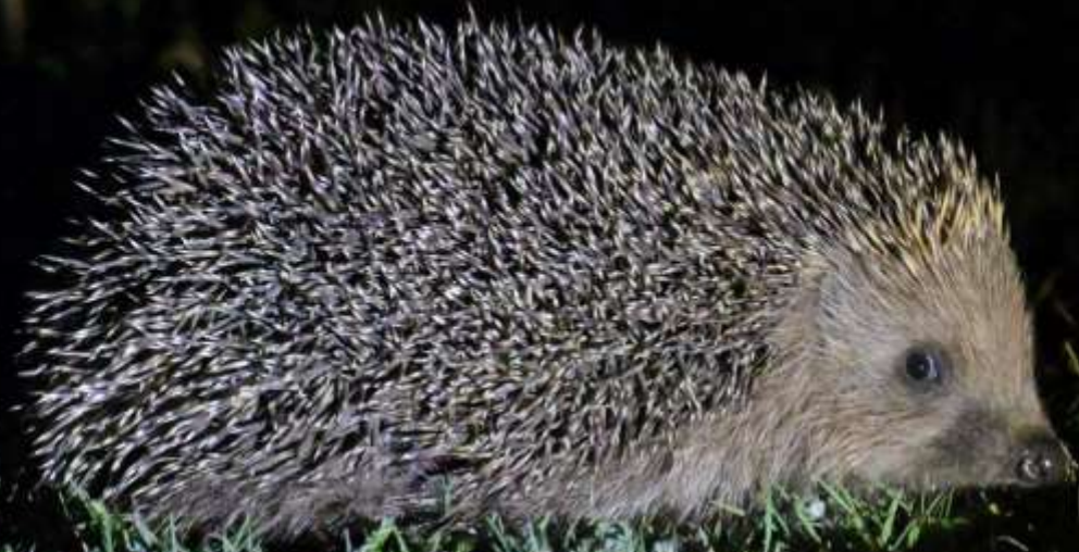
Northern White Bellied Hedgehog