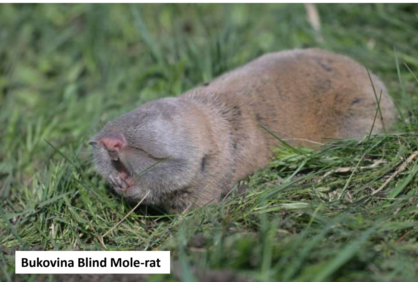
Bukovina Blind Mole-rat