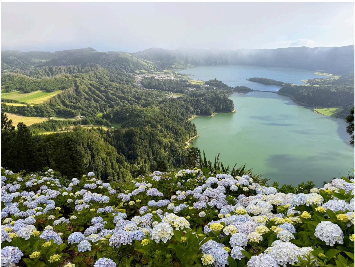
Sao Miguel landscapes