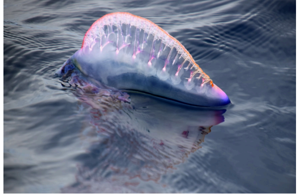
Portuguese Man O' War