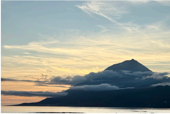
Mt. Pico sunset