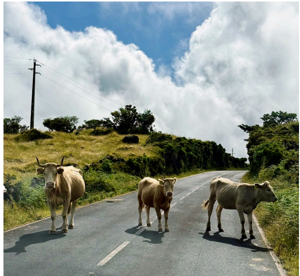
Pico rush hour