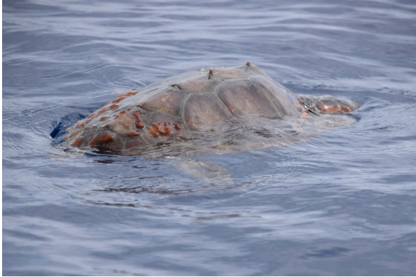
Loggerhead Sea Turtle