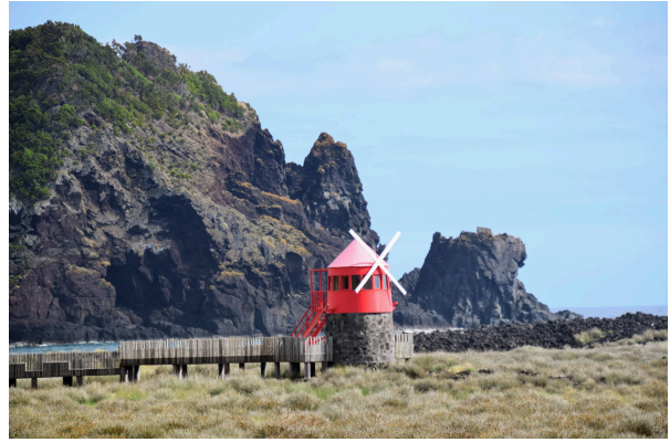
Lajes do Pico windmill