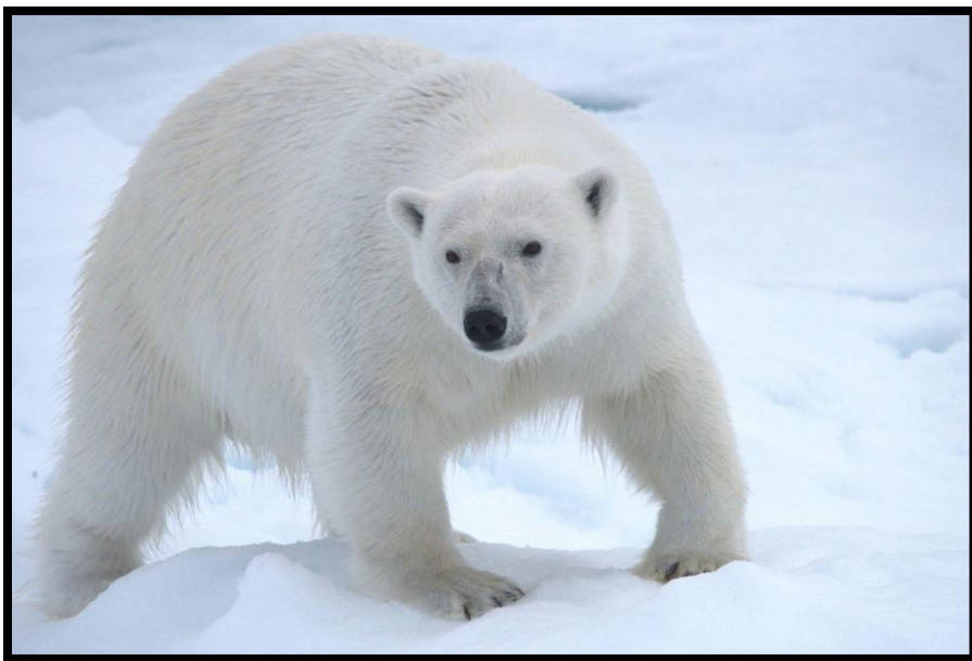
Polar Bear on pack ice

Oceanwide tour: “Around Spitsbergen, In the realm of polar bears and ice”