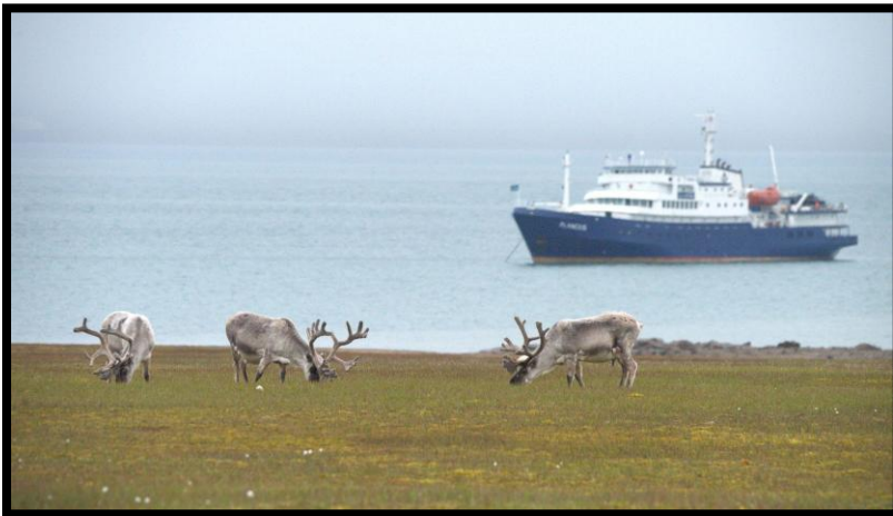
Reindeer with the Plancius in the background