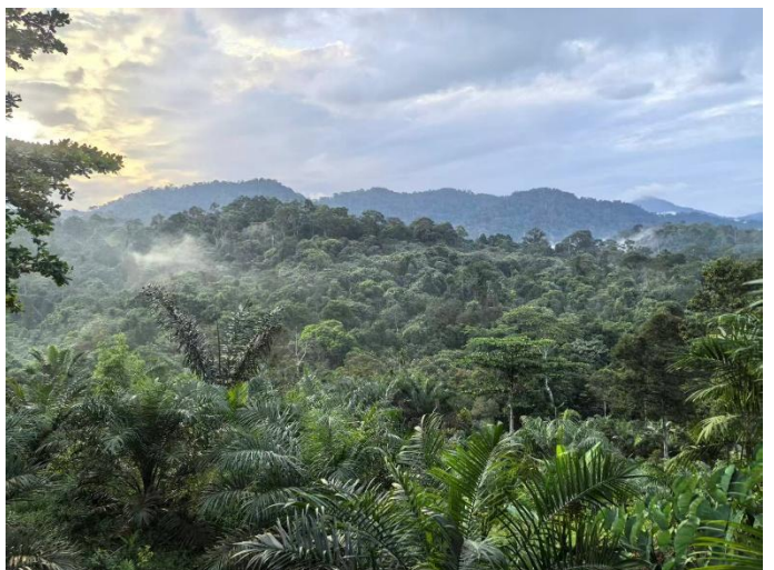
Gunung Leuser National Park