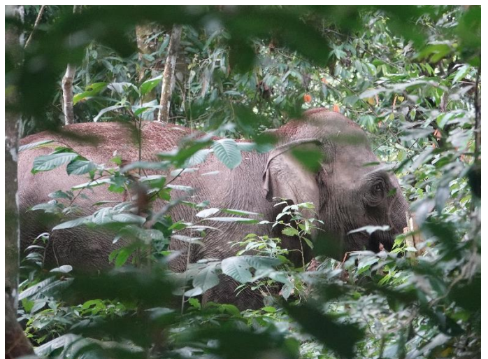
Asian elephant (wild)