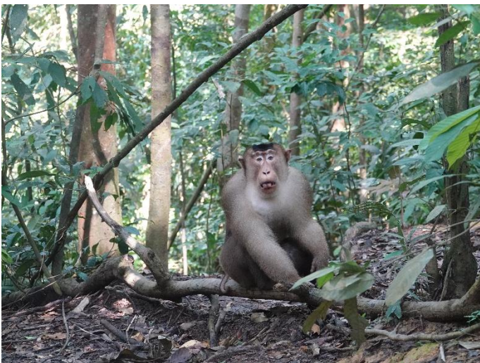
Southern pig-tailed macaque