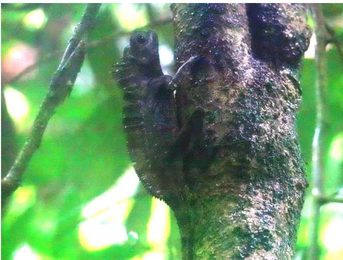
Sumatran forest dragon ( Gonocephalus beyschlagi )