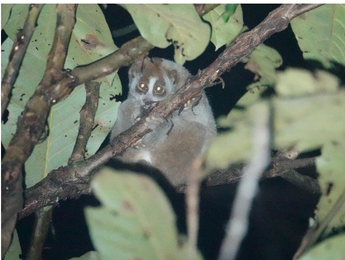
Sumatran slow loris