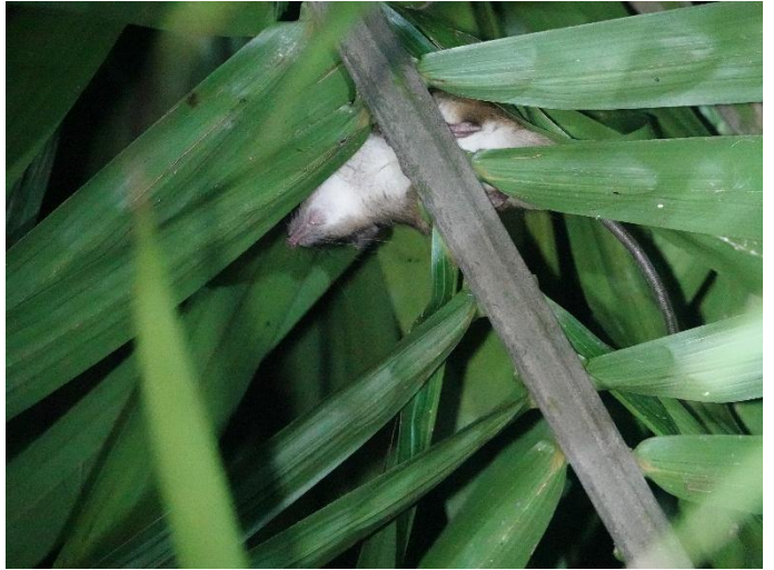
Ricefield rat (unsure)