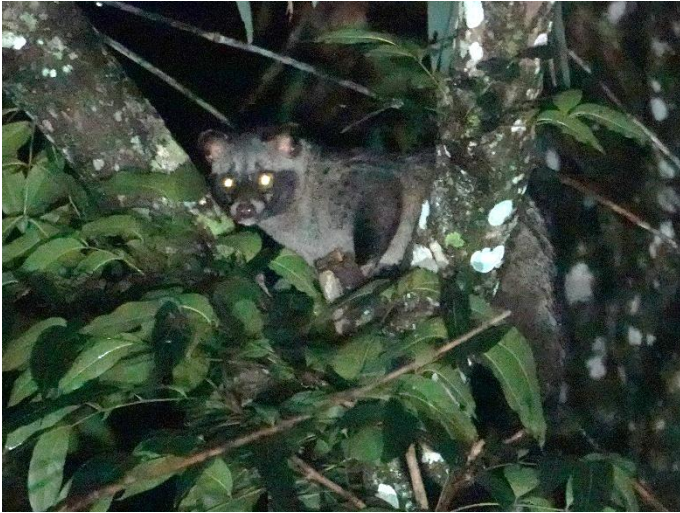
Southern Asian palm civet