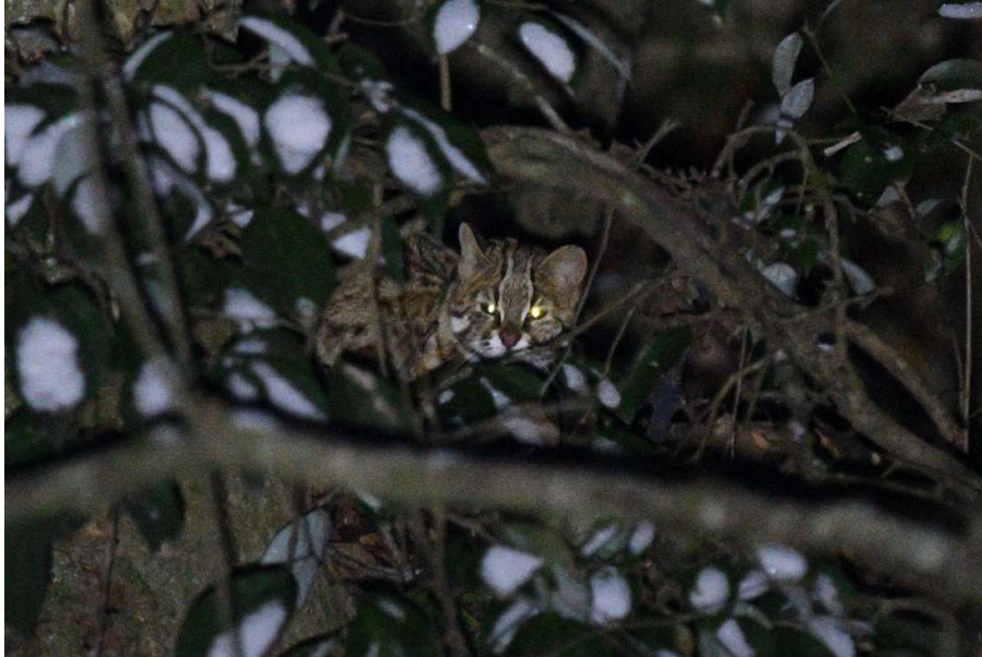
Mainland Leopard Cat

Chinese Goral and a Young Takin(mentioned) were found during the day time. 2 White-tailed Sea Eagles and 1 Mountain Hawk Eagle were seen by my son. In the evening we walked back from Cai Jia Ba to Mao Xiang Ba. There were more than 10 Reeves' s Muntjacs and 2 Wild Boars stayed near Cai Jia Ba. And we were very lucky to see a Mainland Leopard Cat hided in the bush.