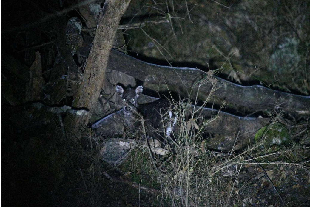
A Tufted Deer

in summer none of them can be found in the lowland.