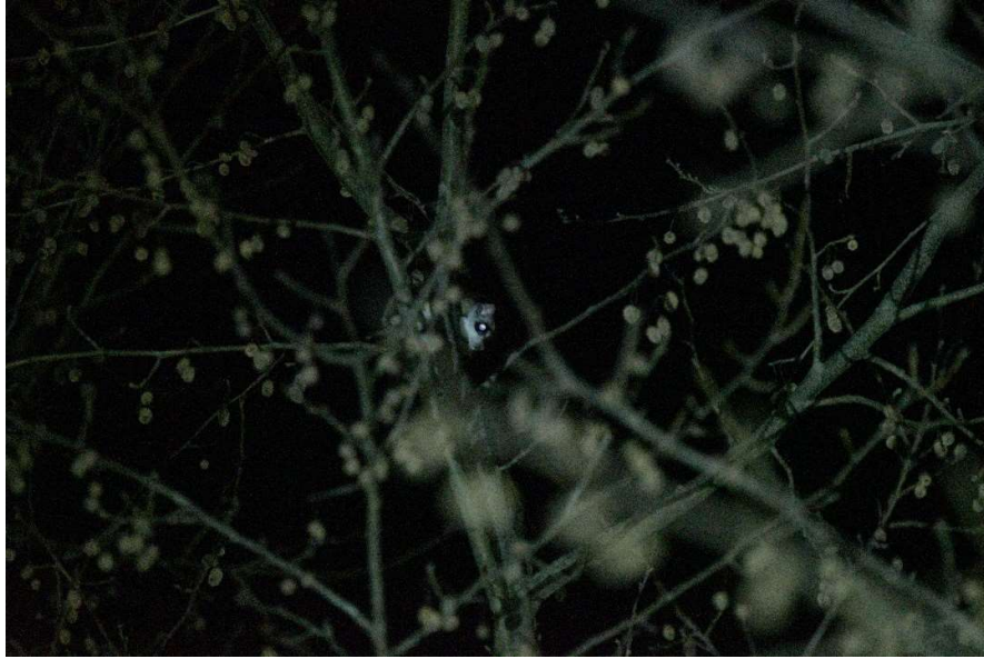
Siberian Flying Squirrel

We found only a Reeves' s Muntjac and a Siberian Flying Squirrel during the night walk.