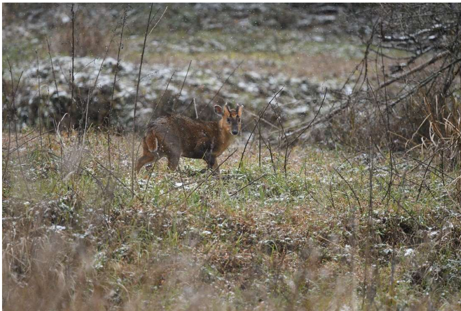
Reeves' s Muntjac in the daytime