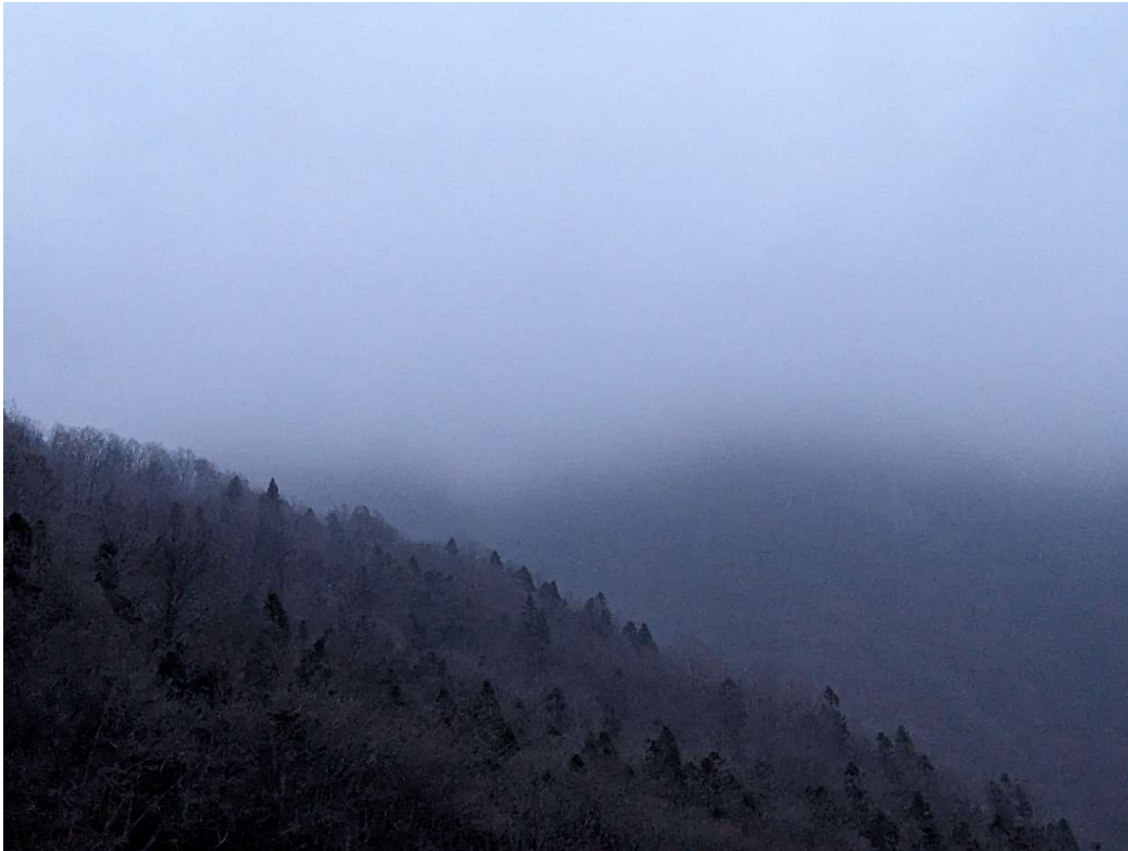
Winter view in Tangjiahe

It was snowing during the whole trip. So some mammals came down to the lowland for food. But the Sichuan Takins were not very active. We just saw a lonely Takin near Bai Xiong Guan ("Bai Xiong" means "white bear" which is the Great Panda' s name by local people). The driver of the park said this Takin was missed from its group and live here for some months.