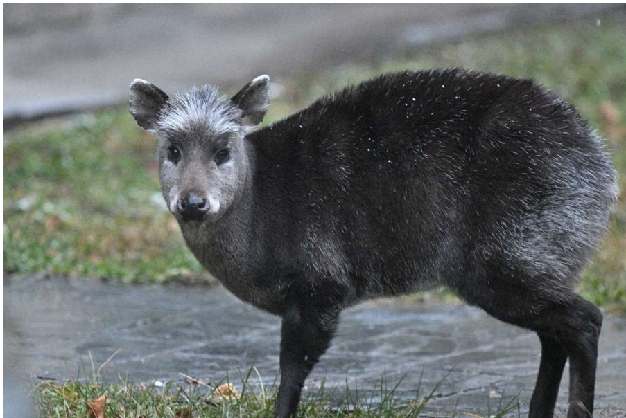
The old Tufted Deer near the hotel

In the evening, an old Tufted Deer came down to the ground near the hotel. It was not afraid of people. The staff of the hotel feeded it with Vegetables.