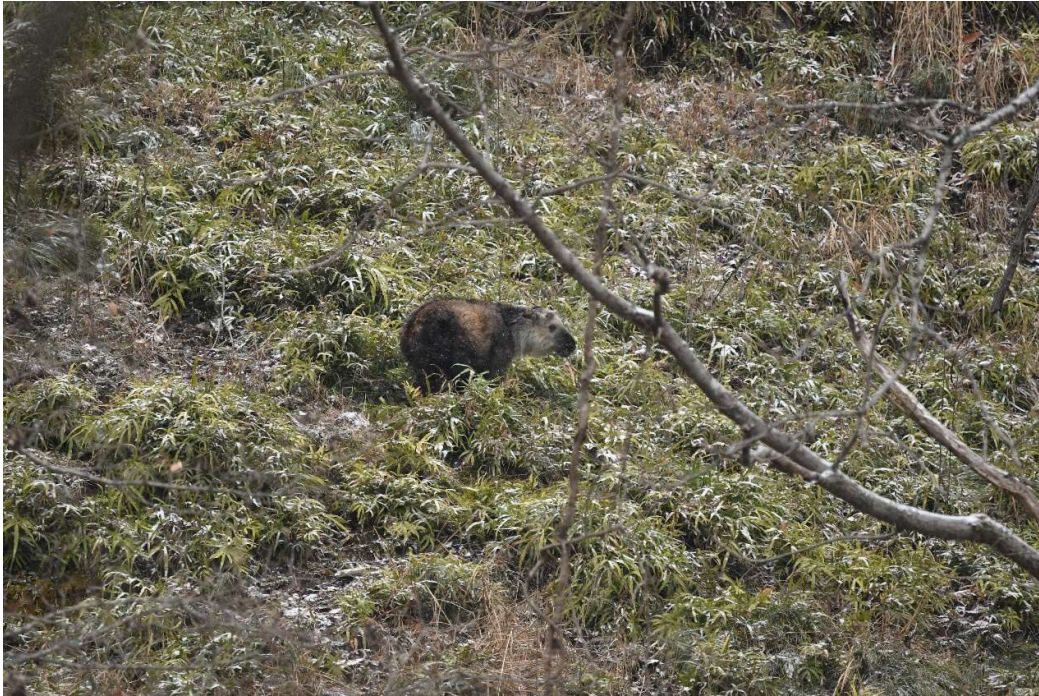
The lonely young Takin

We left Tangjiahe on 3-Jan-2026. It is good for mammals watching in Tangjiahe in winter.