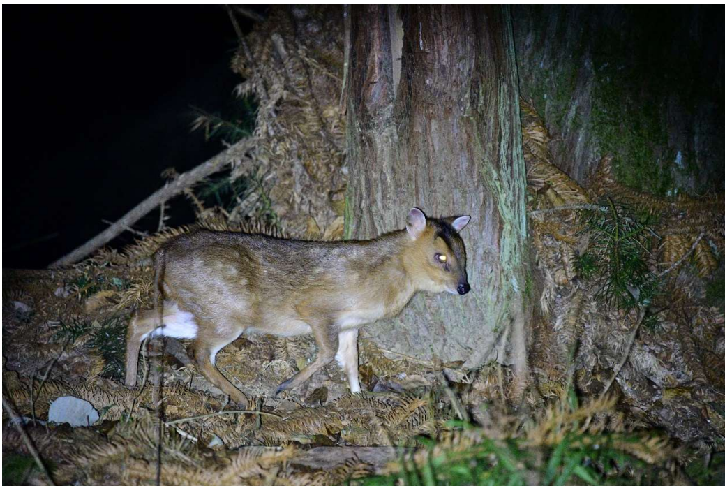
a Reeves' s Muntjac at night

Days(2-Jan-2026) :This day we took the shuttle bus from Mao Xiang Ba (the Sen Yang Mei Shu Hotel) to Cai Jia Ba . Only a Reeves' s Muntjac,a