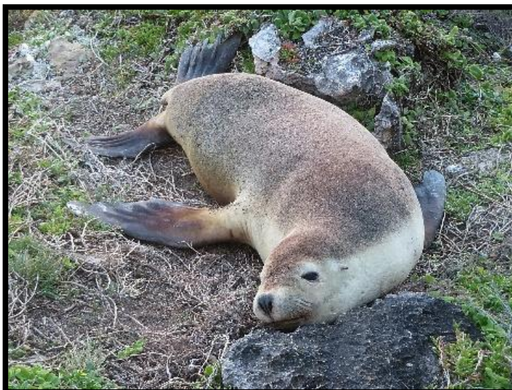
Top: Australian sea lion pup. Middle: humpback whale skeleton (Seal Bay). Bottom: Australian fur seal