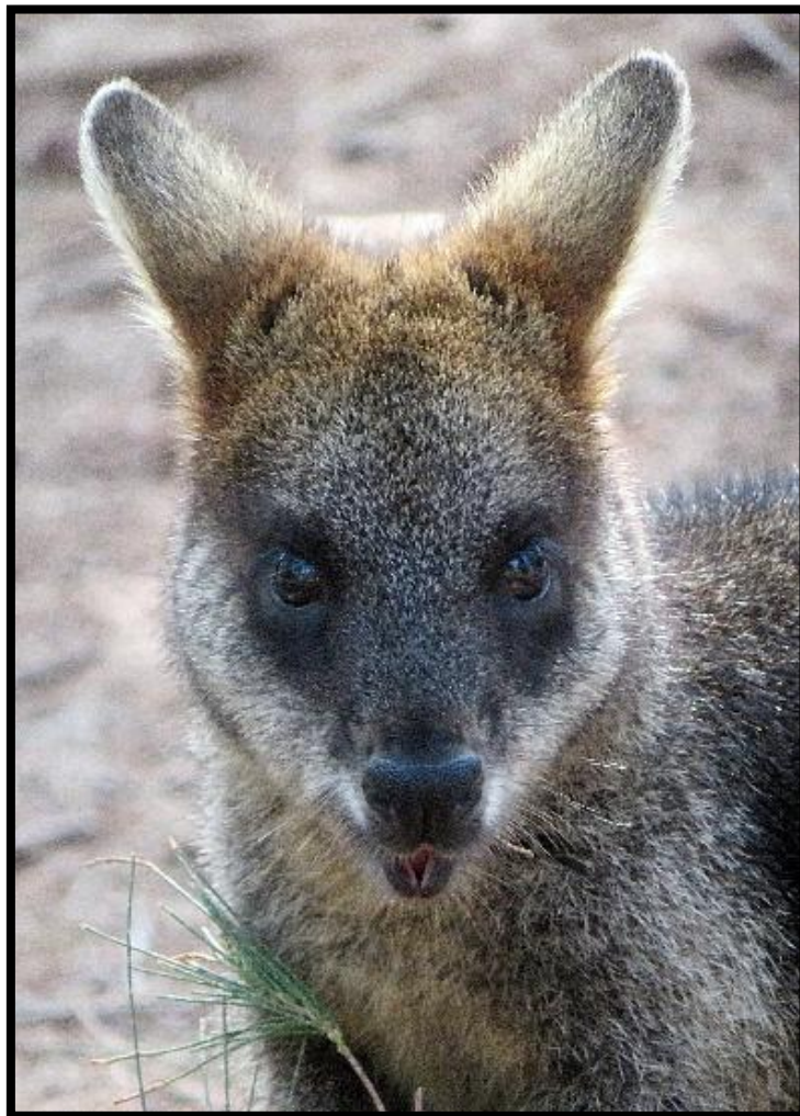
Top & Bottom: swamp (black) wallaby