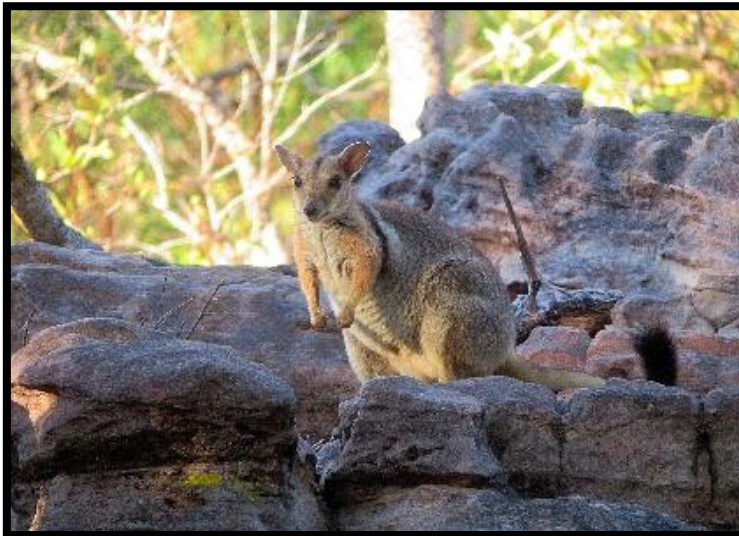
Top: feral donkeys. Middle: dingo. Bottom: Wilkins' rock wallaby