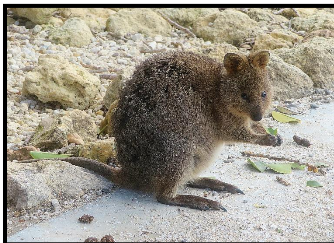
Top: red-tailed phascogale. Middle: Tammar wallaby and western ringtail possum. Bottom: quokka