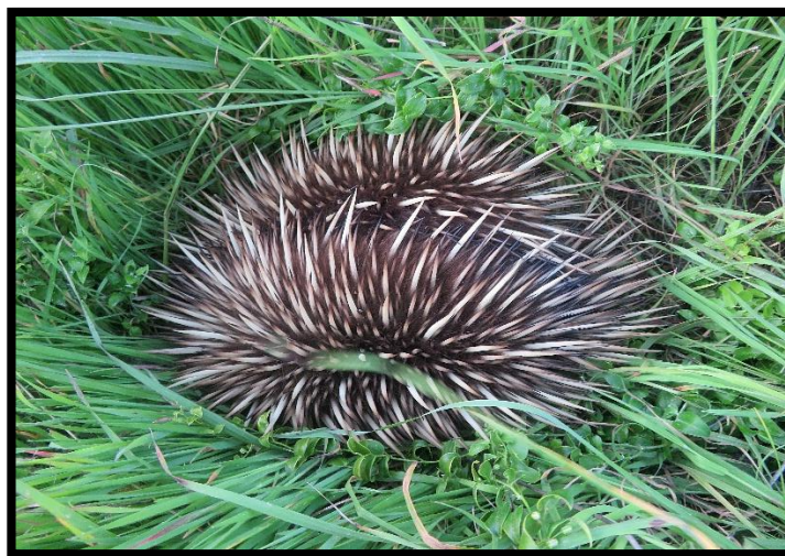
Short-beaked echidna, Kangaroo Island subspecies

DAY 5 – A trip to the south coast of the island, and Seal Bay Conservation Park 35.5958°S 137.1901°E, for close-up views of endangered Australian sea lions . From here, we travelled west to Flinders Chase National Park. Here, at Admirals Arch 36.0315°S 136.711°E we saw Australian and long-snouted fur seals , a distant humpback whale and a brushtail possum .