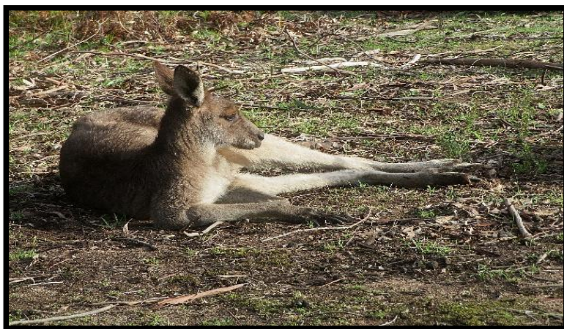
Eastern Grey Kangaroo

This was to be our final stop for the day 37.785°S 145.367°E. Here we found common ringtail and common brushtail possums . Back at Kalorama, I couldn't resist a late-night walk around the surrounding tracks, which gleaned another common wombat , several common brushtail possums , more European rabbits , and a Kreff's sugar glider .