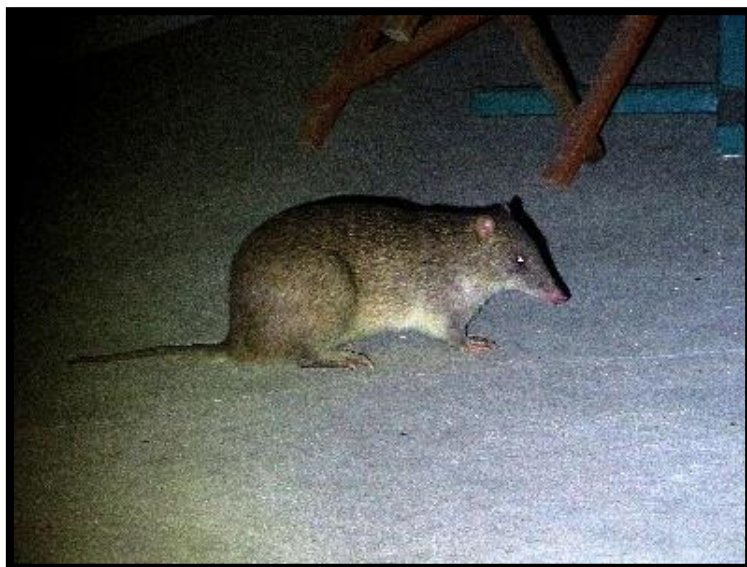
Top: fawn-footed melomys. Middle: striped possum. Bottom: northern brown bandicoot