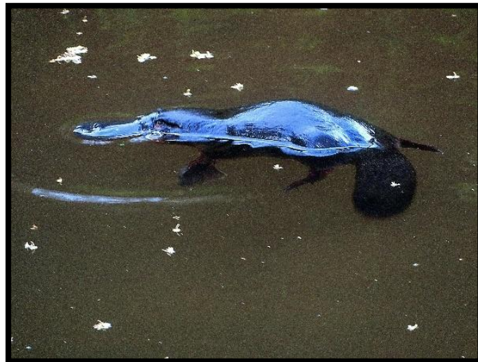
Top: spectacled flying fox. Middle: coppery brushtail possum. Bottom: platypus