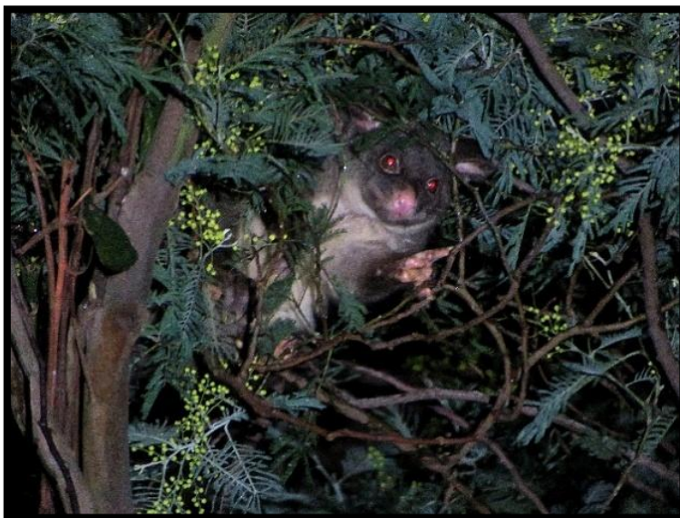
Top: red-necked wallaby. Middle: eastern greater glider. Bottom: mountain brushtail possum.