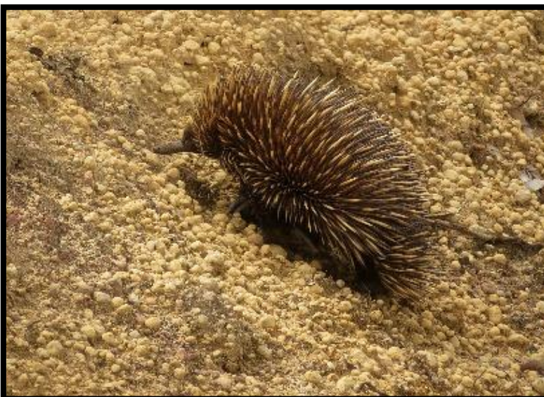
Top: Black-flanked wallaby. Middle: numbat. Bottom: Echidna