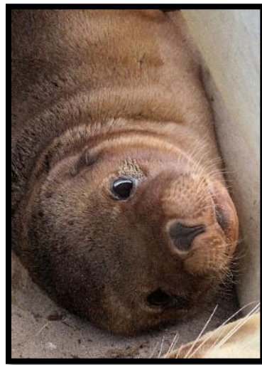
Top: western grey kangaroo. Middle: Kangaroo Island western grey kangaroos. Bottom: Koala and Australian sea lion