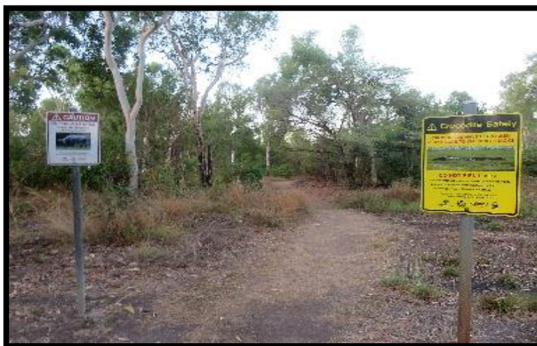
Entrance to Bardedjilidji Walk, Kakadu NP

DAY 20 & 21 Uluru, Alice Springs, and Cairns, via Brisbane. Only mammal seen a large feral cat .