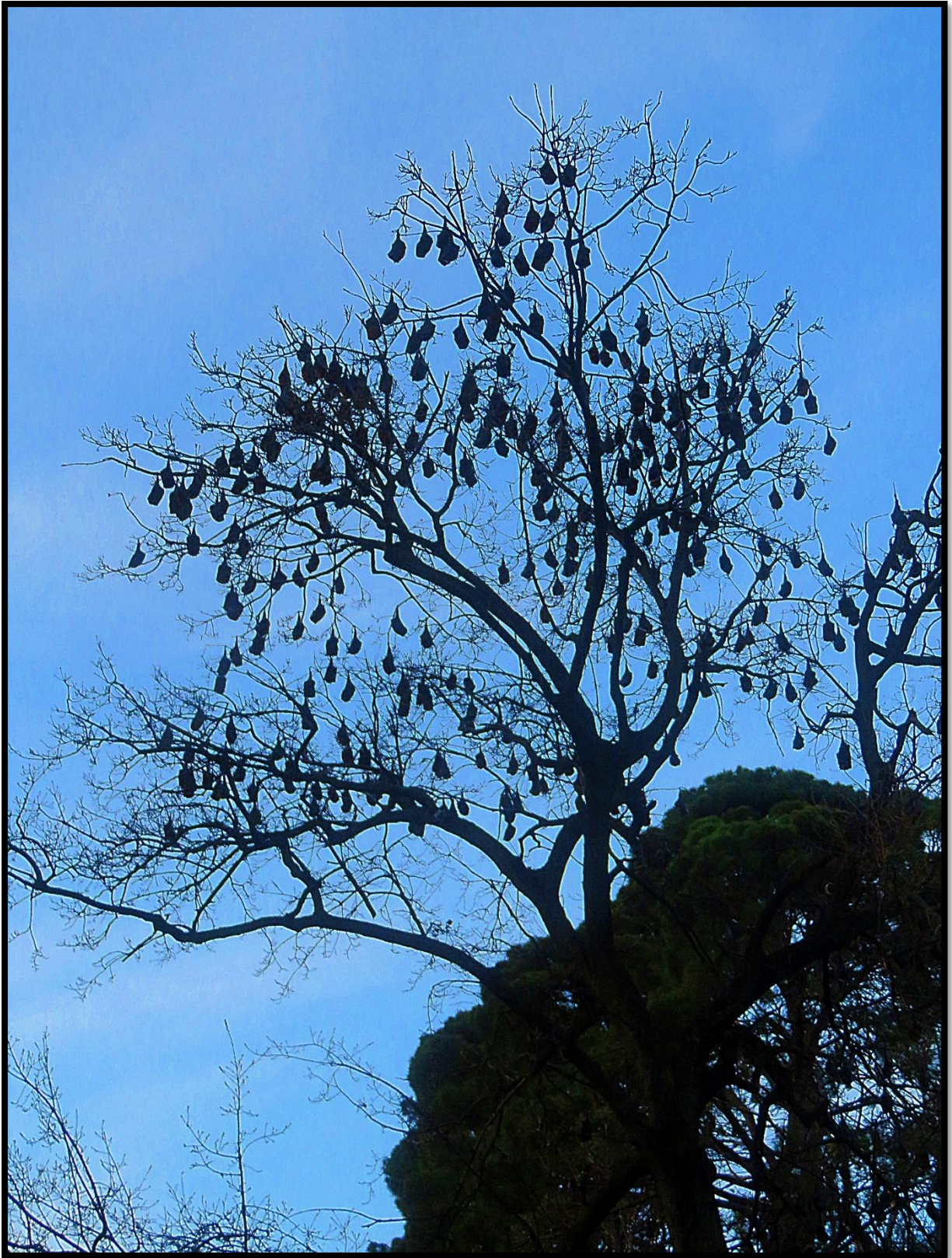
Grey-headed flying foxes, Adelaide