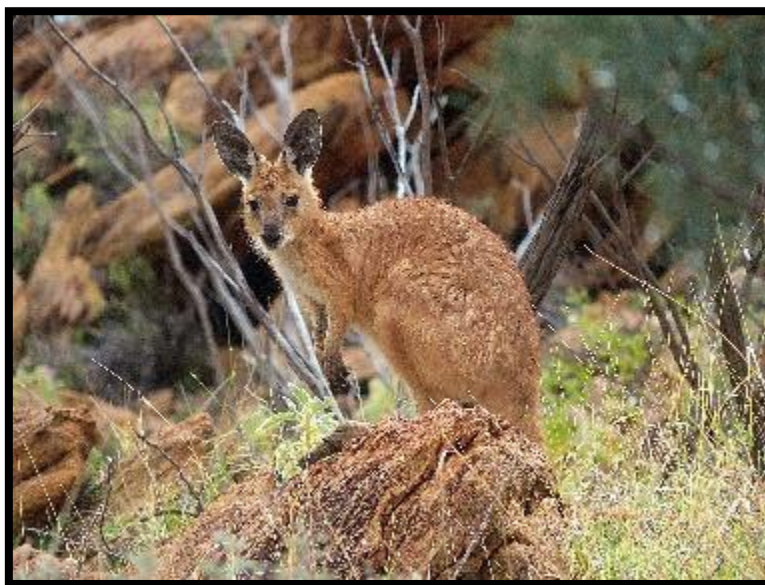
Top: agile wallaby. Middle: thylacine rock painting, Ubirr, Bottom: Euro, or common wallaroo