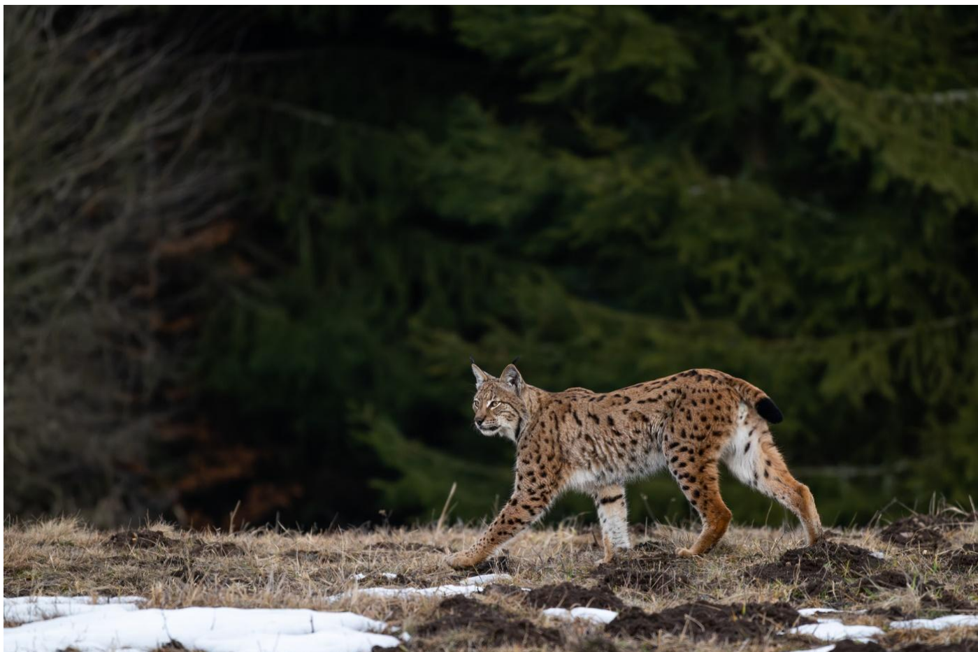
Every individual is different and there are some real 'spotted' ones, but also almost spotless males can occur!