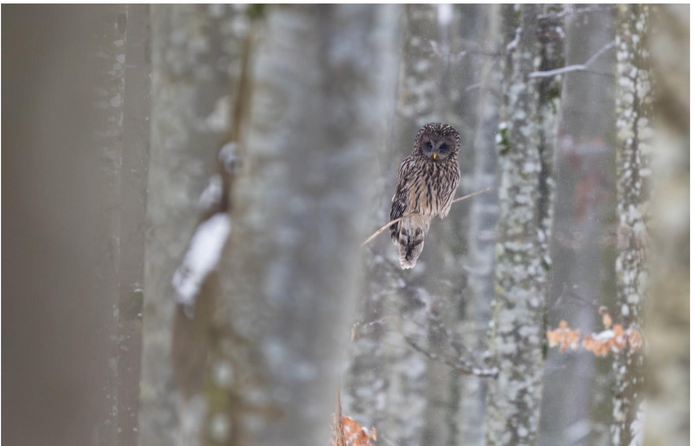
Ural Owl in Transylvania while tracking Lynx (2026)