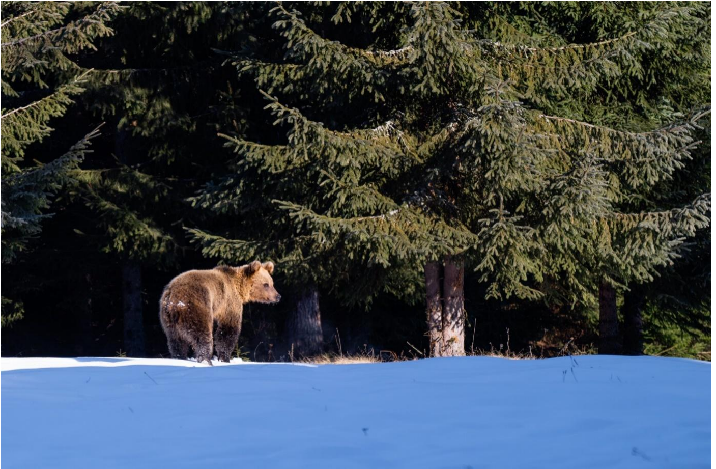
Brown Bear in Transylvania while waiting for Lynx (2026)