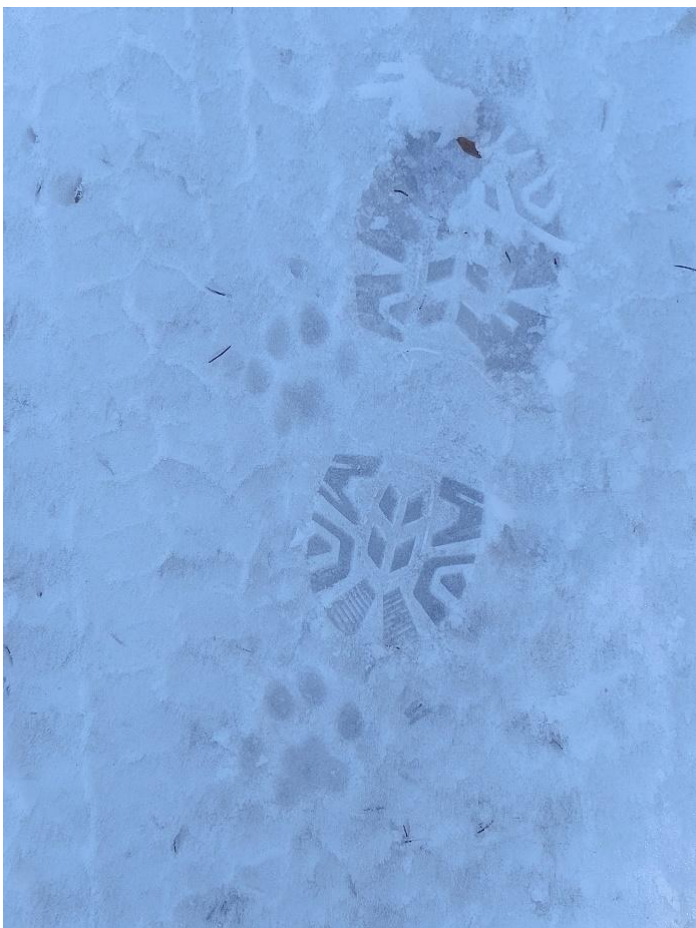
Bear (left) and Lynx (right) tracks in Transylvania in February 2026