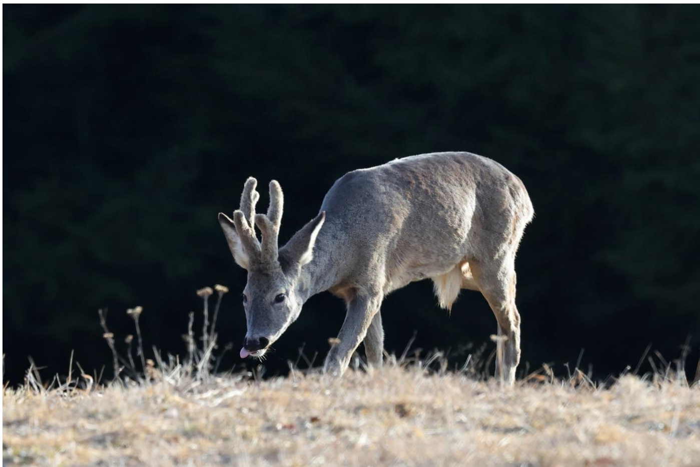
The main prey item of Lynx in the Carpathian is the Western Roe Deer