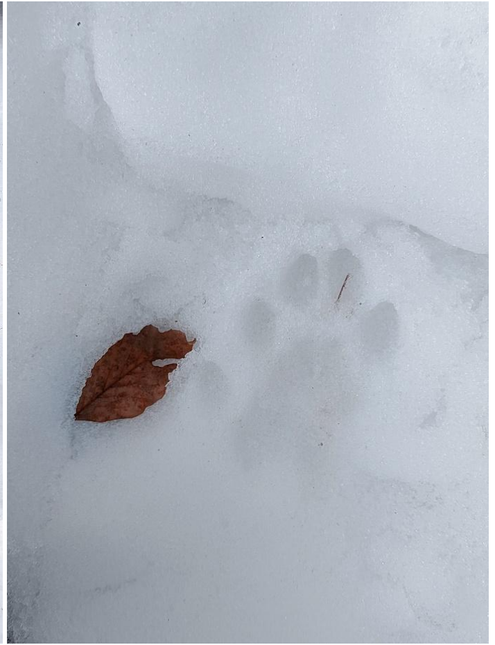
Lynx tracks in Transylvania