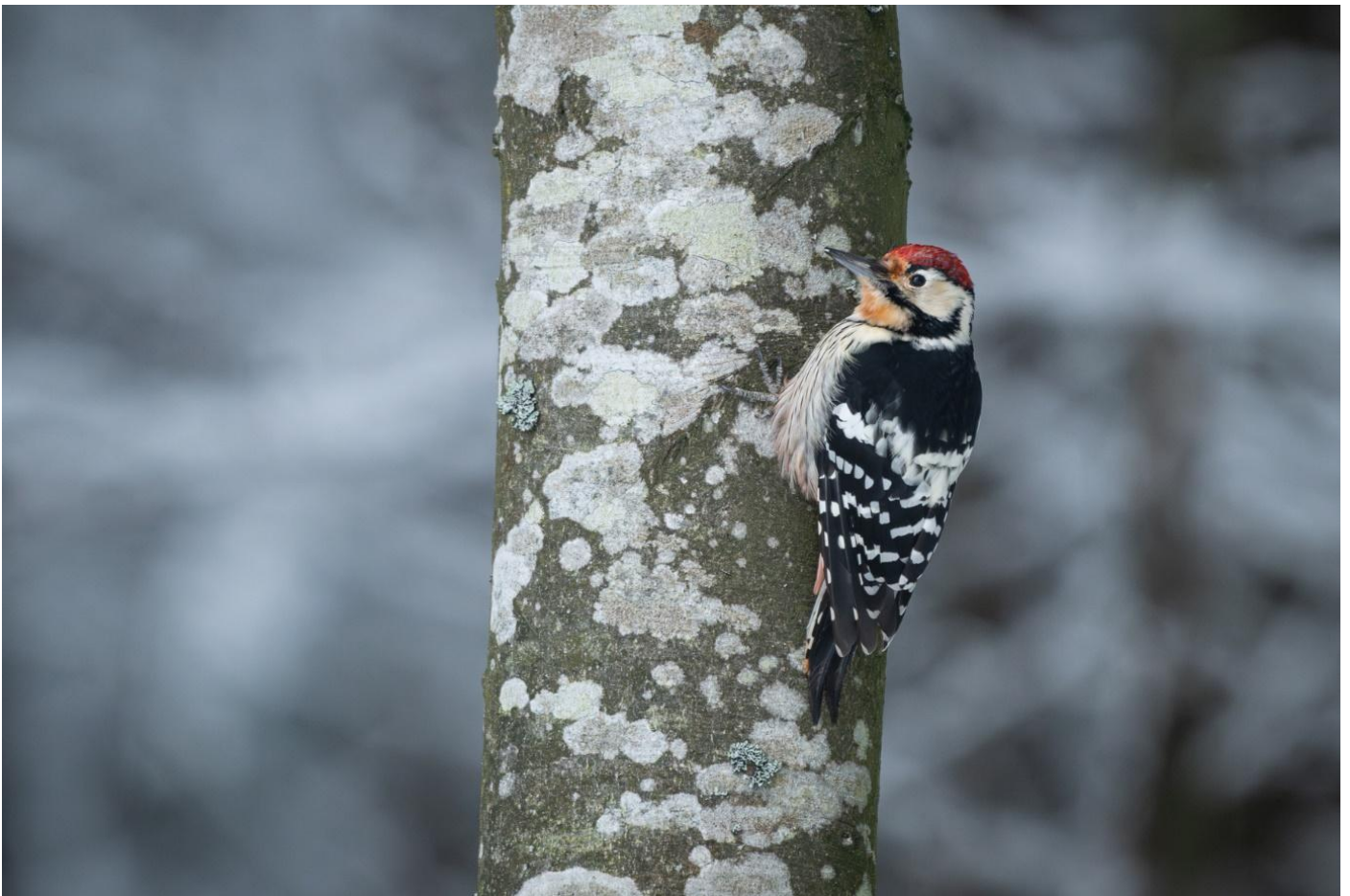
Occasionally we have luck with some birds too! Male White-backed Woodpecker