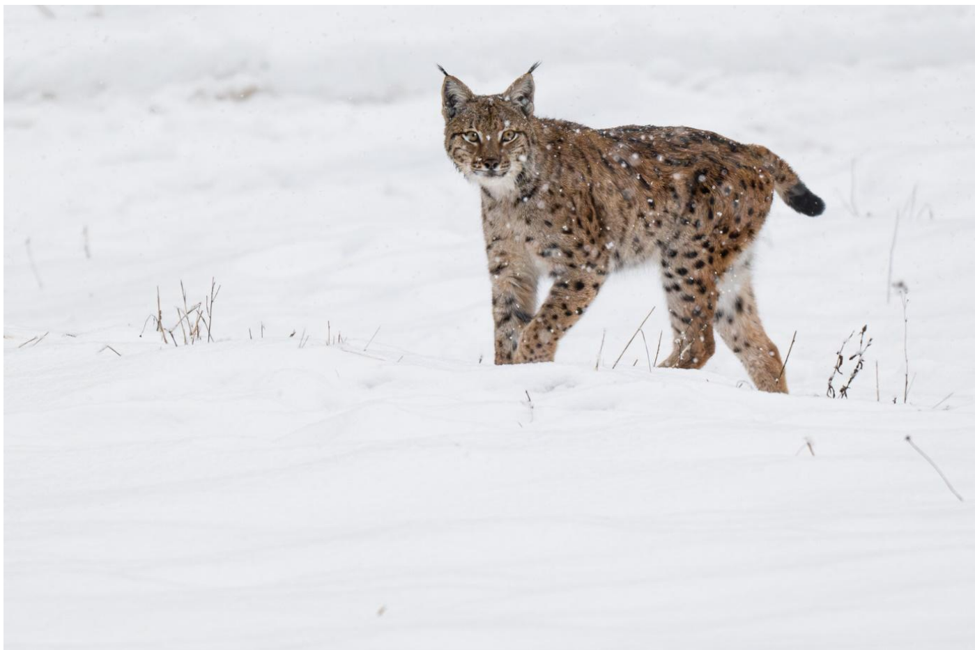
Eurasian Lynx in Transylvania in February 2026