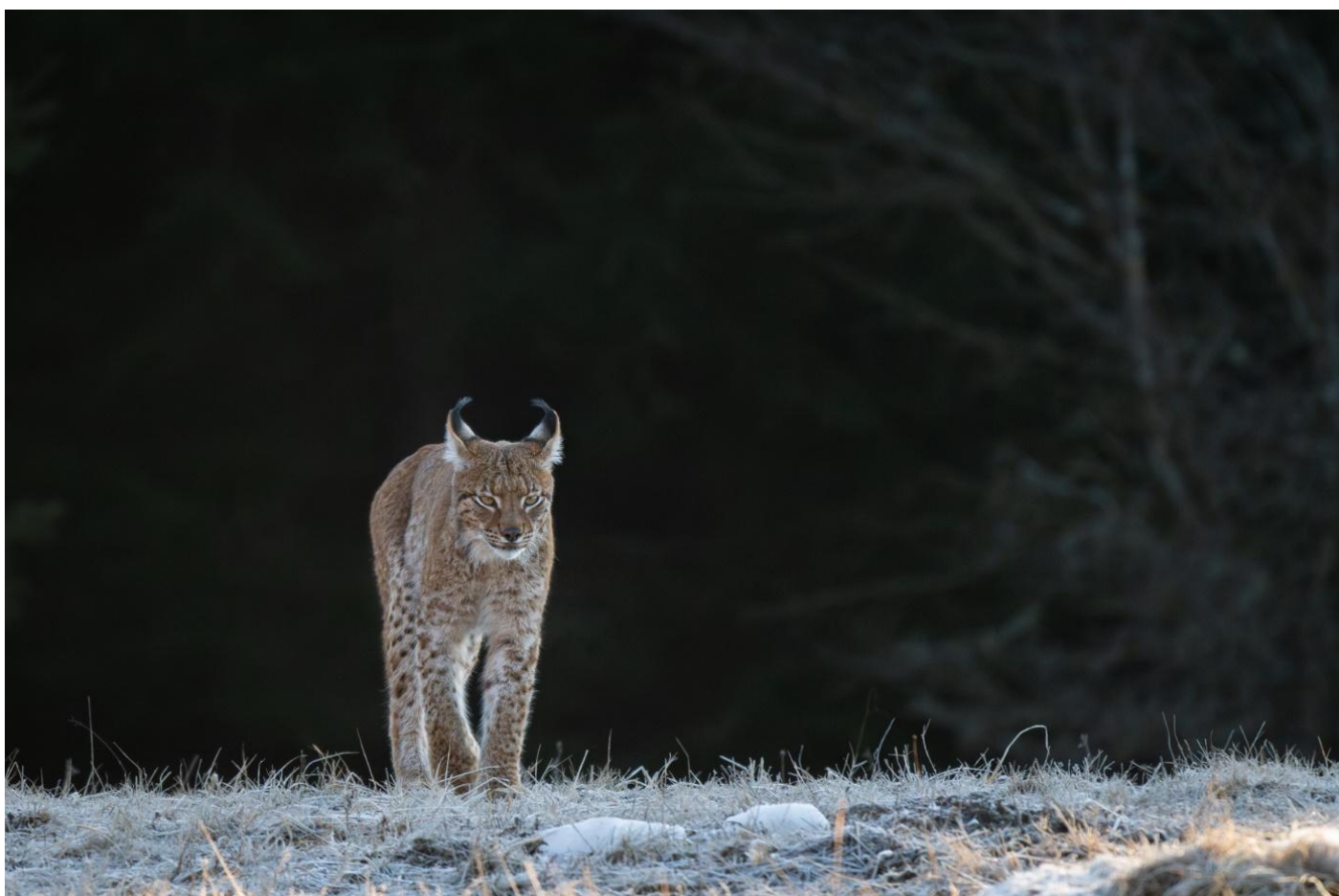
Eurasian Lynx in Transylvania in March 2026

Sakertours Eastern Europe: Lynx Photography Tour 2026 sakertour.com & ultimatesakertours.com