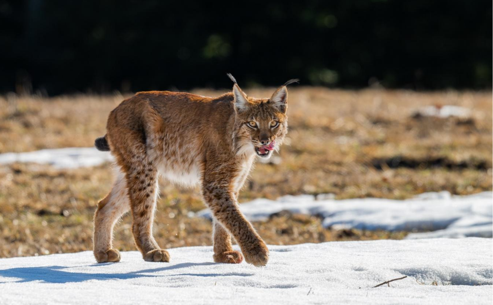
Eurasian Lynx in Transylvania in March 2026