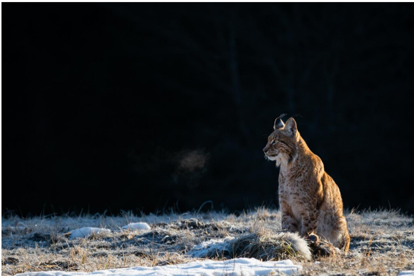
Lynx breath in March 2026

All in all, according to my experience Transylvania is amazing place to find, and with luck to photograph the Eurasian Lynx! If you interested to join me, please get in touch with our office as there may be some available places!