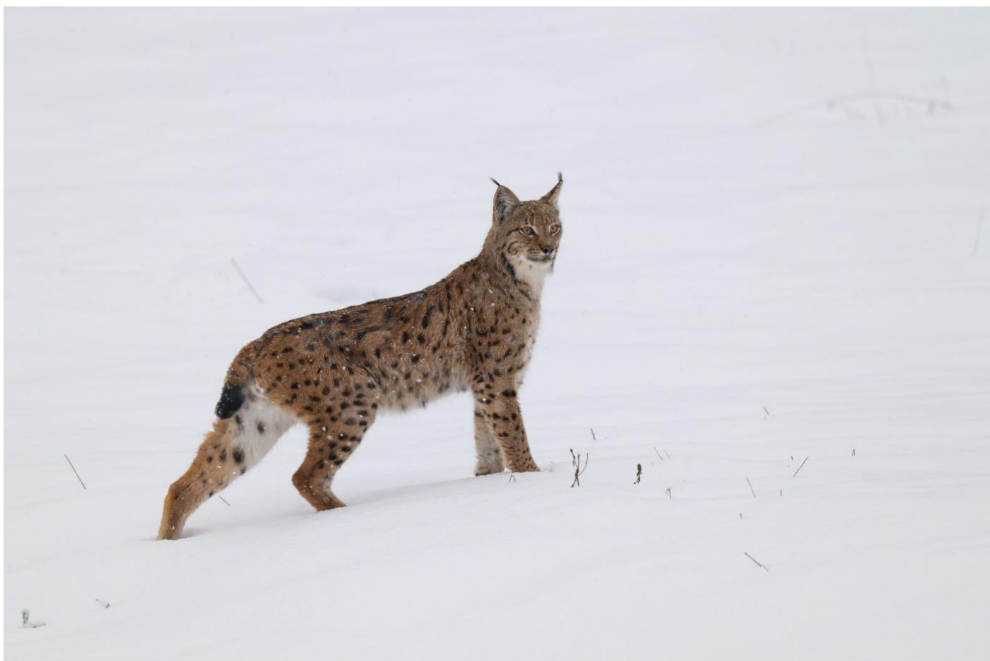
You need a special luck to encounter Lynx in snow, but fresh snow is still possible in February!

Sakertours Eastern Europe: Lynx Photography Tour 2026 sakertour.com & ultimatesakertours.com