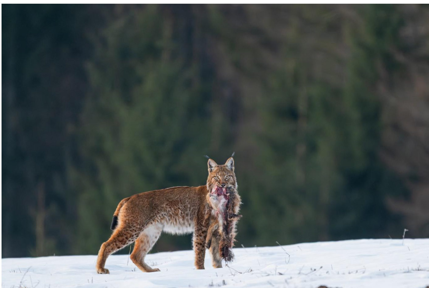
It was a special encounter to see a Lynx eating a fox carcass

Sakertours Eastern Europe: Lynx Photography Tour 2026 sakertour.com & ultimatesakertours.com