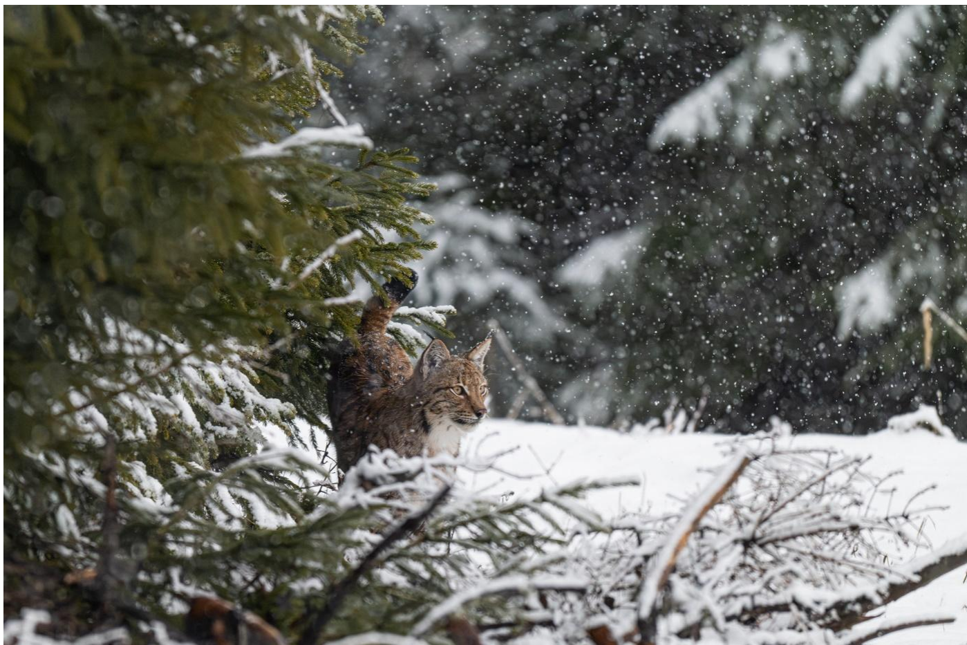
Lynx marking its territory in February 2026

It also happens that we just hear a Lynx but you must enjoy every encounter! After days of silence and no sign of any cats it does increase your adrenalin level when a male Lynx start calling! Most importantly you know it is somewhere close by! There is always hope!