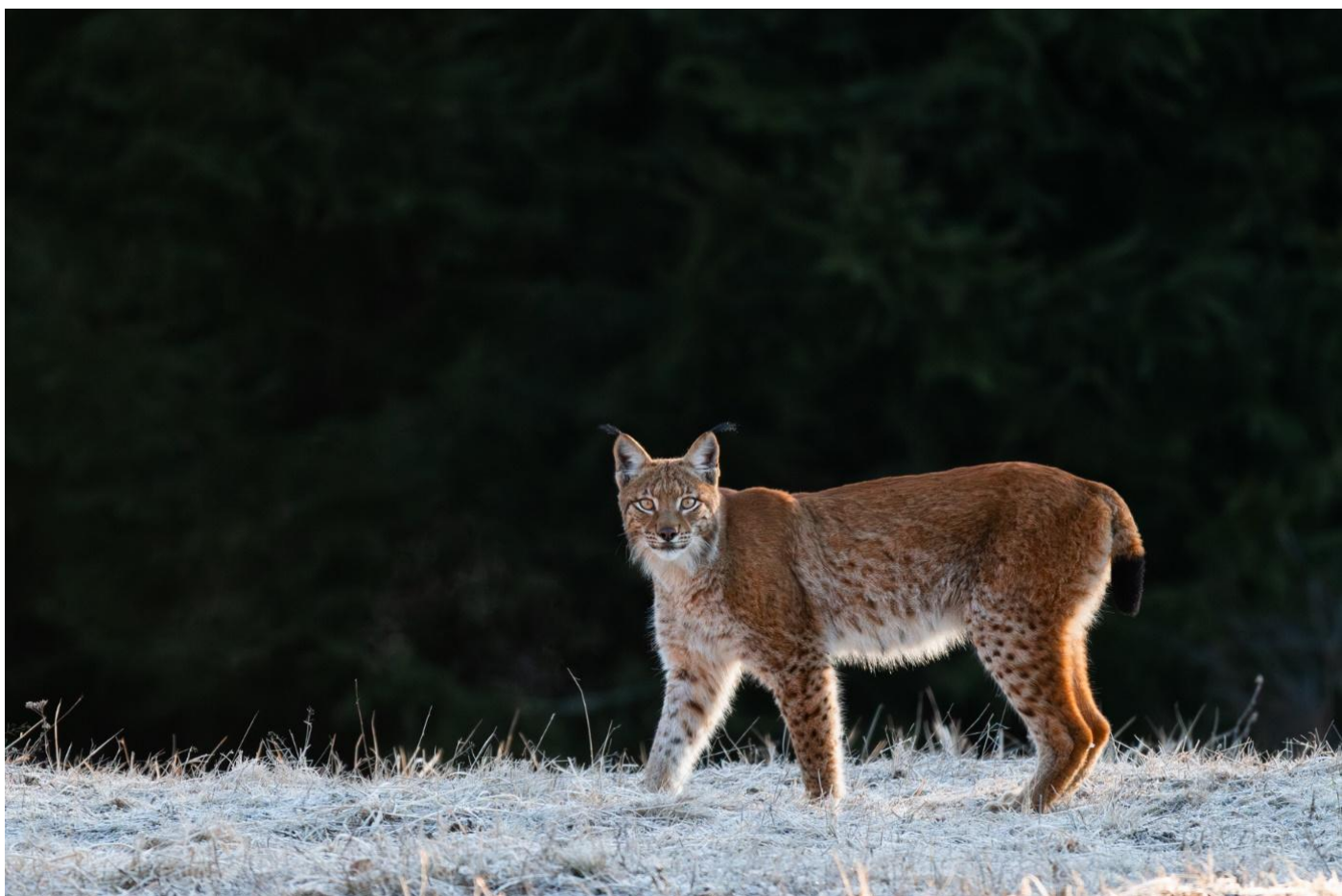
A rather less marked individual staring into my lens in March 2026

Sakertours Eastern Europe: Lynx Photography Tour 2026 sakertour.com & ultimatesakertours.com