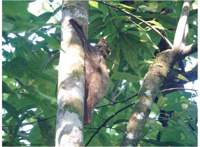
Malayan colugo ( Galeopterus variegatus )