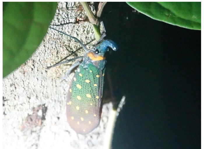
Lantern bug ( Pyrops whiteheadi )