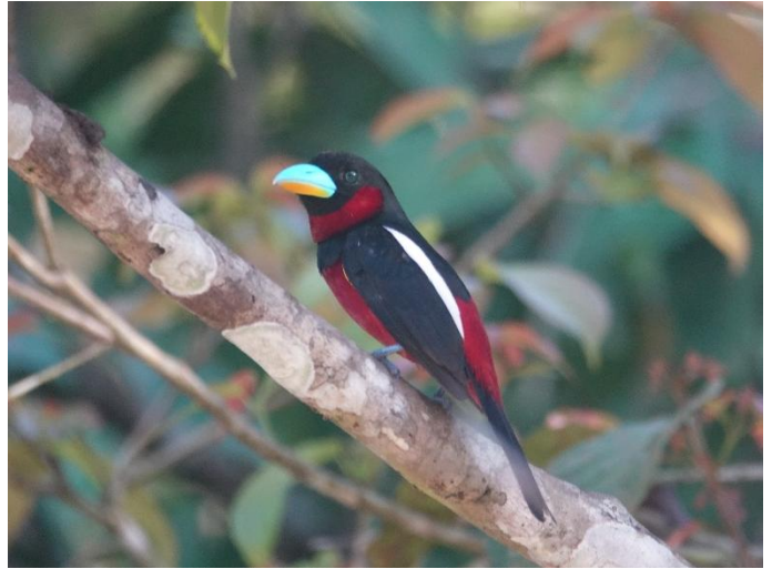
Black-and-red broadbill ( Cymbirhynchus macrorhynchos )