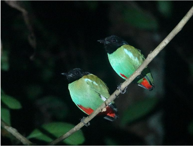
Western hooded pitta ( Pitta sordida )