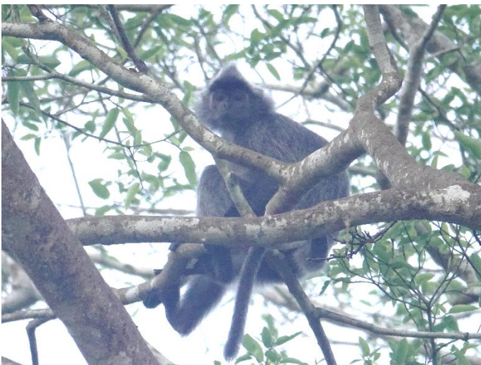
Silvery lutung ( Trachypithecus cristatus )