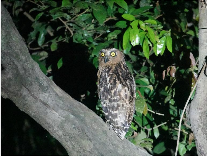
Buffy fish owl ( Ketupa ketupu )