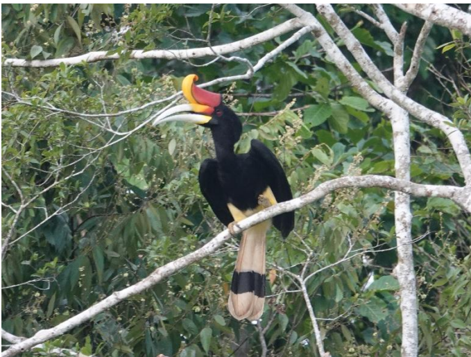
Rhinoceros hornbill ( Buceros rhinoceros )