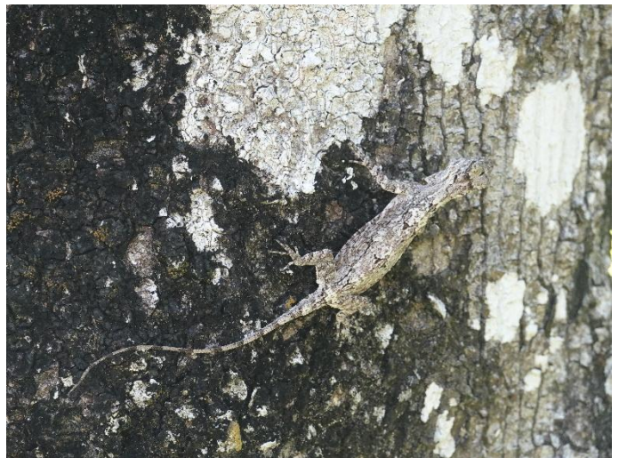
Singapore flying dragon ( Draco abbreviatus )