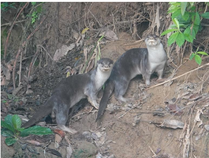
Smooth-coated otter ( Lutrogale perspicillata )