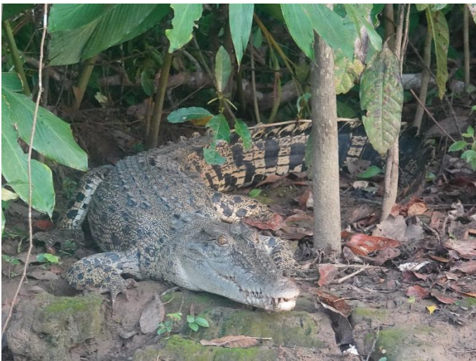
Saltwater crocodile ( Crocodylus porosus )