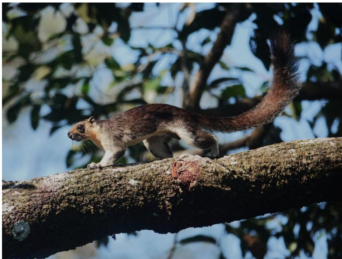
Cream-coloured giant squirrel ( Ratufa affinis )