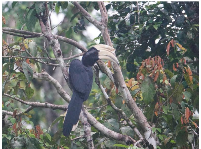
Black hornbill ( Anthracoceros malayanus )