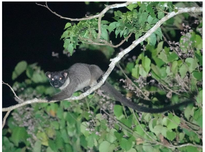
Small-toothed palm civet ( Arctogalidia trivirgata )