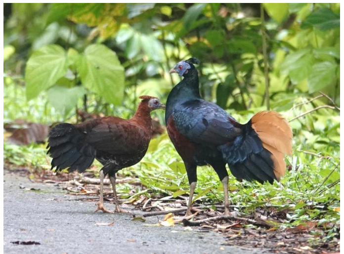
Bornean crested fireback ( Lophura ignita )