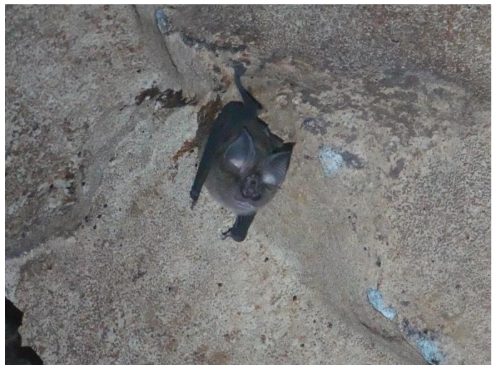
Creagh's horseshoe bat ( Rhinolophus creaghi )