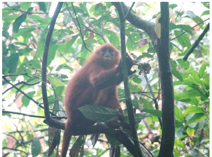
Maroon langur ( Presbytis rubicunda )