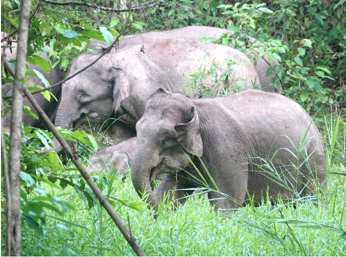
Asian elephant ( Elephas maximus )