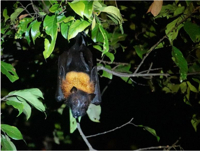
Malaysian flying fox ( Pteropus vampyrus )