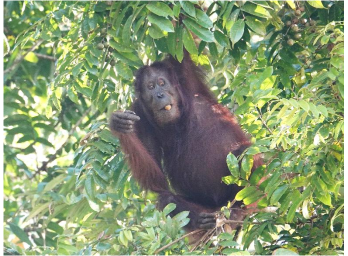
Bornean orangutan ( Pongo pygmaeus )