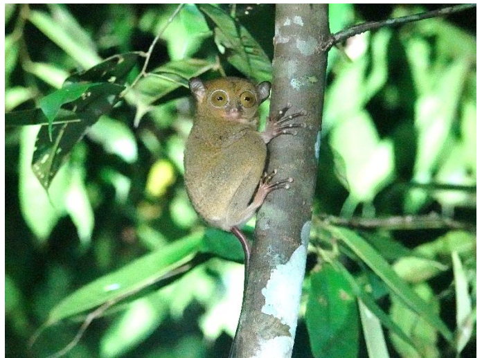
Western tarsier ( Cephalopachus bancanus )