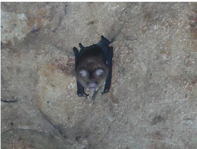
Fawn leaf-nosed bat ( Hipposideros cervinus )