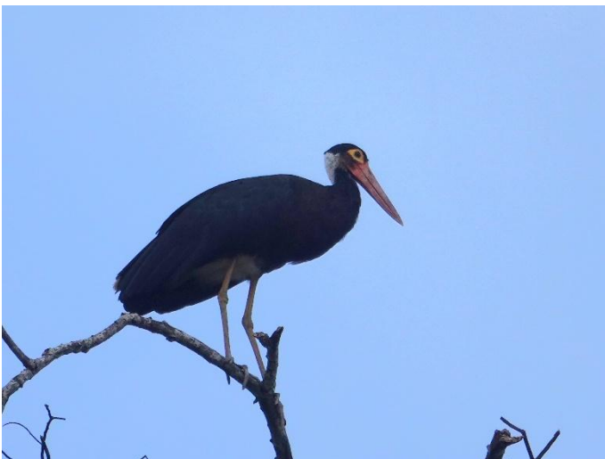
Storm's stork ( Ciconia stormi )