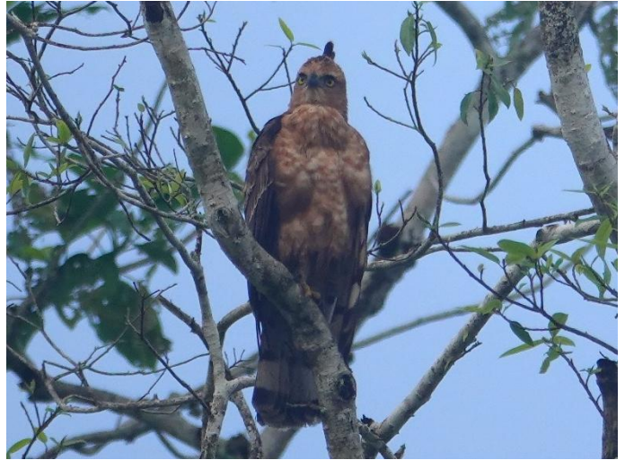
Wallace's hawk-eagle ( Nisaetus nanus )