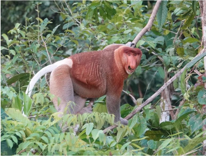
Proboscis monkey ( Nasalis larvatus )