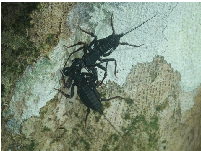
Whipscorpion ( Typopeltis crucifer )