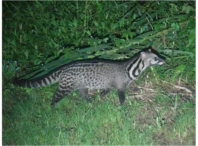
Malayan civet ( Viverra zibetha )