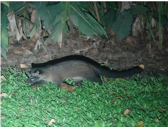
Philippine palm civet ( Paradoxurus philippinensis )