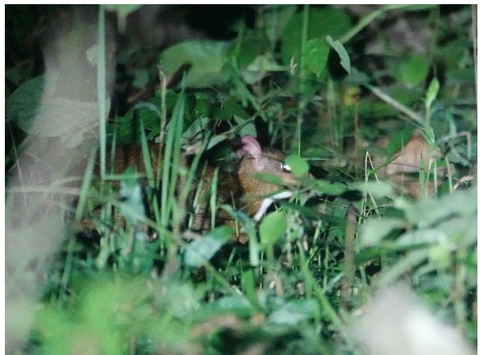
Lesser mouse-deer ( Tragulus kanchil )