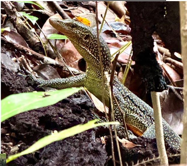
Bennett's Long Tailed Monitor