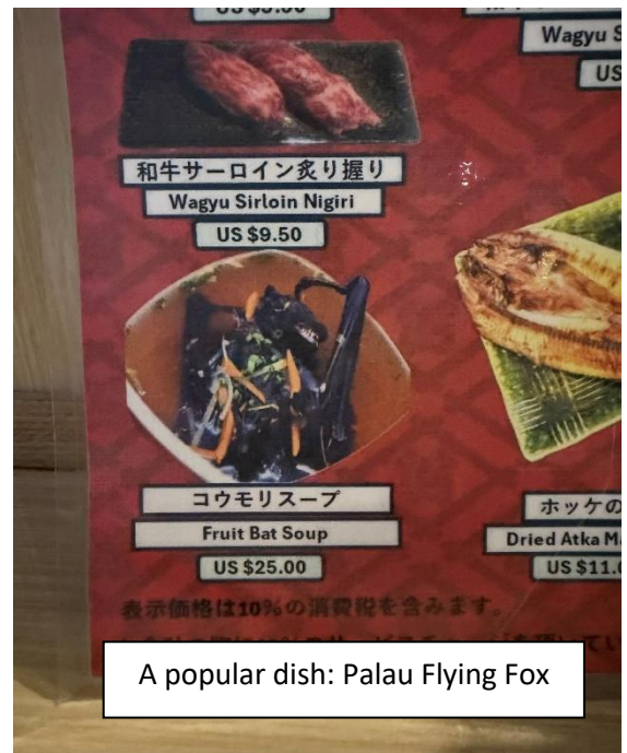
A popular dish: Palau Flying Fox

In the Japanese made 1000 man cave, we finally found the sheath tailed bats. A small colony in one of the many passageways. Mission accomplished!