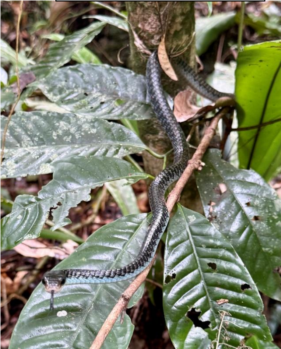
Palau Tree Snake