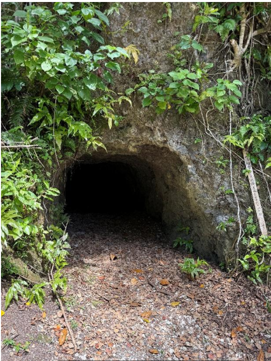
1000 Man Cave, Peleliu