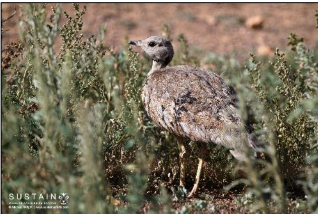
Karoo Korhaan (SA endemic)

Black Rhinoceros, African Lion, Brown Hyena, African Leopard, Cape Mountain Zebra, Gemsbok (South African Oryx), Red Hartebeest, Common Eland, Greater Kudu, Riverine Rabbit, Black-footed Cat, Bat-eared Fox, Southern Aardwolf, Aardvark, Klipspringer, Springbok, Smith's Red Rock Rabbit, Grant's Rock Mouse, Sclater's Golden Mole, Melck's Serotine Bat, Lesueur's Hairy Bat, and Spectacled Dormouse.