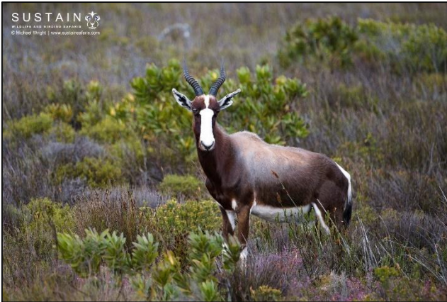
Bontebok (SA endemic)