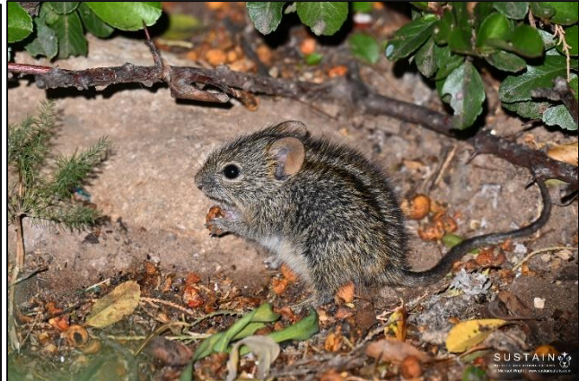
Four-striped Grass Mouse