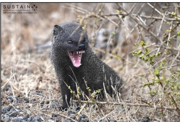
Cape Grey Mongoose (SA endemic)

The Bontebok National Park is a species-specific national park in South Africa. It was established in 1931 to ensure the preservation of the Bontebok. It is the smallest of South Africa's 19 National Parks, covering an area of 27.86 km 2 . The park is part of the Cape Floristic Region, which is a World Heritage Site.