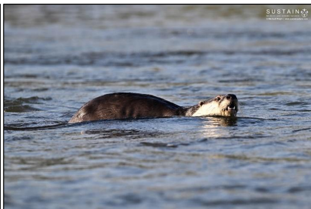
Cape Clawless Otter