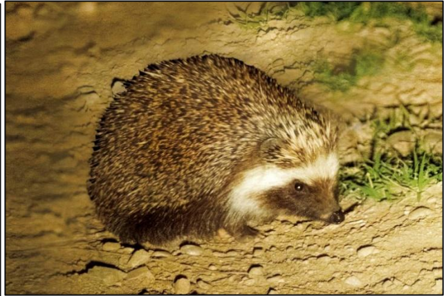
South African Hedgehog