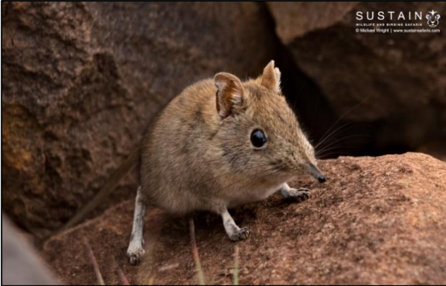
Eastern Rock Sengi (Elephant Shrew)