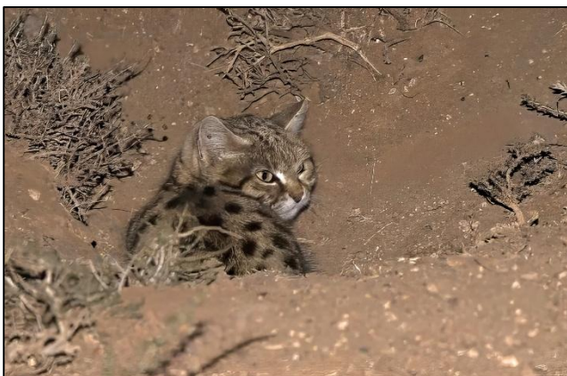
Black-footed Cat

There are a number of habitats which exist within the private nature reserve we explore west of Vryheid. These include grassland, wetland, mixed woodlands, forest and cliffs. Due to the diversity of these regions, a wide variety of special plants, animals and birds can be found there. Over 340 species of birds have been recorded in the greater Vryheid area.