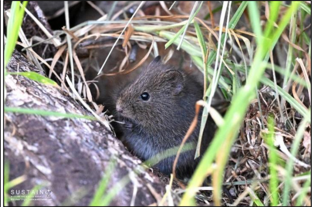
Angoni Vlei Rat