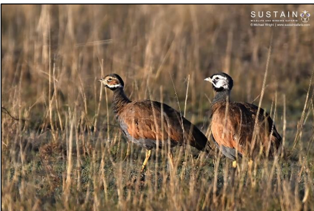
Blue Korhaan (SA endemic)

Aardvark, Aardwolf, Black-footed Cat, Cape Fox, Bat-eared Fox, South African Hedgehog, African Wild Cat, Striped Polecat, African Striped Weasel, Cape Porcupine, Hippopotamus, Meerkat (Suricate), Eastern Rock Sengi (Elephant Shrew), Roan, Sable, Red Hartebeest, Blesbok, Springbok, Yellow Mongoose, South African Ground Squirrel, Cape Genet, Cape Hare, Springhare.