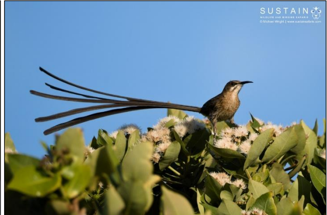
Cape Sugarbird (SA endemic)