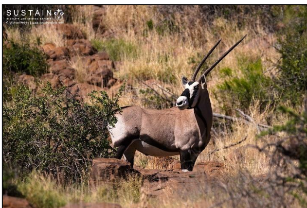
Gemsbok (South African Oryx)

Mokala National Park is a new 26,485 hectare reserve situated approximately 80 km south-southwest of Kimberley. Nestled in the hills, Mokala's landscape boasts a variety of koppieveld (hills) and large open plains. The isolated dolerite hills give the place a calming feeling of seclusion. A big surprise awaits when you pass through the hills and are confronted by the large open sandy plains towards the north and west of the Park. Drainage lines from the hills form little tributaries that run into the plains and drain into the Riet River.