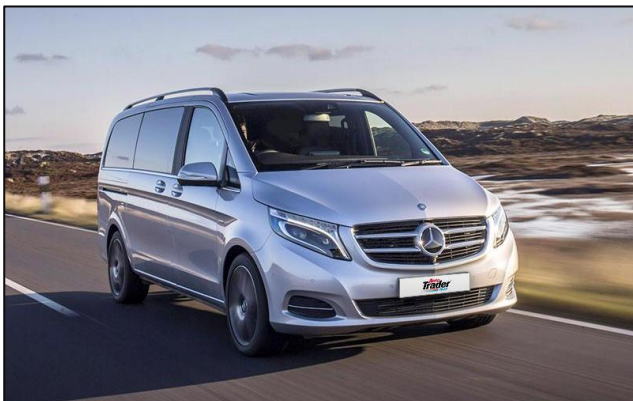
General tour travel vehicle

All ground transport travel by the group will be in a Mercedes Benz Vito vehicle, and open safari viewers will be used in select game viewing destinations.