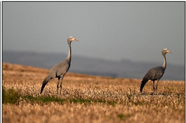
Blue Cranes (SA endemic)