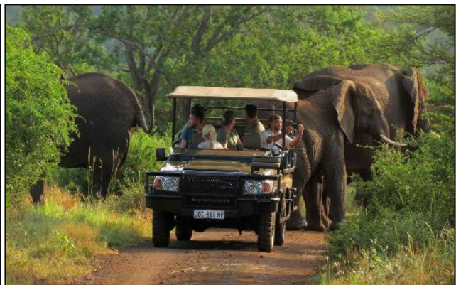
Open safari vehicle for certain game drives