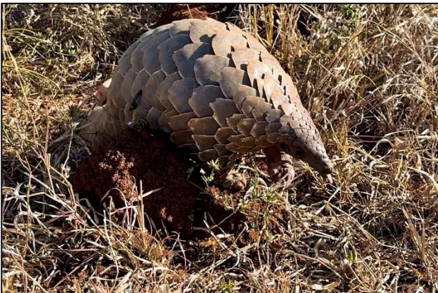
Temminck's Ground Pangolin

Manyoni Private Game Reserve is a large 23,000-hectare privately-owned reserves in KwaZulu-Natal. It lies in the heart of Zululand, an area that is world renowned for its spectacular game viewing, rich cultural traditions, and conservation history. Initially formed as part of the WWF black rhino range expansion project, Manyoni has become one of the premier big five safari destinations in KwaZulu-Natal with a strong focus on endangered species conservation, including the reintroduction of cheetah and wild dogs, as well as conserving overall biodiversity.