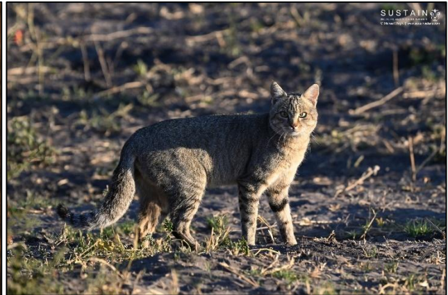
African Wild Cat