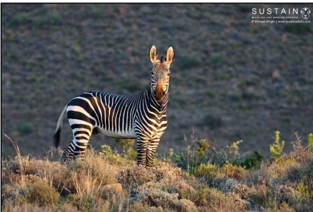
Cape Mountain Zebra (SA endemic)

The Karoo National Park, founded in 1979, is a wildlife reserve in the Great Karoo area of the Western Cape, South Africa near Beaufort West. This semi-desert area covers an area of 75,000 hectares. The Nuweveld portion of the Great Escarpment runs through the Park. The Park therefore straddles part of the Lower Karoo, at about 850m above sea level, and part of the Upper Karoo at over 1,300 m altitude.