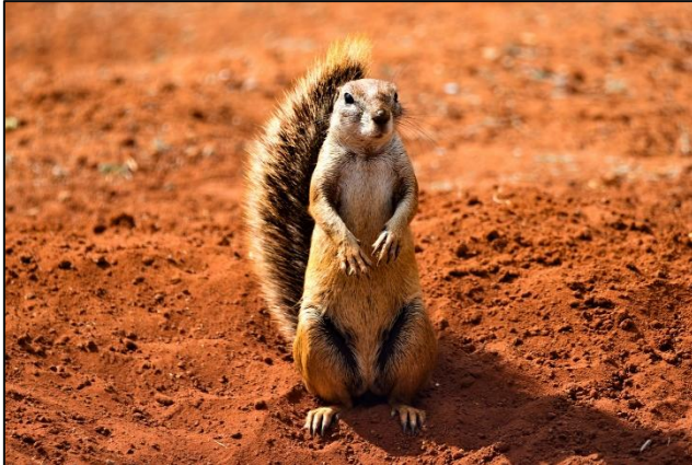
South African Ground Squirrel

Red Hartebeest, Mountain Reedbuck, Springbok, Cape Buffalo.