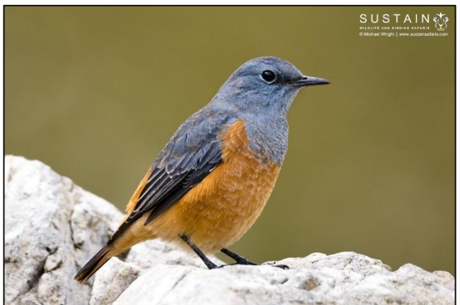
Sentinel Rock Thrush