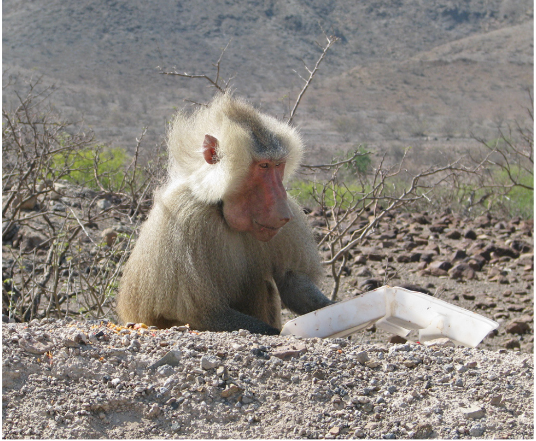
Hamadryas Baboon. Ali Sabieh