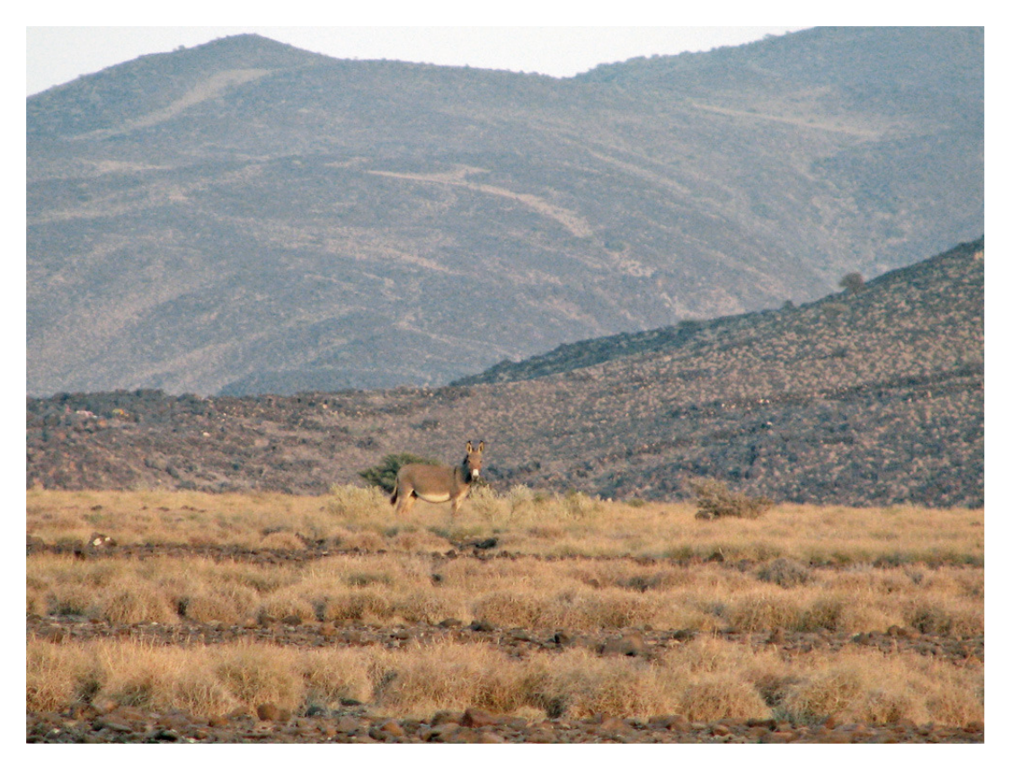
African Wild Ass. Grand Bara