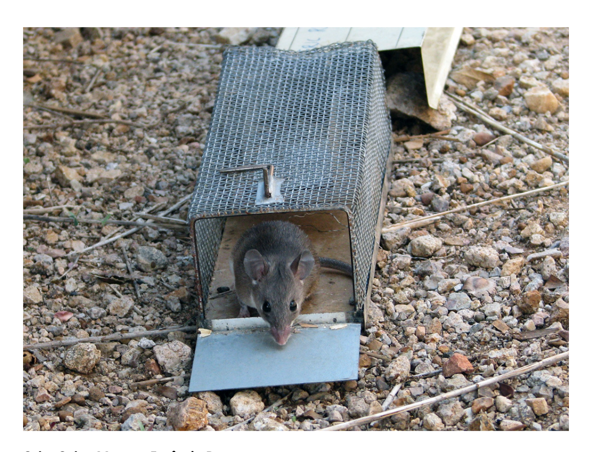
Cairo Spiny Mouse. Forêt du Day