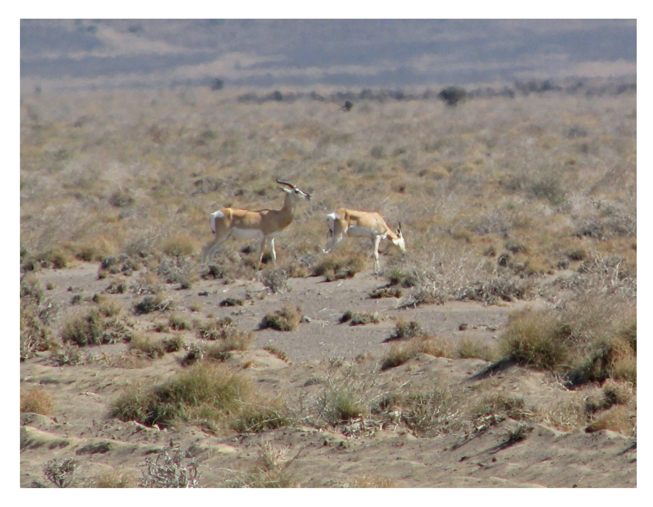
Soemmerring's Gazelle. Saltpans Petit Bara and Grand Bara

Night in Ali Sabieh at Hotel Palmeraie d'Ali Sabieh, our base in the search for the exclusive antelope Beira. There were a lot of Hamadryas Baboons in the area.