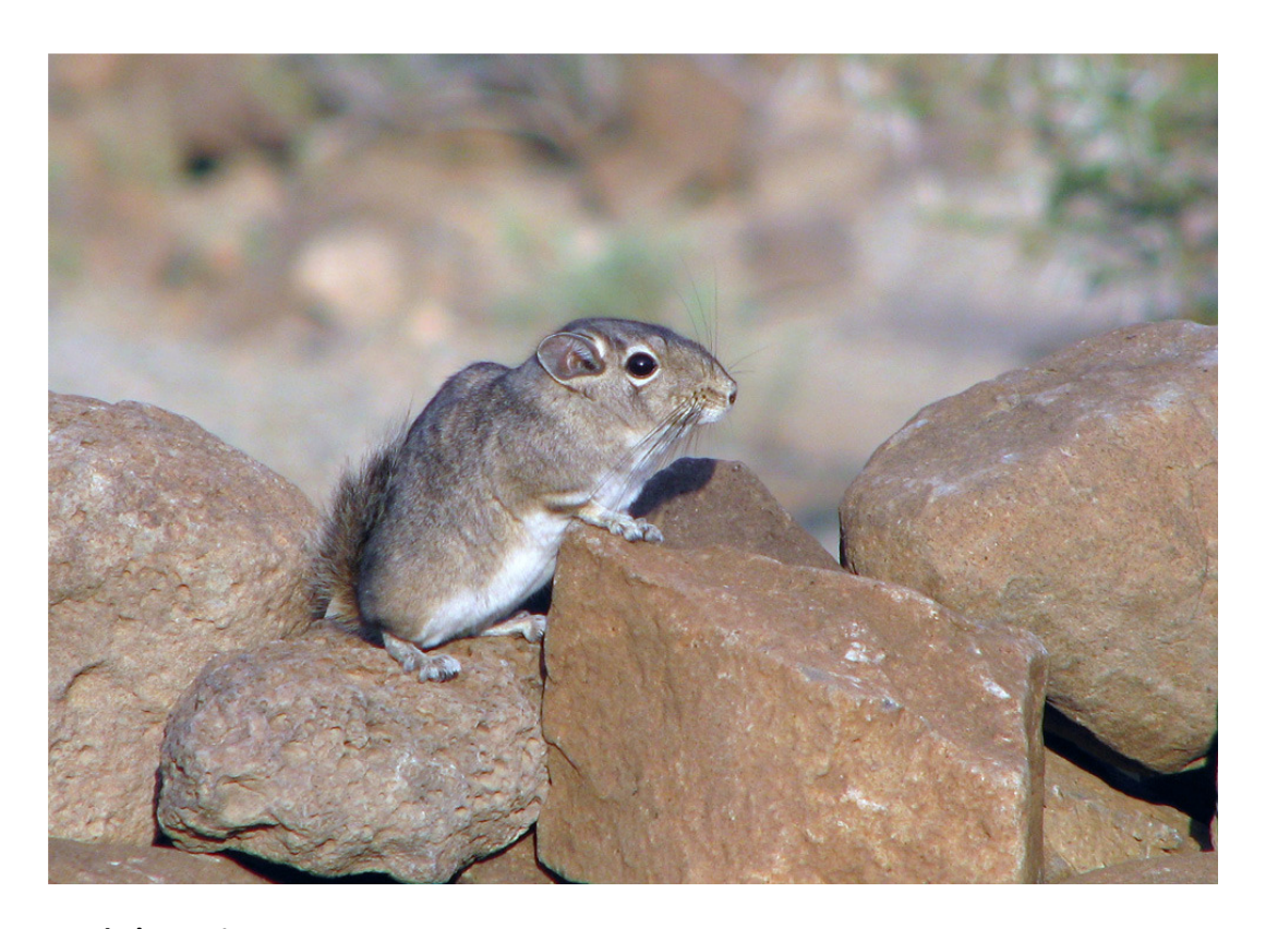
Speke's Pectinator. Assamo