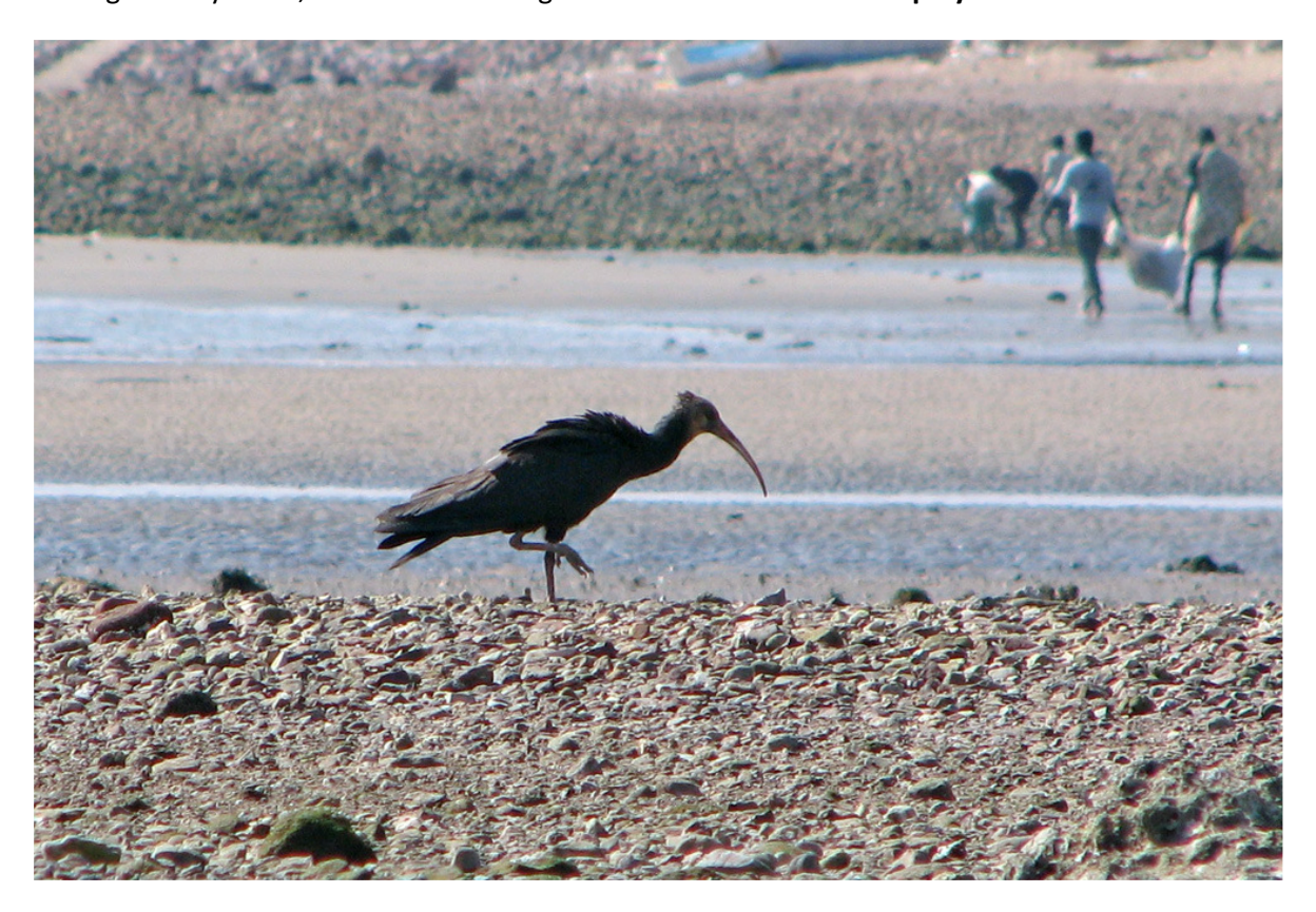
Northern Bald Ibis. Tadjourah

Our tour leader had put out a few traps and one was just outside my hut. At night, I woke up from a noise and discovered a cat striking the trap with a scared little mouse in it. The mouse had to spend the night in my room, and in the morning it was identified as a Cairo Spiny Mouse.