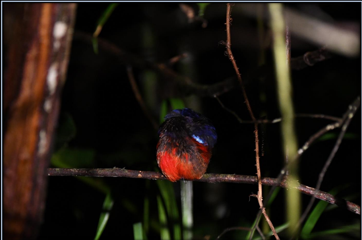
Even more sleepy Black crowned pitta – Danum valley