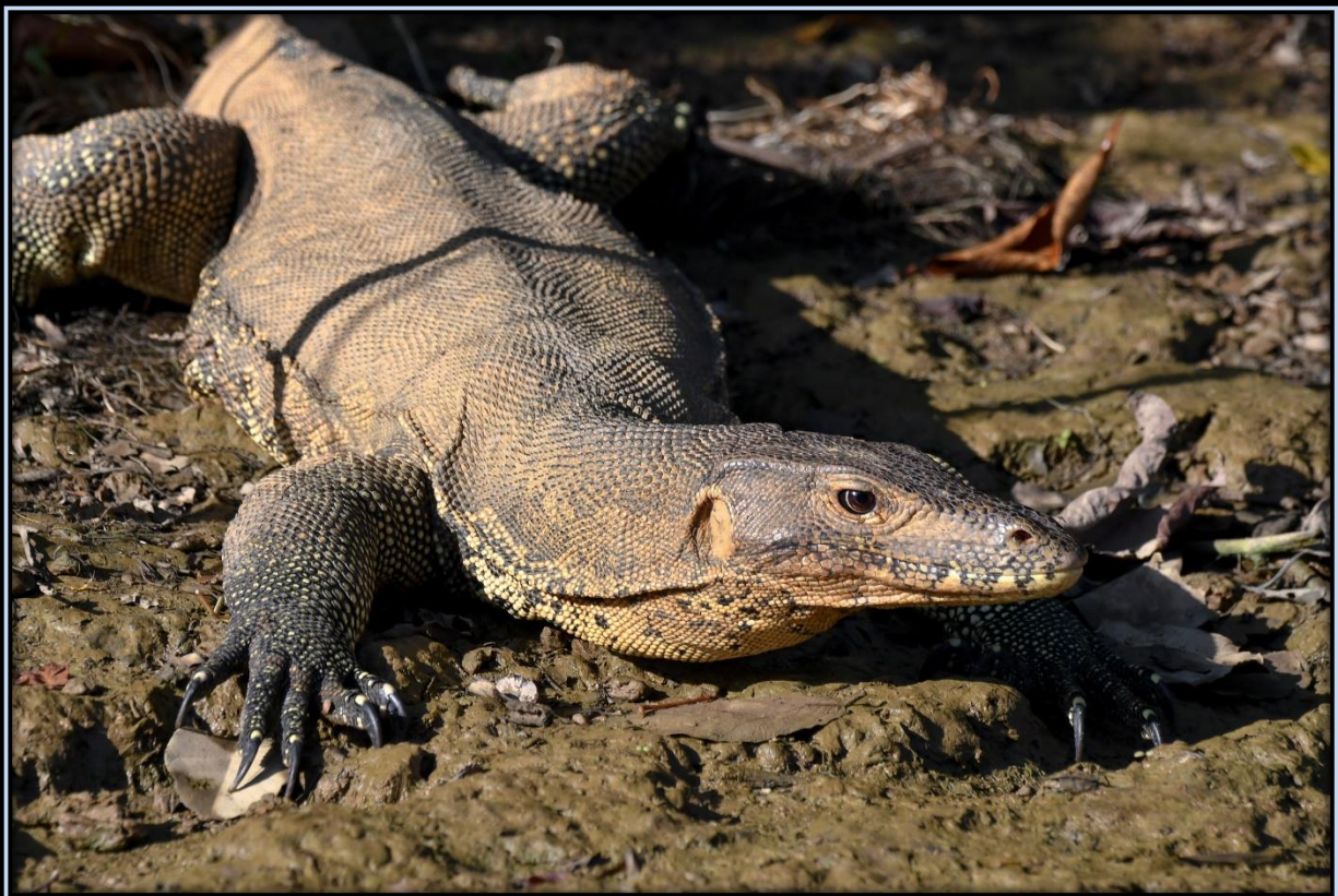
Asian water monitor lizard – Kinabatangan