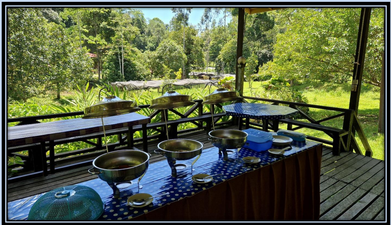
Breakfast/Lunch/dinner place at INFAPRO