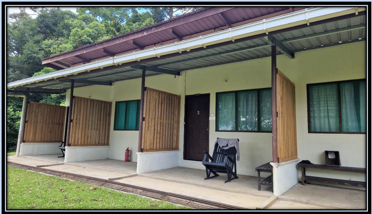
My room at INFAPRO Lodge