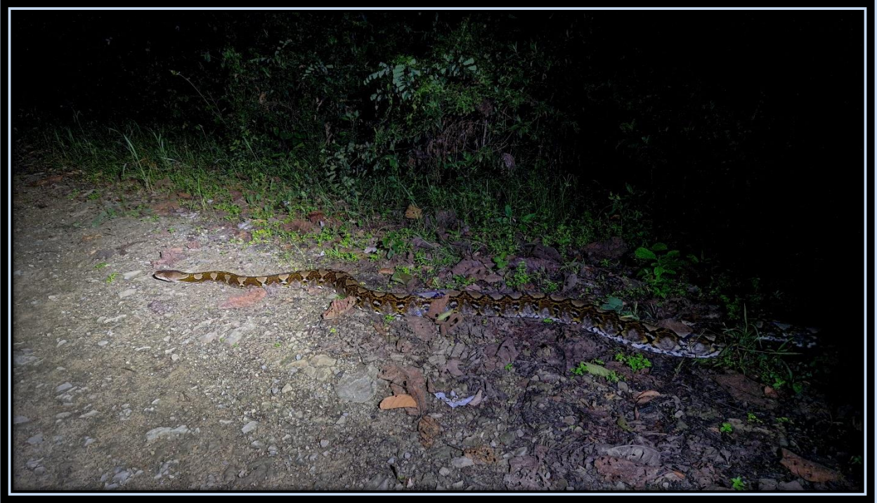
Sickest snake ever! Reticulated python. 6-7 meters long. As big as they get. Never seen such a huge snake – Danum Valley.