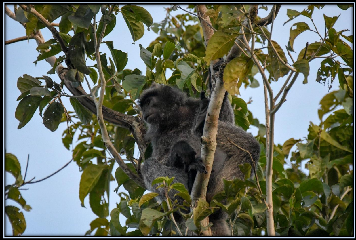
17. Maroon langur (Red leaf monkey) --- Seen on our only afternoon drive in Danum.