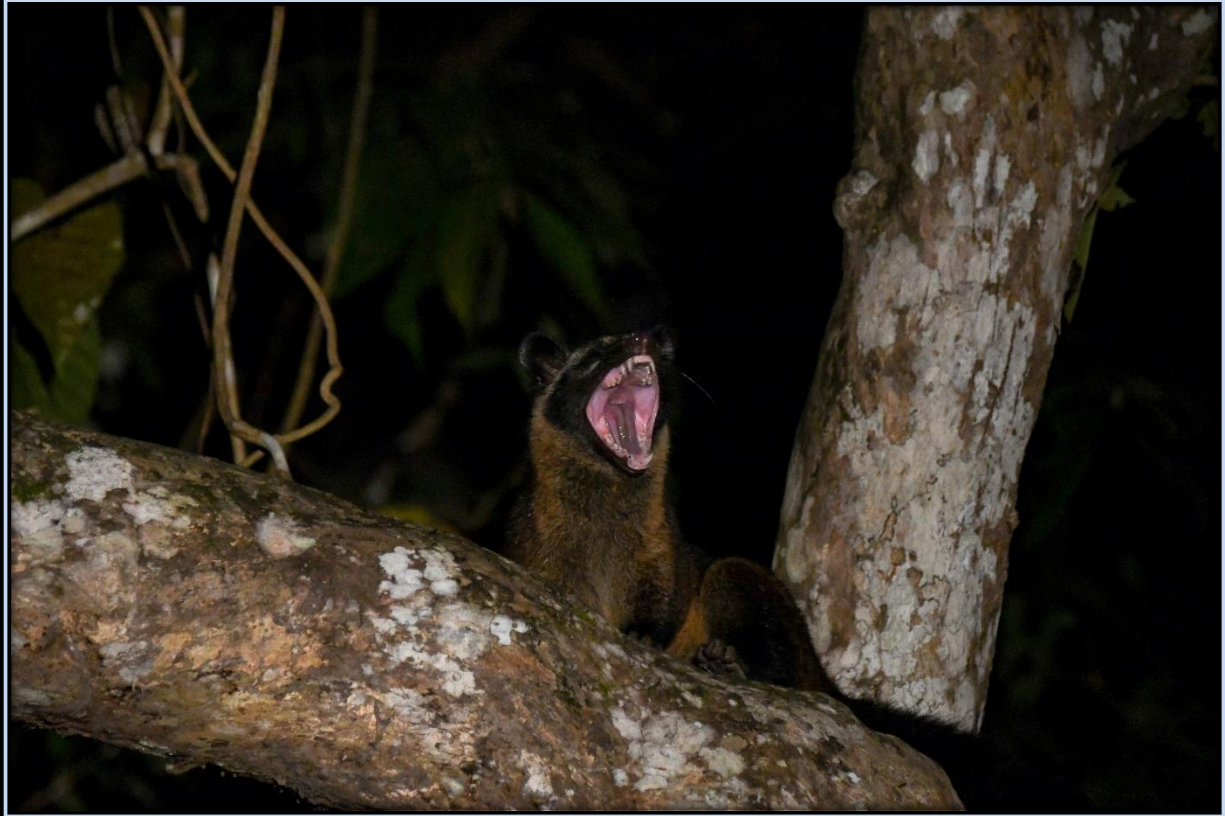
Sleepy Island palm civet – Kinabatangan