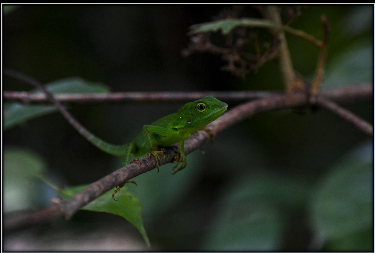
Green crested lizard – Danum valley