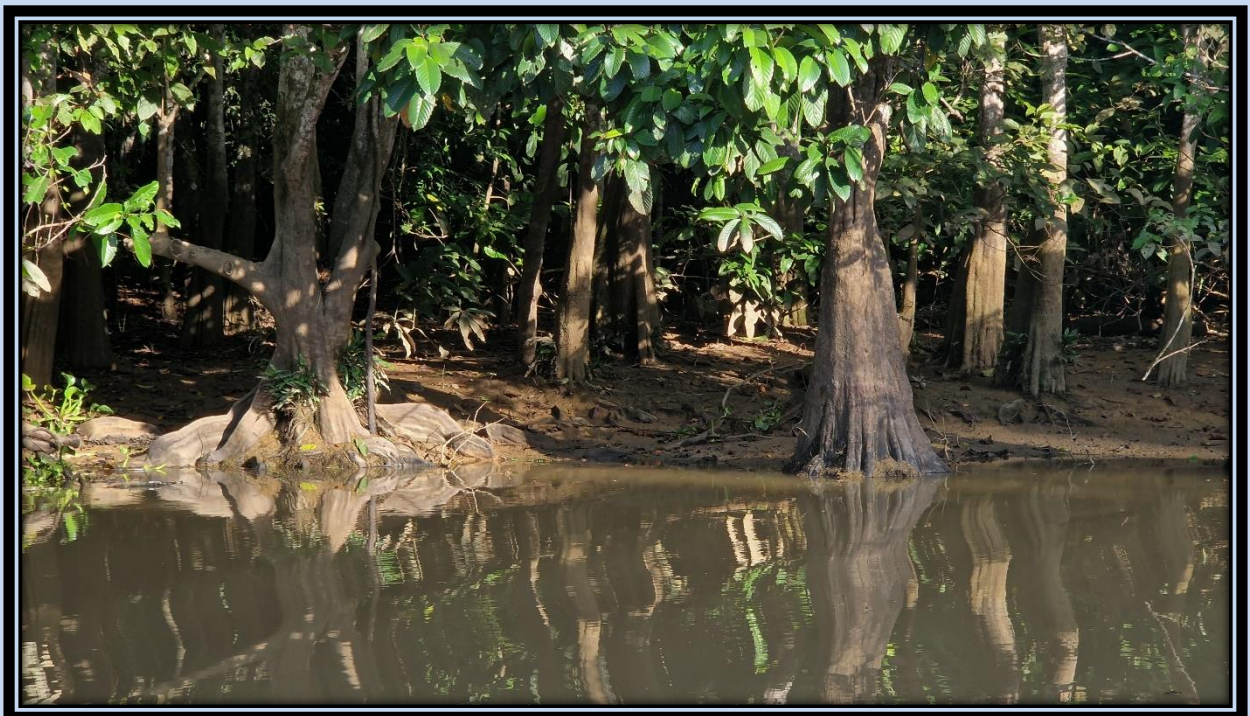
Perfect conditions for Flat-headed cat with very low water

Make sure you request Janu as a guide if you're goal is Flat-headed cat. If there is one around he will find it and he will go out with you almost as long as you want. I was the one who drag him back to the lodge and not the opposite 😊