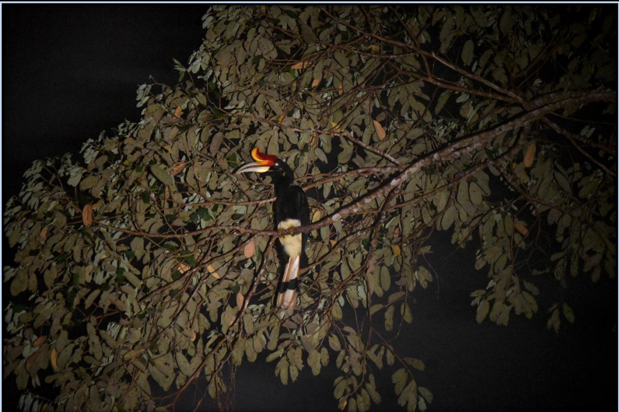
Rhinoceros hornbill sleeping at night – Danum valley