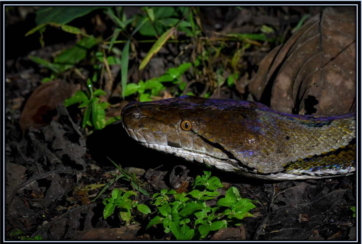
Reticulated python – Danum valley