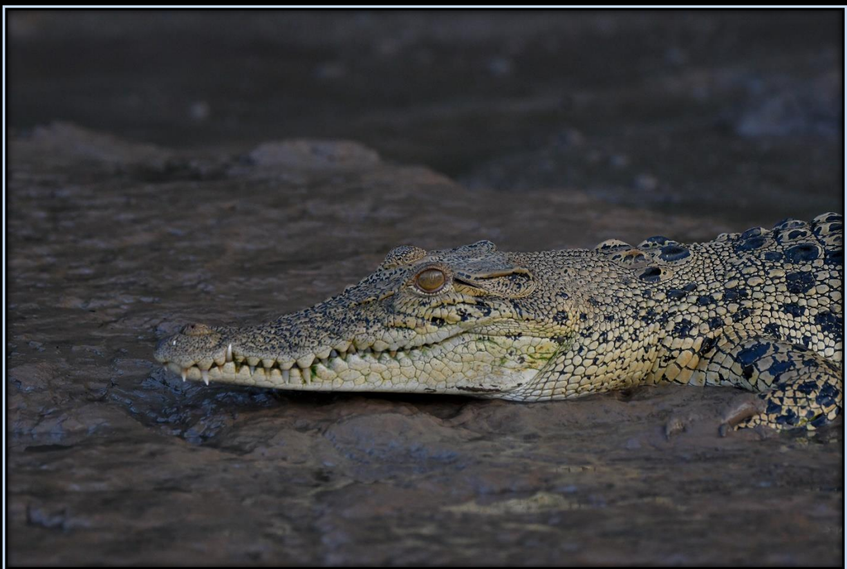
Saltwater crocodile – Kinabatangan