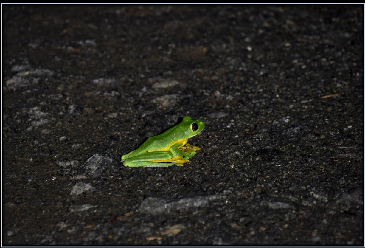
Wallace's flying frog a little lost on the road. The camouflage don't really work here... - Deramakot