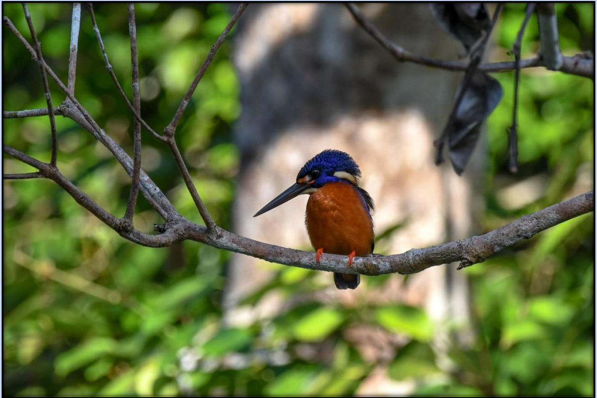
Blue-eared kingfisher – Kinabatangan