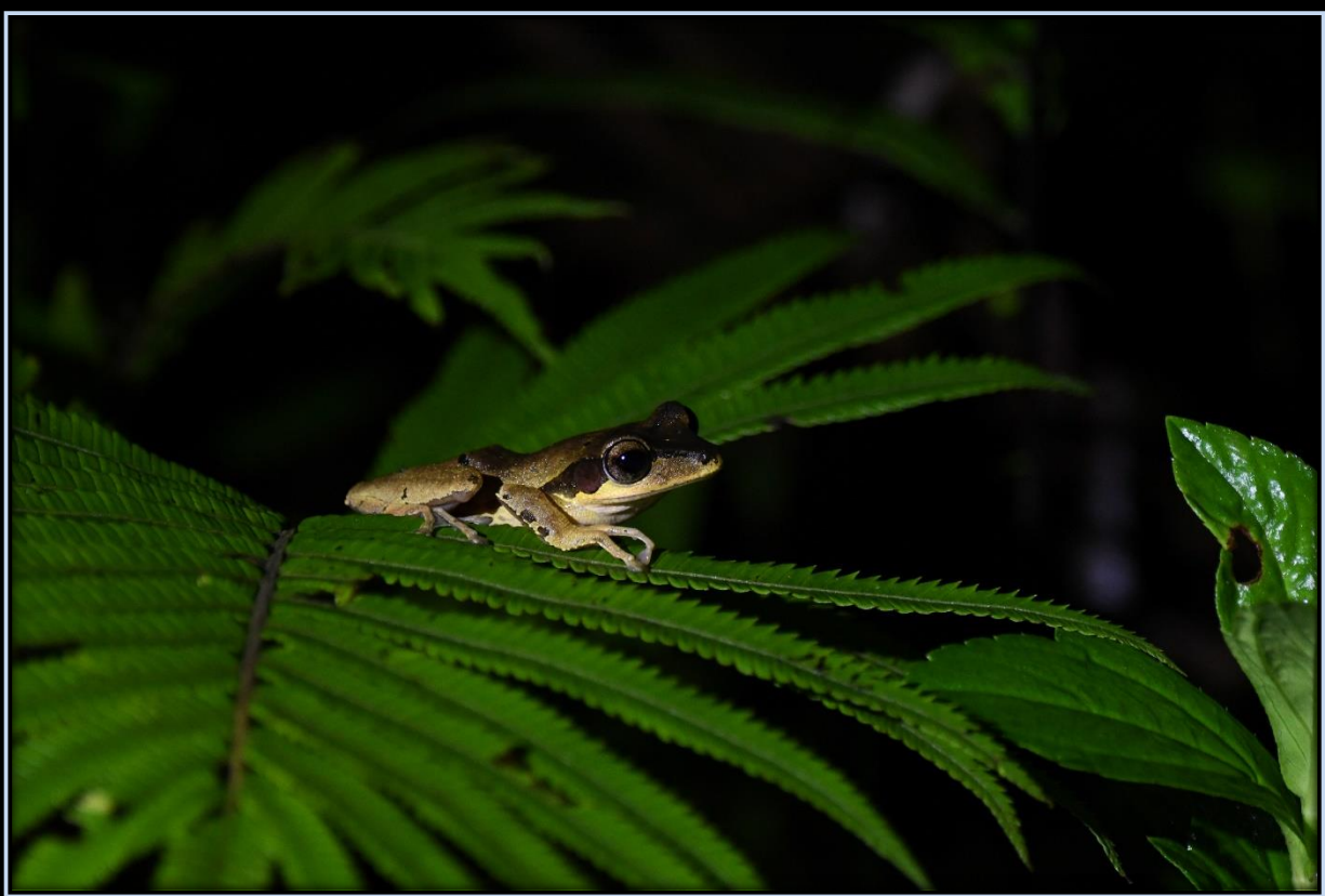
Dark-eared tree frog (Polypedates macrotis) – Danum valley