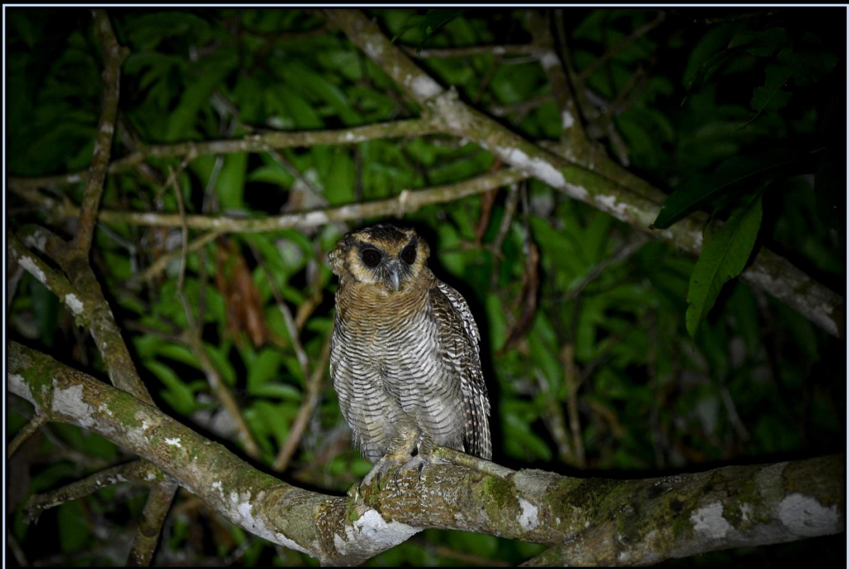
Brown wood owl – Danum valley