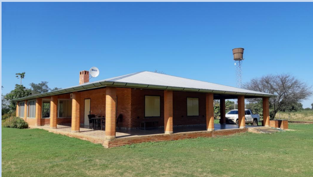
Typical environment in this part of Central chaco.

I had a lovely house to stay in with private room and private bathroom. Good WiFi and we had a lovely barbeque one of the evenings made by the staff from Estancia. This is a big private land with thousands of cattle but also 20% forest left and a good amount of wildlife around.