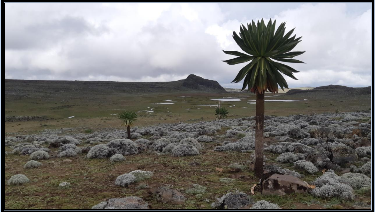
The home of Ethiopian Wolves

4000 mas high plateau. Home to Ethiopian Wolves. Sadly, the livestock have found their way to this remote place as well. And maybe even worse... dogs!