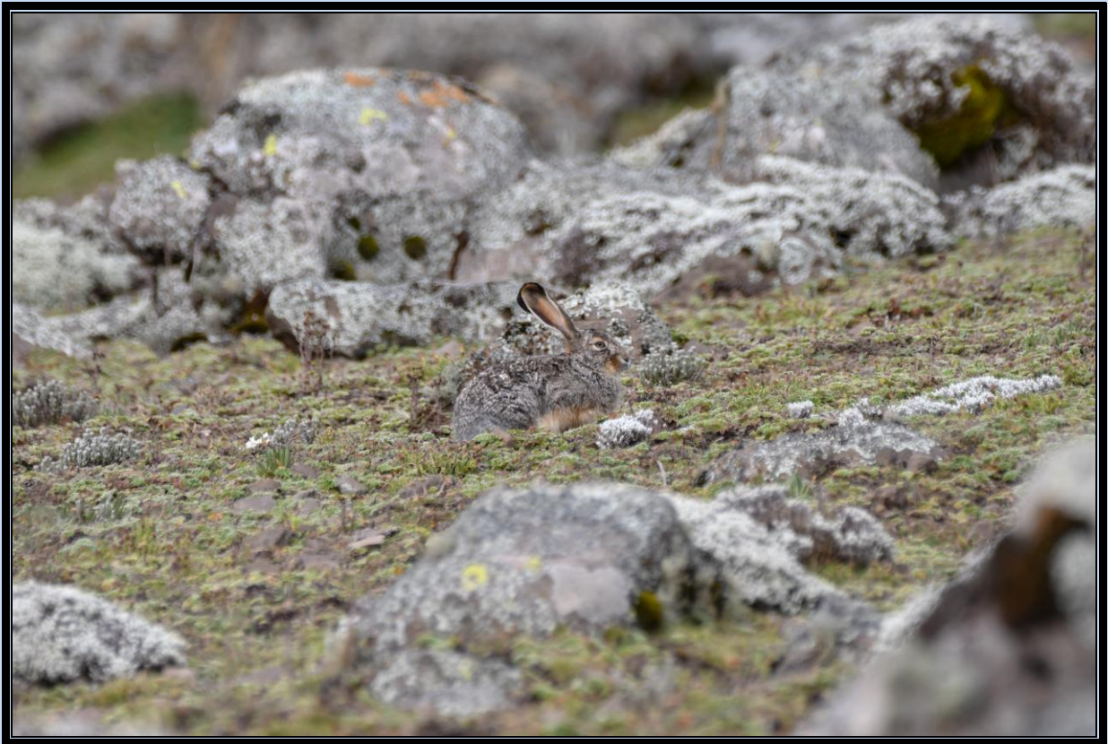
Very well camouflaged

22. Starck's hare --- Common on the Sanetti plateau. You just have to look very close. If you take a walk you will notice that some of the rocks aren't rocks... they suddenly start to move.