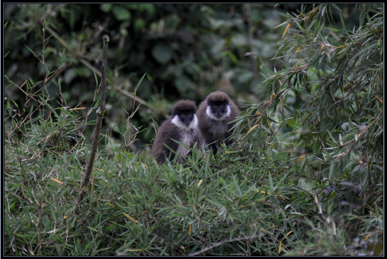
Bamboo is the place to find this endemic species

28. Bale monkey --- My most sought after species on this trip as it's distribution range is narrowed down to only Hareenna forest in the whole world. We struggled quite hard to get them. First afternoon, none. But on the second – just before dark – after involving five people in a “Bale monkey”-search we finally got close contact with a group eating bamboo.