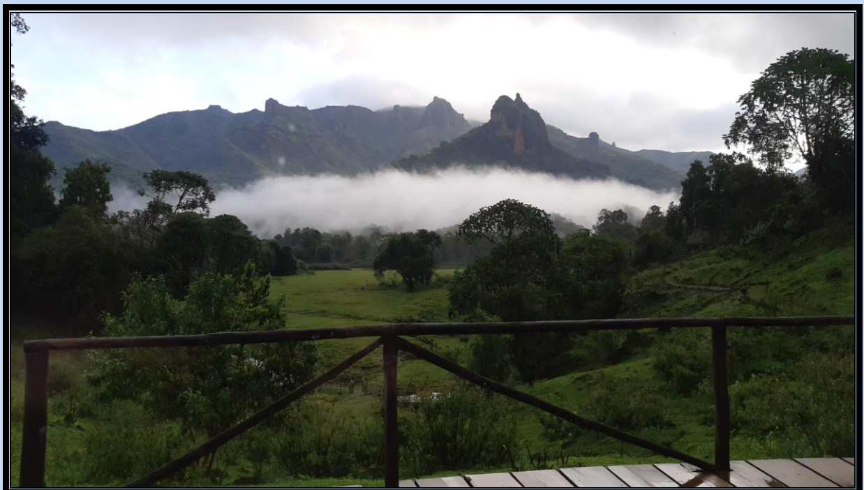
View from my veranda

On the “other side” of the plateau a forest spreads out – Hareenna forest. Still very much unexplored. Here you also find the lovely Bale mountain lodge which is pricey but in a perfect location to explore this forest.