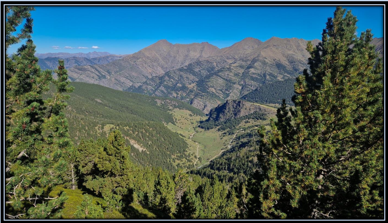
On the path to look for European mouflon. Such a scenic part of Europe – Andorra