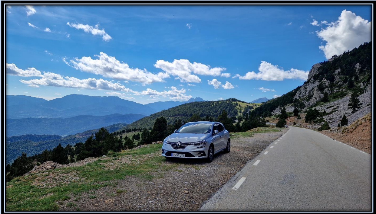
My car enroute to Andorra

Totally the opposite in Riaño and Cantabrian mountains. I believe that 80% of my time here was raining away with high winds, cold temperature and in short, awful conditions.