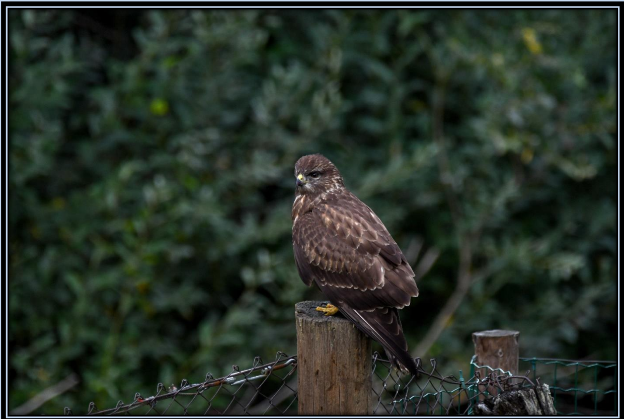
We need a bird in here as well – Common Buzzard , Riaño area

Thanx alot to all the ones who posts trip reports on mammalwatching.com , you make it way more easier to plan a trip :)