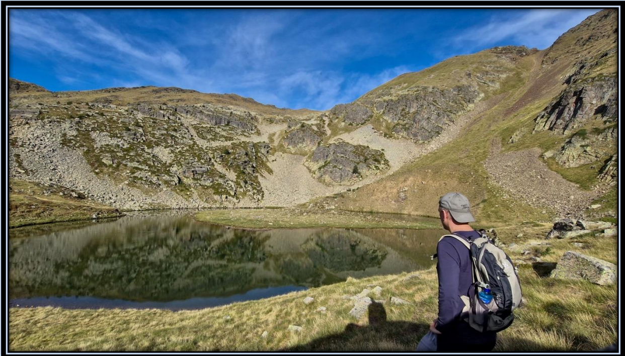
My hiking day in Andorra. This lake is called Estany del l'isla.

Looks very nice and it's good that your inner feelings doesn't make it on photos as the only thing I was thinking about was my bed due to sickness.