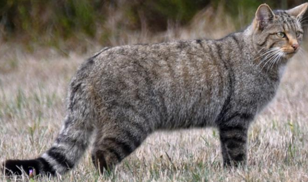
European wildcat – Riaño area, Spain