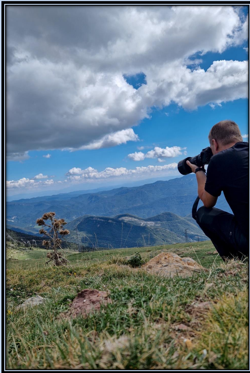
Me photographing Alpine marmots