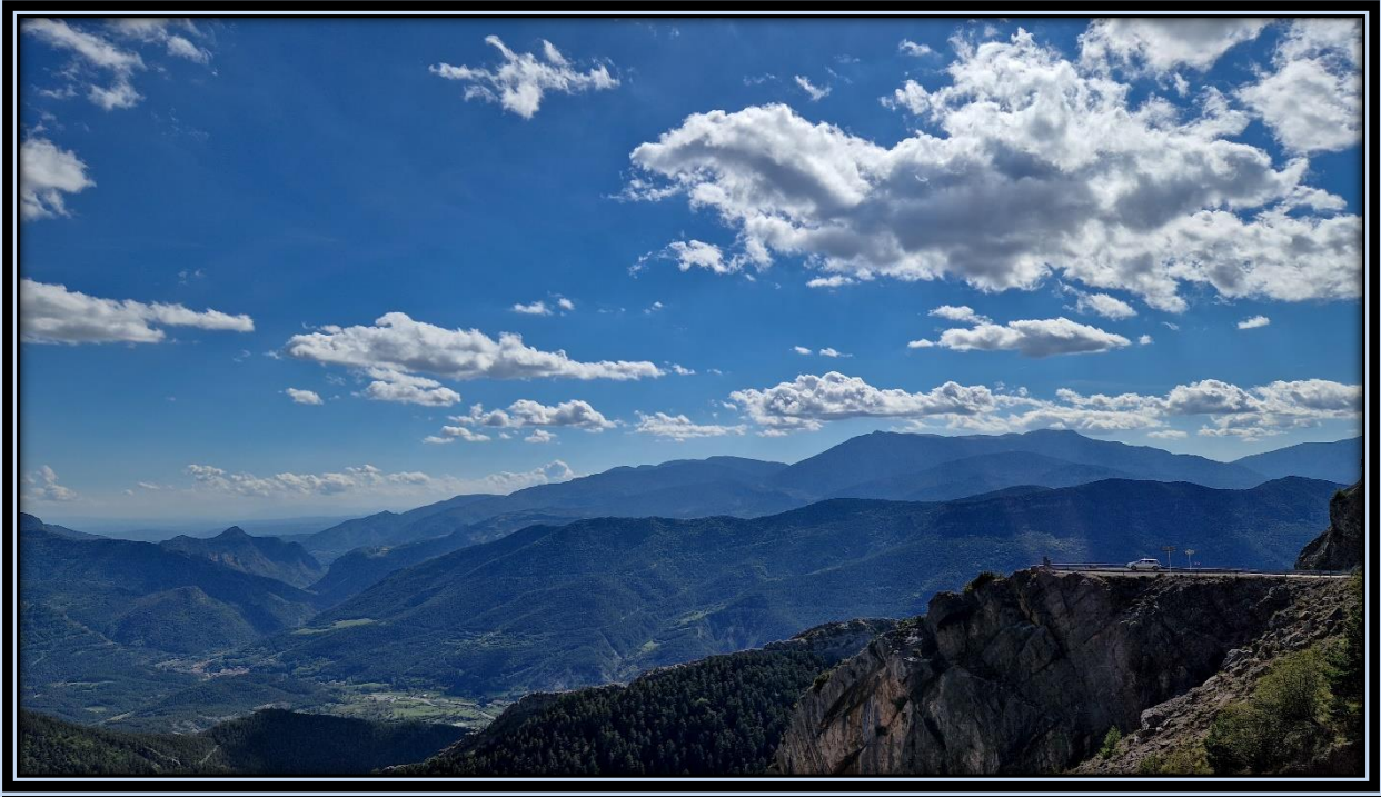
Beautiful Spain. Notice the car on the right. Such a scenic road.