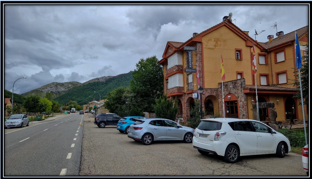
Hotel de La Reina

In Andorra my main goal was to find Pyrenean Chamois and European mouflon on one day and do a non mammalwatching hike the other and in Cantabrian mountains – Spain I did both nightdrives and early morning and afternoon drives as long it was possible because of the rain.