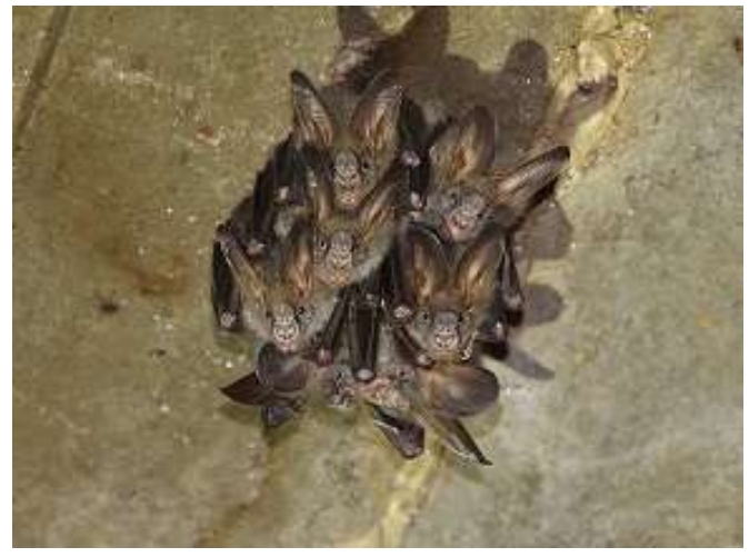
Long-armed sheath-tailed Bat