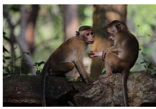
Sri Lanka Toque Monkey