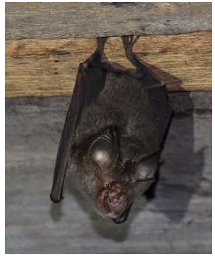
Rufous Horse-shoe Bat