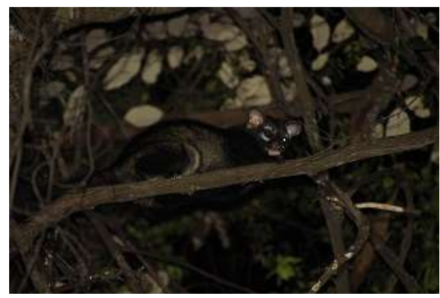
Common Palm Civet