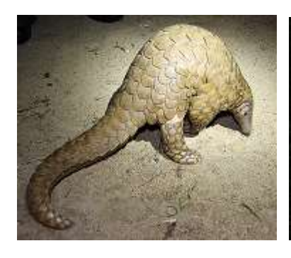
Thick Tailed Pangolin