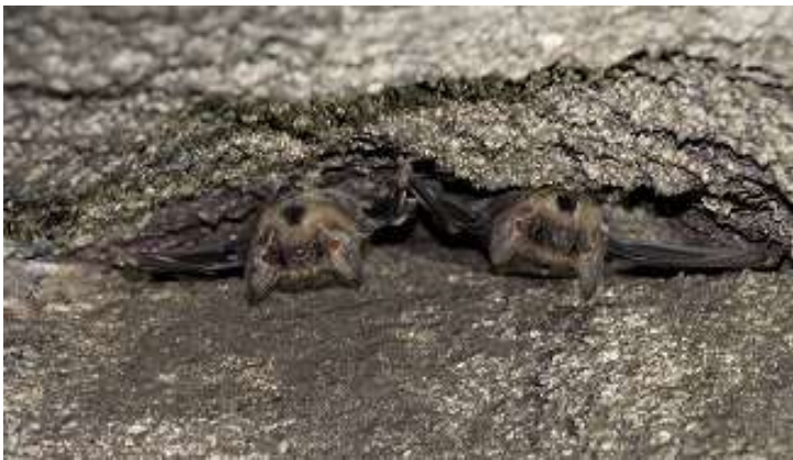
Lesser Woolly Horse-shoe Bat