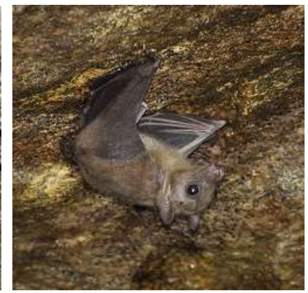
Fulvous Fruit Bat