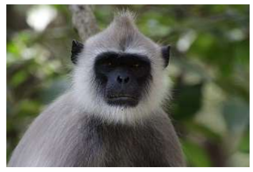
Tufted Grey Langur