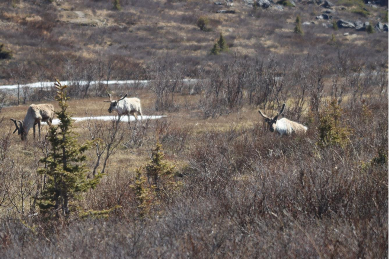
The turnaround point was Toklat River. Saw a few more sheep, ground squirrels, caribou and a few moose on the way back. No bears or Hoary Marmots.