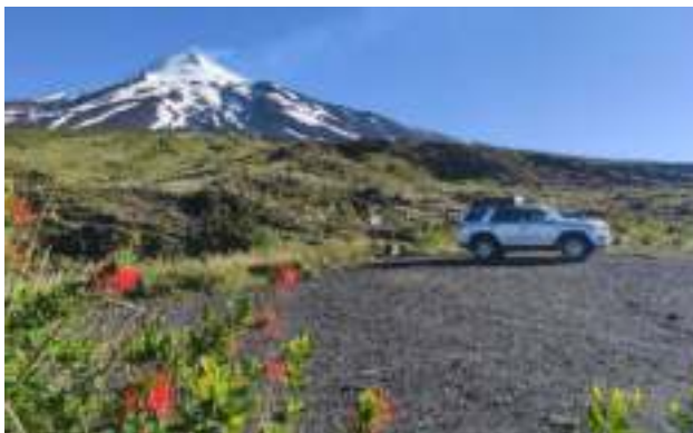
Volcan Villarrica at daytime

This is not the typical birding stop, but it will be a great location to include. Especially if you or your travel companions don't want to be birding the whole holiday this is a scenic place. Pucón is a nice little town with all the necessities you might need, but still small enough to have that nice vibe. On the north side of town there is a public beach where you can swim in the lake. The parks in the village are the best place to see Slender-billed Parakeets in the trees, and you will see them flying by multiple times when in town.