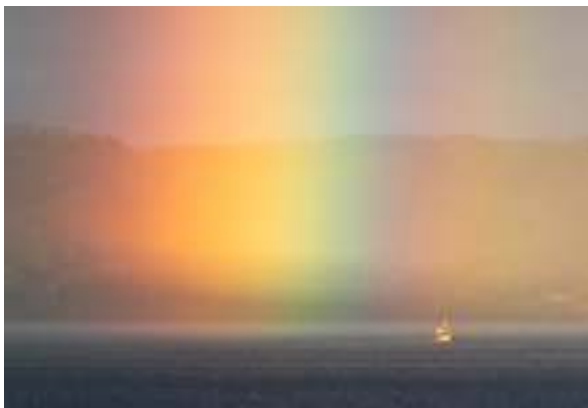
Rainbows at the Burmeister's spot

As we had some extra time to spare due to a delay with the boat from Castro – Chaitén, we decided to go to a spot that looked good for cetaceans (as I got it from a research paper). We drove all the way to the beach, but we would advise you not to do that without a 4x4 (we got sort of stuck). Drive up to this point ( -42.48782, -73.66975 ) and walk down to the beach. From this point we spotted 2 Burmeister's Porpoises with their unique dorsal fin within 10 minutes, and 8 (possibly more) Peale's Dolphins . We also had Black Skimmers feeding with their beak skimming the water (not uncommon on the island, but always beautiful to see). And besides that lots of waders, that mainly seem to concentrate in the northwest corner of the bay (Humedal de Pullao). In search of a better lookout we drove towards a small industrial harbour, which has a big parking in front of it ( -42.48984, -73.66058 ). This is a very good lookout, close to the sea, but with a little height to give you a good view over the sea. Also from here we saw Peale's Dolphins , but couldn't find any more Porpoises. The road towards this place is steep, but with two bands of concrete instead of gravel on the steep parts. As long as your car has some power in it, it should make it. Chilean Dolphins are reported along the coast as well, but less around this point.