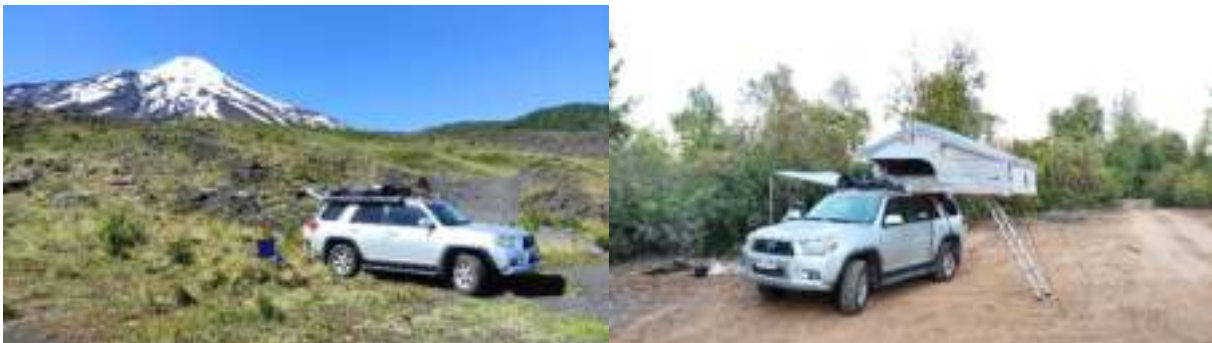
Our loyal friend Forrest at Volcan Villarrica

Our transportation in this trip report was of course our Toyota 4Runner SR5 4.0 2010 (2x4) called 'Forrest' (Run Forrest, Run... and it takes us to the.. well, you get the idea). We bought this car in Santiago and got it converted by a company so that we could sleep in it as well. We would recommend renting a car with high clearance for Southern Chile, because it drives really well and it gives you that extra clearance that is needed on some roads (not too many though).