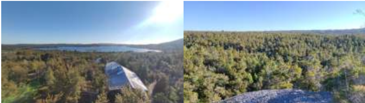
Tantauco Camping Area

amazing. You don't hear any city noises, cars or whatever and the only thing you see are lakes and forests! What a luxury!