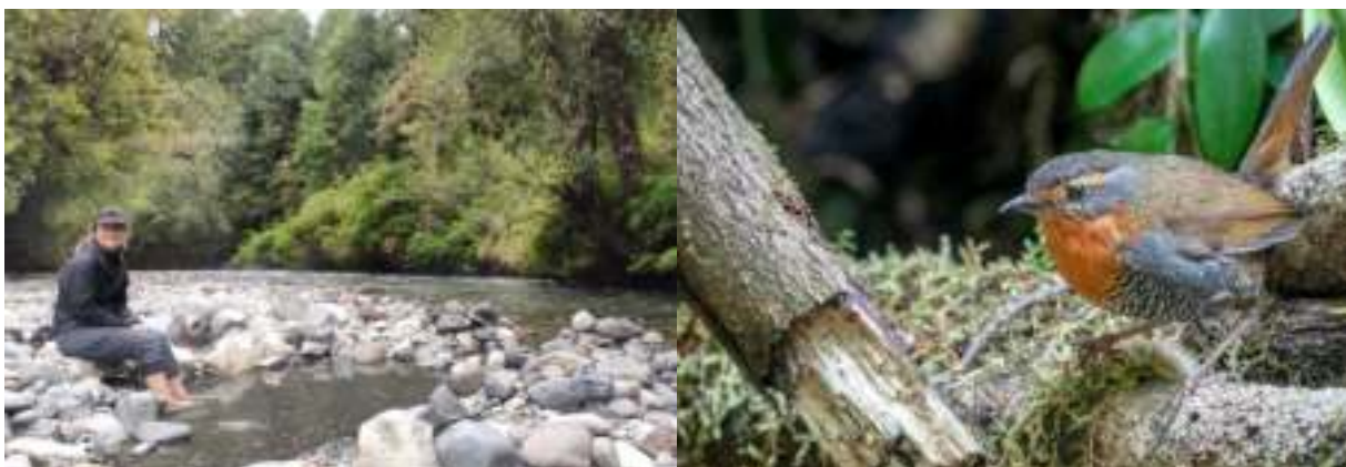
Thermal baths next to the river

The rest of the trail is a loop and was not really rewarding for us. There is one lookout at the river which has a small rapid, which is potentially a good place for Torrent Ducks . I just hope the ducks know this as well.