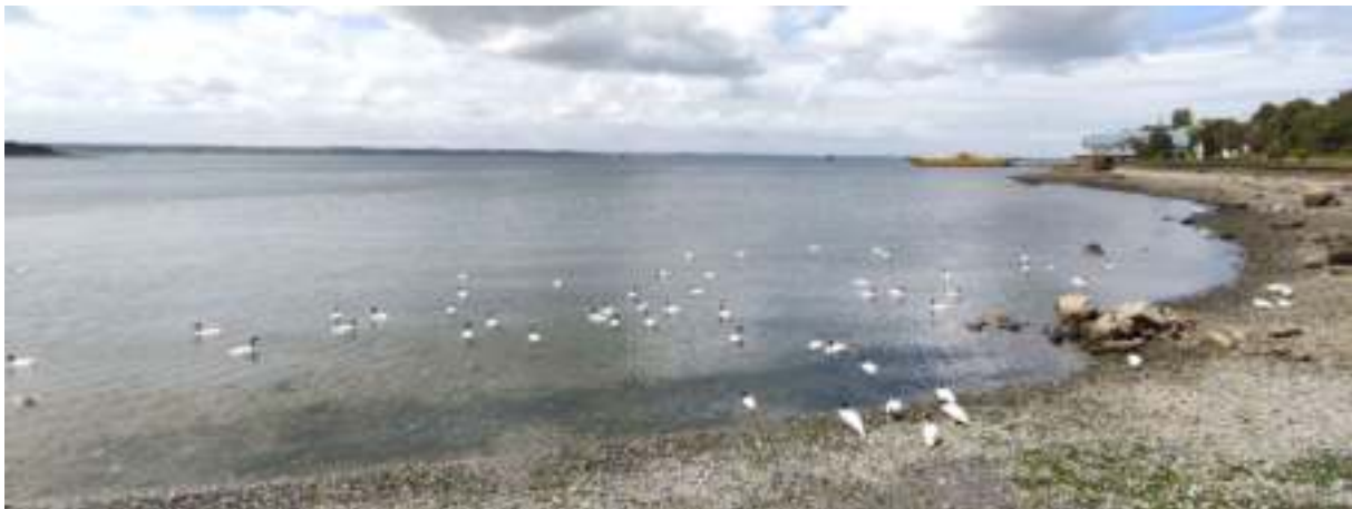
Black-necked Swans on the Chiloé side of the ferry crossing

The ferry is a good opportunity to get out of your car and spot some birds and mammals. As pedestrians can get on the ferry for free, we took it again going forth and back, leaving our car on Chiloé. We spotted 3 Pink-footed Shearwaters , 1 Magellanic Diving-petrel and several Snowy-crowned Terns , as well as more common species. Unfortunately we missed out on the Pincoya Petrels , which are sometimes seen in great numbers. We also saw multiple South-American Sea Lions and 3 Peale's Dolphins . Chilean Dolphins are seen from the ferry as well, but we didn't see them. We had more than 100 Black-necked Swans and 2 Flightless Steamer Ducks at the docks when we arrived. We drove towards the east coast and saw South-American Sea Lions and Peale's Dolphin from the shore as well.