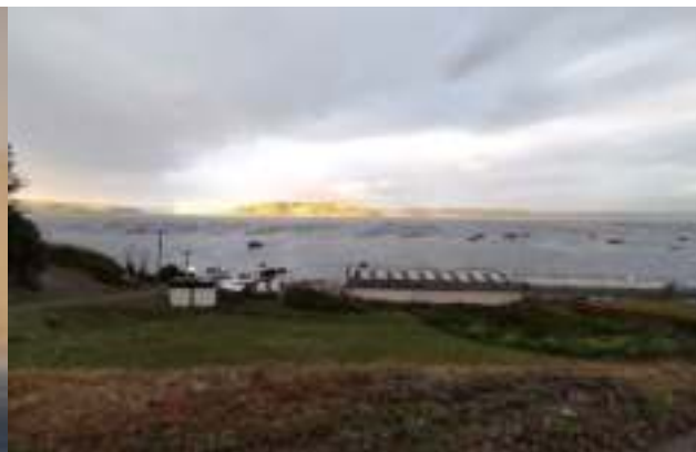
View from the second place (industrial harbour)