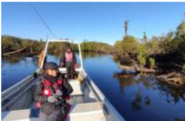
On the Chepu River searching for Otters

If you like my pictures, you are in luck: they are for sale! For publication, presswork or just as artwork in your office or at home. A great memory of those great species you've seen during that trip! We donate 10% of our profits to WWF. My photos can be used for free for conservation or educational purposes after consultation. Have a look on my website or contact us via the website for the possibilities if you are interested: www.robjansenphotography.com/shop