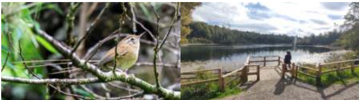
Des Murs' Wiretail

After you pass Lago Toro there is a small parking spot on the right hand side of the road with a sign next to it. This is the start of the trail to Lago La Paraiso. We recommend just walking the first (easy) 900m of this trail ( -40.77971, -72.27205 ), or if you are feeling optimistic the first 1,7km till the bridge crossing the stream. After this the habitat changes and birding-wise it's not really interesting anymore. The trail also gets more moderate. On our way in we stopped almost every 50m because there was a Black-Throated Huet-huet calling next the trail, or another Chucao Tapaculo (we saw like 10 of them) had crossed the path again. Magellanic Tapaculo was heard multiple times as well, and seen once. We also had 3 Des Murs' Wiretails in a bamboo patch right next to the path, while a Huet-huet was calling for attention from the tree next to it and a Chucao was 'miaowing' from the shrubs next to us.