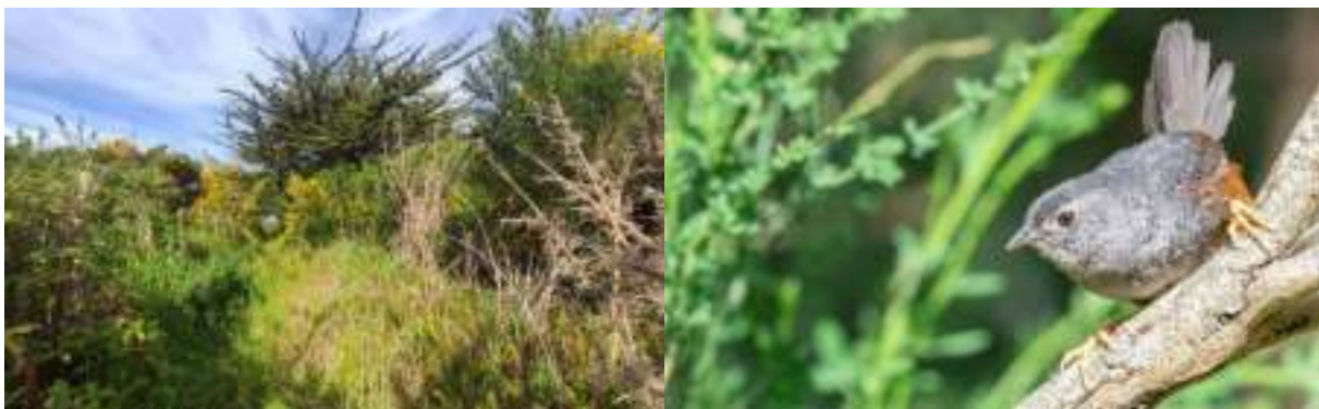
Ochre-flanked Tapaculo habitat