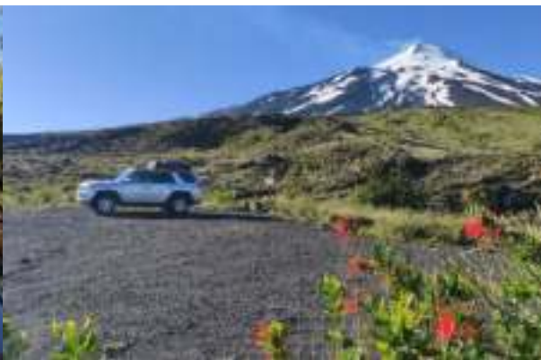
Sleeping next to the Villarrica Volcano