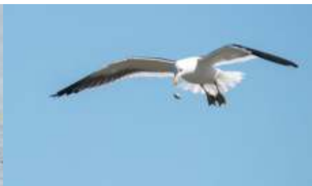
Kelp Gull dropping a bivalve to break it