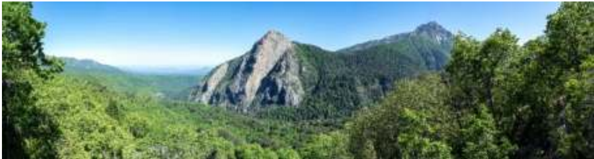
Panorama view at Sendero Aliwenmahuida

Austral Parakeets flying from the lookout. After all, this trail took as 2,5 hours, including long photography stops for some birds and at the lookout. Sendero Aliwenmahuida will end at the main gravel road, where you go left to the camping area.