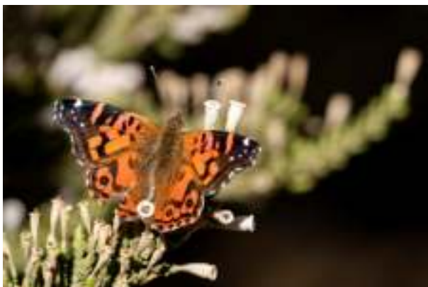
Western Painted Lady

Once you arrive at the camping area you will see a staff building and the bathrooms (baños). Behind the baños you will find the camping area (closed due to Covid when we were there) and that's the place where the Sendero Los Concones starts. The trail is easy walking (small steeper parts) and is about 600m long and takes about 0,5 hours walking (longer for birding of course). The forest at the camping area is good for Striped Woodpecker . We also had Northern Painted Lizard Liolaemus septentrionalis here. A bit further you enter forest with huge trees again, and that is where we found our first Carpintero Negro: a female Magellanic Woodpecker . From the first lookout we heard multiple Chucao Tapaculos in the valley below (look up the beautiful sound and you will recognise it immediately). Just after the second lookout we heard some scratching again between the entanglement of bamboo and shrubs. We sat on the ground for about 1,5 hours and only Romy got to see the Chestnut-throated Huet-huet for about 2 seconds. We heard them calling twice. Not a very fulfilling sighting, but exciting nonetheless.