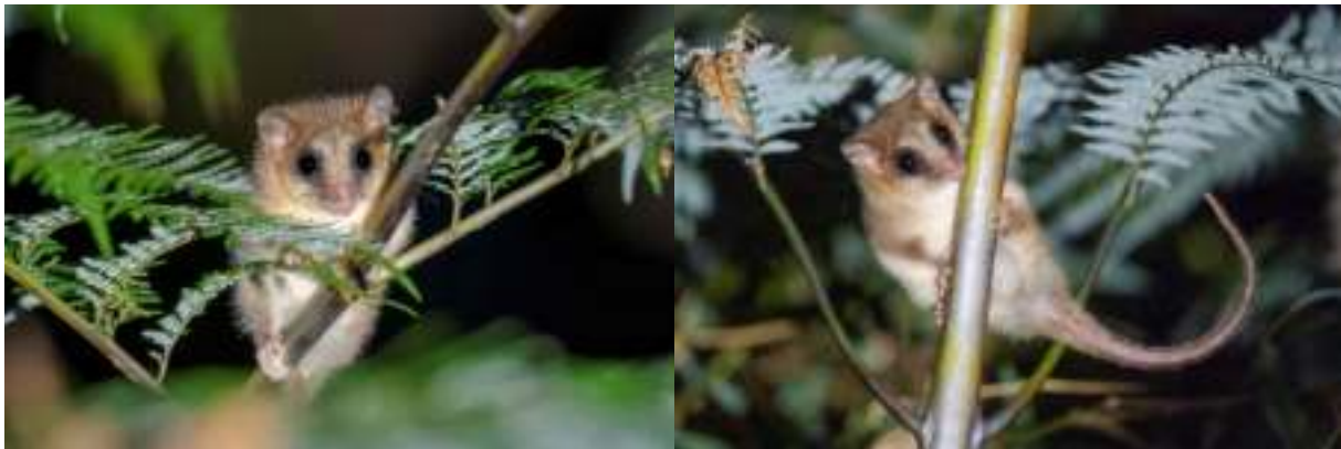
Monito del Monte

instantly that we finally found our first (identifiable) Monito del Monte ! What a small, cute fellas. We walked back and went on the main road towards the lodge but saw only Pudu. After 2 hours of walking we decided to spotlight by car to cover more distance. We spotlighted towards the T-intersection about 400m from the lodge, and then back to the entrance of the reserve, and the same another time (20km/2h). We had a total of 9 Southern Pudu sightings this evening, but no foxes or cats. Frustrating how easy it seems in some reports (multiple foxes crossing the road within a km of the lodge or foxes sitting at guard stations...). We were not sure if those people were just really lucky, or we were unlucky. The beginning of December might be less good because the cubs still have to get out or stay close to the den (so numbers will be higher in February/March). That said, reading the trip reports again it seems like most sightings were around the Tepuhueico lodge or in the area around the first gate at Tantauco. Maybe Covid has made the foxes less dependent on people and food, and they tend to hang out less around these areas nowadays. Alex said he hadn't seen any Zorro's around the lodge and said they tend to be more around the area of the parking lot we stayed at. He was only working here for 3 months yet, but he had seen Darwin's Foxes and Kodkod once.