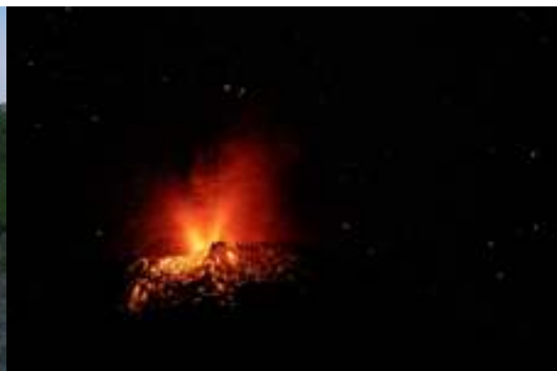
Erupting Volcano Chillán

We had a drawing from an older report of a trail going south 500 meters past the police office ( -36.91391, -71.46906 ). We found all the reference points like the big tree stump, but couldn't find a