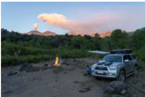
Camping place at Termas de Chillán

This place started out well, as we arrived at night and saw a Culpeo crossing the road right at our camping site ( -36.91668, -71.44247 ). Band-winged Nightjars were flying above the camping spot as well and an Austral Pygmy Owl was calling from the nearby trees. At the small road leading from the big flat area towards the above camping spot we had Patagonian Forest Earthcreepers 2 out of 3 mornings we were there! The camping spot is highly recommended if you have a 4x4 or 2x4 with high clearance. It is right next to a river, with lots of firewood to make a fire (be sure to throw lots of water on it afterwards, as the surrounding forest is so dry it will burn quickly). You will have a view of the volcano, which is one of the more active volcanos in Chile and it erupted when we were there! Check this website to see how active it is now: www.volcanodiscovery.com/nevados_de_chillan.html