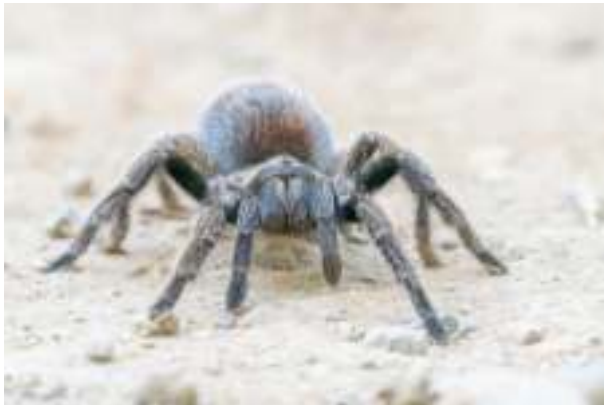
Tarantula crossing the road

The walk was nice and because the road is quite broad it is easier to see birds higher up in the trees as well. We had Chilean Flicker in a tree, White-throated Treerunners and Thorn-tailed Rayaditos flying from tree to tree and we saw Austral Parakeets flying over. Not much else, except for butterflies like the Western Painted Lady. At the second gate we had a Tarantula crossing the road! Most likely the endemic Euathlus manicata .