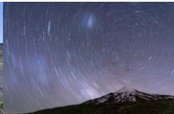
Volcan Villarrica at night

A nice trail to bird if you are here is Sendero los Crateres. It starts more or less where we camped ( -39.37788, -71.94606 ). You will leave the good forest and enter low vegetation. Birding-wise there is no reason to continue any further than this. If you want to see a beautiful view, then walk up to the first viewpoint though. The second viewpoint shows some old small lava tunnels and air bubbles that escaped from it. Nice geological formations, but not worth the walk in our opinion.