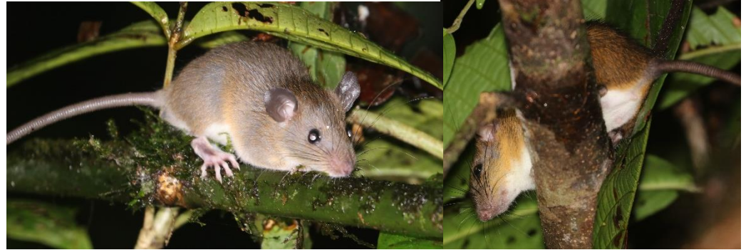
Dark tailed tree rat (Niviventer cremoriventer) – Juvenile on left, adult on right. confirmed by Quentin Phillipps

The night before the official start of the tour, Jens, Jason and myself met up at Tawau and were taken to a 4-hour spotlighting session of the lowlands. Before even leaving our hostel 15-min outside the park, I thermal scoped a large-ish flying squirrel , but we never got a good look at it to be able to ID it. As soon as we reached Tawau headquarters, I thermal scoped sleeping Long-tailed macaques , which were the first "official" species of the trip. Throughout the spotlighting session, we saw Dark-tailed tree rat (Juvenile and later an adult), an Oriental dwarf