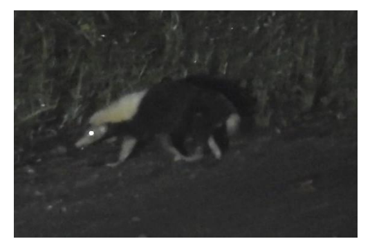
Sunda skunk (Mydaus javanesis) – video snapshot

Malay porcupine – <u>night</u> 8 – after not having seen