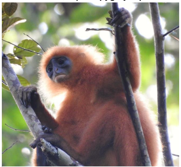
the trail, but all we got Maroon langur (Presbytis rubicunda)

Pittas calling near the trail, but didn't see it. I decided to stake out the otters but didn't get lucky. Before heading back, Mike also spotted a snake crawling right near the trail but all we got