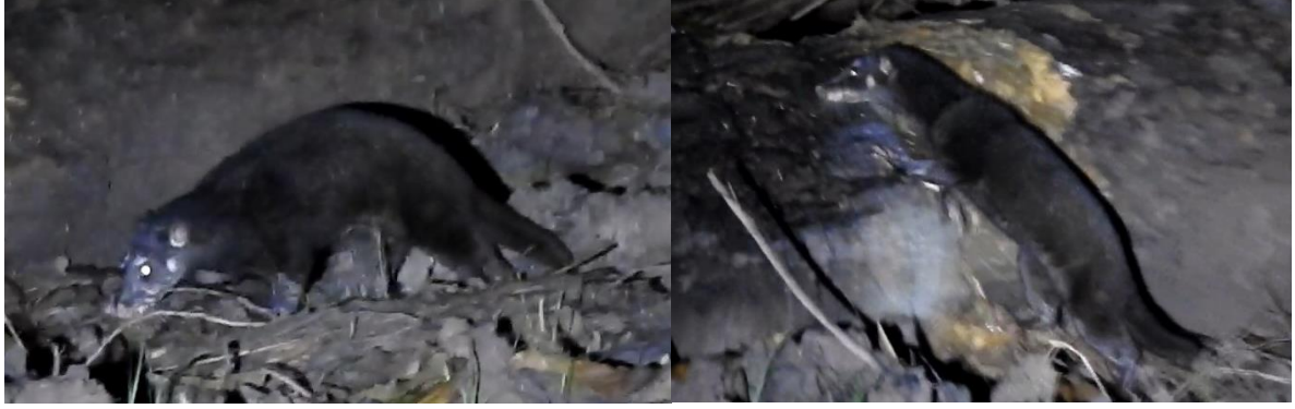
Otter civet (Cynogale bennettii) - snapshots from a video

Otter civet – only seen on <u>night 5</u>, but strangely, seen twice on the same night, 2 separate individuals spaced at least 9 km and 5 hours apart. The first one was a very brief sighting on our way out, around 19:00-ish. It was around K6, of an individual in dense vegetation, where we