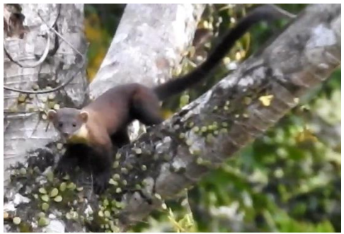
Yellow-throated marten (Martes flavigula)

Banded palm civet - surprisingly only seen on nights 1 & 2 Yellow-throated marten – afternoon drive of day 2, a