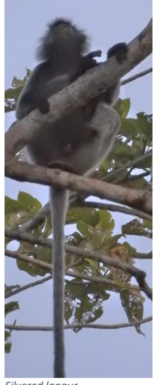
Silvered lanaur and I asked almost simultaneously "Was this a moon rat?" But Mike assured us "No, it was just a

After dinner we went out on a night boat ride. We decided I would use the thermal scope carefully, since we knew the trees were going to be exploded with sleeping monkeys. And they were! I would just look through my scope, but not say anything unless I saw something I suspected was exceptionally interesting. During the night trip we saw our first Island palm civet, another slow loris, a few salt-water crocodiles, Malay civets and probably a leopard cat. Throughout the evening, I called the guides to stop the boat for mammals I saw on the shore, but the first few were rats: really big ones, and smaller ones. We didn't stop to ID them for the lack of time. One looked exceptionally white, so both Jason (Trachypithecus cristatus)