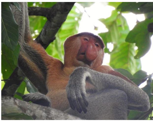
Proboscis Monkey (Nasalis larvatus)

We only spent 1 night on the Kinabatangan river, in hopes of finding a flat-headed cat. One shotone kill. And long-story short - we didn't see one. Well, we probably did see one, at least the eye shine of one. But not enough to ID it. It was really too bad, considering we had perfectly low river levels, and supposed perfect conditions for finding it. In fact, both our guides (Mike and the local guide from the lodge) think we saw one.