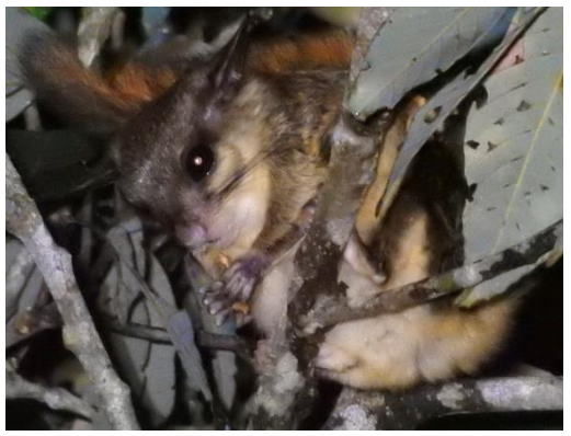
Horsfield's flying squirrel (Iomys horsfieldi)

that goes around the valley and ends up at the restaurant, while Jo and I decided to try another spot where people reported seeing Whitehead's, before heading to breakfast. But we didn't find one. I seriously just thought to myself "we should stop chasing other people's 'old' sightings because it hasn't been working. Let's just go to breakfast, and I bet one will just show up on the trees across the restaurant as we eat". I kid you not – I imagined the squirrel coming to this tree across from the restaurant that's visited by squirrels every morning. 20 minutes later, as I was getting my round of fresh fruits I saw Jo taking a picture of