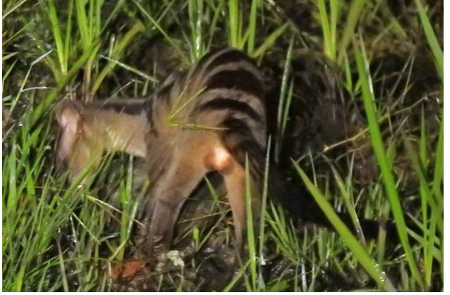
Banded palm civet (Hemigalus derbyanus)

One thing that has changed since last time, is