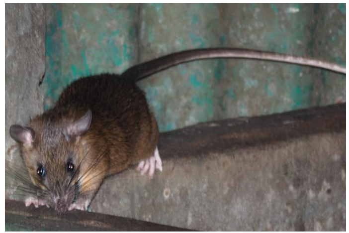
Maxomys Spp. (Whitehead's Maxomys?)