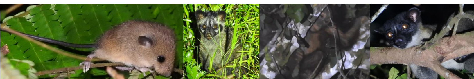
Ranee mouse (Haeromys margarettae), Island palm civet(Paradoxurus philippinesis), Bornean orangutan(Pongo gygmaeus), Striped palm civet(Arctogalidia stigmatica,

hasn't shown up over the past 20 years in over 50,000 trap nights all over Sabah! It also hasn't been recorded in this altitude, but Quentin Phillips himself identified this species for me, based on Jason and I's pictures. 20 minutes later, I also scoped what I thought would have been a <u>tarsier</u>, based on the height and position on the side of a tree pretty far off the trail, but we were never able to locate it with our torches, unfortunately.