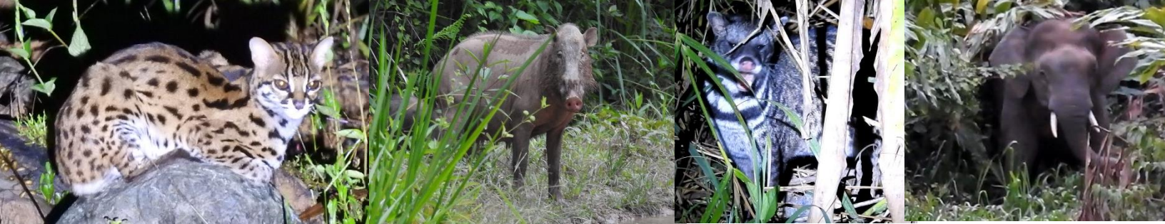
Deramakot 'commoners': Leopard cat (Prionailurus bengalensis), Bearded pig (Sus barbatus), Malay civet (Viverra tangalunga), Bornean elephant (Elephas maximus)

civet, we saw our only Orangutan s of the trip, which I found in the thermal scope. It was a sleeping mother with a baby, and we had decided not to disturb them, so we planned to get there around dawn the next morning, but they were already gone, unfortunately. We marked the area very well, so we knew we were at the right place.. Oh well.