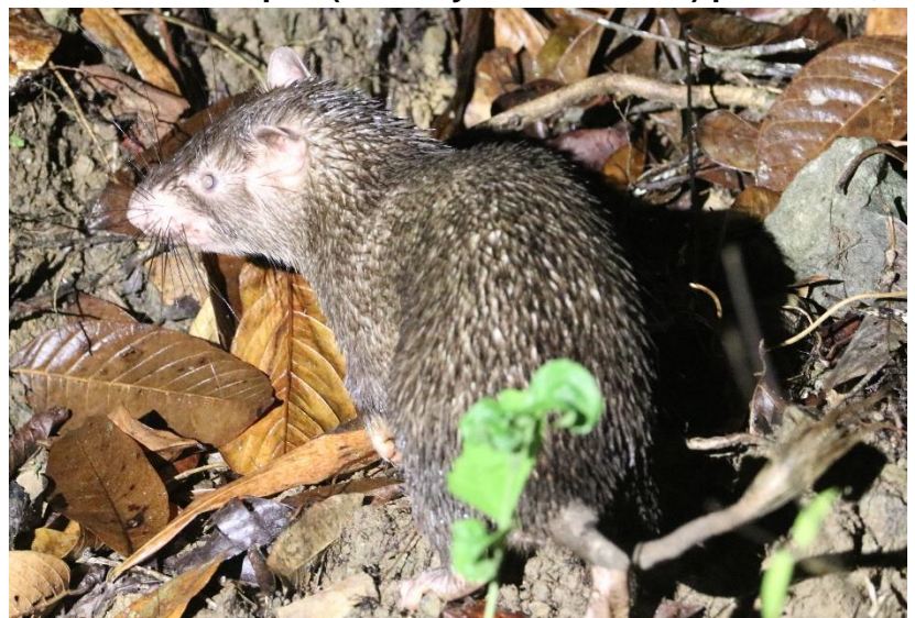
Long-tailed porcupine (Trichys fasciculata)

dark-headed cat snake, an unidentified rat that I thermalscoped on a tree to the side of the road, our first of many buffy fish owls, and finally - another long-tailed porcupine - making it two nights in a row for us! Mike was really curious about the rat we saw, saying it had a weird looking face, and that it's very close to where history's only Emmon's tree rat has been captured. Of course we aren't suggesting we saw the world's rarest rat.... but it's a nice, curious thought 🐵