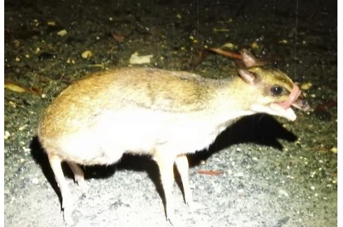
Confused lesser mousedeer (Tragulus kanchil)