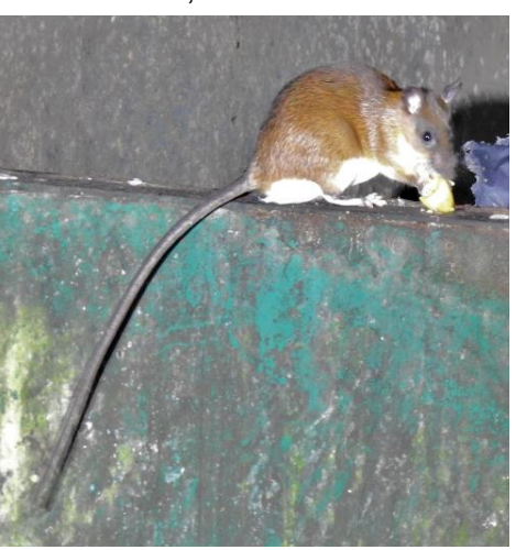
Sabah Giant Rat (Leopoldamys sabanus)