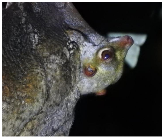
Bornean colugo (Galeopterus borneanus)

As Mike will tell you – if you go to Deramakot (even in the "driest" season, which can turn very wet, very quickly) for 3-4 nights and expect to get clouded leopards, marbled cats and sun bears – you may get disappointed.. These animals can still be very hard! Long-story short, we didn't end up seeing a clouded leopard in 10 nights, despite being out for anywhere from 7.5-10 hours each night, plus a crazy early start every day at 5:30, going until 10-11am-ish. Our hours were insane. Though a clouded leopard was seen the night before we arrived, and 3 nights after we left (by Lennart, Stuart and Nick's group). I always try to "maximize" my success by researching the