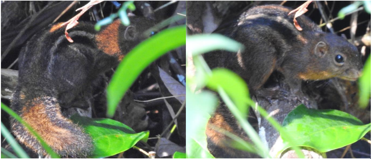
Four-striped ground squirrel (Lariscus hosei) - there are very few photographs of this species anywhere

only saw its face, though it was very close and readily identifiable, but it quickly turned around and disappeared for good. Miraculously, a 2^{nd} individual showed up on our way back around 11:30-ish, on K15 right where the loggers park their tractors. It was a perfect sighting for this species, as this individual was initially drinking, and then walked away nonchalantly out in the open, climbing a fallen trunk at one point where we could perfectly see it in its entirety. Four-striped ground squirrel – morning of <u>day 6</u> (only seen by Jens and me) after having seen some more "regular" squirrels – Jens spotted this ground squirrel in the dense bushes. After examining the pictures, there is no question that this is the rarely-photographed endemic four-striped ground squirrel.