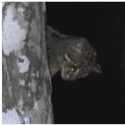
Marbled cat (Pardofelis marmorata)

sighting along the main road on a naked tree lasted almost a full minute, which is relatively prolonged for this spastic animal. Marbled cat - on night 3 – Mike skillfully found an individual peeking its head out