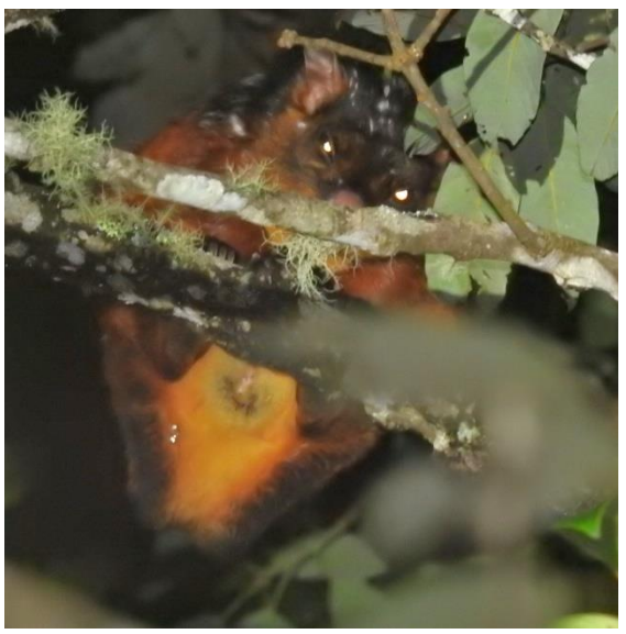
Spotted giant flying squirrel (Petaurista elegans)

After dinner the rain let off, and we were out. It was pretty cold, but we saw a few Spotted Giant flying squirrels , with Mac having found the first one, and me scoping the rest. Since the road is