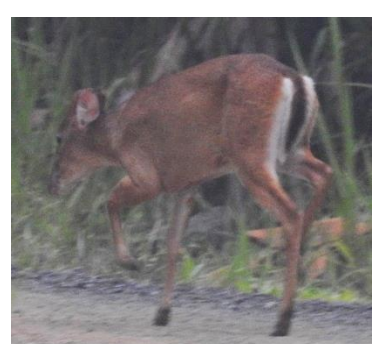
Yellow Muntjac (Muntiacus atherodes)

Large Pencil-tailed tree mouse on the same night as the Marbled cat. I got a recognizable video of it. Also on <u>night 5</u>, only a couple of minutes after our encounter with the second otter