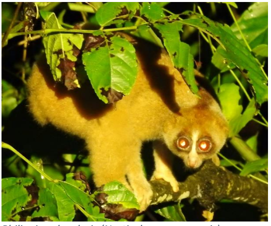
Philippine slow loris (Nycticebus menagensis)

Jason opted to stay in the valley and skip breakfast and lunch, and would meet back up with us upon our return. During the extra time in the valley, he saw more <u>langurs</u>, some <u>squirrels</u> and <u>long-tailed macaques</u>. The rest of us had breakfast and I had a long nap, while it rained for a good portion of the day. After lunch we drove back down to the valley