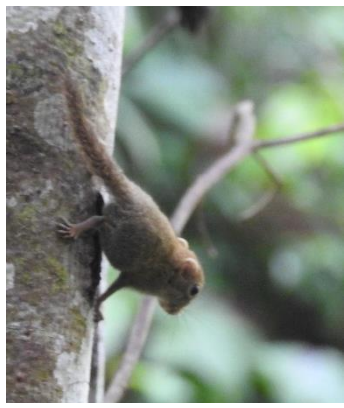
Plain pigmy squirrel (Exilisciurus exilis)

all-over the trees next to the hanging bridge. We decided that we would hike one of the trails, and then go back for breakfast at Infapro, coming back after lunch for afternoon exploration. Before leaving, the group hit one of the trails that goes to the other side of the river, and saw both Scarlet-rumped and Diard's trogons , and heard one of the