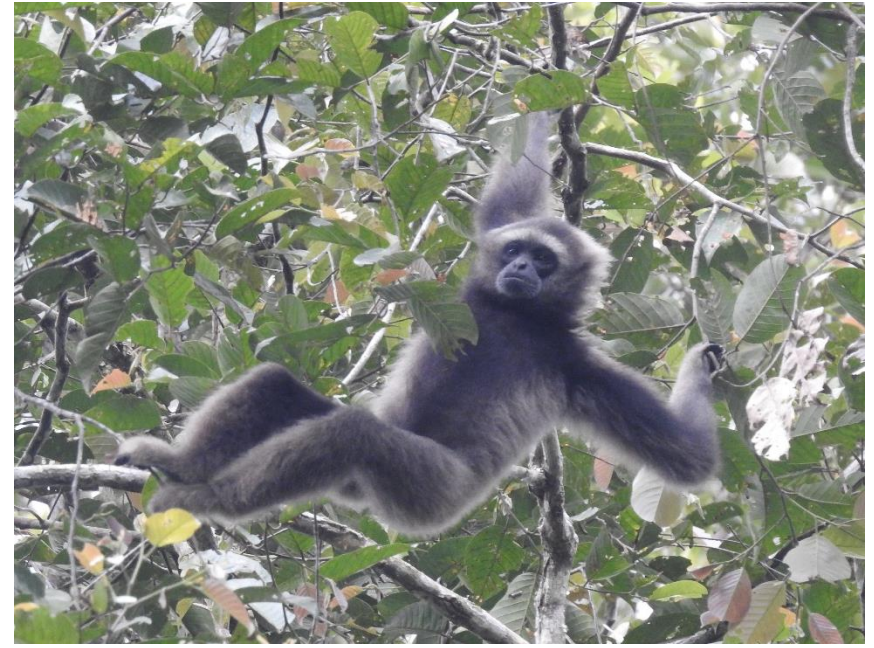
d North Borneo gibbon (Hylobates funereus), Tawau HQ

habituated Long-tailed Macagues and North Bornean Gibbons. We were also told that there were two sightings of Tufted Ground squirrels during the time we were up the mountain, between Km 3-4 along the main trail, including this morning. I guess that seemed like a good place to see them, but I just don't see when someone would be in that area during the prime time of the morning, unless they pretty much ran up the first few km, as the porters do when carrying up the bags and supplies. In fact, it was the porters who saw the tufted