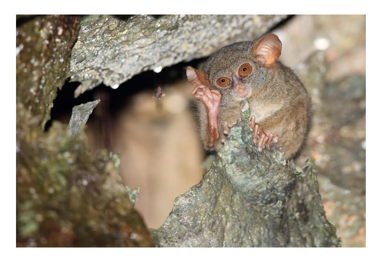
24 HOURS IN BANTIMURUNG NP, MAKASSAR SULAWESI

With a very short stopover in Makassar on my way to West Papua, mostly to pass the Jetlag, I had the chance to see some mammals in the Bantimurung NP. Its located near the Makassar airport and the drive to the place doesn't take much longer than one hour.