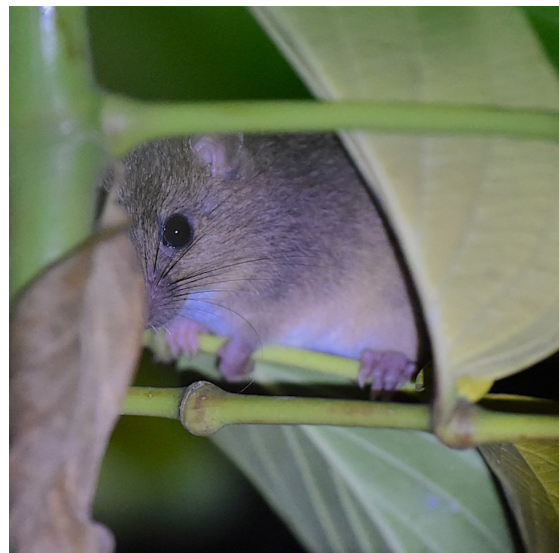
Rotschild's Cuscus and Obi Melomys

Seram: 3 nights, spending few hours at night, delivered Temmincks, Moluccan, Black-bearded and Seram Flying Foxes, loads of Nyctimenes sp, Northern