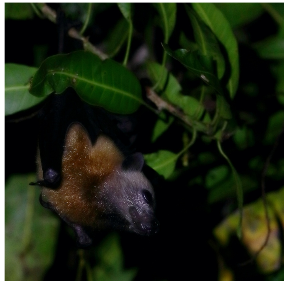
Blue-eyed Cuscus and North Moluccan Flying Fox