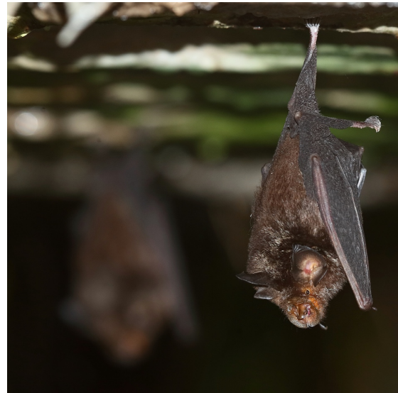
Temminck's Flying Fox and Arcuate Horseshoe Bat

Buru: 3 nights, spending few hours at night, delivered very similar results than Seram, though no Common Spotted Cuscus or Nyctimenes but here was the only place where we had good views of Moluccan Bare-backed Fruit-bat.