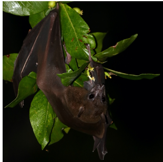
Moluccan Flying Fox and Halmahera Bare-backed Fruit-bat