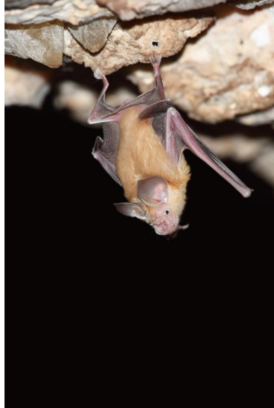
Egyptian Slit-faced Bat and Geoffroy's Trident Bat

Geoffroy's Trident Bat- Hundreds in the Hidden Cave, near Riyadh