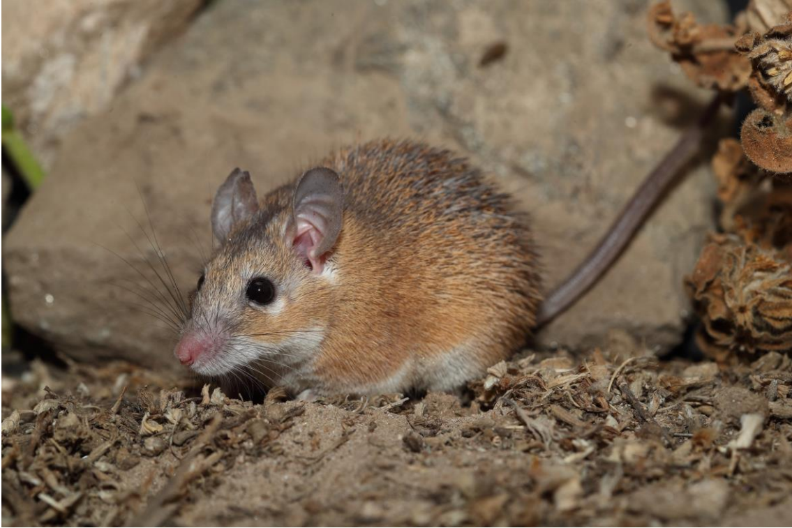
Arabian Spiny Mouse, Tanomah

I had a short-5-days-trip to Saudi Arabia, mostly to the mountains and lowlands of the SW and pretty much for birding, but I still managed to see a 12 species of mammals, including few interesting ones . Worth to say that it's fairly easy travel around but as my visit was during Ramadan, I had some problems to find accommodation and food, so I can recommend not to travel there during Ramadan.