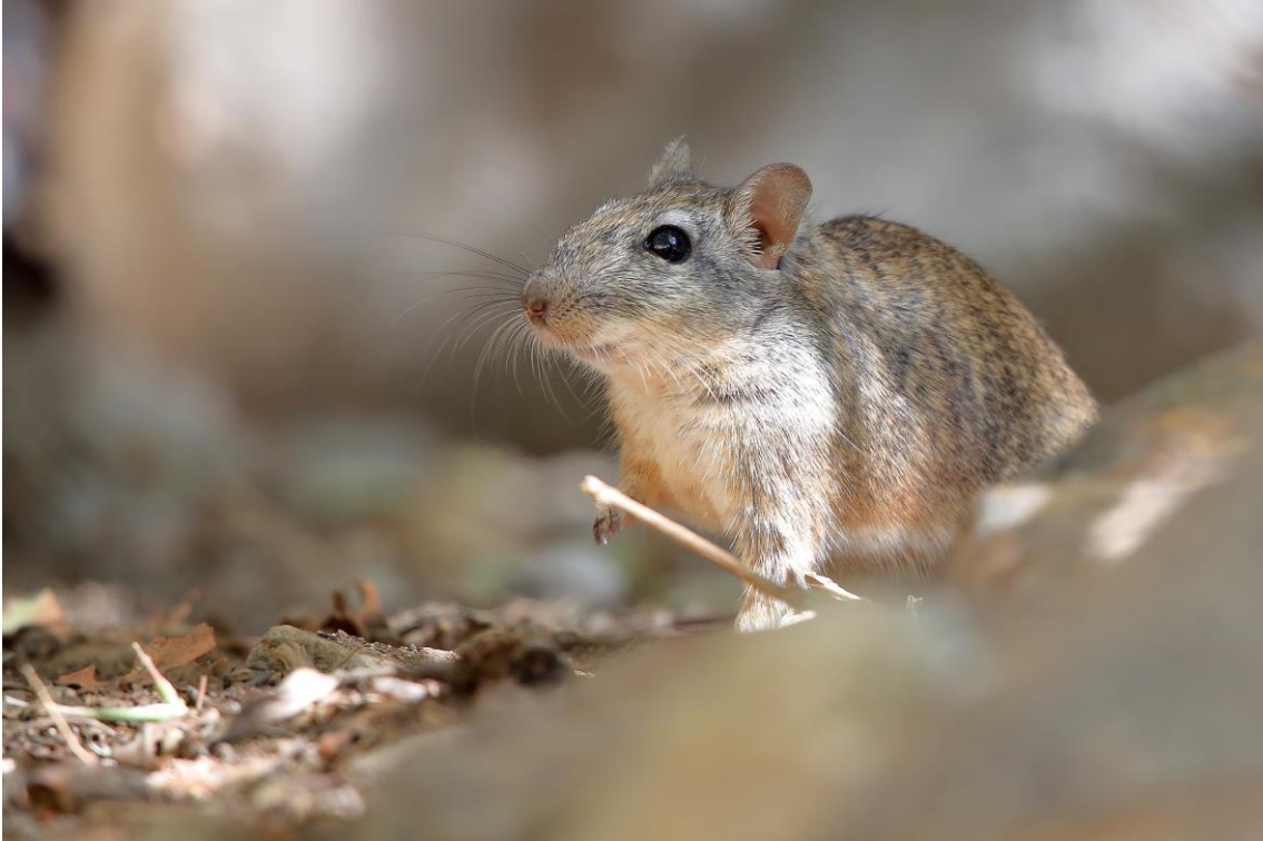
Yemini Mouse- Just one near the entrance of Raydah escarpment. Lovely animals and a real specialty of this region