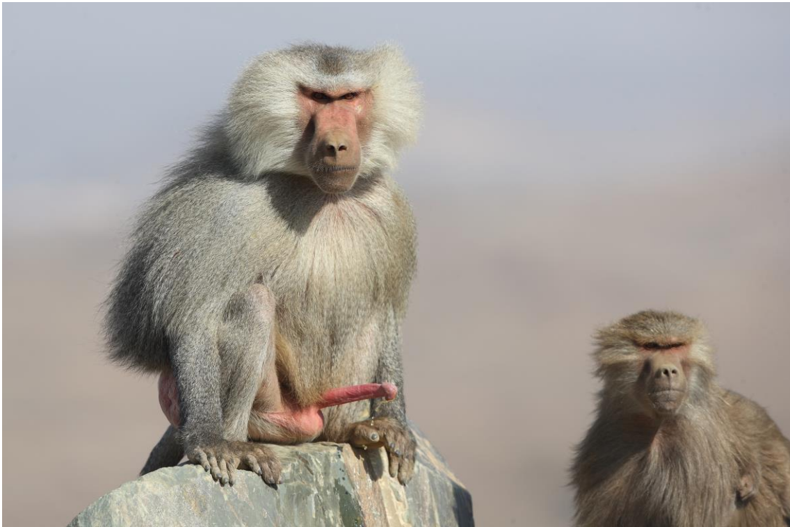
Arabian Spiny Mouse- Fairly common around Tanomah, at high elevation, around 2000 masl. They like hang around cliffs and rocky outcrops