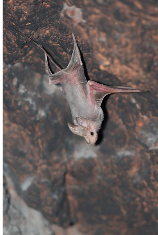
Straw-colored Fruit Bat and Egyptian Mouse-tailed Bat

Egyptian Rousette- Few of them at dusk after Bisha