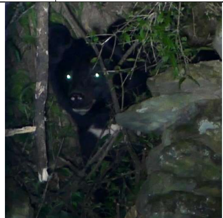
Asiatic black bear (photo extract from Martin's video)