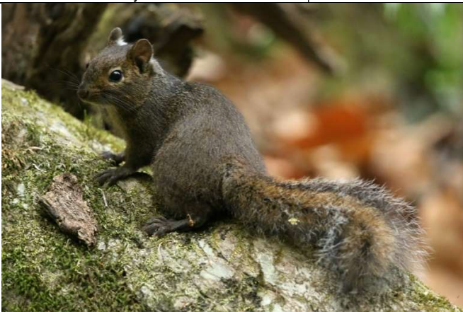
Pere David's rock squirrel