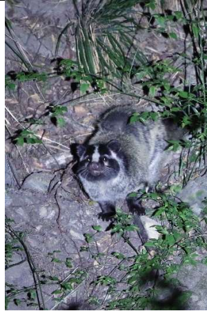
Masked palm civet