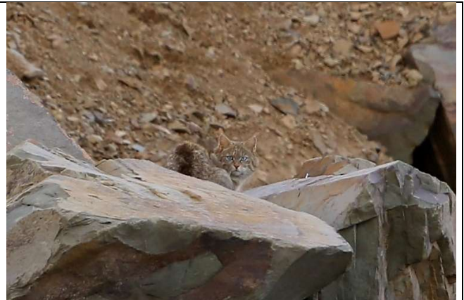
Chinese mountain cat