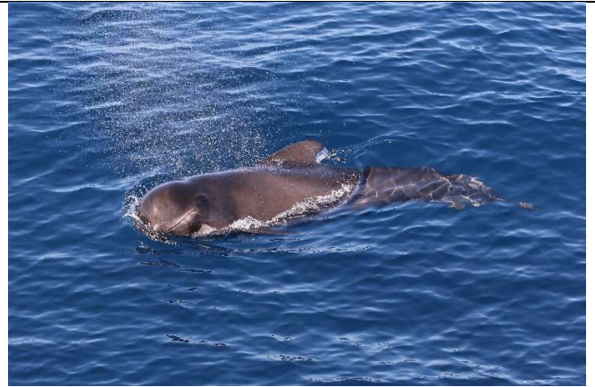
Long-finned pilot whale