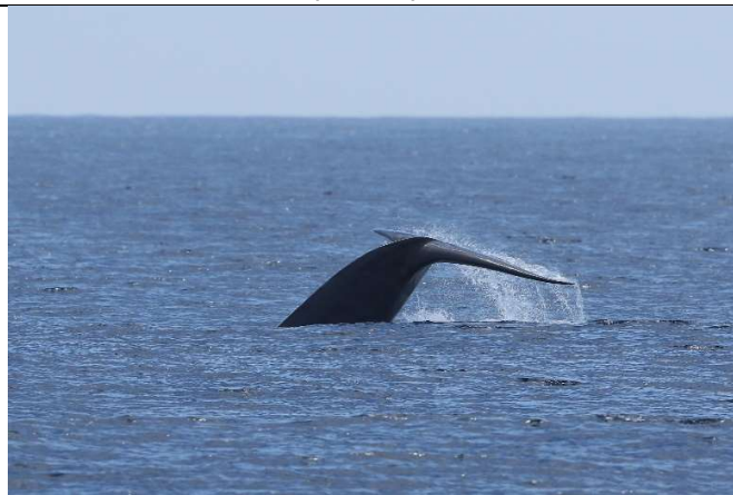
Fin whale (unusual fluke)