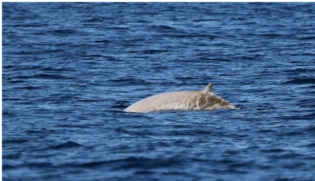
Cuvier's beaked whale