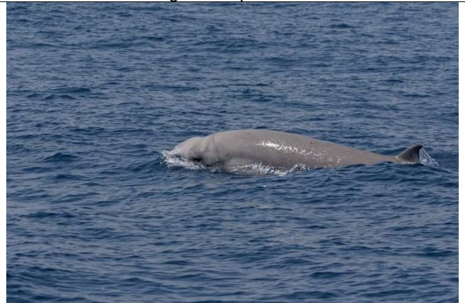
Cuvier's beaked whale