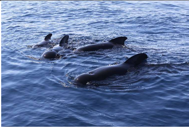
Long-finned pilot whale