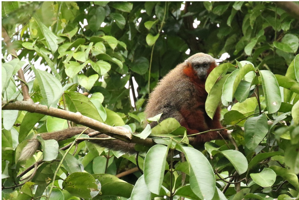
Image: Caquetá tití

Today is dedicated to the rare and critically endangered Colombian woolley monkey. A short transfer takes us to the trail head, from where we start hiking up a moderately steep path. We will need to hike for at least 3-4 hours before reaching good cloud forest habitat where the chances of seeing woolley monkey increase. We continue our search for this rare primate, with plenty of breaks, a tasty packed lunch and several hours of gentle searching in the highest part of the hike. We later hike down via the same route to the trail head where we transfer by vehicle to our guest house. Please expect to be hiking for at least 8 hours today. Overnight simple guest house