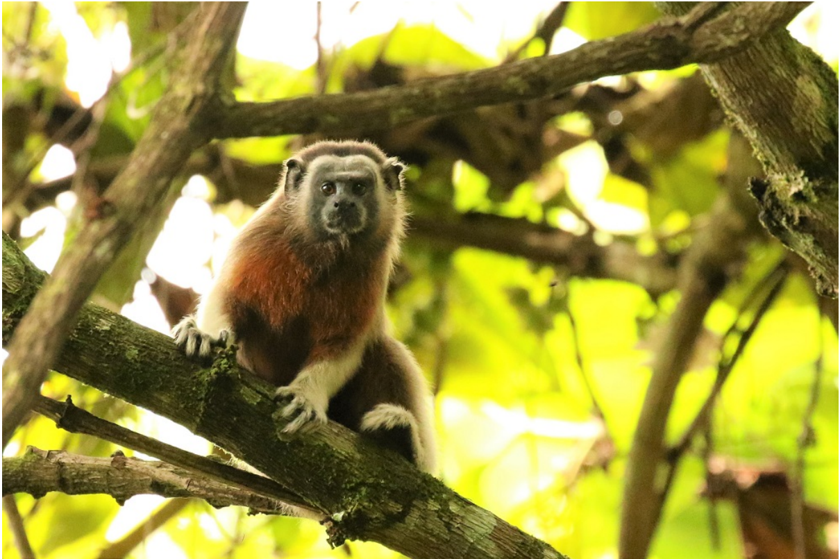
Silvery-brown bare-face tamarin