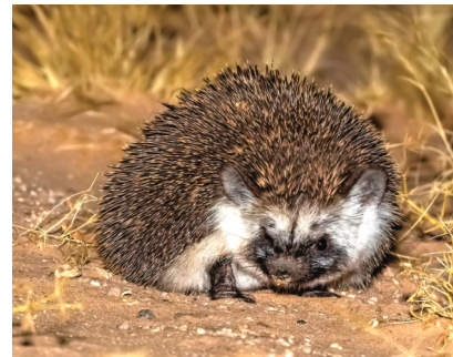
Desert hedgehog, APA

Behaviour: Its foods are mainly beetles, snails and millipedes. Mainly crepuscular and nocturnal its habits in the HoA are poorly known. Their call is a sniff-like sound.