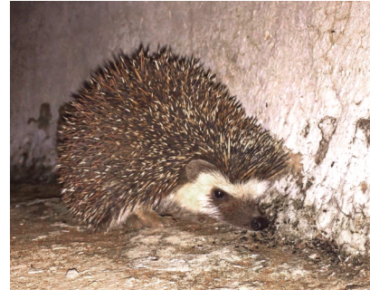
Four-toed hedgehog, Yabelo, Ethiopia, RG

Hedgehogs Erinaceidae, two (possibly three) species, 44