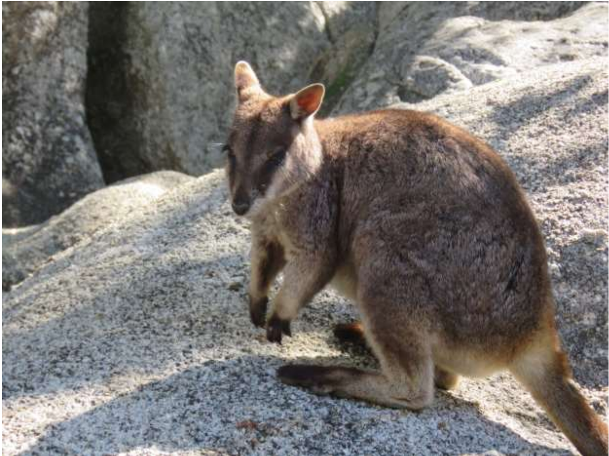
Mareeba Rock Wallaby