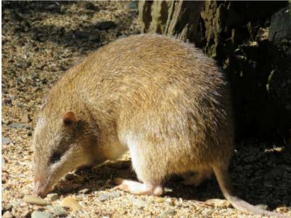
Northern Brown Bandicoot

From ATBC we drove to Chambers Wildlife Lodge, another fixture on the Queensland wildlife circuit. There is a shelter beside trees which are painted with syrup each evening. Not exactly the most naturalistic of settings, but spectacular views of Striped Possum, Sugar Gliders and Bush Rat. The grounds provided more opportunities to see pademelons. I also found a very nice leaf-tailed gecko.