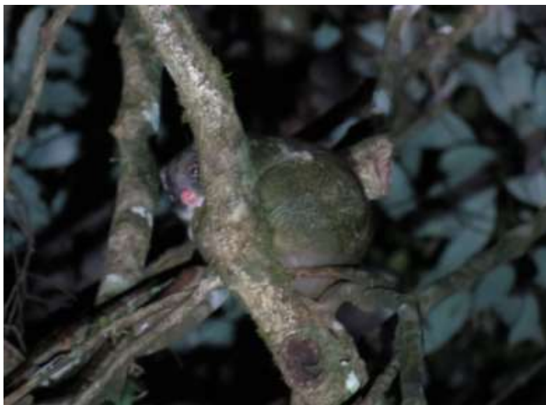
Green Ringtail Possum