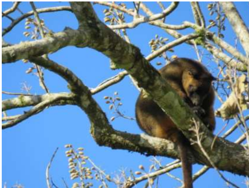
Lumholtz's Tree Kangaroo