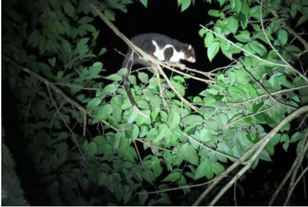
Herbert River Ringtail Possum