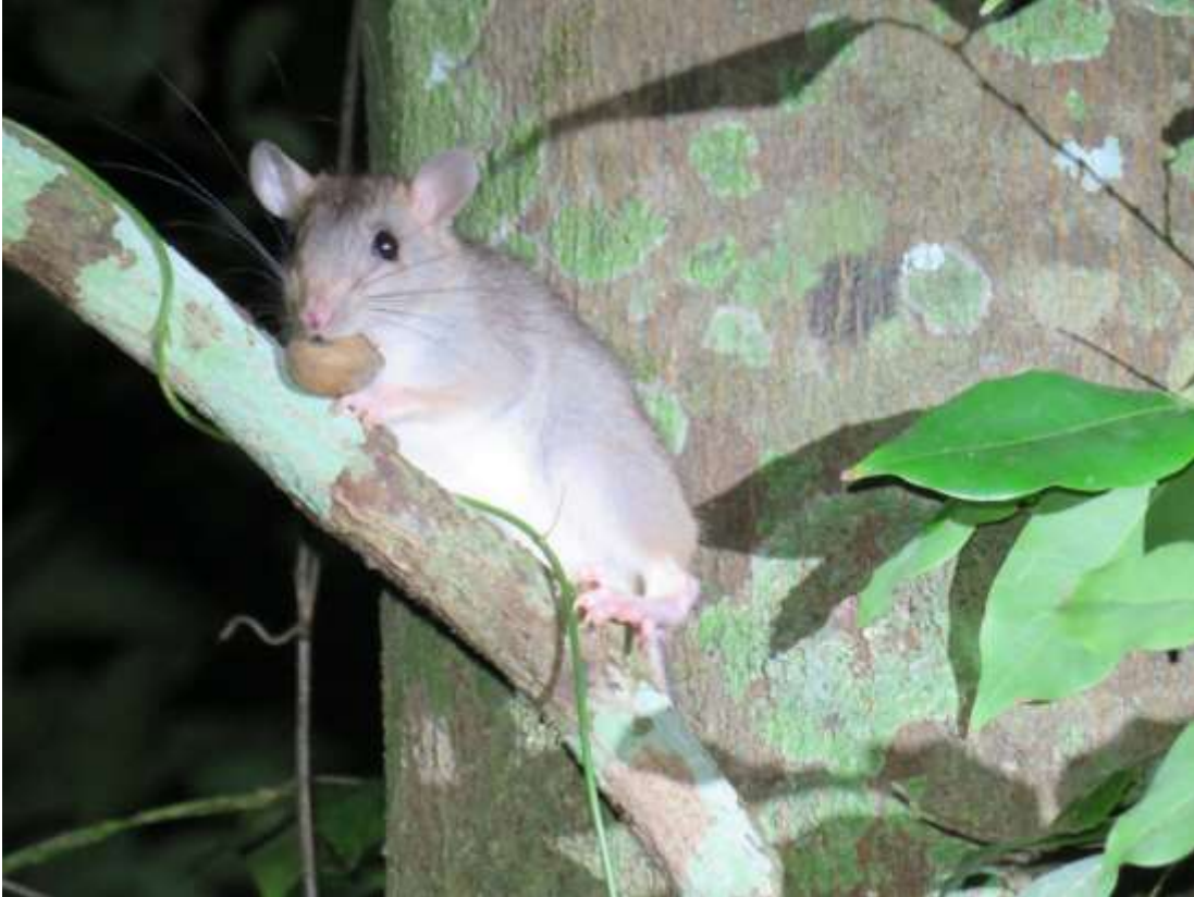
Giant White-tailed Rat

The next day we drove up to Cooktown after a stop at Black Mountain National Park to look for rock wallabies. We got going later in the morning than I had hoped to so we didn't manage to actually see any. From Cooktown we drove south to Kingfisher Park in Julatten. This is a well-established site on both the bird-watching and mammal-watching circuits. We waited by the creek at the back of the property around dusk and were rewarded with the sight of a Platypus moving at high speed down the creek. Watching the feeders close to the lodge revealed Fawn-footed Melomys and House Mouse. Walking through the orchard, we saw numerous Red-legged Pademelons, Northern Brown Bandicoots and Long-nosed Bandicoots. An Eastern Horseshoe Bat previously seen roosting in a toolshed was regrettably absent. One of the saplings on the grounds held a Boyd's Forest Dragon, the first we had seen on this trip, and we also found several White-lipped Tree frogs. These are the world's largest tree frogs and quite remarkable in their own right.