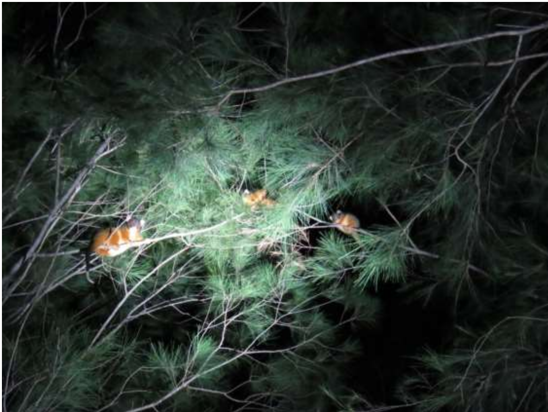
Common Ringtail Possums

The next day we drove to Binna Burra in Lamington National Park, less than two hours from Brisbane. I had been here a number of years ago and was pleased to see how little it had changed. After dusk the grassy areas near the lodge and campground become covered with Red-legged Pademelons. Hiking some of the trails revealed Red-necked Pademelons, several Common Ringtail Possums and two Fawn-footed Melomys. We also found a Short-eared Brushtail Possum (Northern Bobuck) close to the lodge. The following day we hiked the Davies track, which is a gorgeous walk through some interesting vegetation and offers magnificent views out towards the coast. Red-necked Pademelon was the only mammals seen during the hike. Around 5 PM we drove down the entrance road and saw several Whiptail Wallabies by the side of the road just outside the park. Evening spotlighting again revealed Common Ringtail Possums, Short-eared Brushtail Possums and Common Brushtail Possums.