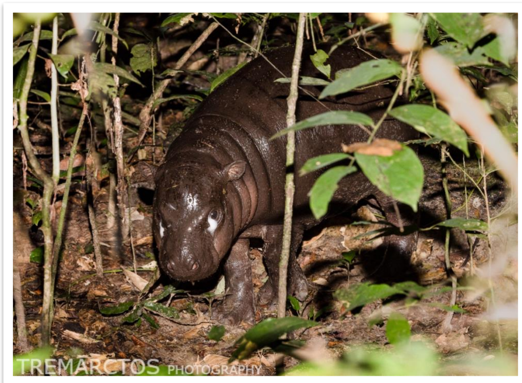
Photo courtesy of Ben Schweinhart, an independent traveller whom we assisted with logistics when visiting Tai in 2022