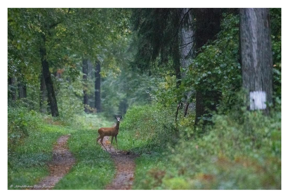
Biebrza National Park, 20-22 Sep:

We began the 20<sup>th</sup> with a nice roe deer observation in the forest, then we went birding in a few areas while we drove towards Biebrza National Park.