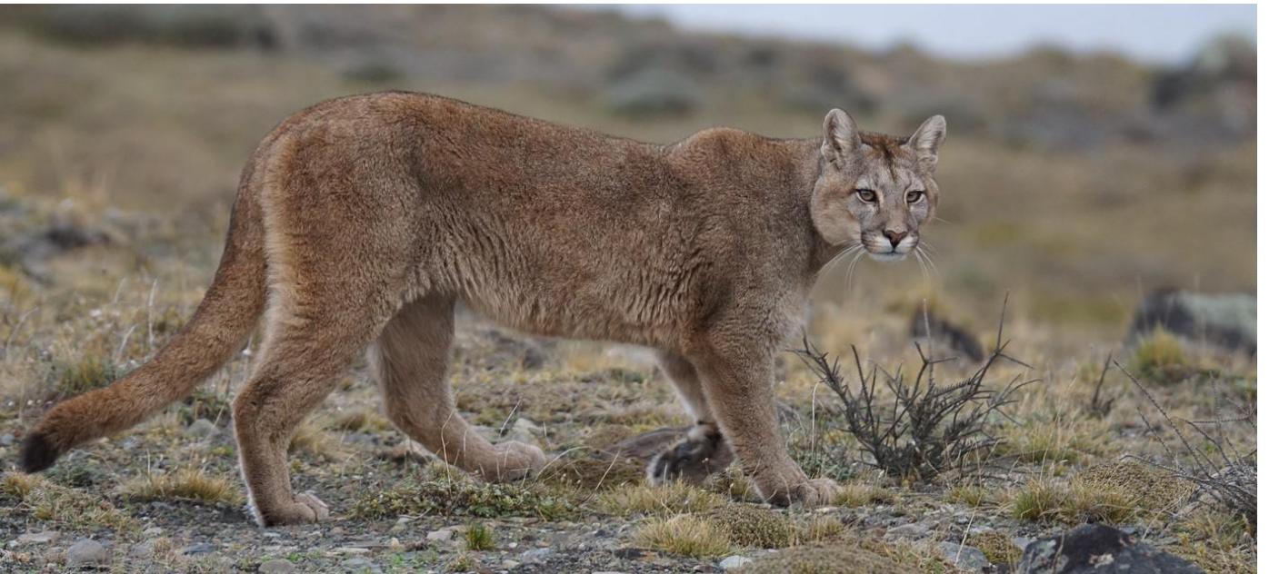
‘one of the sisters’ walking by