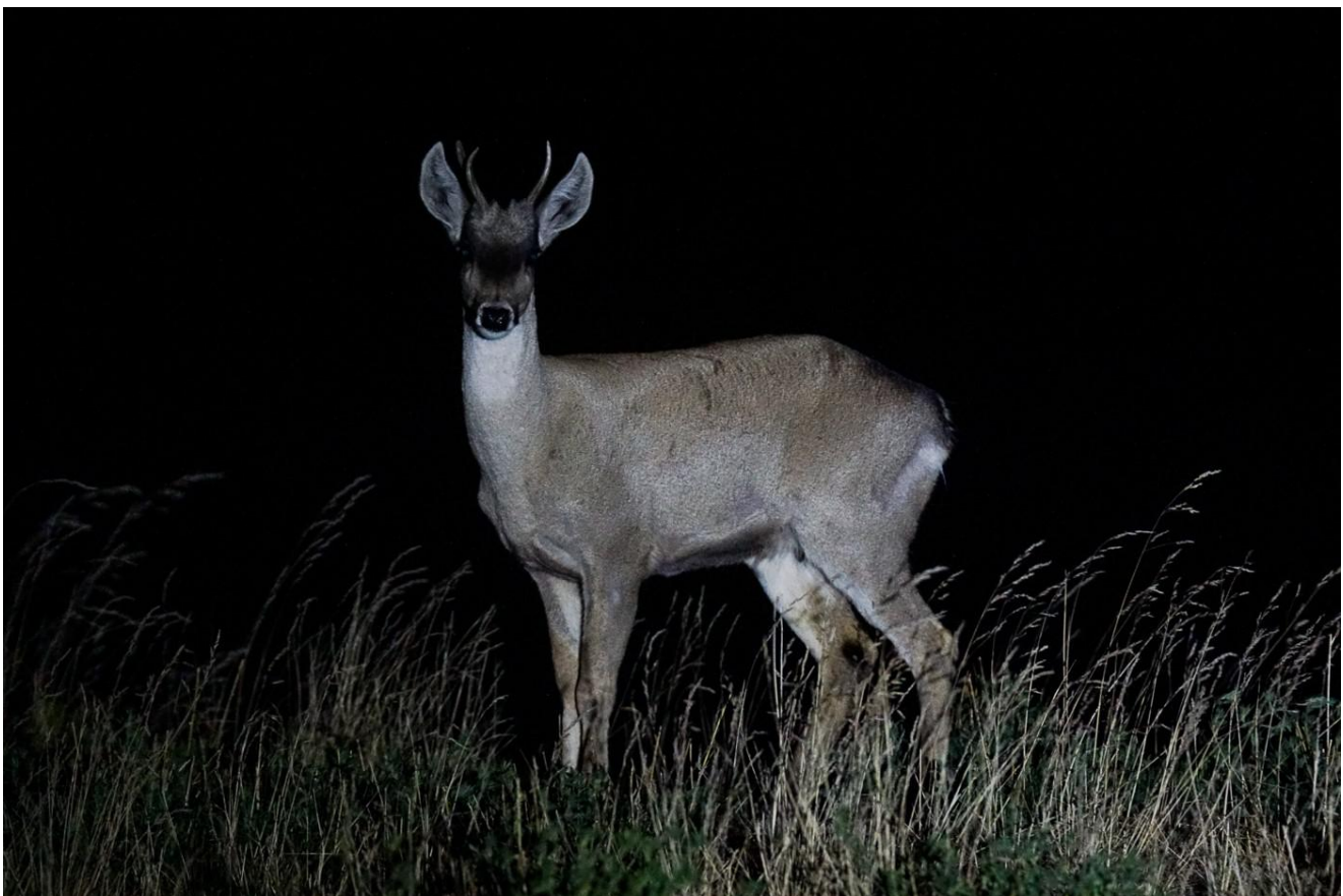
Taruca during spotlighting above Putre