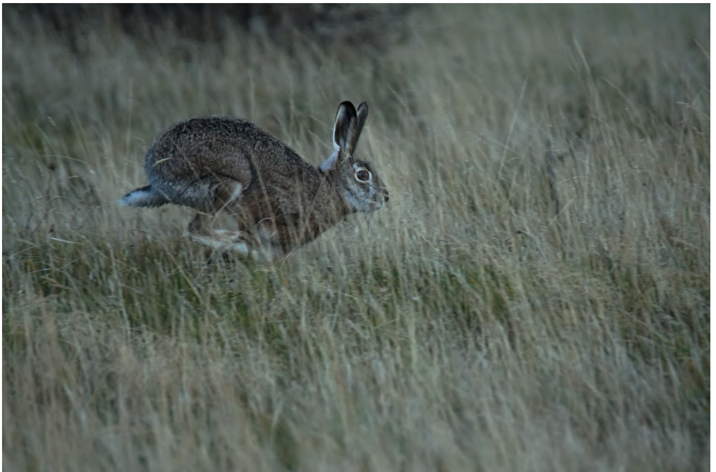
Hare in TDP