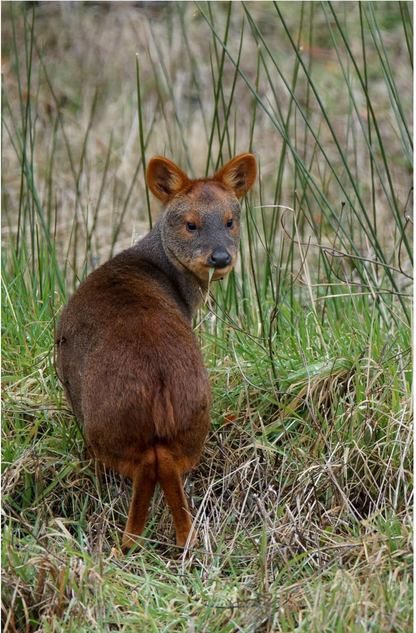
Pudu on the way to Tentauco