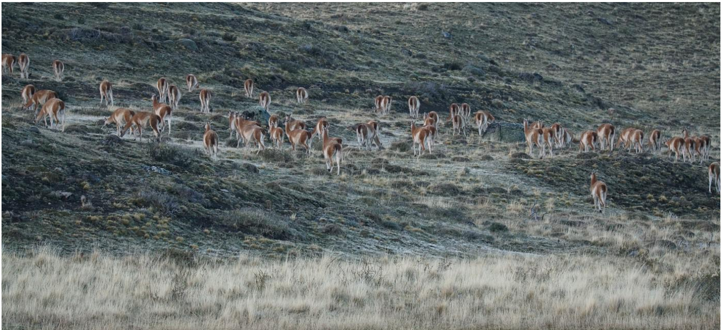
Herd of guanacos in TDP