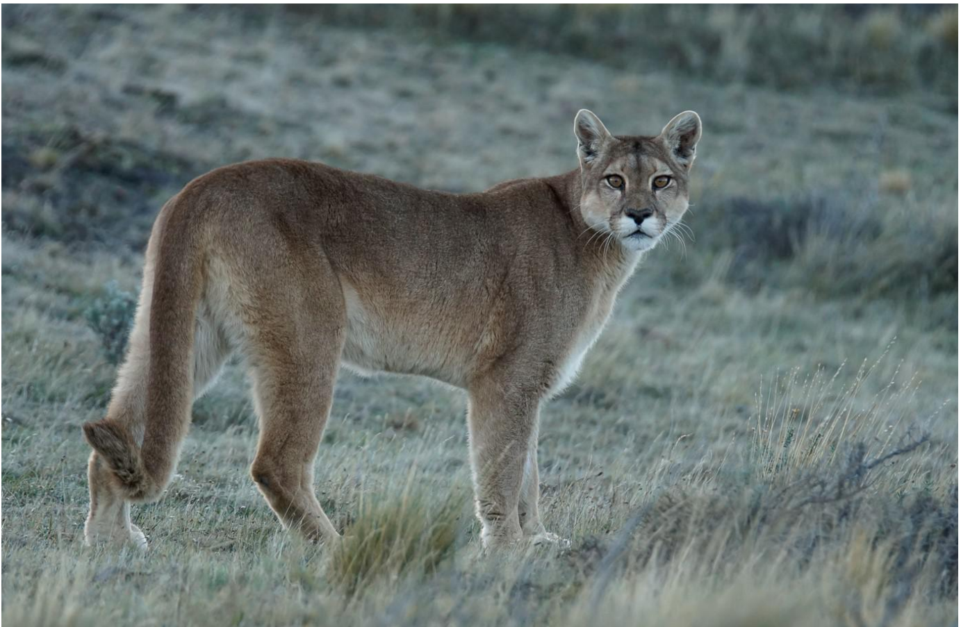
'Milan' the second great sighting of a puma in Torres del Paine Photo just taken after it crossed the road