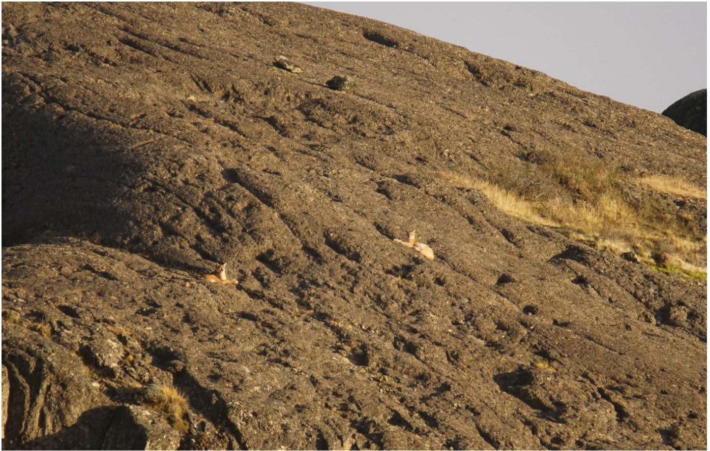
Two pumas just outside TDP in the 'estancia area' seen from the main road. If you pay a lot of money you can get far more close on foot, but we were lucky in the park ourselves.