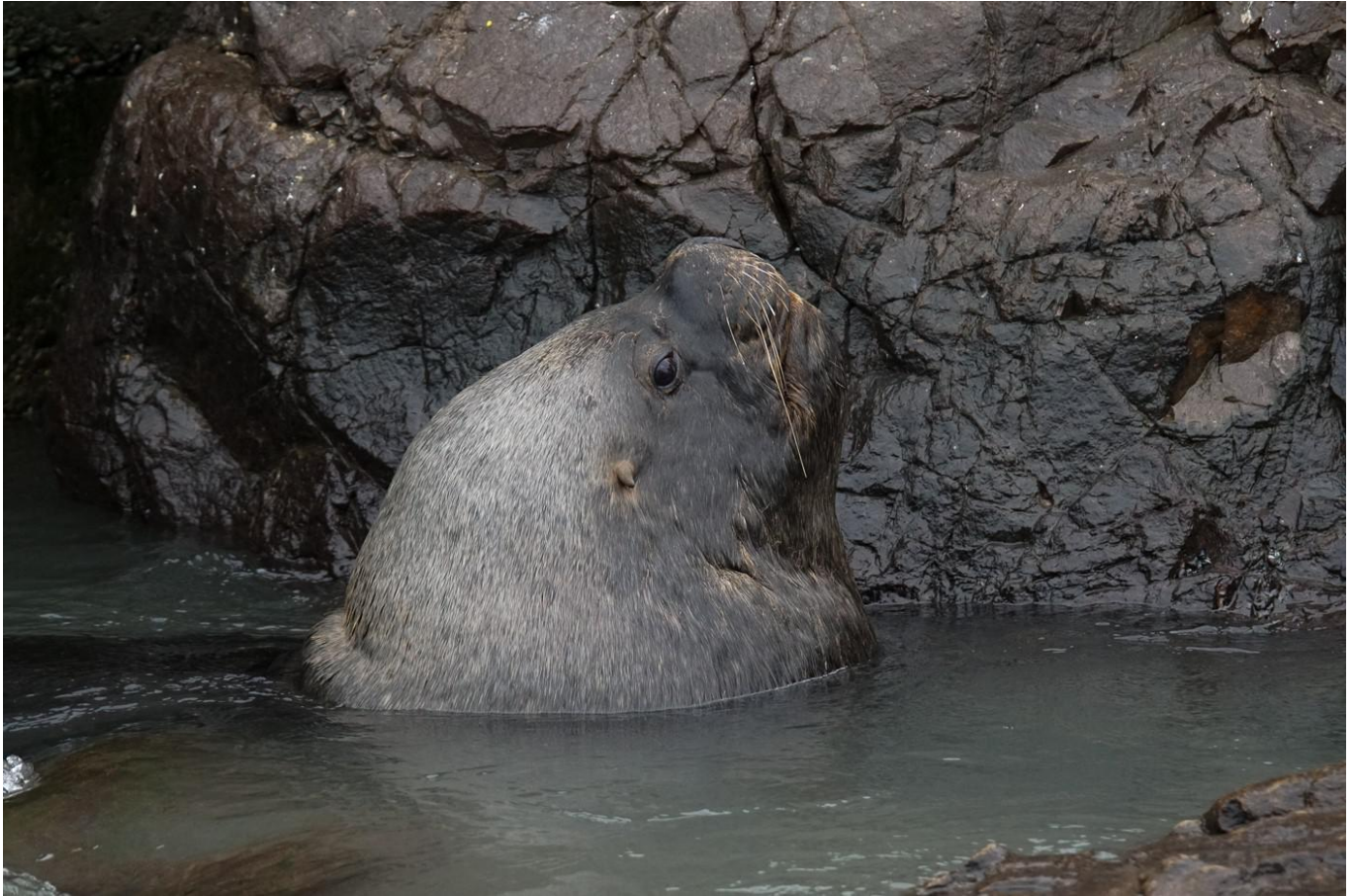
Sea lion in the harbour of Arica