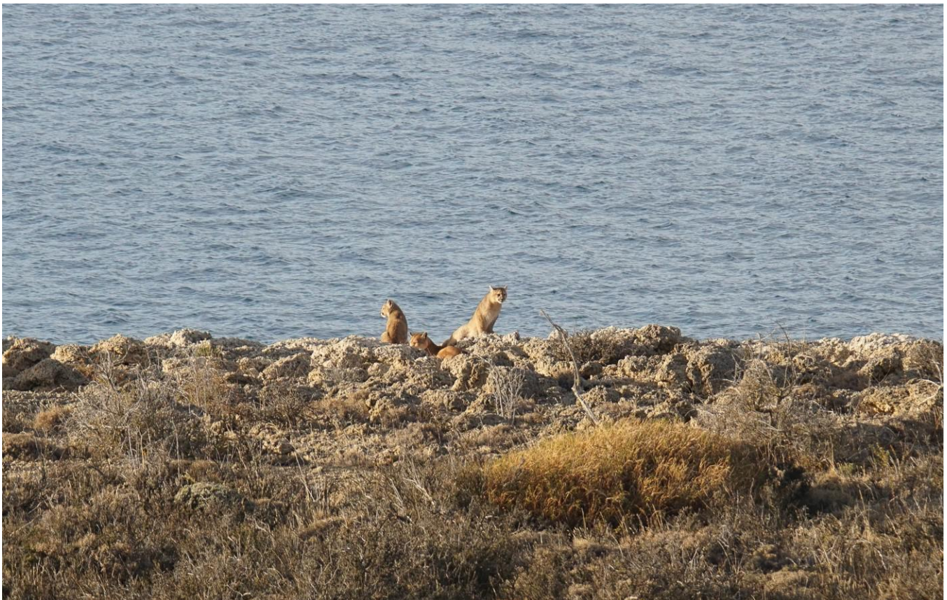
A mother puma and two cubs seen on the shore rocks of lago Sarmiento, a bit more east from main road in the 'estancia area'.