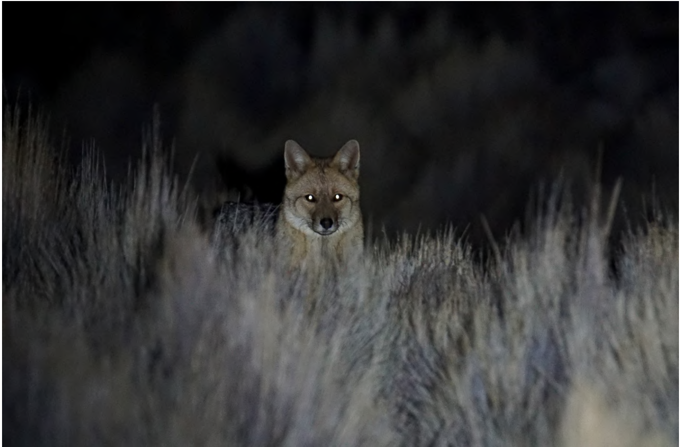
Andean Fox in Lauca