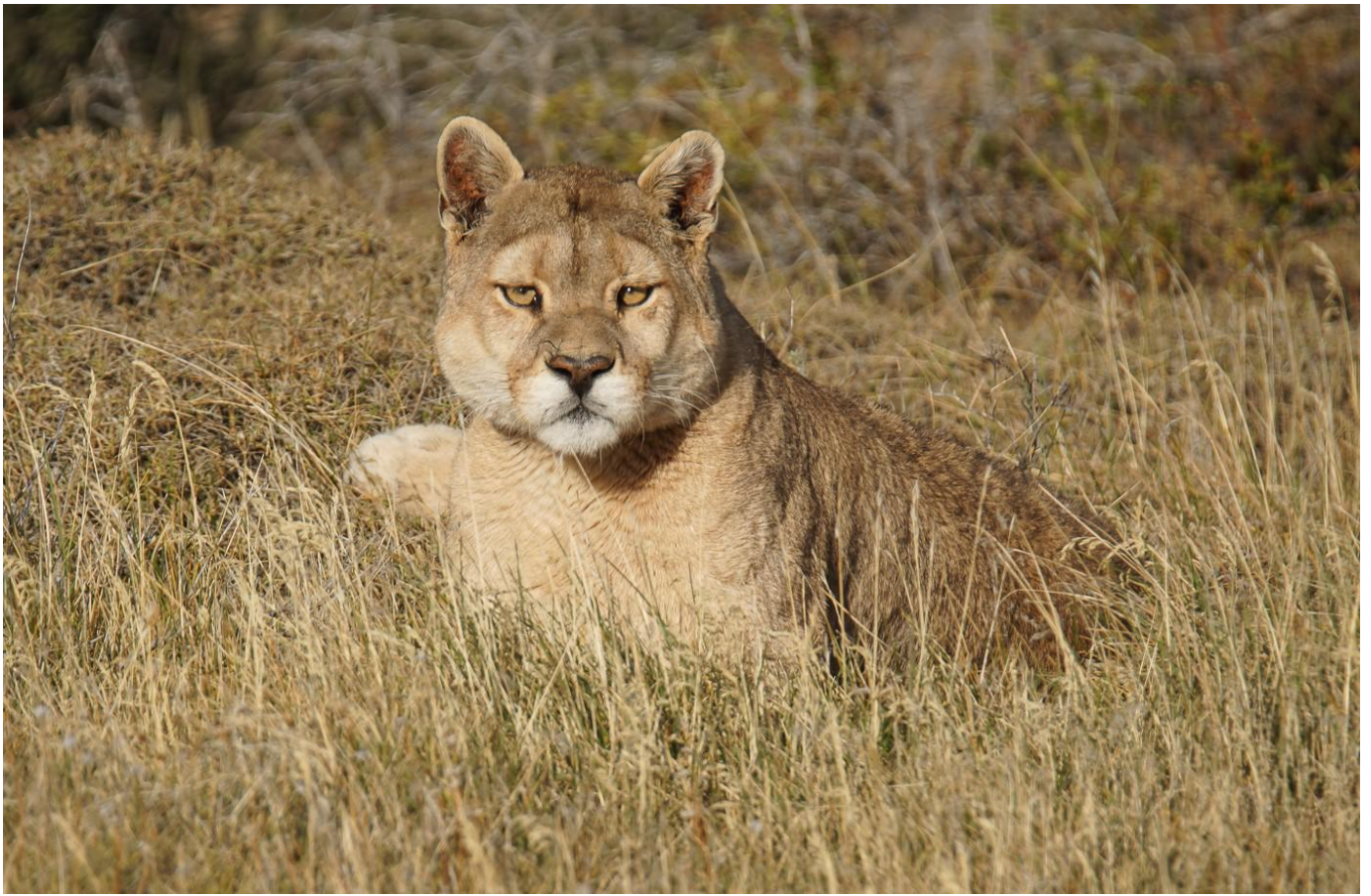
'Hermanieta' just after 5 minutes in Torres del Paine