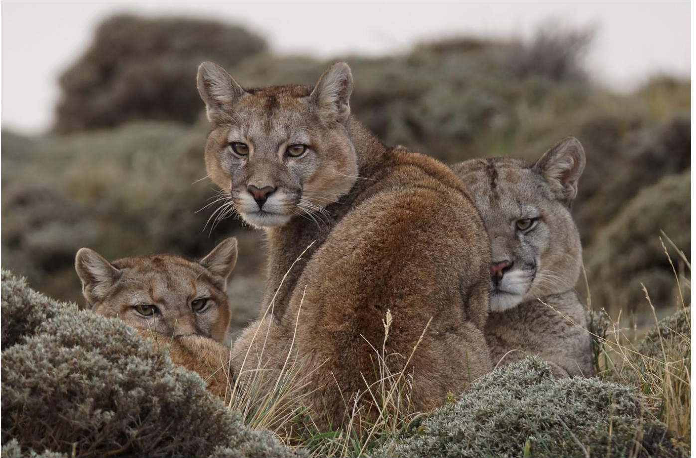
‘Two sisters and a brother’ just close to the road in TDP, how lucky!! 😊