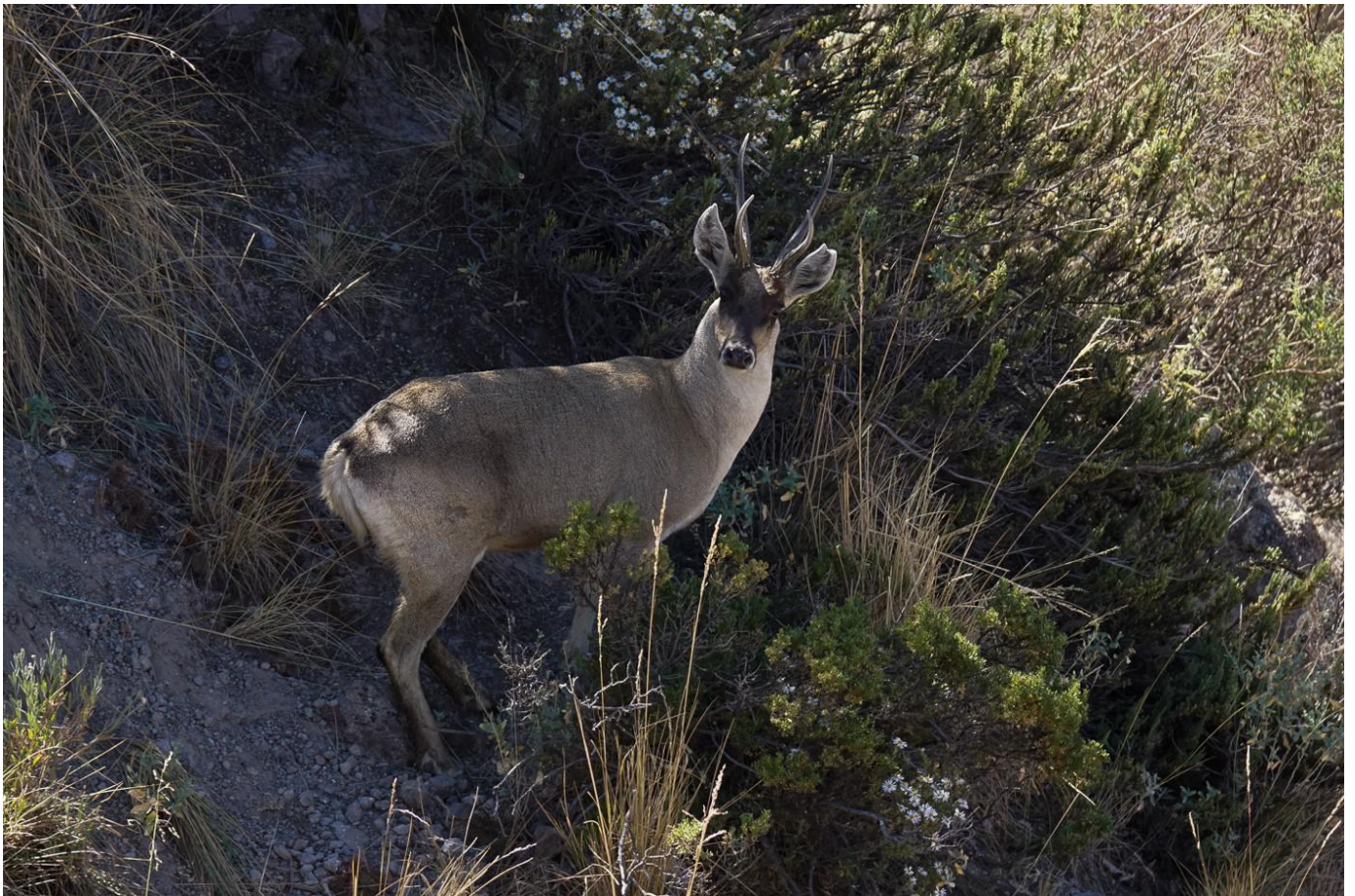
Male taruca just above Putre