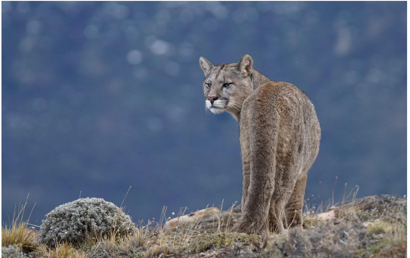
A goodbye look from the young male