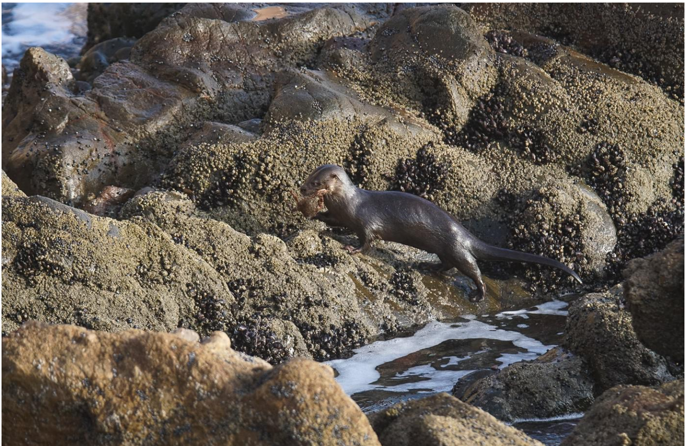
Bringing the catch to the den in the rocks