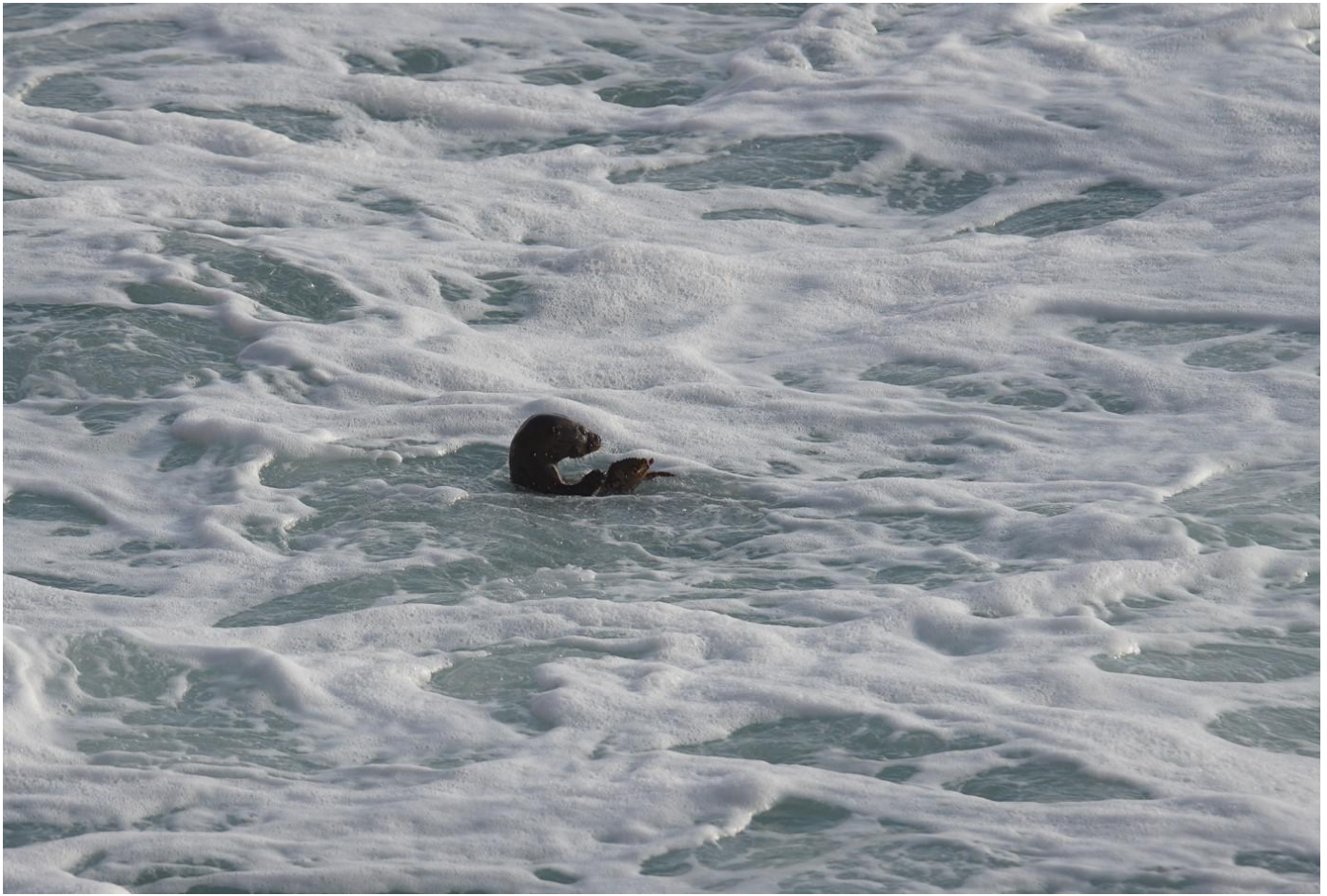
Marine otter with a fresh crab catch