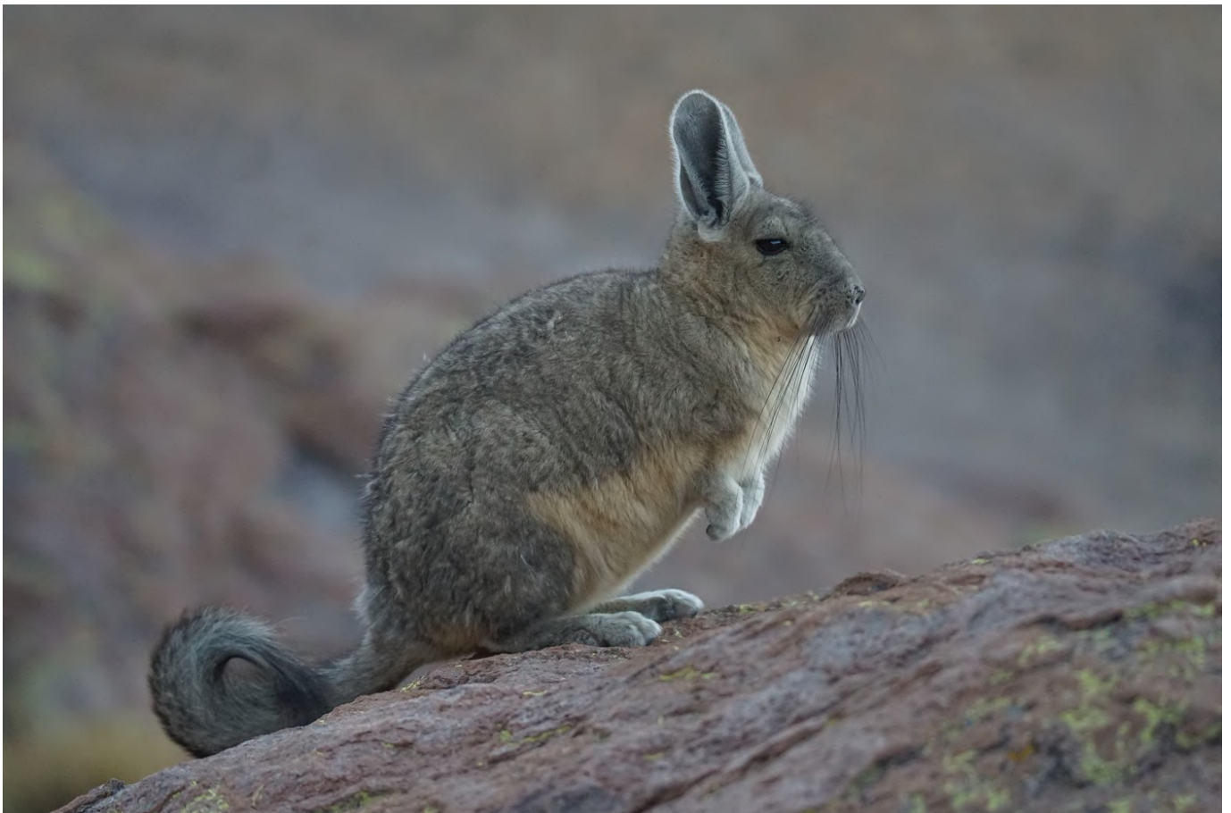
Vizcacha in Salar de Surire