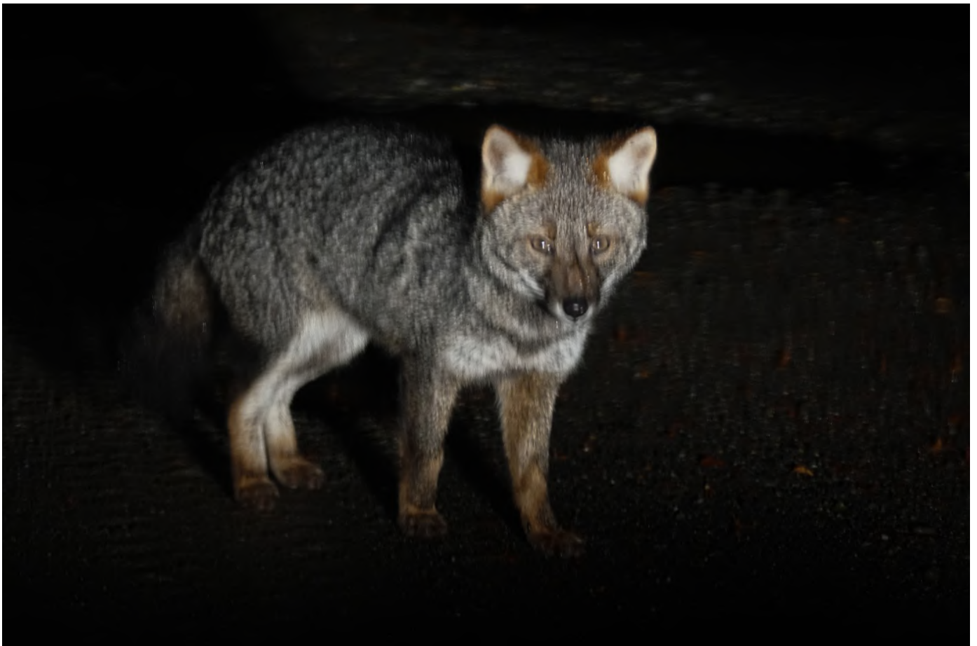
Darwin's fox in Tantauco (photo through car window)