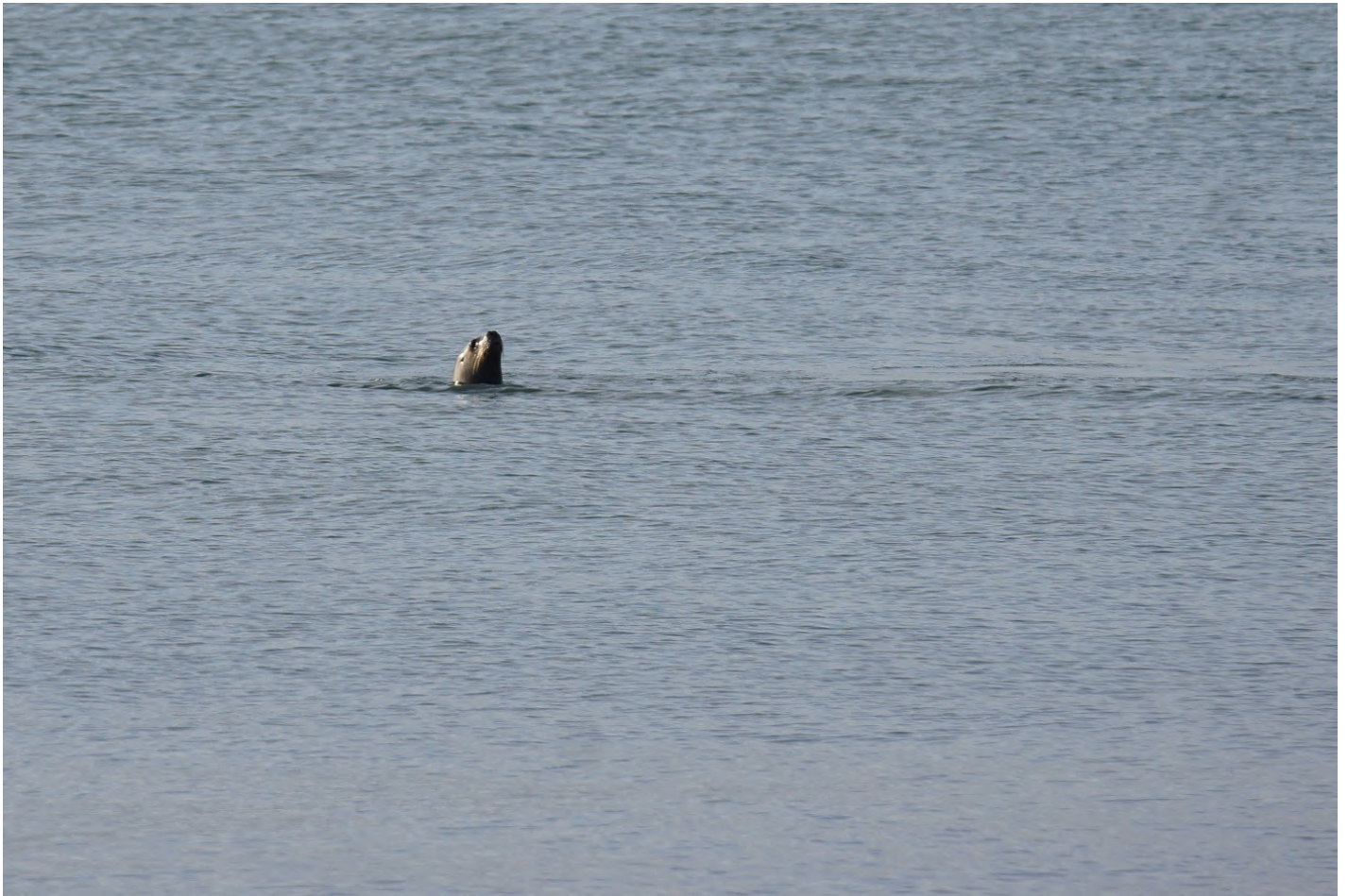
Probably a sea lion, close to the shore of Terra de fuego' at the beach before the small ferry crossing delgada