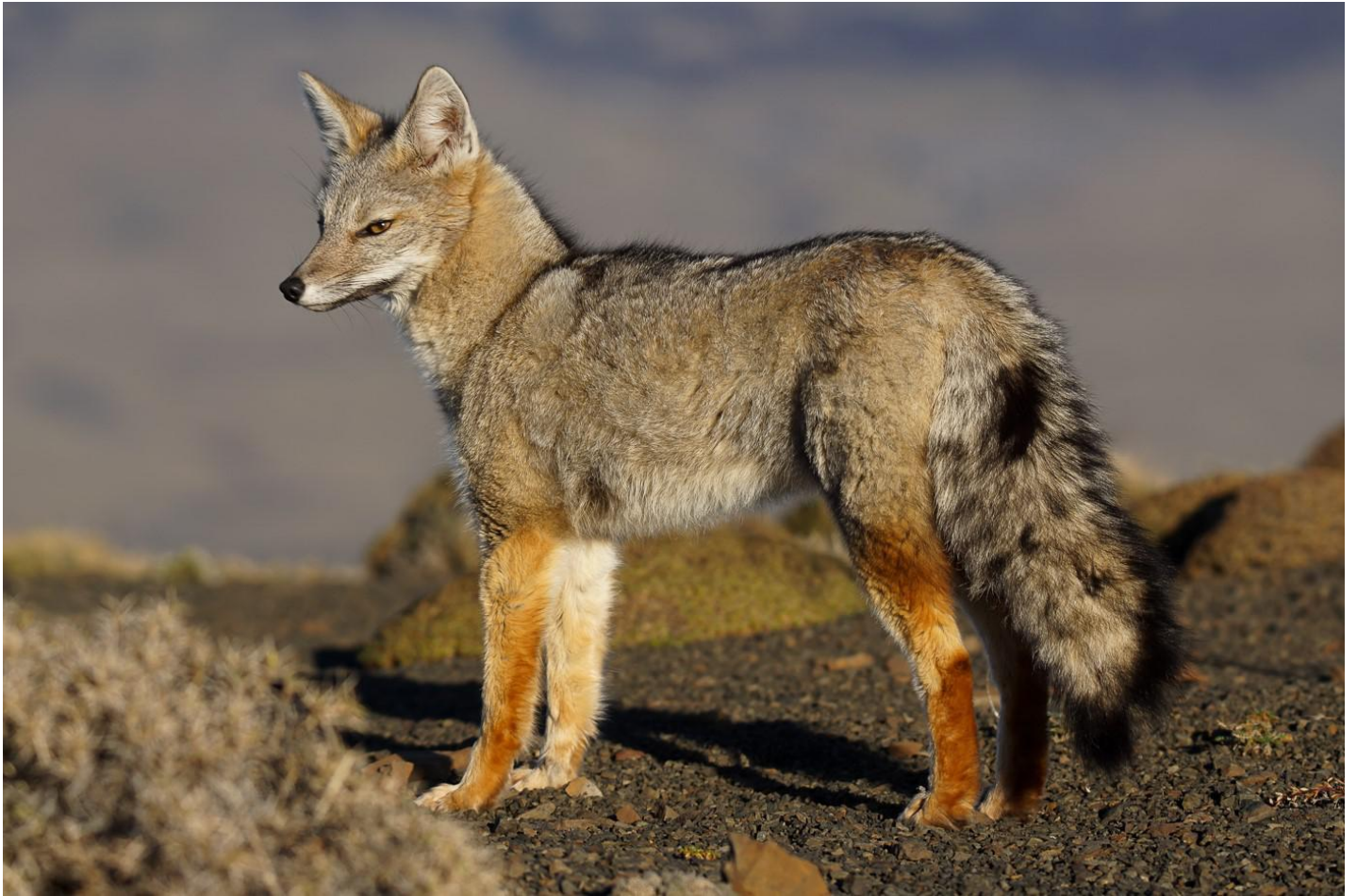
Chilla fox (grey fox) in TDP