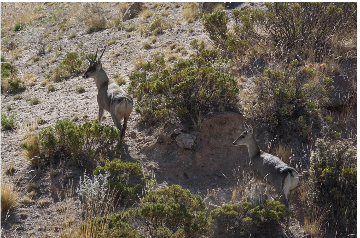
The male with his 'wife' just above Putre