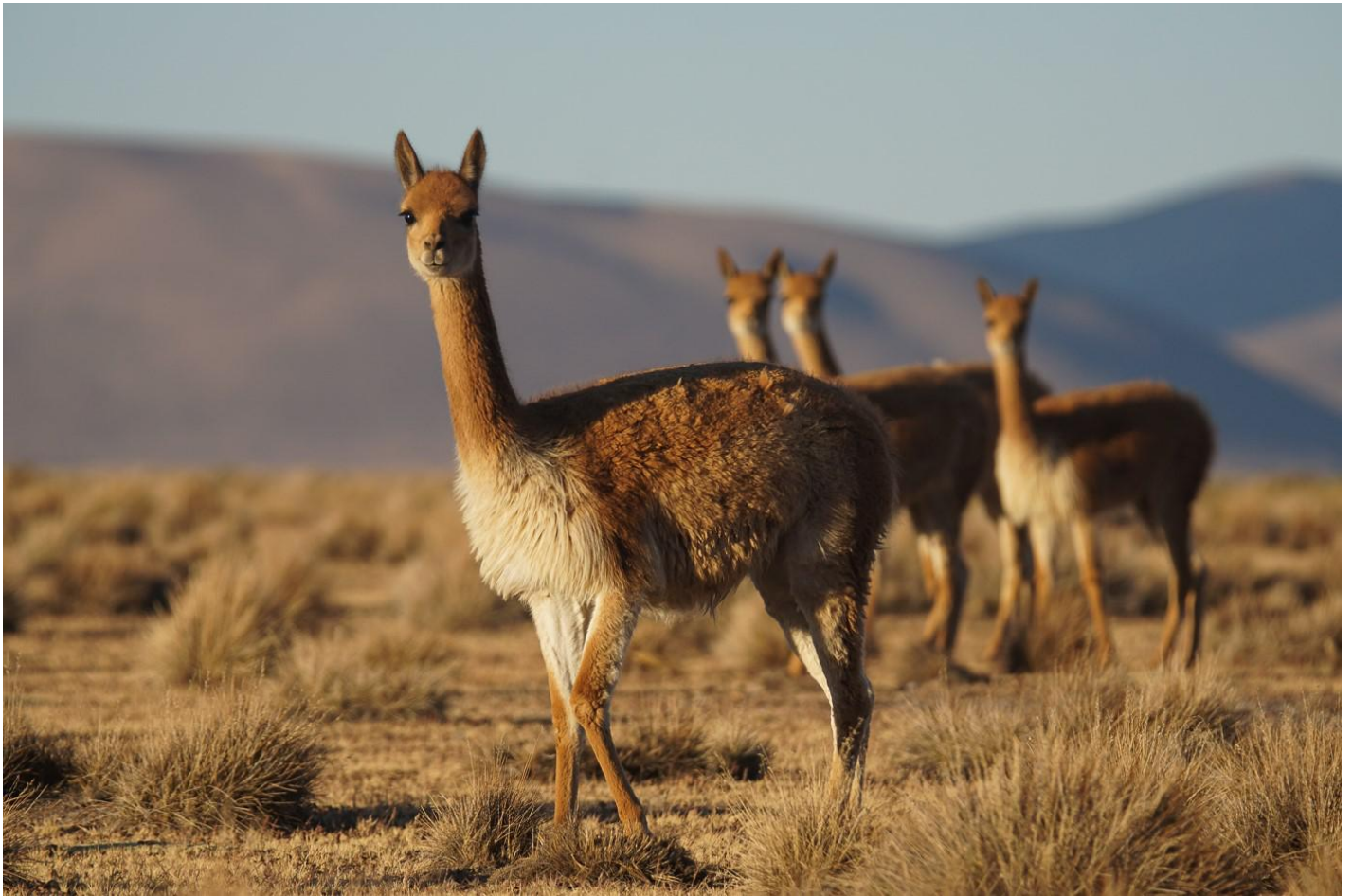
Vicunas in Salar the Surire