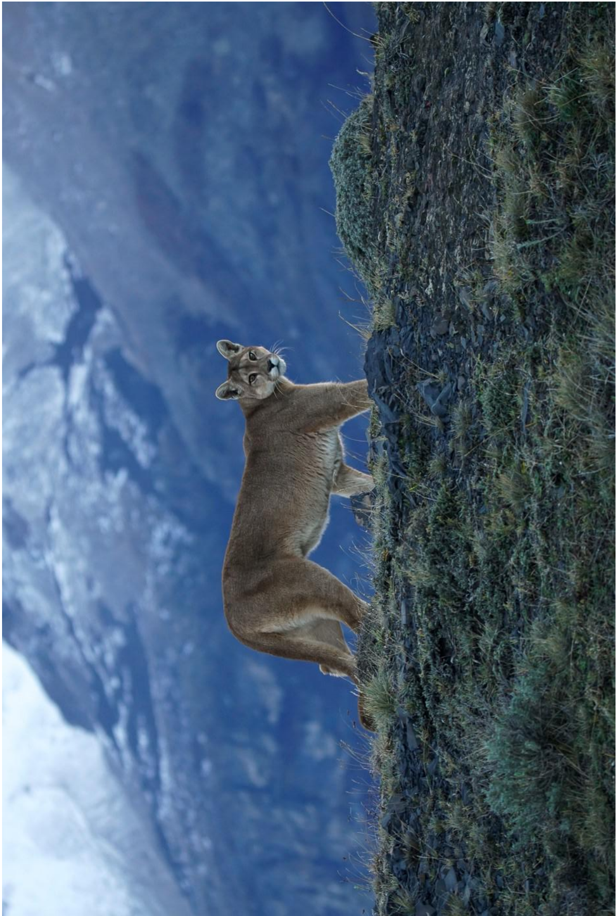
Puma 'Milan' with the Torres mountains in the back. (Turned to have a bigger view)