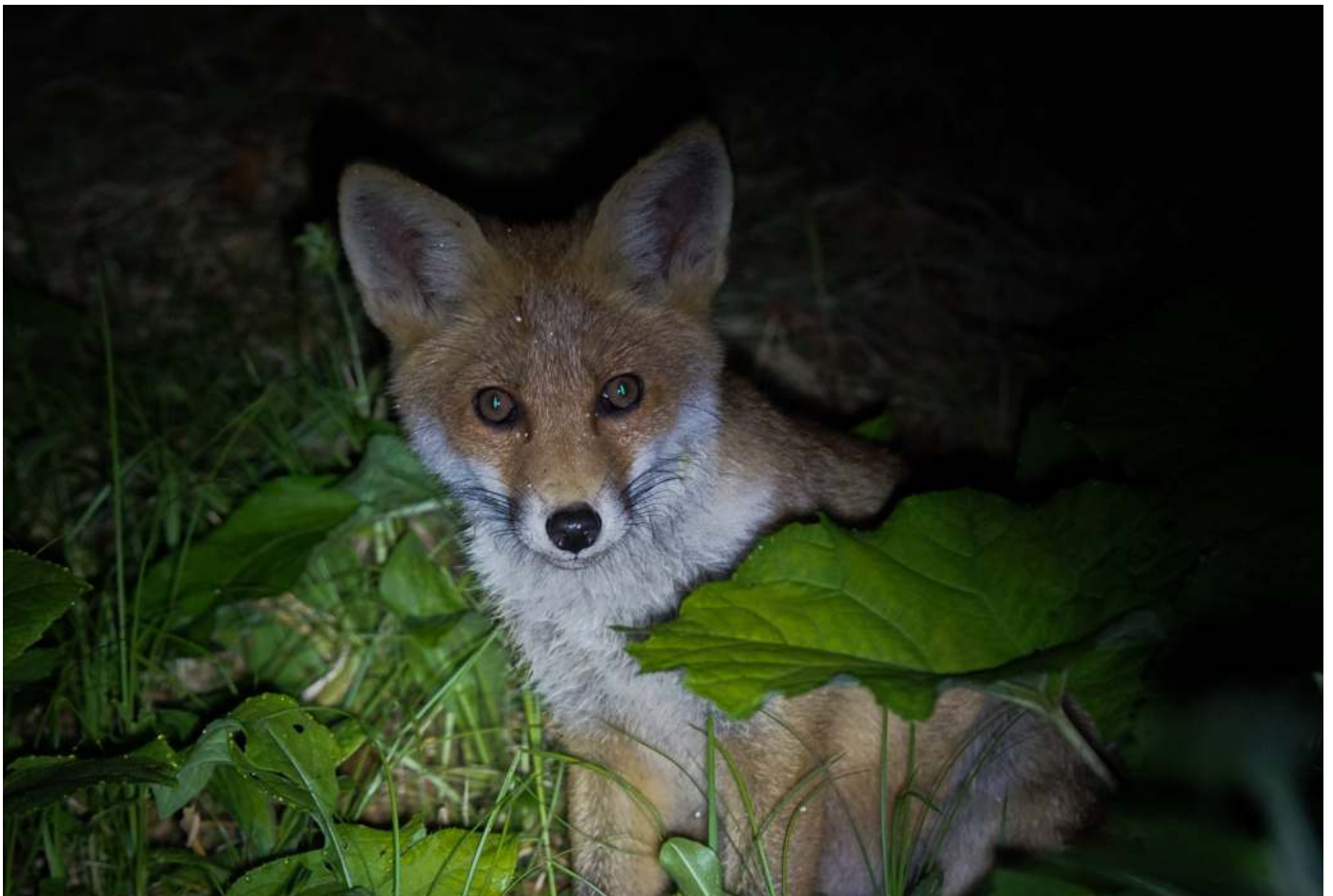
A young red fox