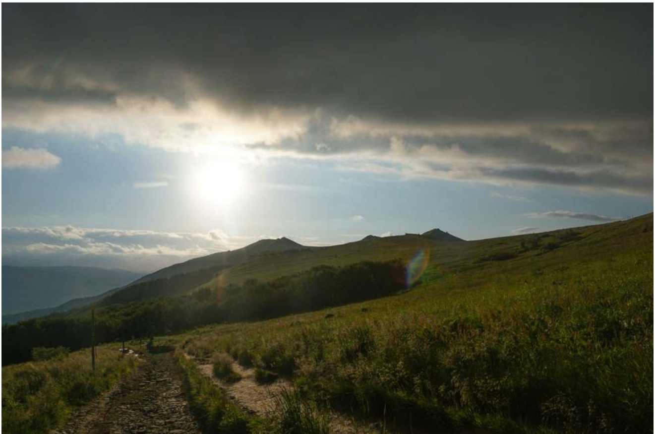
Evening sunset at the plateau ridge from the Wetlina walking track