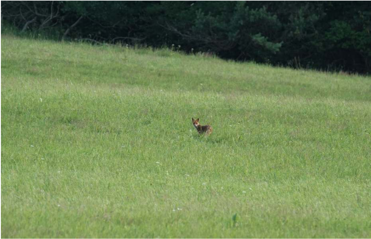
Daytime sighting of a red fox