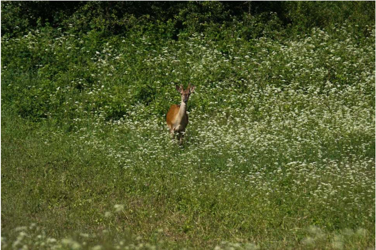
Red deer from the walking track in the afternoon