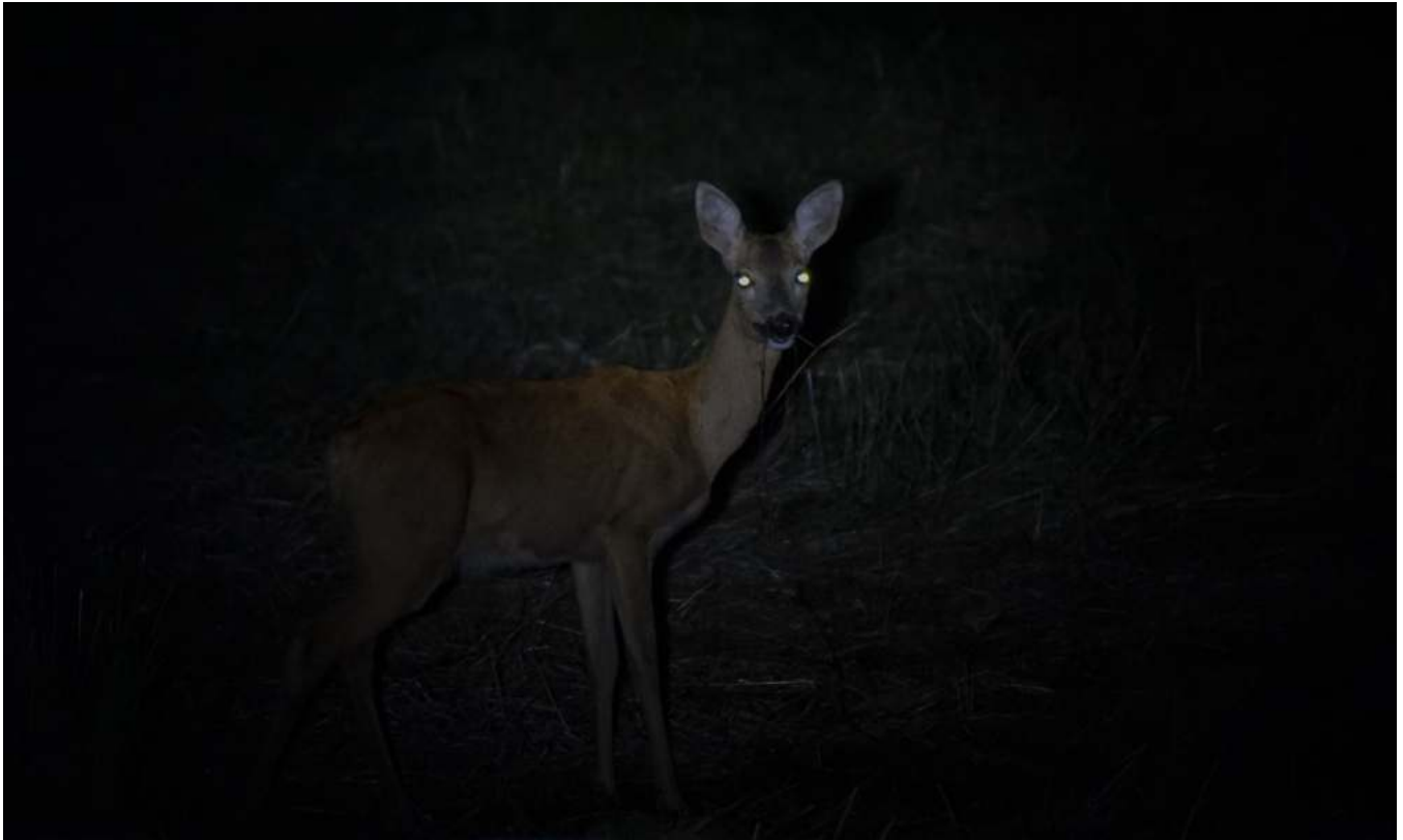
A roe deer at night