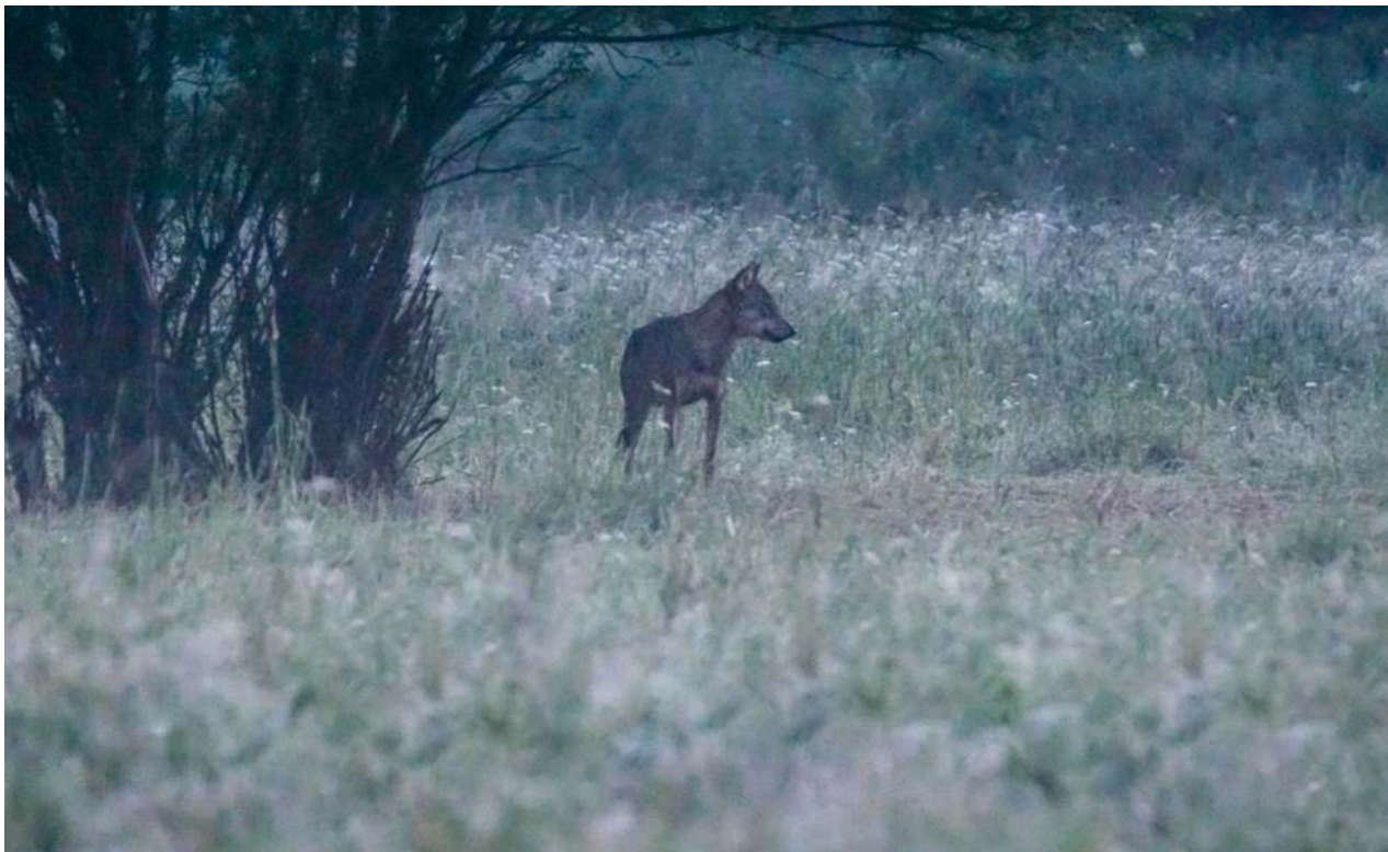
Another one from the wolf