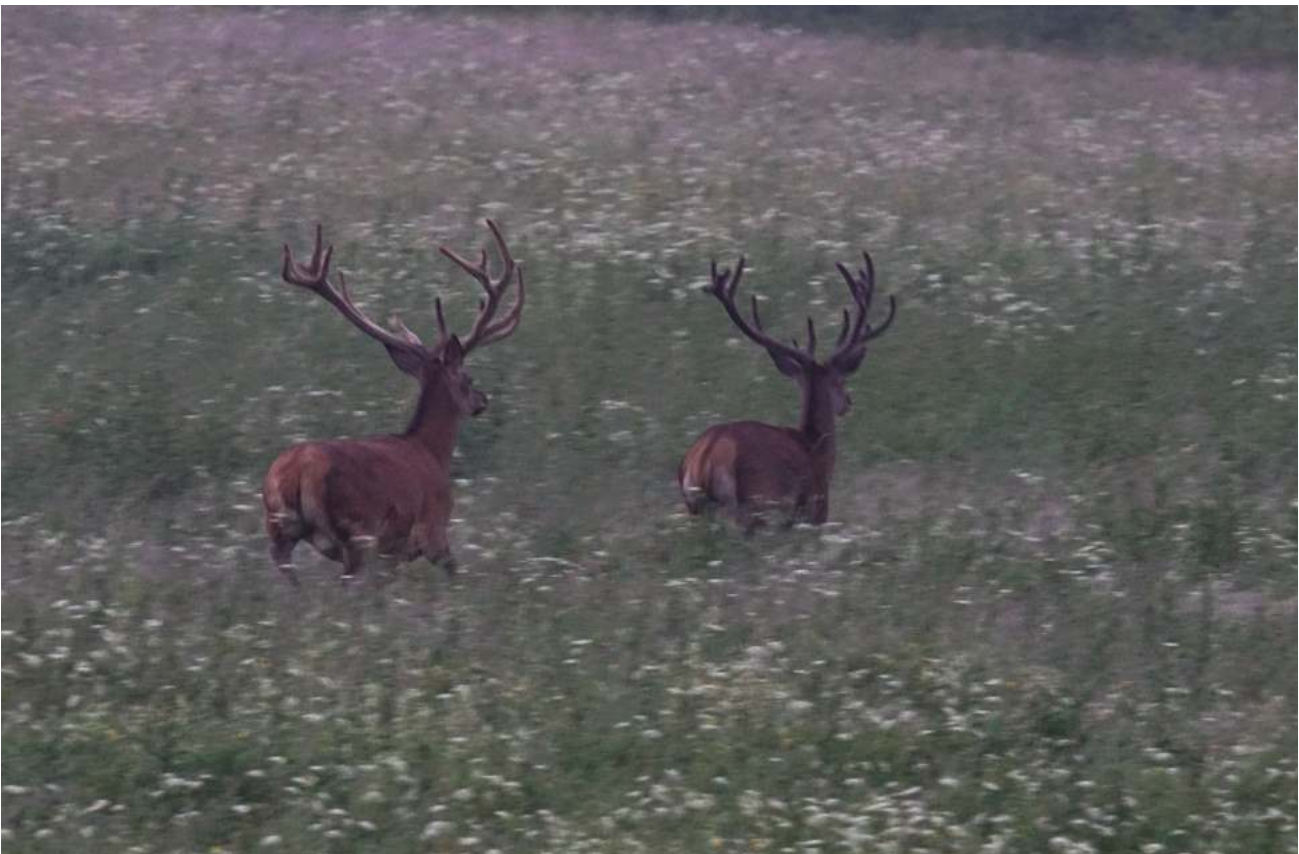
red deer stags on the run