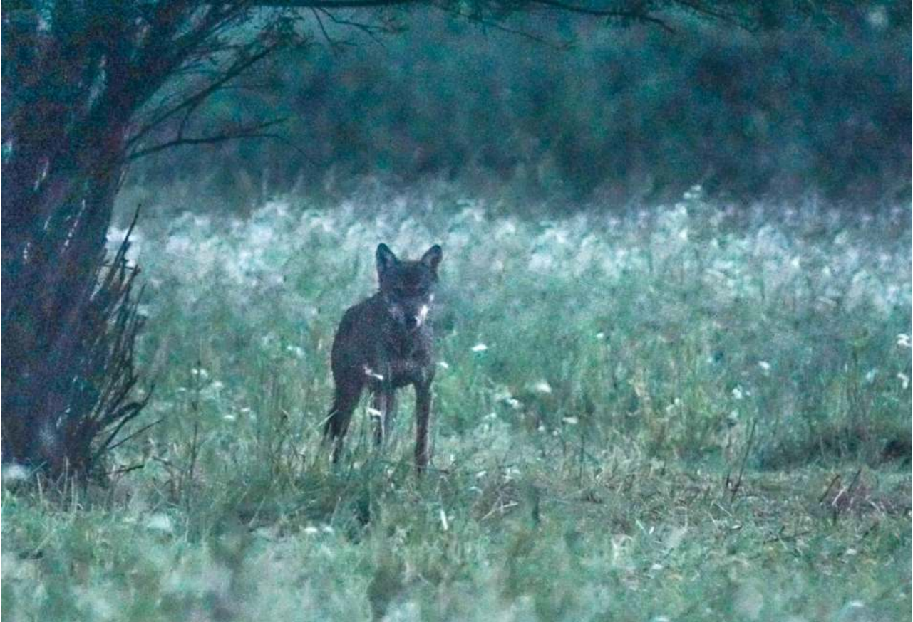
Wolf in very low light hence the rather grainy quality, but it was a wolf 😊