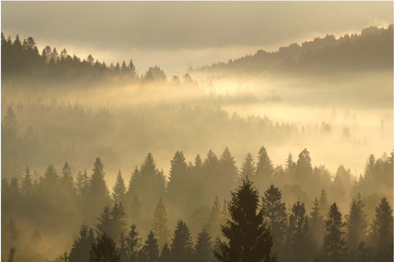
Beautiful sunrise morning view at Ukrain border