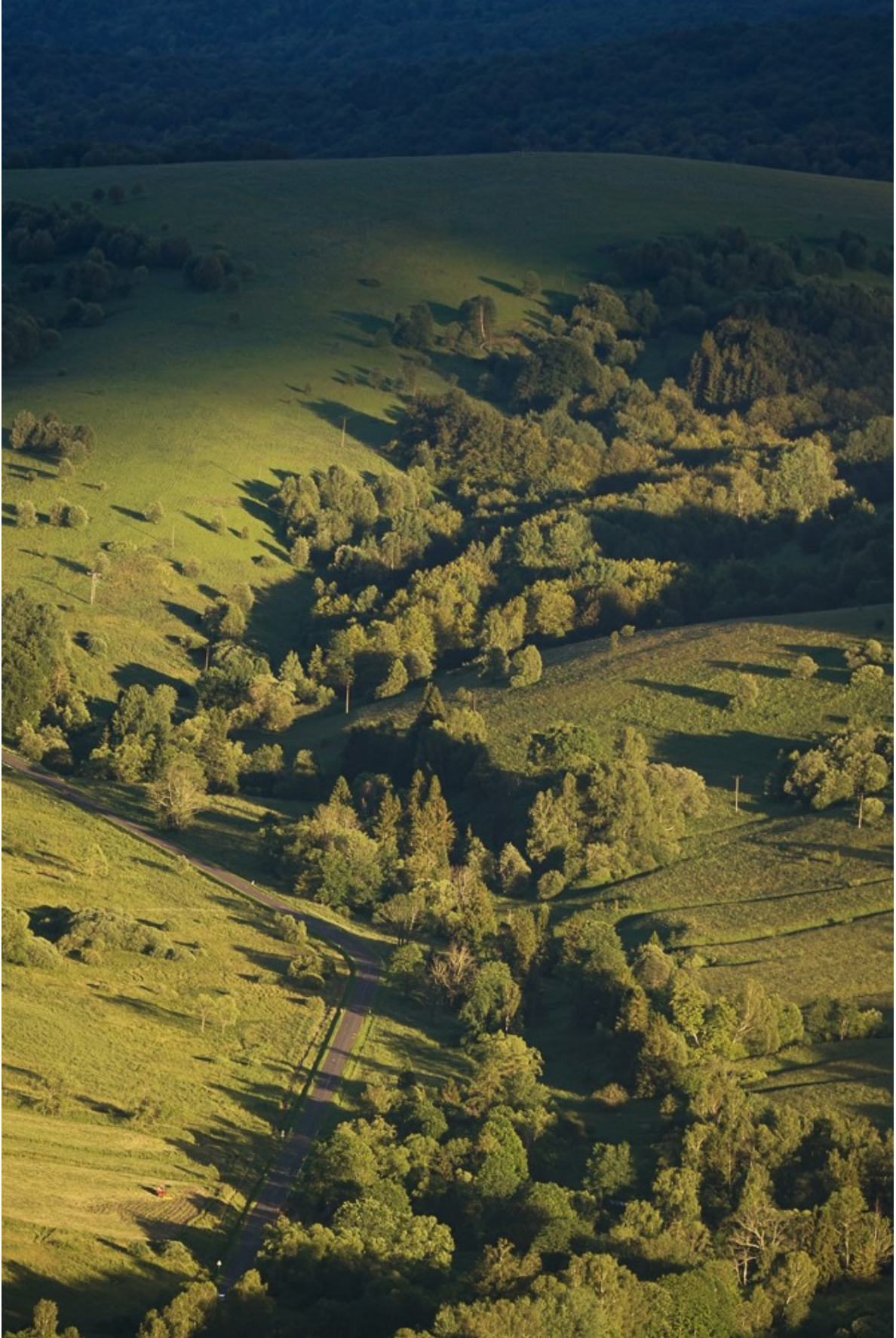
Sunset view from the mountain ridge