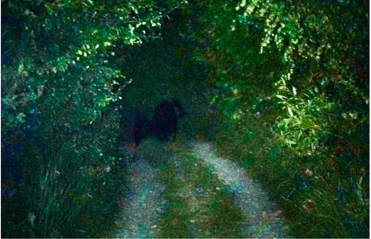
Brown bear and 2 cubs (left)