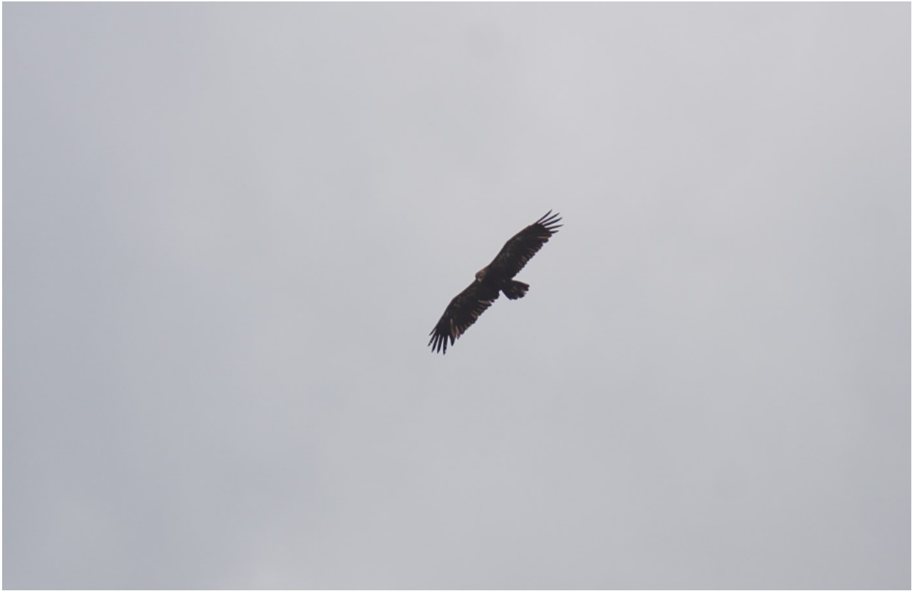
Probably lesser spotted eagle (above and under) (anyway a type of eagle...)