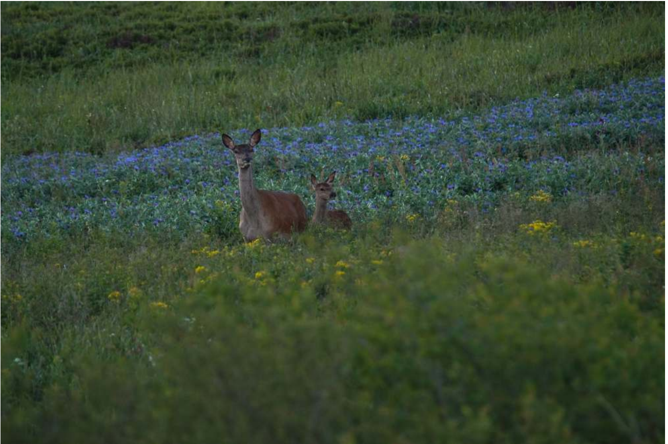
Red deer and calf in the meadow on the ridge from the Wetlina walking track