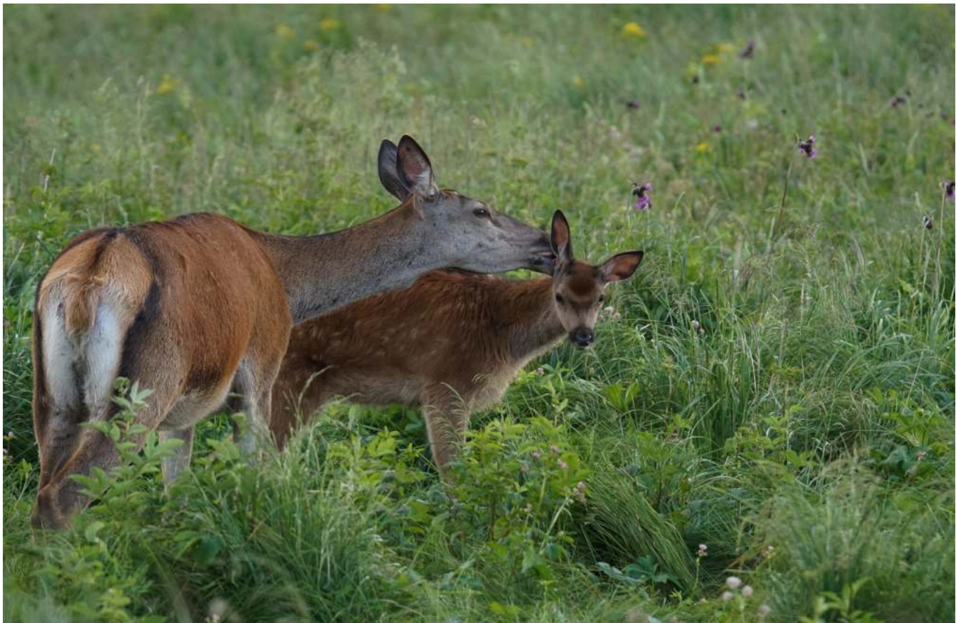
Rather exceptional photo opportunity of red deer for me