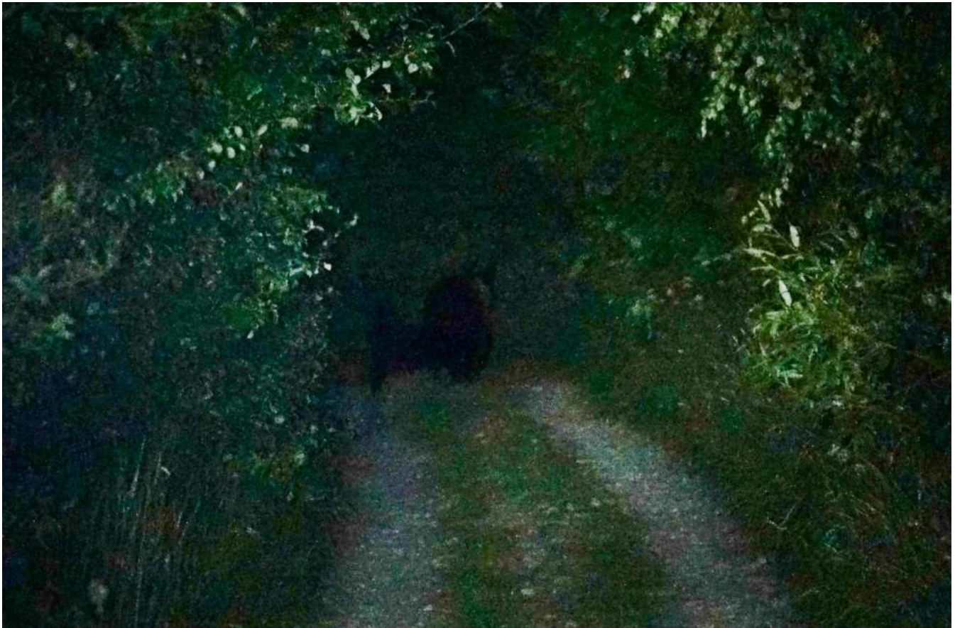
See the 'golden' patch on the bears neck