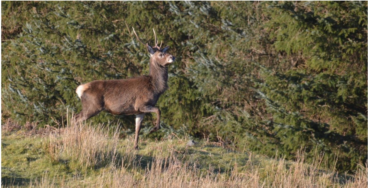
Above and below Red Deer

Friday 12 th . We saw a few Red Deer , Common Seals and a Grey Seal whilst we were still on the Peninsular. But by late morning we were making our way back to Edinburgh and our late afternoon flight back to London City Airport.