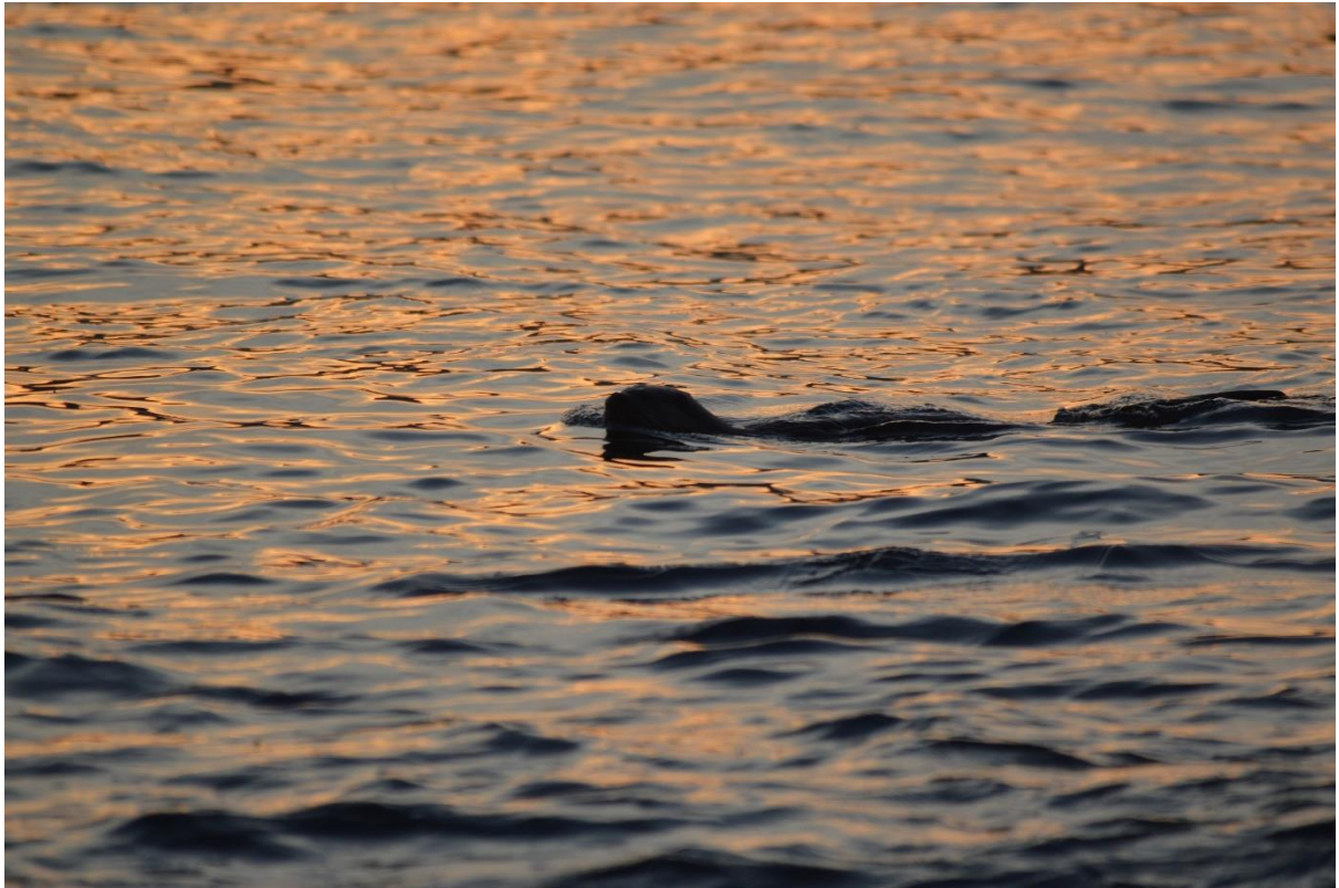
Otter above and below