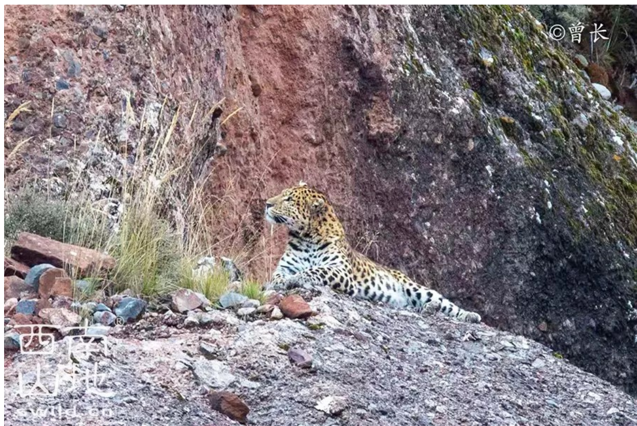
He ran up to the top here and looked around