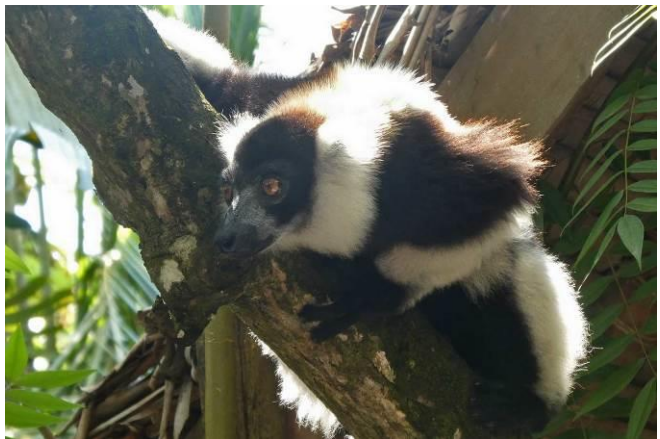
Black and White Ruffed Lemur