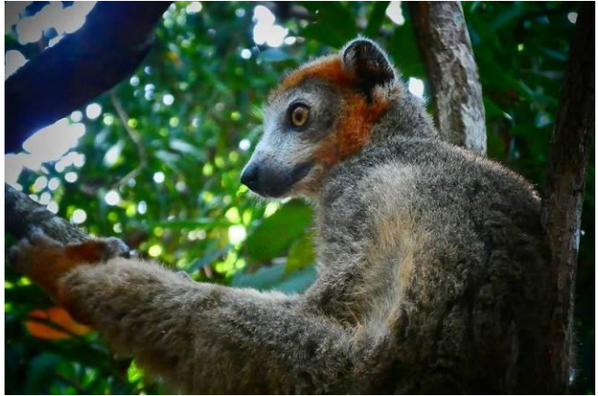
Red-fronted Brown Lemur