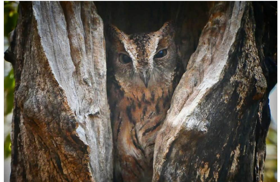
Rainforest Scops Owl