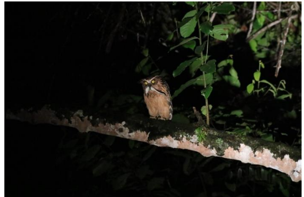
Buffy Fish Owl