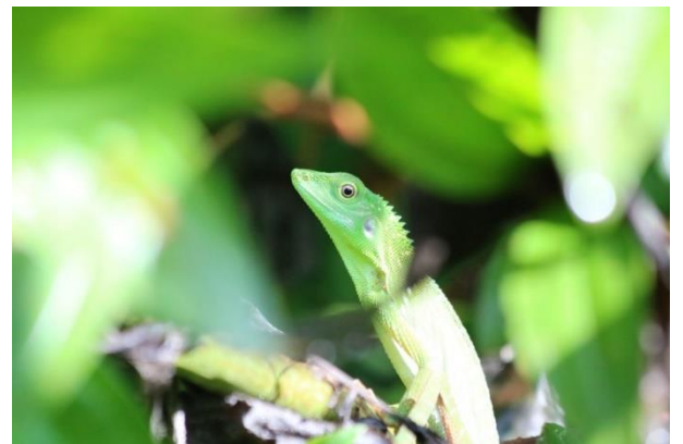
Green Crested Lizard