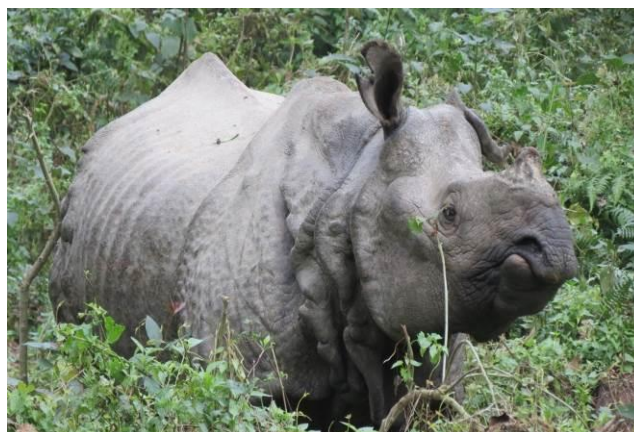
Greater One-horned Rhino