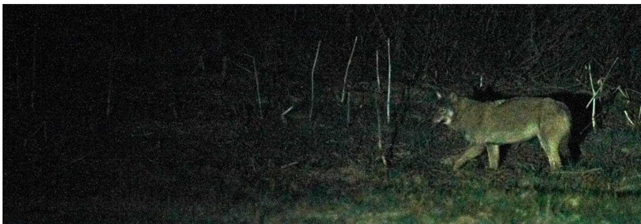
Night shot of roadside Wolf

www.instagram.com/naturetrek_wildlife_holidays