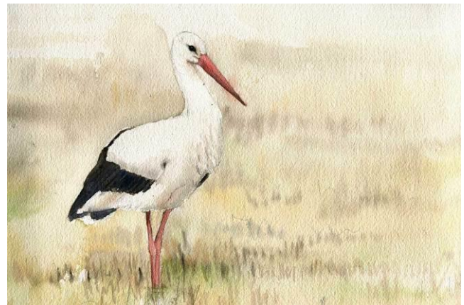
White Stork painting by Detlef Tibax