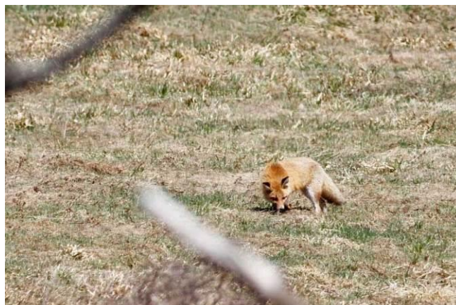
Red Fox hunting voles