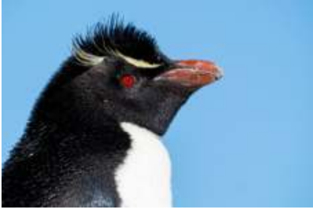
Southern Rockhopper Penguin

later. Magellanic Penguins are common on the island. The south-eastern point has a colony of Southern Rockhopper Penguins , which is the main target of the tour. It's awesome to walk between these birds and see where they get their name from. We spend about 1-1,5 hours between them. Macaroni Penguins sometimes show up on this island from March on. We had a few Snowy Sheathbills between the Penguins.