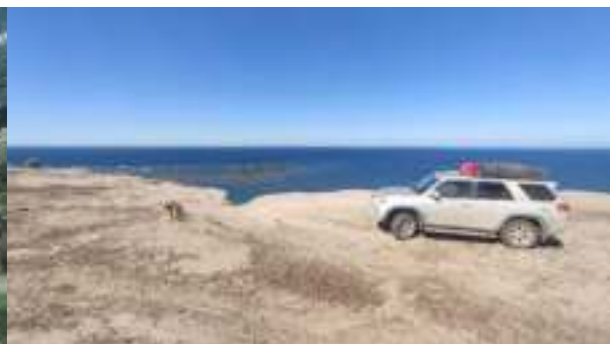
Forrest on the cliffs at Punta Ninfas