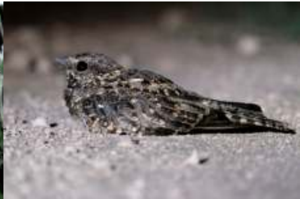
Probably female Scissor-tailed Nightjar

The next morning we tried a spot (thanks eBird) for Pampas Pipit , and luckily we had one singing bird high up in the air ( -38.0474, -62.34222 ). Most pipits were not vocal these days, so ID-ing them was hard -or even impossible-, even with the book next to the pictures.