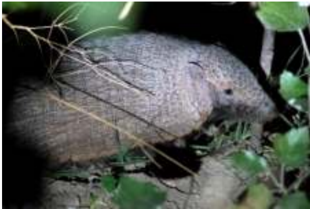
Large Hairy Armadillo

A bit later we had something large crossing the street, and soon we saw two other individuals crawling into their burrows: Plains Viscachas ! After that we only found 31 Burrowing Owls on the roads, but nothing else.