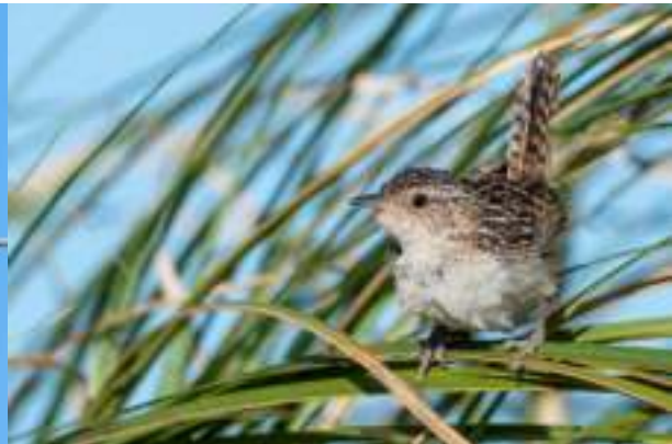
Grass Wren (Pampas)