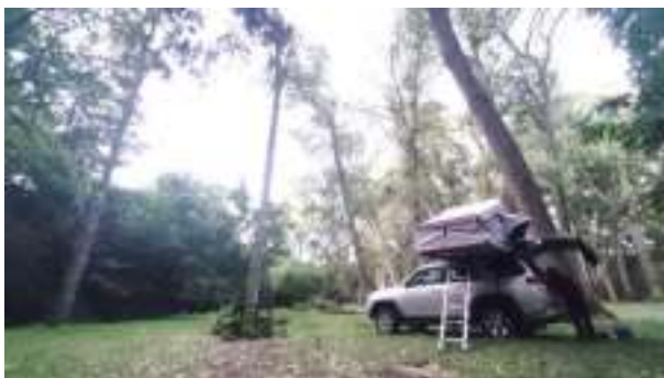
Our loyal friend Forrest at RN El Destino

Our transportation in this trip report was of course our Toyota 4Runner SR5 4.0 2010 (2x4) called 'Forrest'. We bought this car in Santiago and got it converted so that we could sleep in it as well. A car with high clearance isn't needed per se in Argentina, and most places can easily be visited with a normal sedan. There are lots of gravel roads which we took with great ease, which take (way) longer with a normal sedan, but are doable. Rain could make lots of roads unpassable though, as ground turned into mud and a slippery clayish layer formed. This even caused trouble for our 2x4 car and even other 4x4's at places like Punta Ninfas.