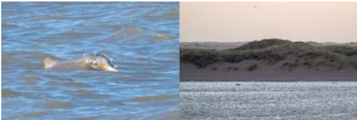
La Plata Dolphin / Franciscana

For the tides: www.es.wisuki.com/tide/4002/el-condor