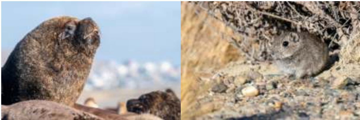
South American Sea Lion

We saw a big fluke several times on the ocean, but we couldn't see any fins or tails and had to be satisfied with leaving it ' whale spec '.