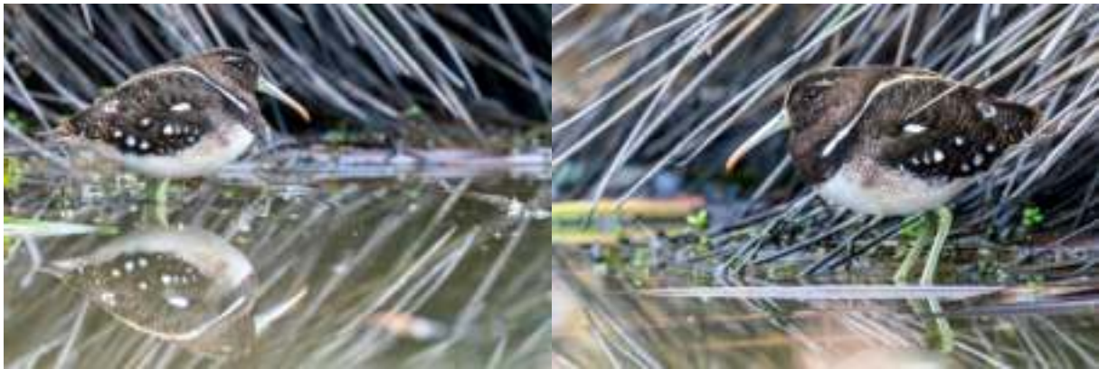
South American Painted-snipe

However, hidden underneath the sedges was one Painted-snipe! We came back in the evening, crawled underneath the fence and searched more of the marsh, but only found one other individual. The next morning we found it on the same spot, and after walking into the marsh (with boots) I found a couple more snipes. One of them was quite obliging! In total we had 4-5 individuals here, but there are reports on eBird with 65 individuals! Lots of Coypus here, as well as common birds species we hadn't seen further south yet.