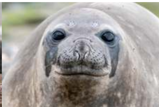
Southern Elephant Seal