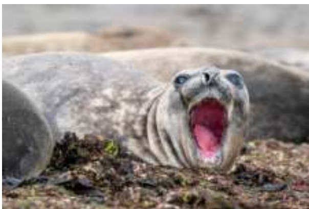
Southern Elephant Seal

Punta Ninfas is the place where BBC filmed a part of their documentary on the Orcas hunting Seals by beaching themselves. This only happens at high tide, and the best months are October – December and March-April. We watched two high tides but didn't see them.