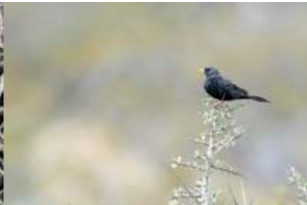
Carbonated Sierra Finch