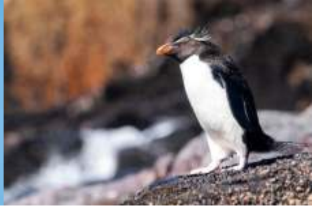
Southern Rockhopper Penguin

On the route back towards the boat we took some more time for the Brown Skuas as well. The beach near the small dock holds a colony of South-American Sea Lions , between which there were 4 Elephant Seals . On route back they sailed along a few islands with many more Sea Lions, some more Snowy Sheathbills and Dolphin Gulls . They also paid more attention to dolphins on the way back. We had 2 Commerson's Dolphins playing alongside the boat. Later on we also had 2 Paele's Dolphins next to the boat. Unfortunately they only spend less than 5 minutes with both Dolphin species. They said they had another group, but after we had lunch 1,5h later they were still at the dock... That would be the only negative on a further awesome trip!