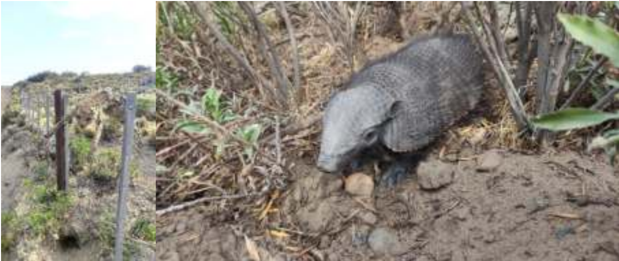
Creepy dead cat