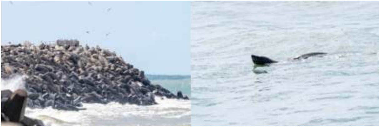
South American Fur Seal colony