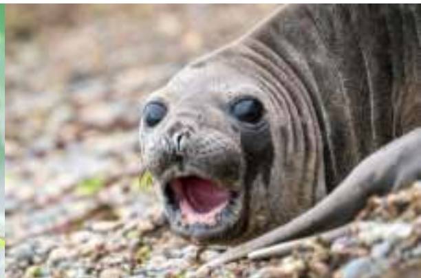
Southern Elephant Seal