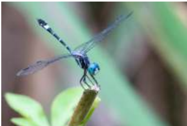
Austral Dasher ( Micrathyria hypodidyma )