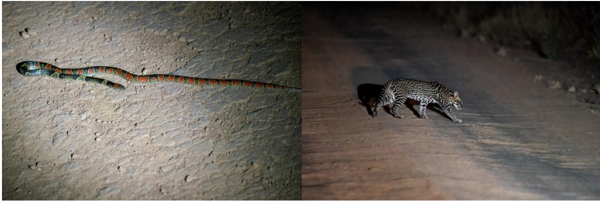
False Coral/Diamondback Flame Snake