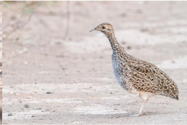
Brushland Tinamou (without raised crest)