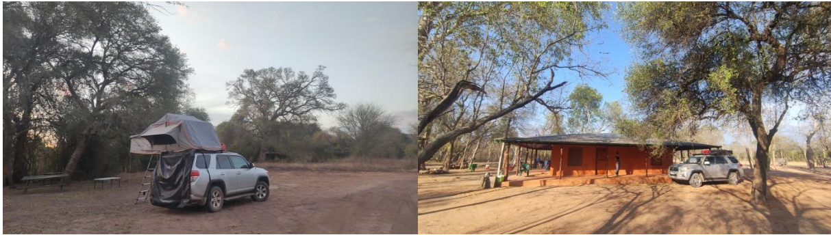
Our loyal friend Forrest at Cerro León