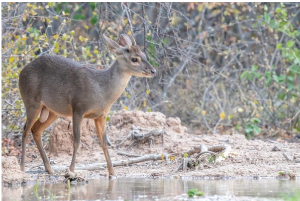
Common Brocket Deer

We walked one trail in the evening to search for mammals and herpetofauna, but only found one gecko species: Homonota marthae . Spotlighting the main road was very comfortable because it is tarred and in perfect condition, but other cars/trucks (about 4 per hour) drive fast so stopping is a bit more risky. We observed Barn Owl , multiple Pampas Foxes , a Crab-eating Fox and a Molina's Hog-nosed Skunk . The rangers had seen Geoffroy's Cat while walking a few evenings before. At the ranger station we found a beautiful Boulenger Oven Frog ( Leptodactylus bufonius ).