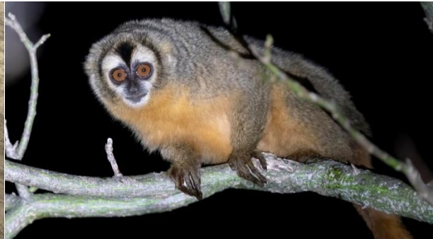
Azara's Night Monkey