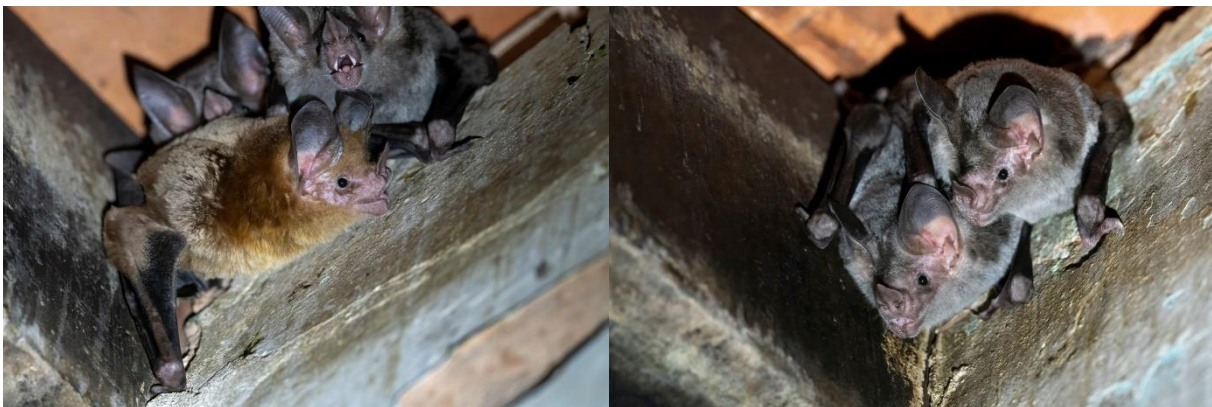
Greater Round-eared Bats

The water pool north of the ranger station housed 2 Greater Capybaras , and we encountered a Crab-eating Fox all three nights we were there. One of the nights a Crab-eating Raccoon was in the water's edge searching for food. While walking the short trail at night we found a Chaco Pericote/Chaoan Leaf-eared Mouse ( Graomys chacoensis ).