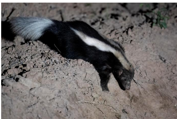
Molina's Hog-nosed Skunk

This is a breeding centre for the endangered Chacoan Peccary, which they breed to release again in the wild (mainly the Alto Chaco region: Cerro Leon etc.). There is a small reserve next to the breeding centre with a circular trail of about 4km, and a 1.8km long side trail which ends at a pool. We walked the trail early morning and quickly encountered Black-legged Seriema . Chacoan Mara is relatively common around here, but quite shy. We heard Quebracha Tinamou calling shortly, but didn't see it. White-banded Mockingbirds , an Austral migrant, was quite common here too.