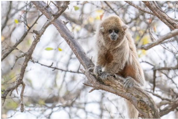
Pale Titi Monkey

- 16 July 2022, 04.40-09.30, 30km one way/60km total + 25km on a private estancia. In the hope that without much traffic the road would produce more cats, we decided to drive early in the morning. There were no cars/trucks on the road until sunrise, but no cats either. We only saw 3 Crab-eating Foxes and again many Common Tapetis . Multiple locals pointed us towards the area around Estancia La Tormenta as a good place for Chacoan Peccary , so we aimed to drive around there at and after sunrise. We observed two groups of Pale Titi Monkeys on the entrance road to the estancia and got some sound recordings. We drove all the way up to the lagunas again, but saw nothing there. Driving back suddenly a group of 4 White-lipped Peccaries crossed the road! As in the photos of Cheryl (2021) their fur was really dark black, different from the ones in Emas NP, Brazil.