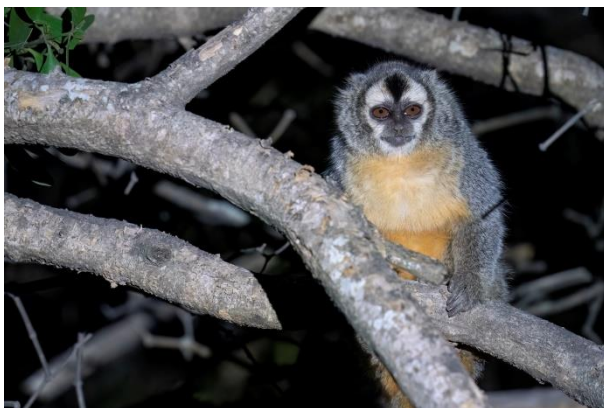
Azara's Night Monkey

The main reason for us to come here was for the Azara's Night Monkeys that hang around the main building. One of them is an escaped captive from the neighbour, but it found a mate and now there are 4 of them. Be ready right after sunset, when they come out of their roost, which was on the neighbours' property at the moment. After sunset we quickly encountered the 4 of them in the trees above the fence between the two properties, while they crossed to get to the water tank at Estancia Iparoma to drink water. Later at night we searched for them again, but couldn't find them. Around the same area is where we had our only Cinereous Tyrant on both days.