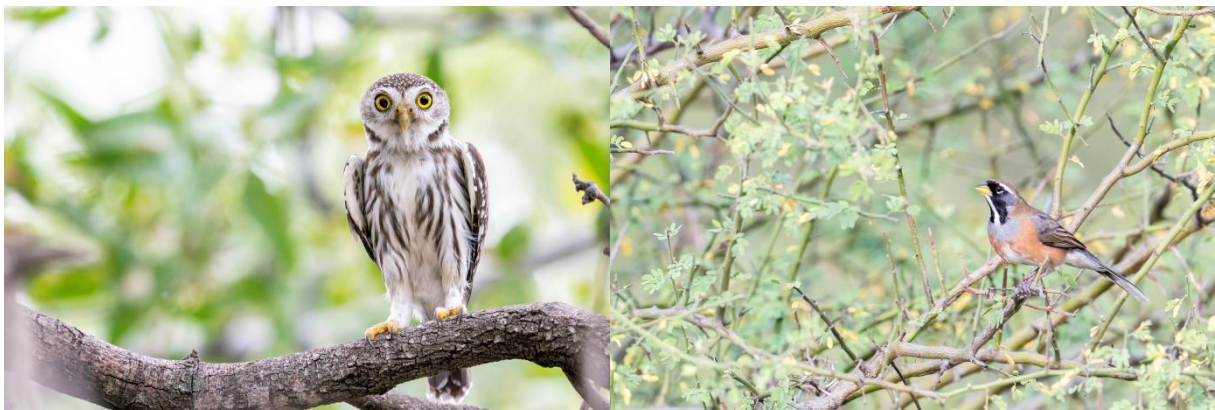
Tucuman Pygmy Owl

We didn't reserve up front and encountered closed gates. The gates were not too high so we birded the area anyways when we couldn't find anyone. There was some (salt) water left in the area, but most lagunas were dry. Lark-like Brushrunners were present between the two entrance gates. A trail goes south, straight towards a (for us dried up) laguna on the west. This is where we encountered Many-colored Chaco Finch and Olive-crowned Crescentchest . Tucuman Pygmy Owls (ssp. tucumanum , a likely split from Ferruginous Pygmy Owl) were quite common and started calling just before sunset. We encountered one on the road going to the right before the first gate. We camped at the end of that road and also heard Tropical Screech Owl and Great Horned Owl in the middle of the night. Near the modern cattle farm along the entrance road we observed a Chaco Puffbird .