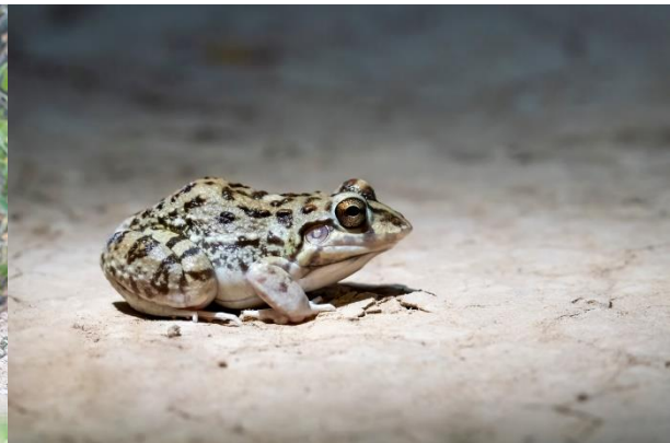
Boulenger Oven Frog