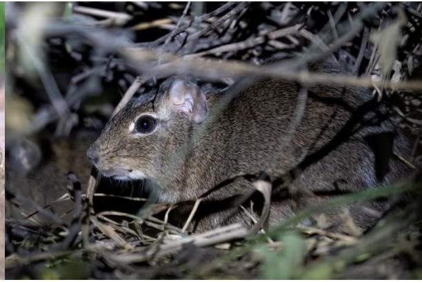
Lowland Yellow-toothed Cavy

- 13 July 2022, 16.10-20.30, 27km one way/54km total. The second evening we drove this road in the hope of seeing the Jaguar again, hoping she would have some kind of routine in her day. Just before we arrived at the water hole we observed two different groups of Pale Titi Monkeys just before dusk with in total 7 individuals. On the road we observed Ringed Warbling-finch and at the water hole we heard Great Horned Owl . Driving the road further after the water hole we saw fresh Jaguar tracks in the sand parallel to the road that weren't there the night before, indicating the individual we observed continued her path after we left or the presence of another individual. Further west we observed Crab-eating Foxes and a Pampas Fox , as well as a False Coral/Diamondback Flame Snake ( Oxyrhopus rhombifer ) .