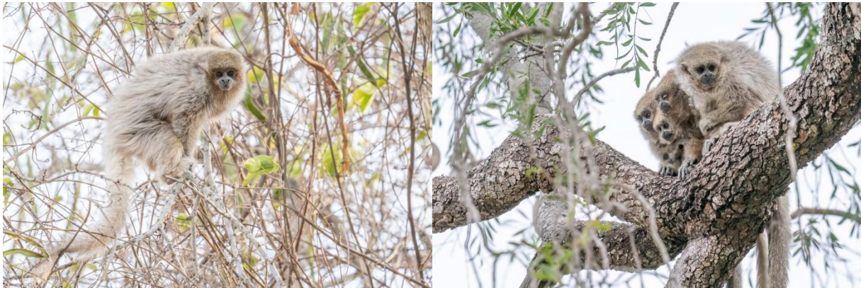
Pale Titi Monkey

There are quite some plots where all the shrubs have been cleared, and Edgar said they are going to build a school, health centre, church etc. there, so we expect that Agua Dulce is going to grow into a little village during the coming decade and all surrounding roads will become busier.