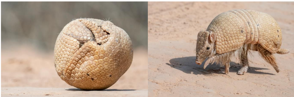
Southern Three-banded Armadillo

We decided to drive the road to Cerro Leon from Madréjon during the day, as it was still relatively cold and the nights and mornings before had produced almost 0 good sightings. Another trip report (Bocquier, 2012) stated that a peccary hunter had told them that during cold days/nights cats walk the roads during the day. Cold is relative, but either \pm 20^{\circ}\text{C} isn't cold enough or the cats were walking different roads, but we didn't see any. The only mammal we observed was a cute-as-always Southern Three-banded Armadillo crossing the road. We suddenly heard a pishing sound and that turned out to be one of our tires being pinched by a thorn. Well, we thought it was a thorn but it turned out to be a piece of wood enough to make a decent campfire. After changing our tire we were now left without a spare, which altered our plans of staying multiple nights at Cerro León. The 5km entrance road is not in very good state, and we would advise to only drive to the water hole ( -20.43912, -60.32001 ) and maybe walk up to the viewpoint ( -20.43217, -60.3168 ) for a nice view of hilly Chaco. Unlike at the other parts of the park there are no beds to sleep on (just empty rooms, besides the Przewalsky's Geckos ( Phyllopezus przewalskii )), nor is there electricity or water. There is ample space to camp though, and we had a nice quiet night.