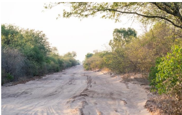
Chaco road towards the border