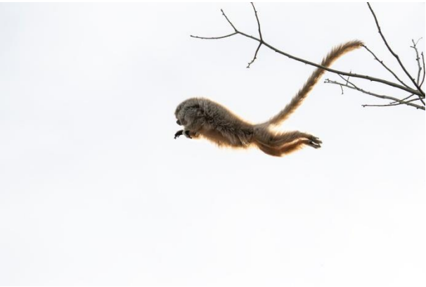
Pale Titi Monkey