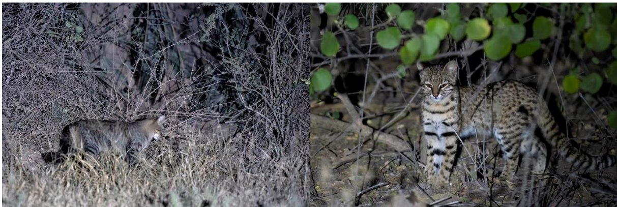
Possible hybrid domestic x Geoffroy's Cat

Armadillo and close to the (remnants of the) salt lagoons we observed a group of 6+ Collared Peccaries . Driving further towards the main road (Linea Sur) we passed lots of farms, but in between were still good patches of forest with good grasslands next to them. A Common Brocket Deer later, we again observed a cat. Disappointed that it was clearly not a Geoffroy's Cat. A heavyset cat, a bit larger than a normal domestic cat, but with a very interesting pattern: black feet, black bands above it, a blackish thick tail, a barely visible blotched pattern on its grey/brown back, large triangular ears, a pink nose, two stripes on the cheek, a white chin. Somewhat reminiscent of the Pampas Cat we searched in vain for 7 days a month before in Emas NP in Brazil. However, it turned out to be a domestic cat (probably hybrid between Geoffroy's Cat x Domestic Cat). Another one like this hung around Laguna Capitan, so be aware!