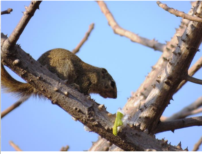
Patas Monkey & Gambian Sun Squirrel