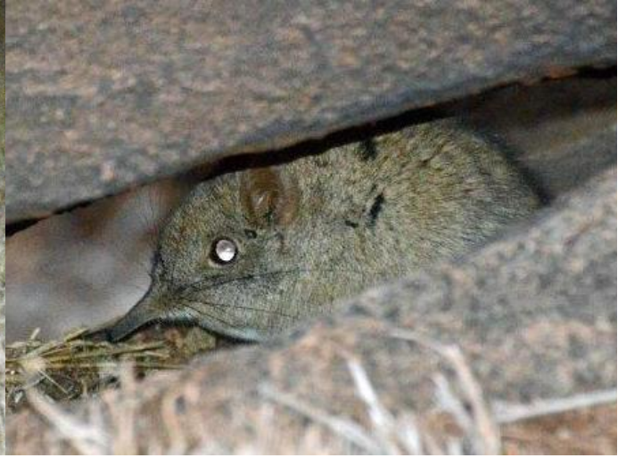
Karoo Rock Sengi