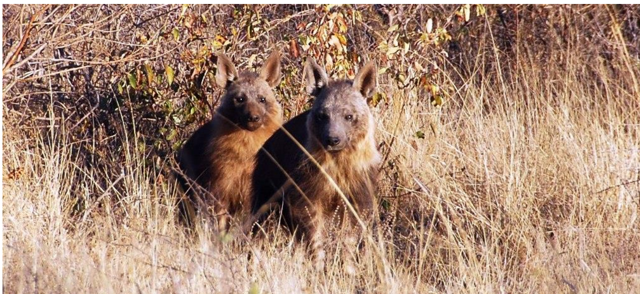
Brown Hyaenas