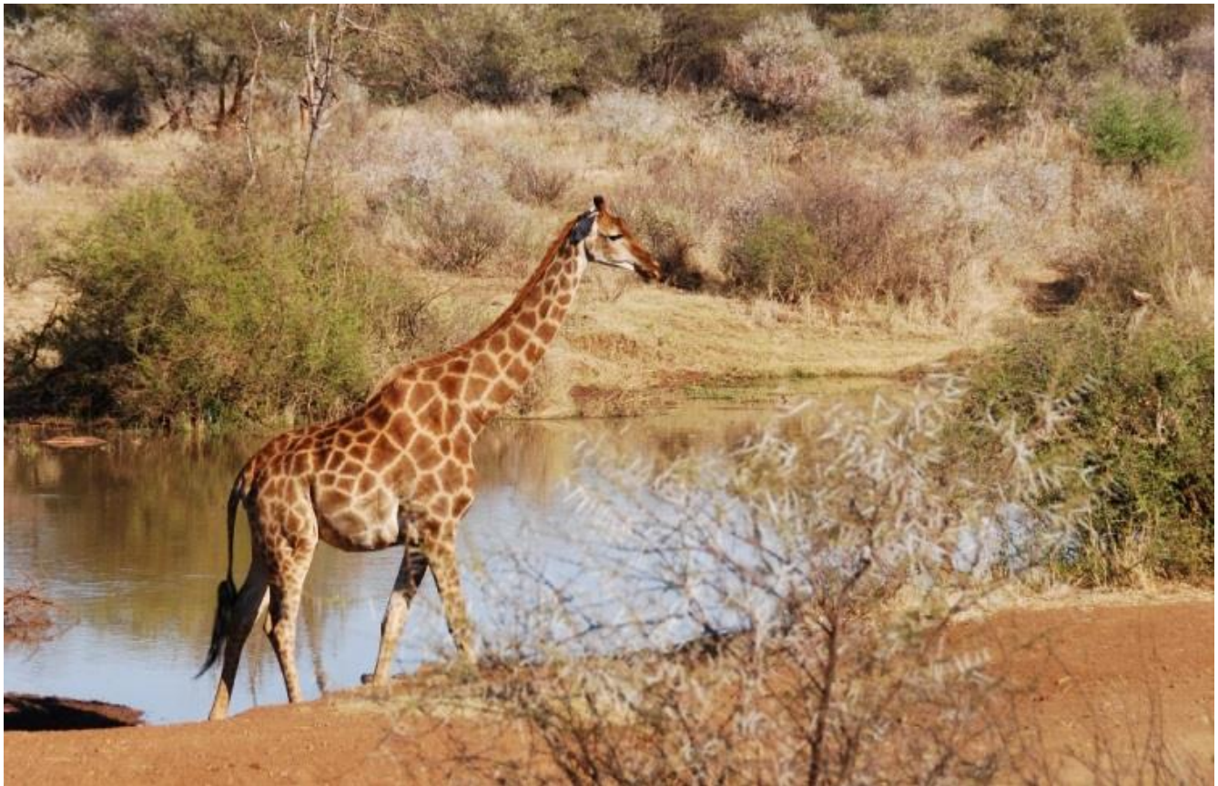
Southern African Giraffe (Fiona McHugh)