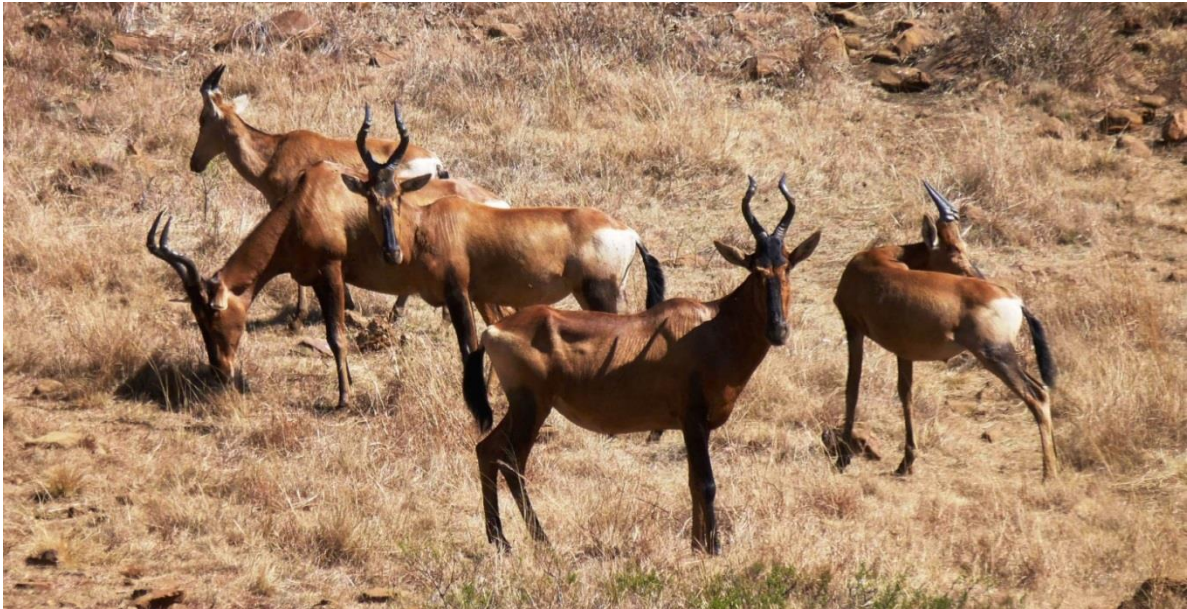
Red Hartebeest