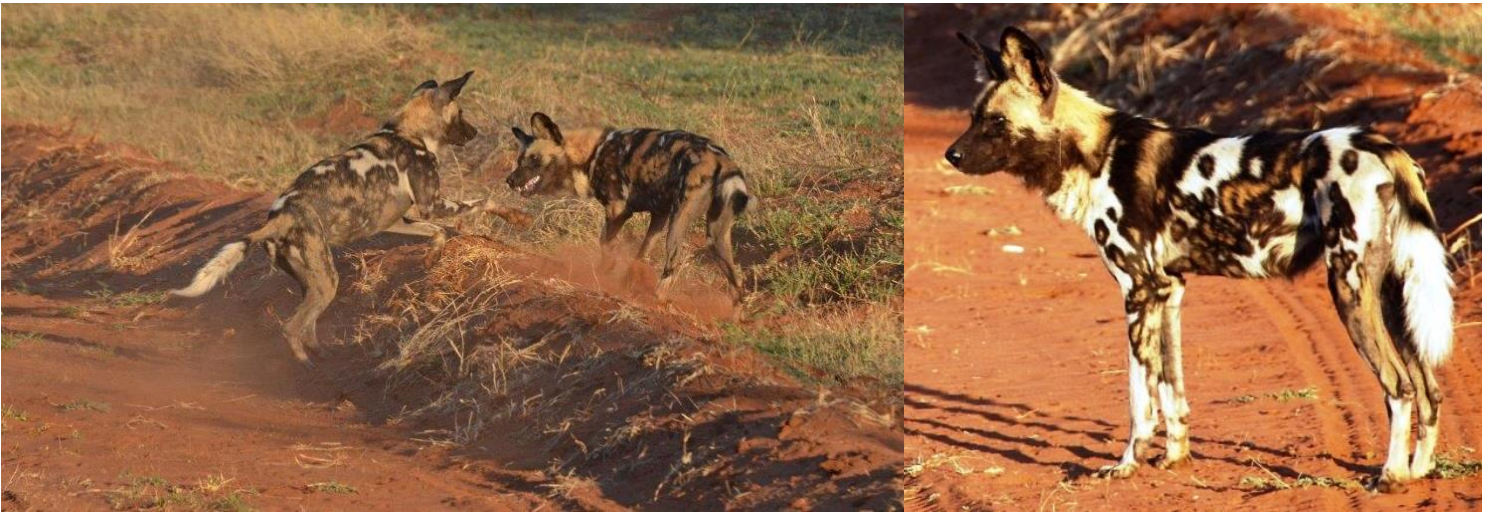
African Wild Dogs (Anita Lloyd/Fiona McHugh)