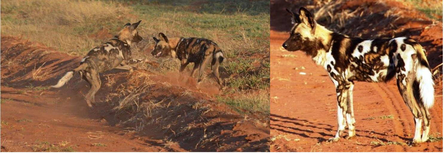
African Wild Dogs (Anita Lloyd/Fiona McHugh)