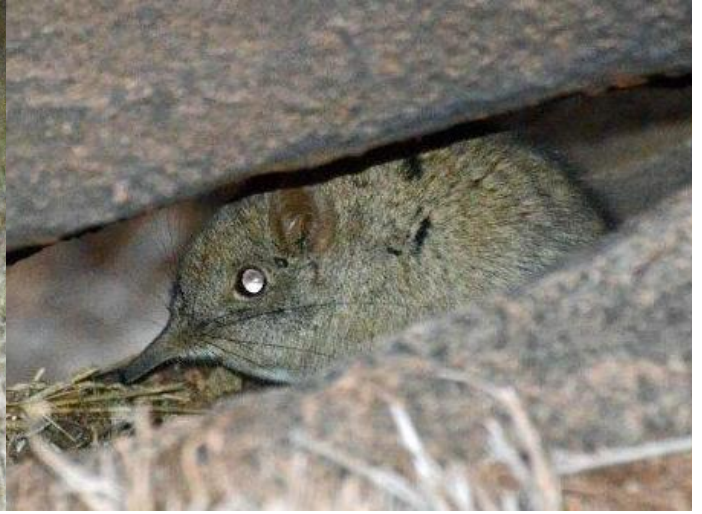
Eastern Rock Sengi