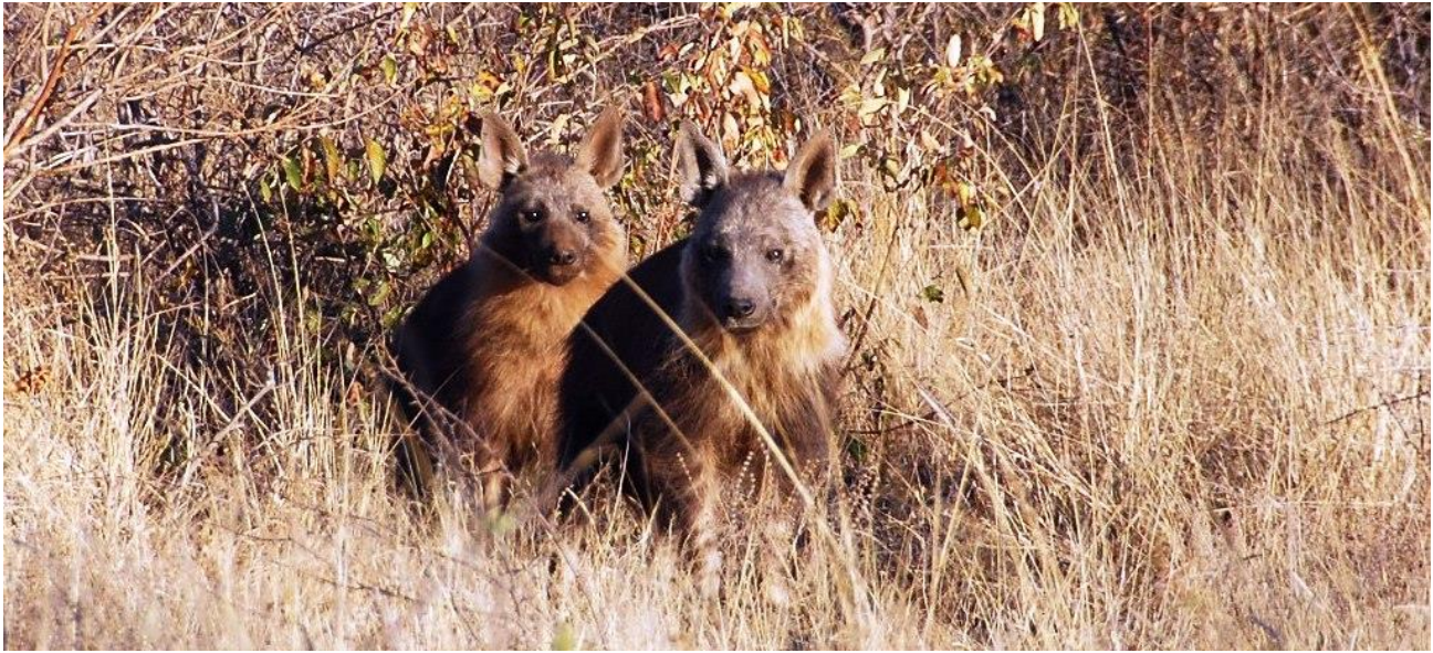
Brown Hyenas