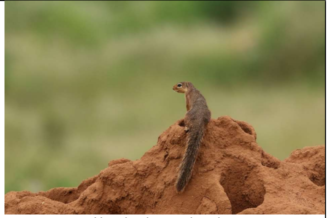
Unstriped ground squirrel