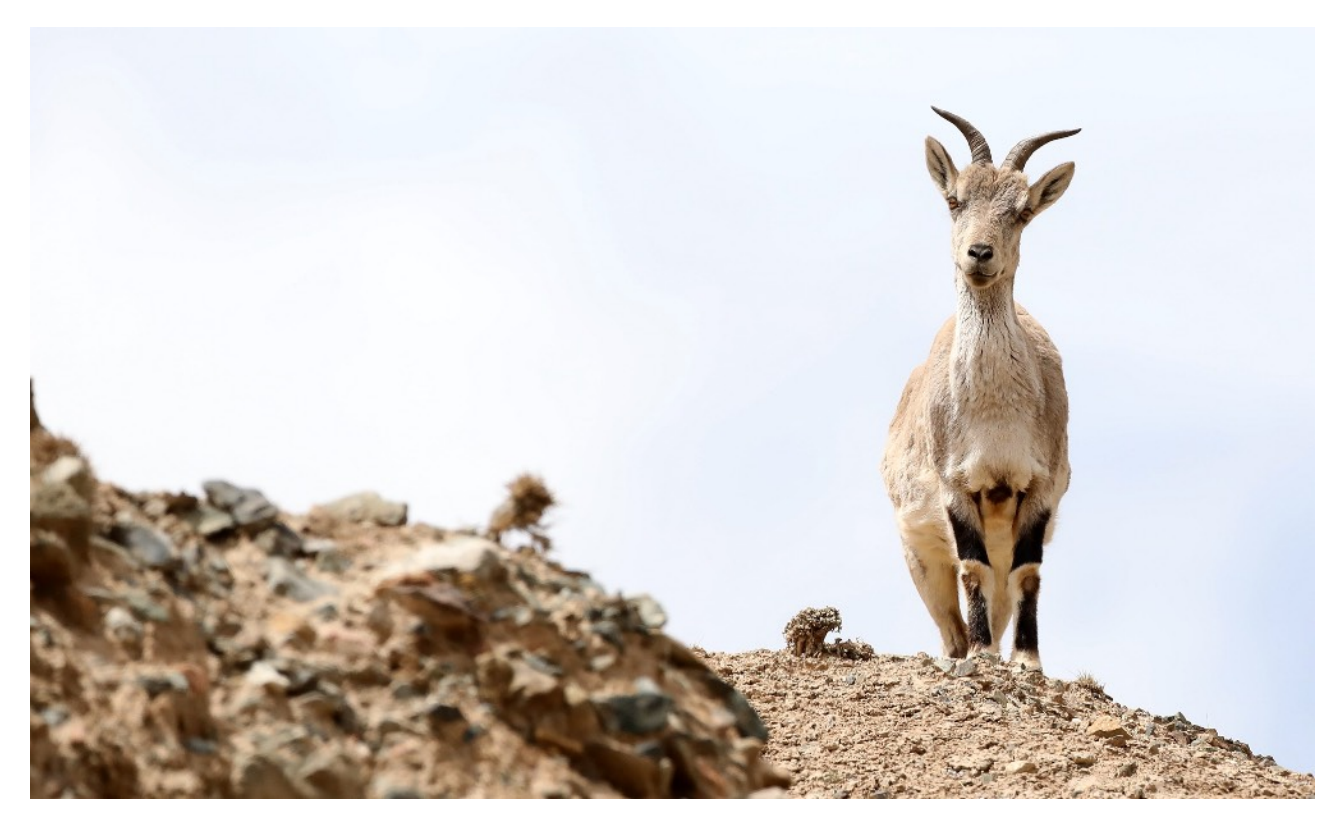
19 Sep 2021: Drive south to check the site for Chinese Mountain Cat and carry on to Yushu to stay, very good dinner to celebrate Chinese Mountain Cat@TangJun