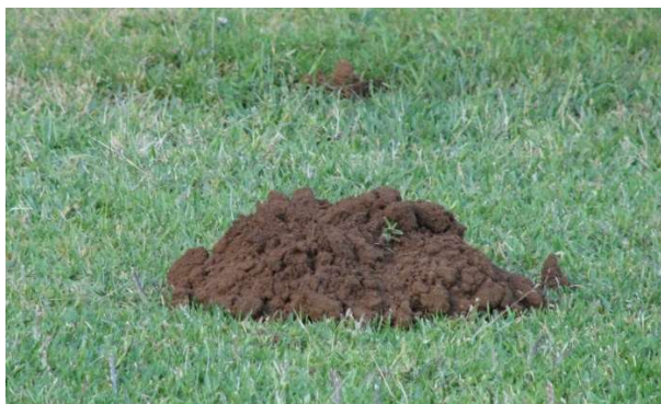
Common Mole-rat (Cryptomys hottentotus) was so close, but so far

Still, I recommend visiting Kirstenbosch. Download the article "Mammals at Kirstenbosch" (as pdf) from here: https://journals.co.za/content/veld/7/1/AJA00423203_1487#fullText_content