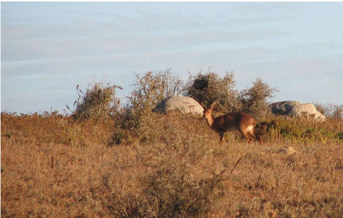
Male Steenbok (Raphicerus campestris)