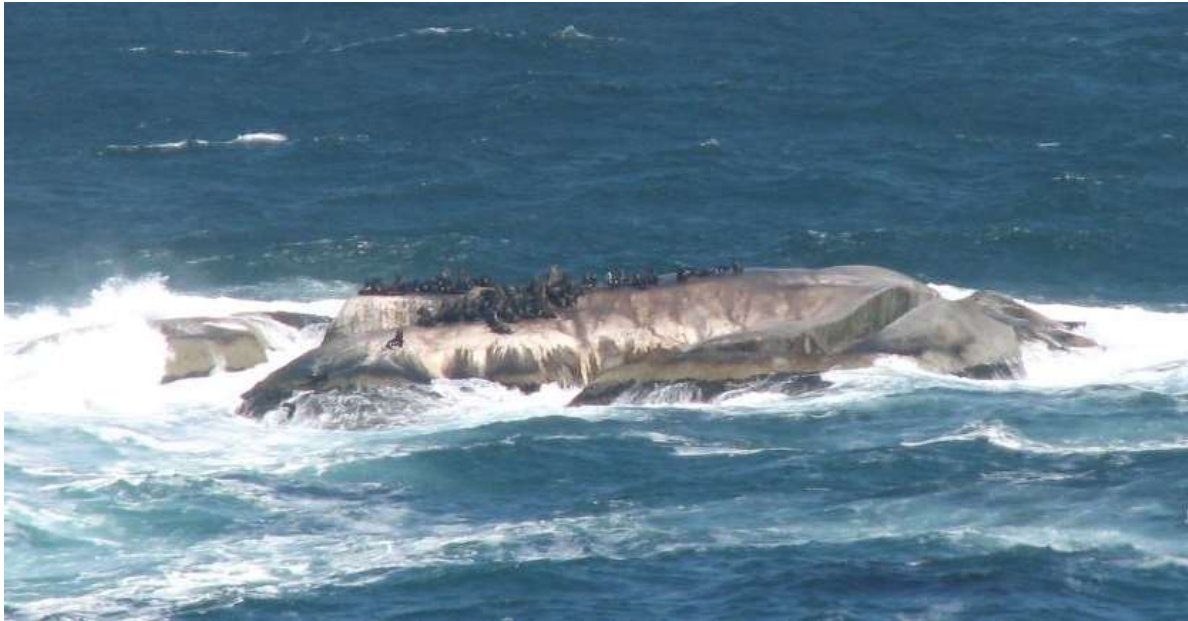
Cape Fur Seal (Arctocephalus pusillus) colony