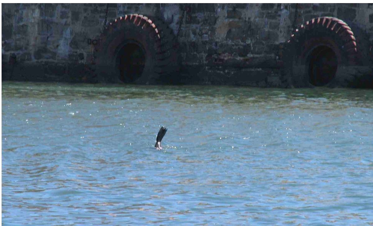
Cape Fur Seal (Arctocephalus pusillus), in Waterfront, Cape Town

I saw the first mammal species already during my first day in Cape Town, when I walked from my hotel to Waterfront shopping area in harbor. There it was, the first Cape Fur Seal ( Arctocephalus pusillus ), fishing actively in the dock. Cool! And naturally a lifer for me, like all the mammals I saw in South Africa.