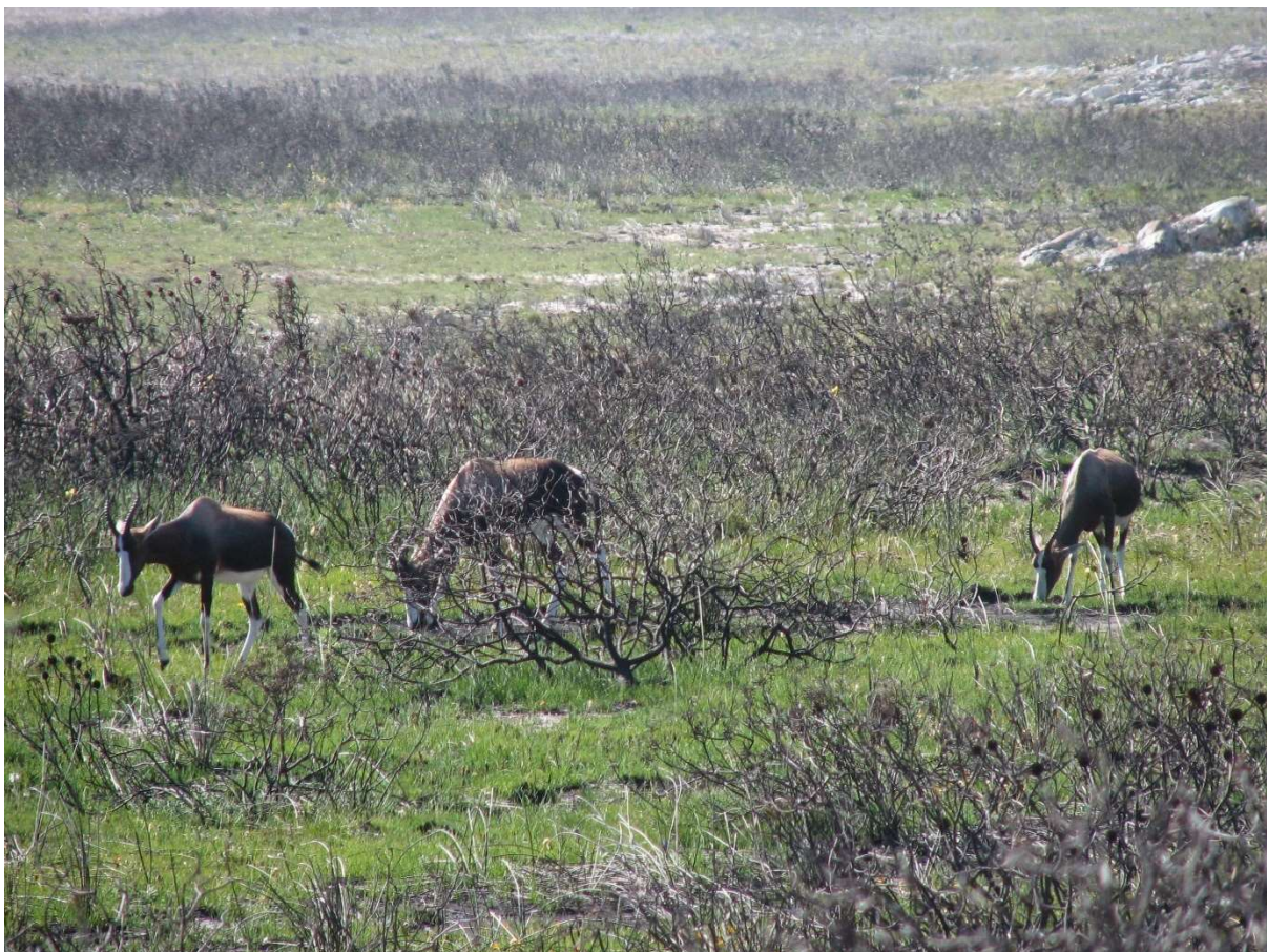
Bonteboks (Damaliscus pygargus pygargus) at Cape Peninsula National Park