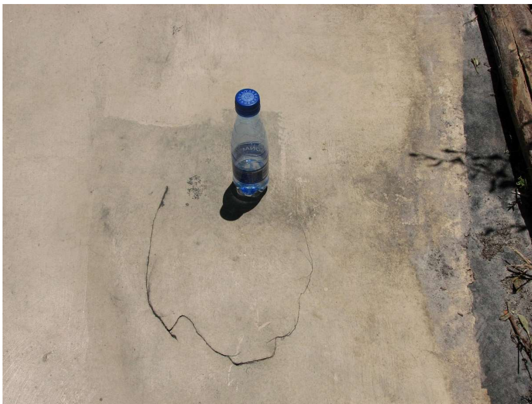
Hippo footprint and 1/3 liter water bottle