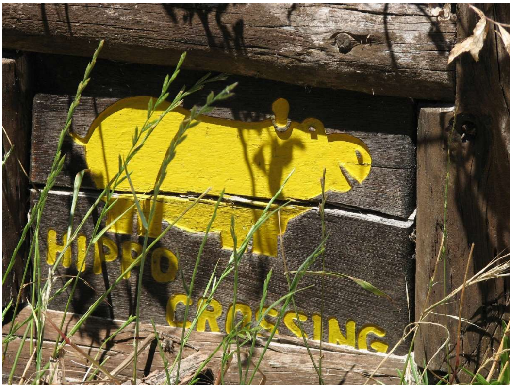
Hippo crossing at Rondevlei – but where are they?

the Hippos living in the area, but I had no luck, I saw just the footprints, Hippo path and warning signs, that's all, what a shame – and a good excuse to return to Africa someday.