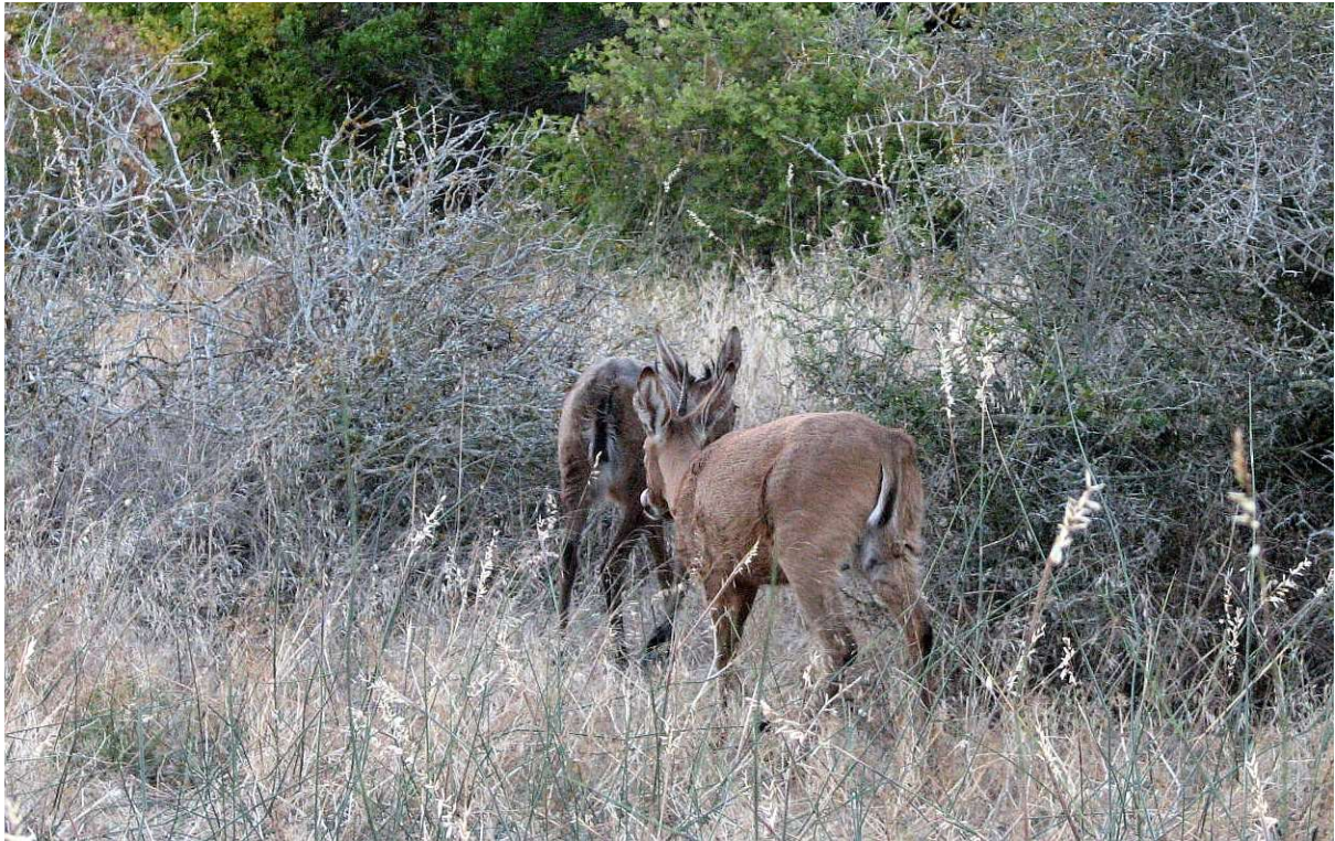
Two Common Duikers, the last mammals I saw in South Africa