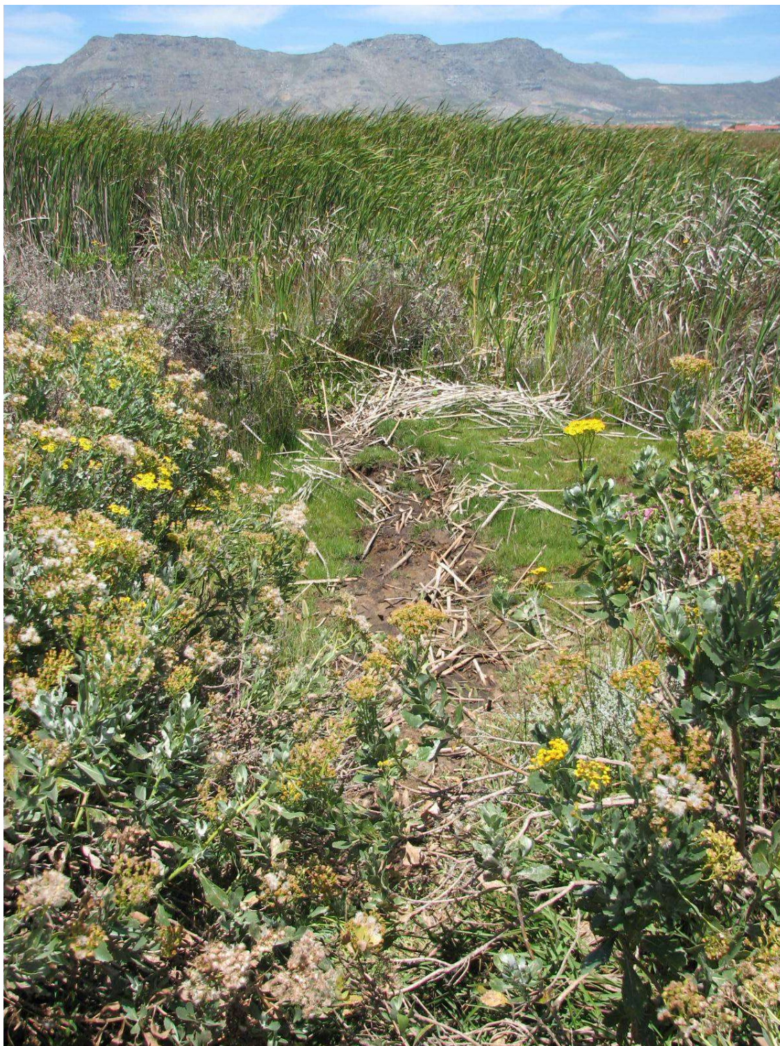
There they are hiding; the Hippo trail leads to reedbed

Next to Cape of Good Hope at Cape Peninsula National Park, where the nature was totally different, reminded me somehow of Lapland above Arctic Circle. No trees, windy and relatively cold, compared to warm, almost hot, inland. Not much birds in the area, but the mammals were really interesting! At first, we saw a big colony of Cape Fur Seals ( Arctocephalus pusillus ) in small islet out in the sea. Soon after that I noticed on the roadside two gorgeous antelopes, the Bonteboks ( Damaliscus pygargus pygargus ), subspecies which lives only in the peninsula area.