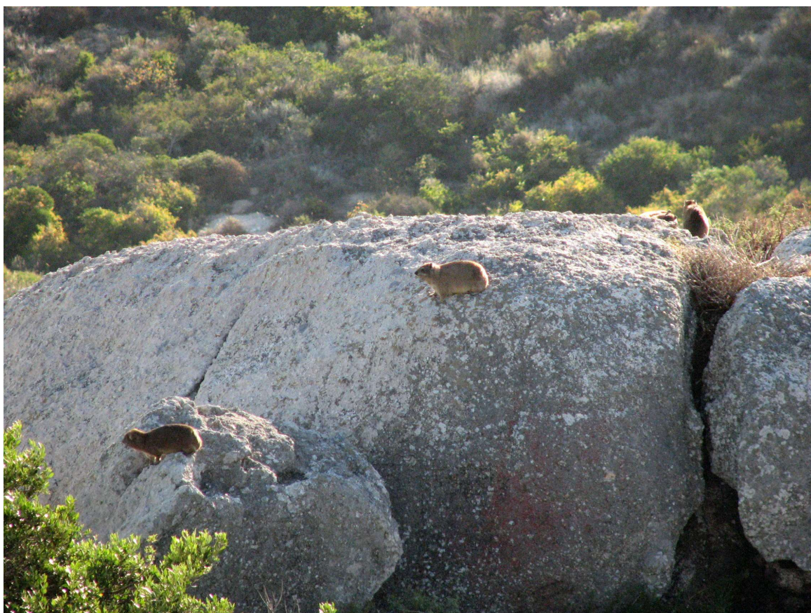
Rock Dassies (Procavia capensis) were easy to spot

It was cool to see that small cousin of Elephants, the Rock Dassie aka Rock Hyrax ( Procavia capensis ). There were tens of them, they were curious and showed themselves really well. Other species, we saw there, were a small antelope; male Steenbok ( Raphicerus campestris ) and Common Duiker ( Sylvicapra grimmia ). Steenbok reminded me of our Roe Deer.