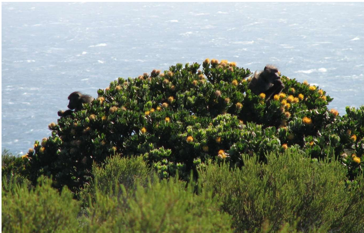
Chackma Baboons (Papio ursinus ursinus), Atlantic Ocean in background

We drove still further south, towards Cape of Good Hope. Soon I noticed something moving in flowering bush - another cool mammal but not an antelopes. They were sitting in a big green tree pincushion and eating flower; Chackma Baboons – also known As Cape Baboon ( Papio ursinus ursinus ). Wow!