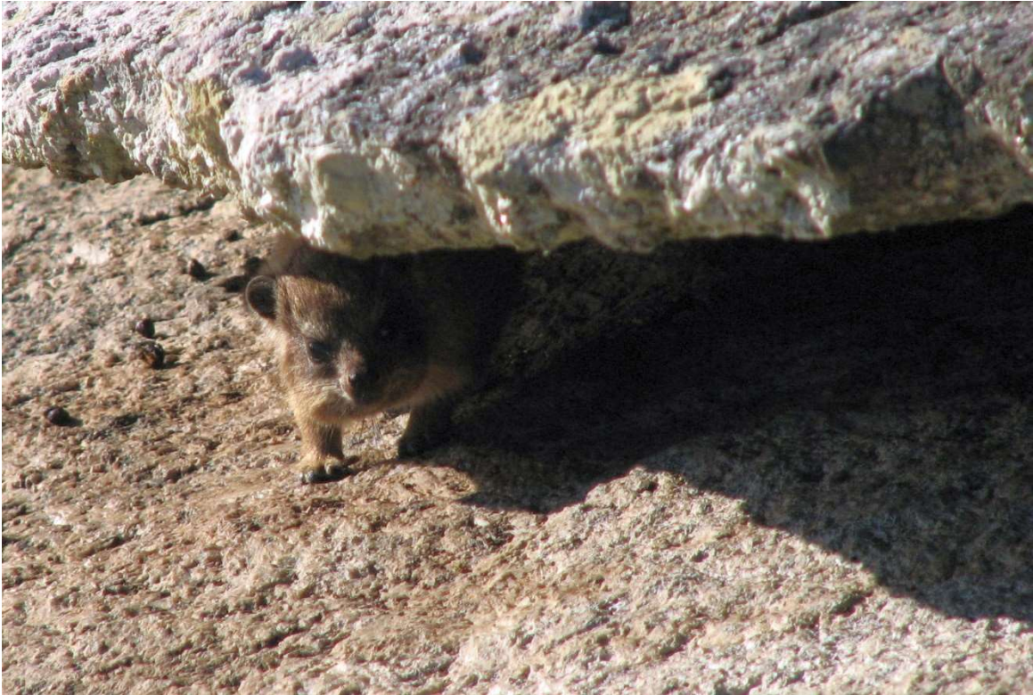
And they were really curious