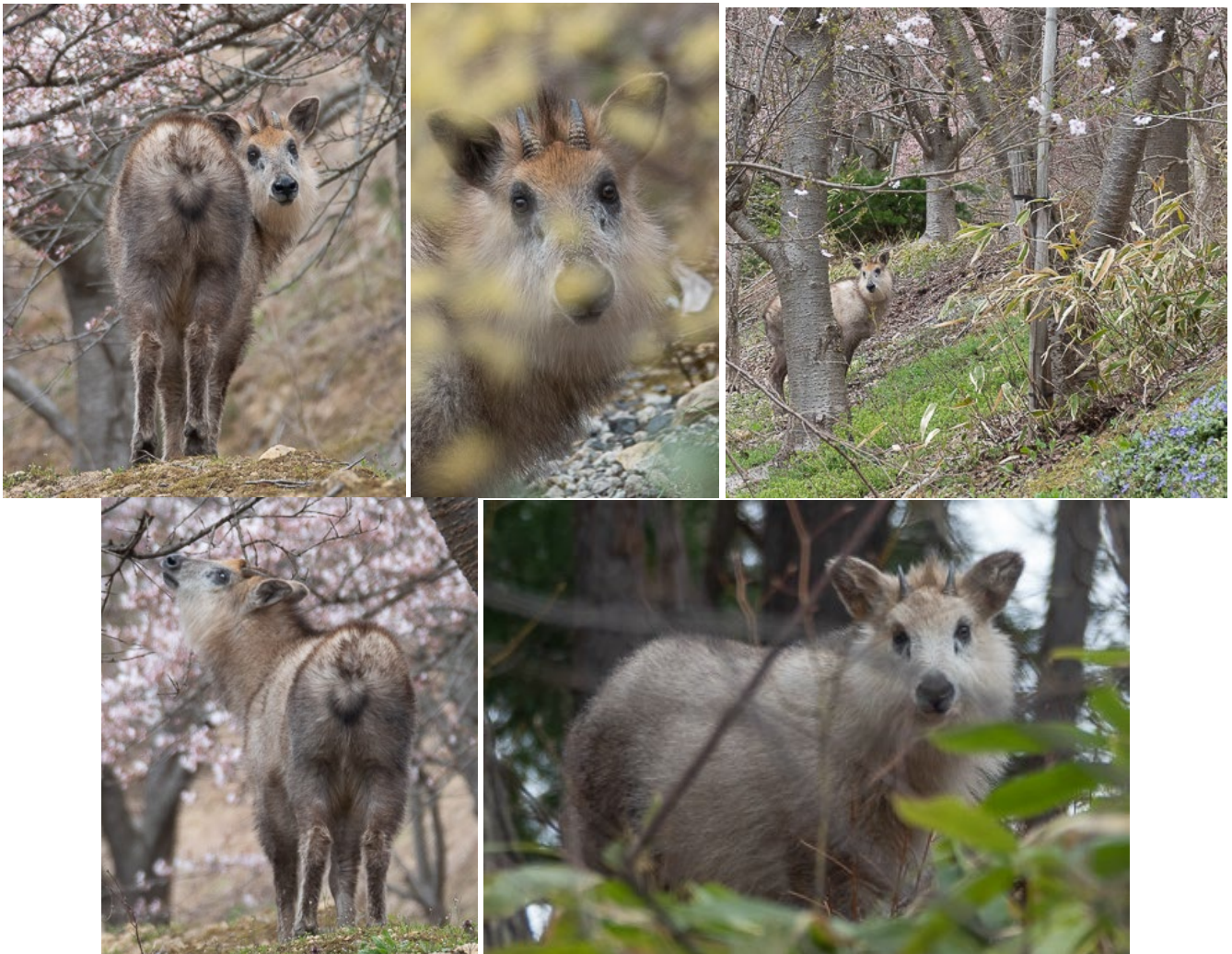
Japanese serows ( Capricornis crispus )