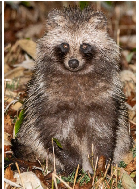
Japanese raccoon dogs ( Nyctereutes viverrinus viverrinus ) in a field and at a feeder.