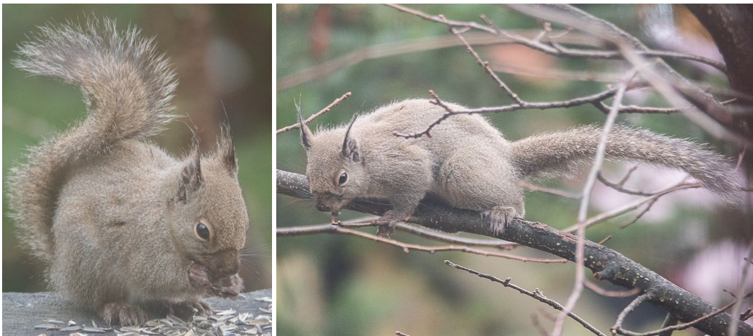
Japanese squirrel ( Sciurus lis )