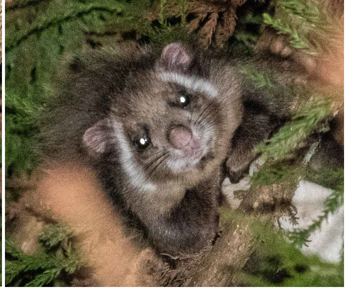
Japanese giant flying squirrel ( Petaurista leucogenys nikkonis )