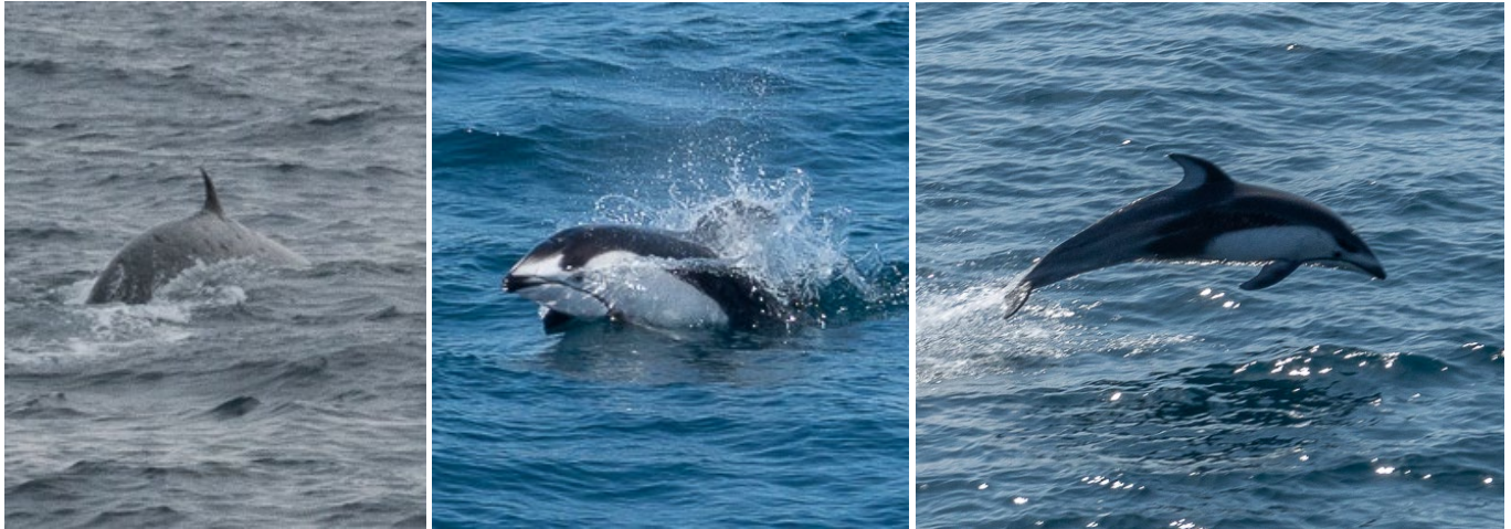
Eden's whale ( Balaenoptera edeni ) and Pacific white-sided dolphins ( Lagenorhynchus obliquidens )