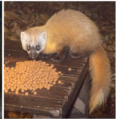
Japanese martens ( Martes melampus melampus ) in a field and at a feeder.