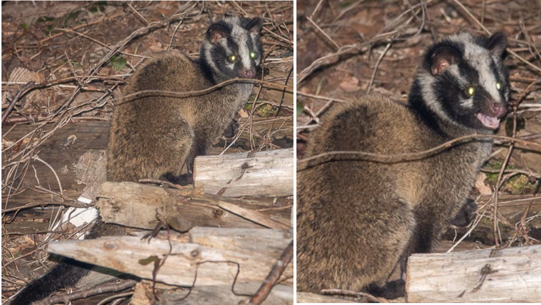
Masked palm civet ( Paguma larvata )