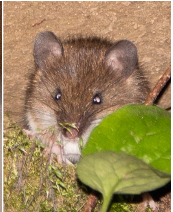
Greater ( Apodemus speciosus ) and lesser ( A. argenteus ) Japanese mice