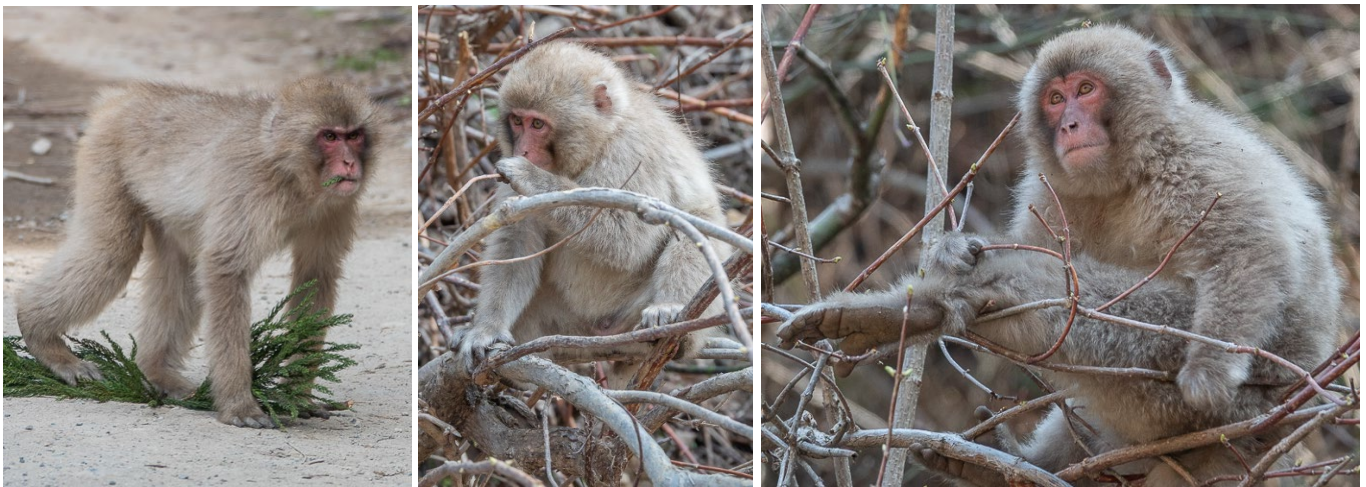
Japanese macaques ( Macaca fuscata fuscata )