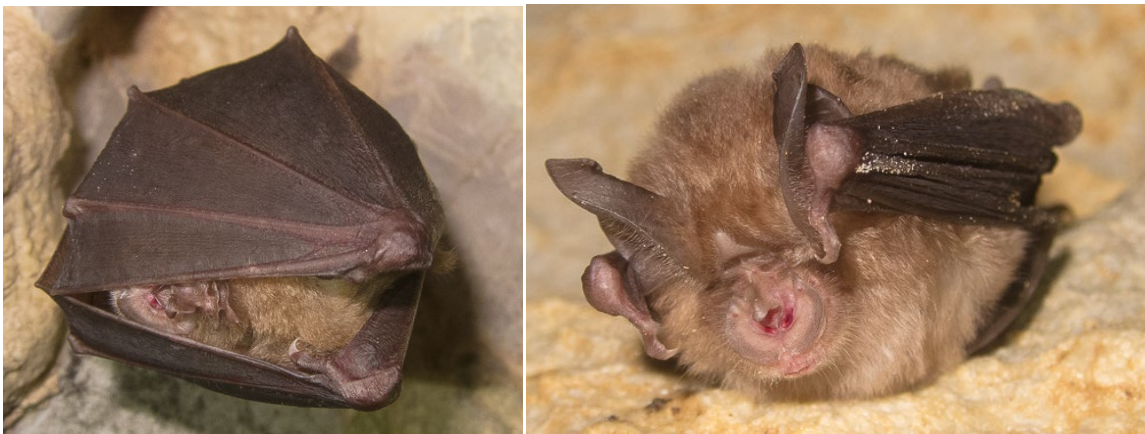
Greater ( Rhinolophus ferrumequinum nippon ) and Japanese ( R. cornutus cornutus ) horseshoe bats