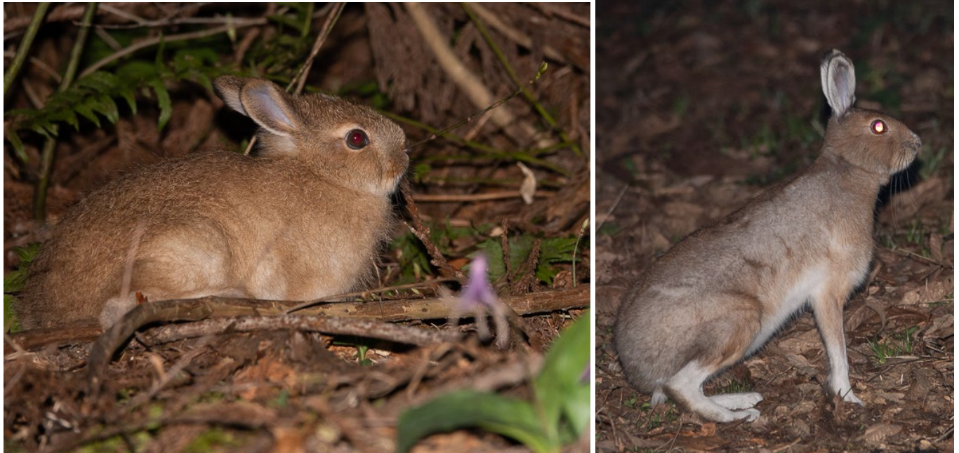
Juvenile and adult Japanese hares ( Lepus brachyurus angostidens )