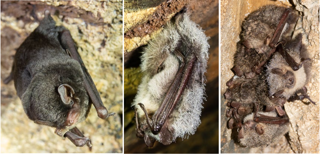
Oriental bentwing ( Miniopterus fuliginosus ) and Hilgendorf's tube-nosed bats ( Murina hilgendorfi )