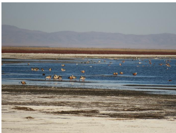
North shore of the Dalinuoer Lake

During the daytime we didn't get much. In the late afternoon we arrive at the north shore of Dalinuoer Lake and saw many birds. Before the sunset, we heard many small mammals calling in the grass, then we saw they were Daurian pikas. They were in large number but not easy to see clearly. Meanwhile tolai hares also started to jump here and there. When it was darker, many rodents with black fur and medium-length tail started to be active, too, but no clear view for identity.