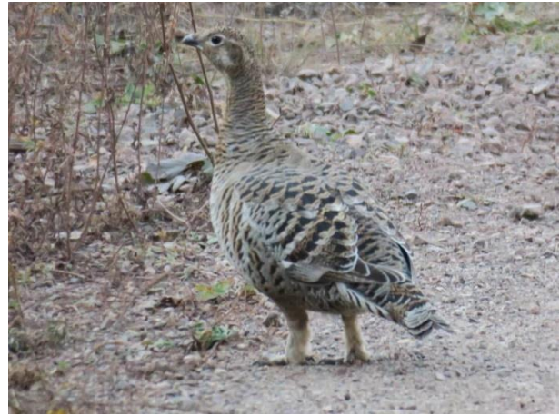
Black grouse female

During the night safari we encountered four Siberian roe deer. They often stopped to observe us after run for a short distance, offering good photographic opportunities. We saw a racoon dog on the road side outside the park while driving to Jingpeng. There are also hotels near Huanggangliang.