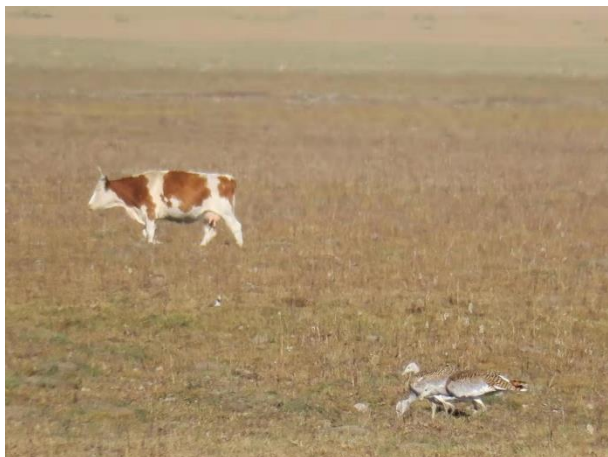
Bustards and cattle

The main roads in Dalinuoer is hard surface and easy to drive. Most animals we saw were cattle, sheep, horses and camels. Suddenly we saw an Asian badger going to cross the road while driving. We stopped the car immediately but the badger was still frightened and ran hundreds of meters away without stop. We had not expected the Asian badger could live in such an open area and be so active at 10:30 am.