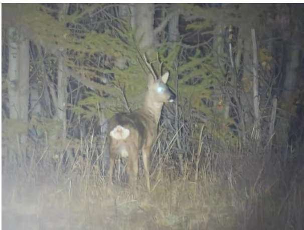
Siberian roe deer

During the night safari we encountered four Siberian roe deer. They often stopped to observe us after run for a short distance, offering good photographic opportunities. We saw a racoon dog on the road side outside the park while driving to Jingpeng. There are also hotels near Huanggangliang.