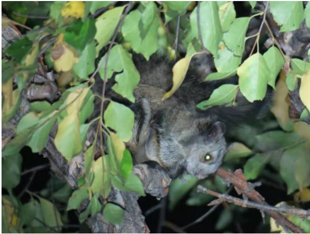
Northern China flying squirrel