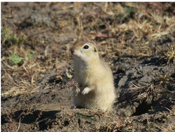
Daurian ground squirrel

In the morning we drove from Dalainuori to Huanggangliang, it took 2.5 hours and passed Baiyin Obo, so actually the schedule can be optimized. There were broad pastures on both sides of the road. We saw some Daurian ground squirrels on the pasture. They had been said to be in in great numbers, but we didn't see many. A steppe eagle far away was seen resting on the fence.