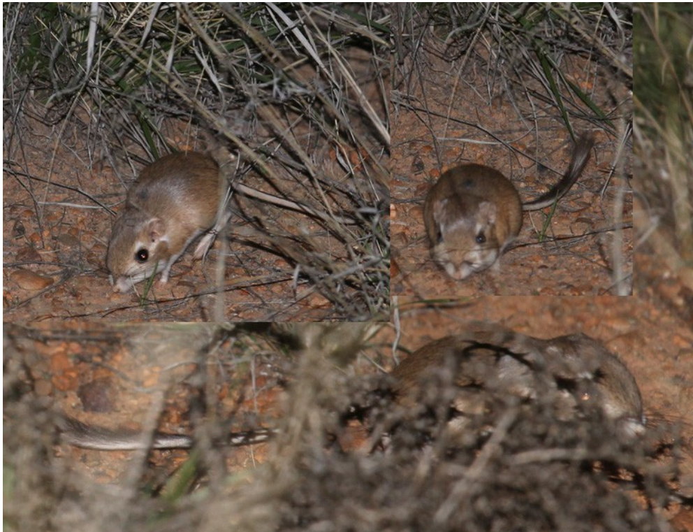
6: Ord's or Merriam's Kangaroo Rat, Buenos Aires NWR, AZ, USA - probably unIDable?