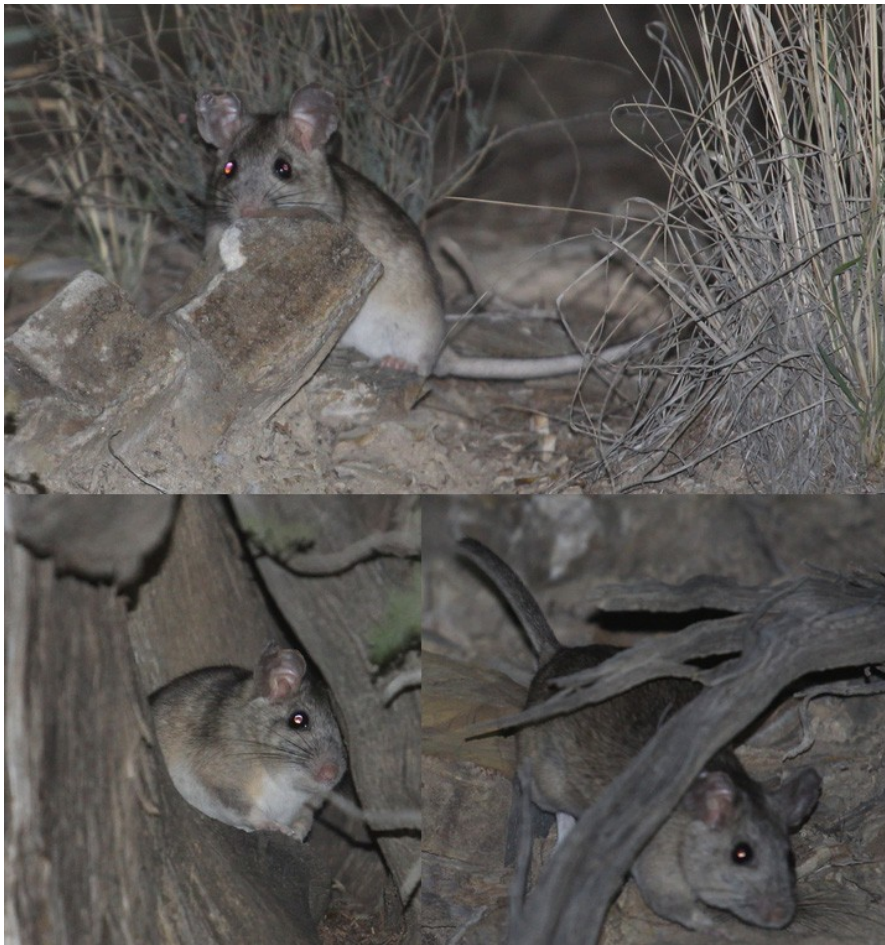
7: White-throated or Mexican Woodrat? Chiricahuas, AZ, USA