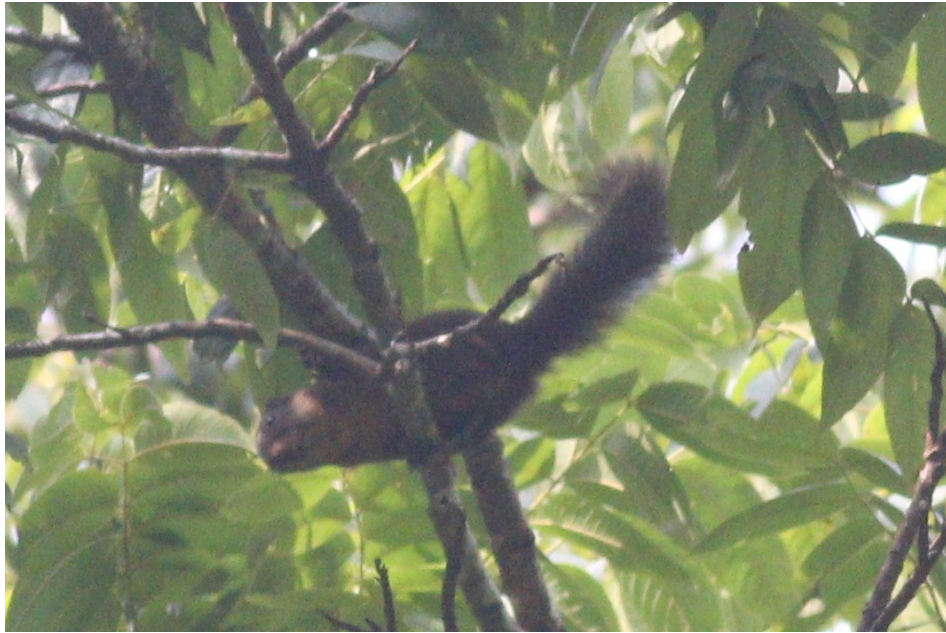
24 – A squirrel from PN Yanachaga Chemillen in Oxapampa, Peru. This area is quite interestingly underexplored and I found a lot of “maybes” as to which animals occur there.