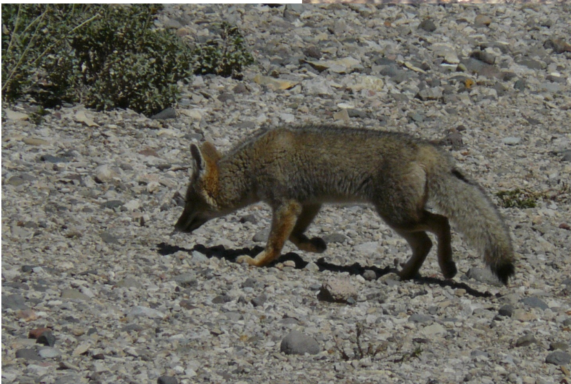
13-14: Ushuaia, Tierra del Fuego, 15: Malargue, Mendoza. In both cases Andean fox and SA Gray possible