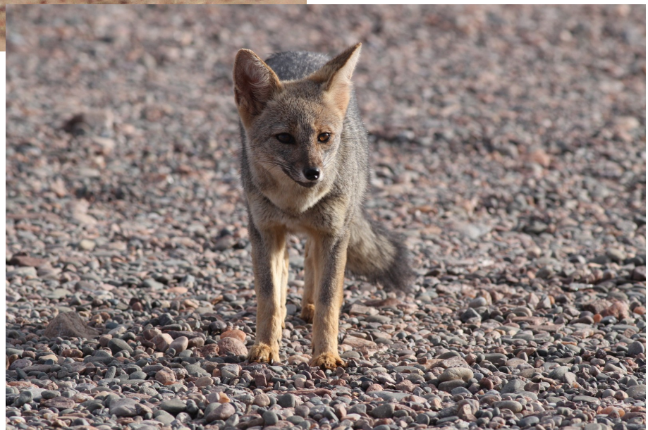
11-12: Moving on to South America (Argentina, specifically) and "foxes" - the variability makes it a killer problem and everywhere there are at least two species in range. In this case, Pampas Fox and South American Gray Fox are possible. 11 - Near Salinas Grandes, NW of Cordoba , 12 - Sierra de las Quijadas, San Luis