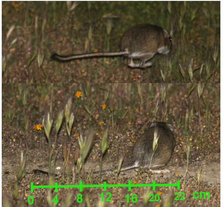
1-4: Kanagaroo Rats from Carrizo Plain, CA, USA - Giant, Heermann's and San Joaquin occur there too. Where scales exist (obtained by putting another object in the same place and then stitching the photos together to match) they seem to rule out San Joaquin (should be smaller), but the other two have almost complete overlap.