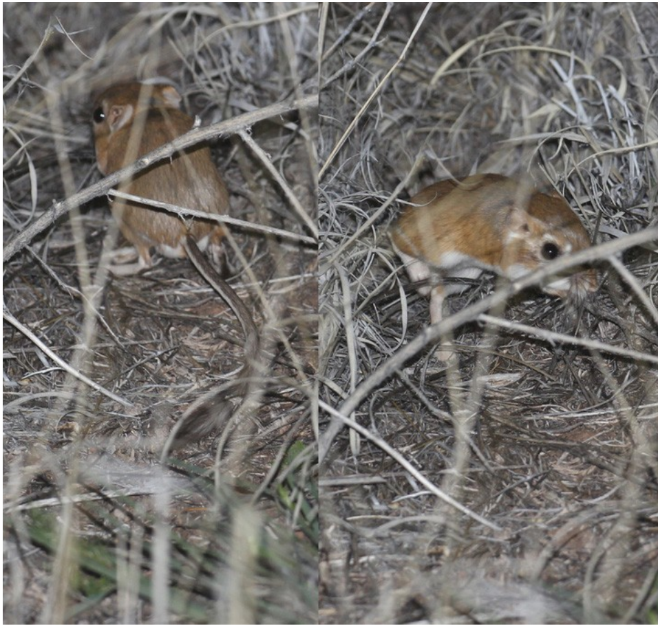
5: Ord's Kangaroo Rat? Canyonlands, UT, USA