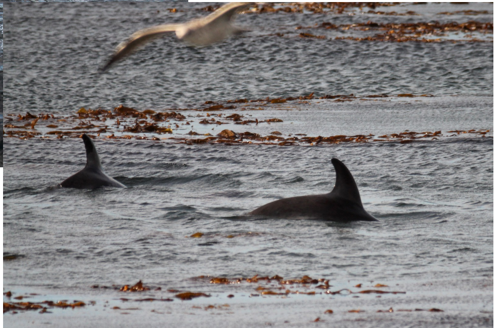
25-26: not the best pictures of dolphins from the Magellan Strait across from Punta Arenas